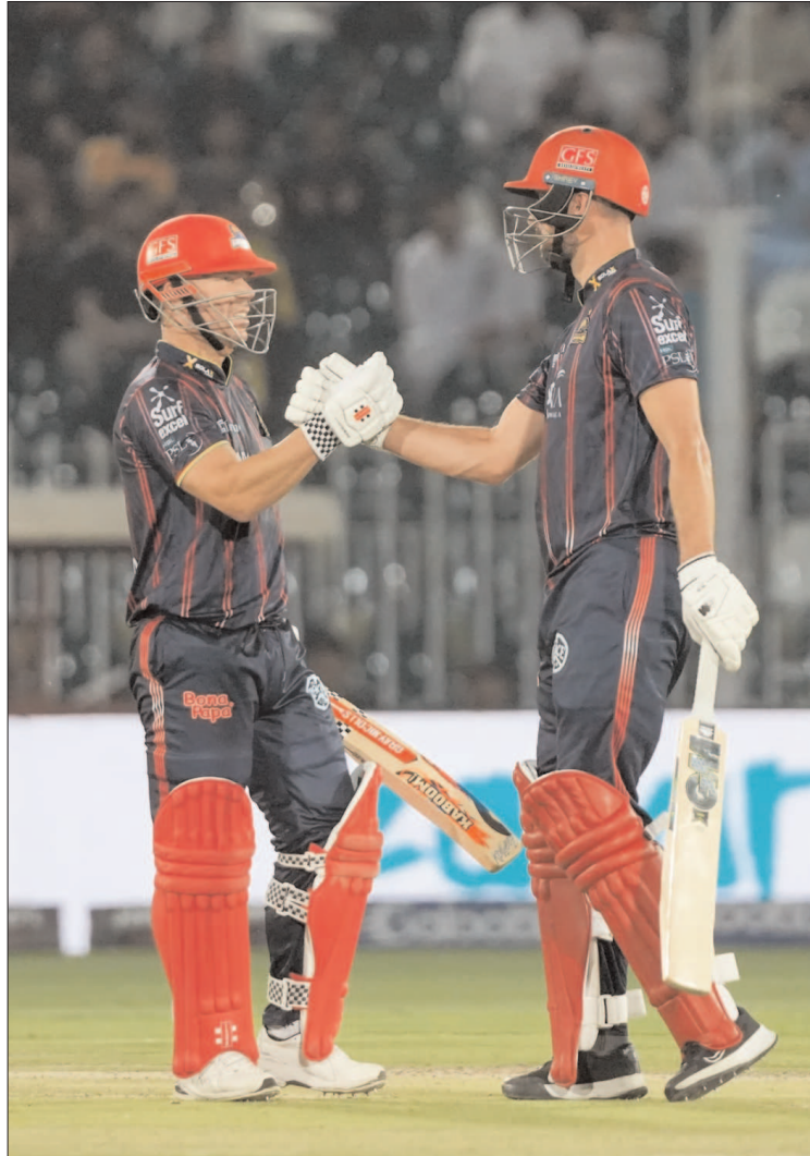
David Warner and James Vince added 162 for the second wicket.

Zalmi soldiered on bravely, producing 28 in the final two overs, but the Kings had secured victory, and a ticket to the playoffs in Lahore. Zalmi, meanwhile, go into a virtual knockout against Lahore Qalandars on Sunday night. —spnrcinfo