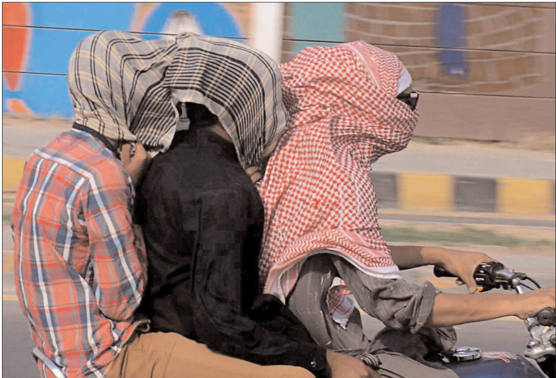
LAHORE: Motorcyclists on the way covered himself with cloth piece to protect from sun heat during hot weather in provencial capital.