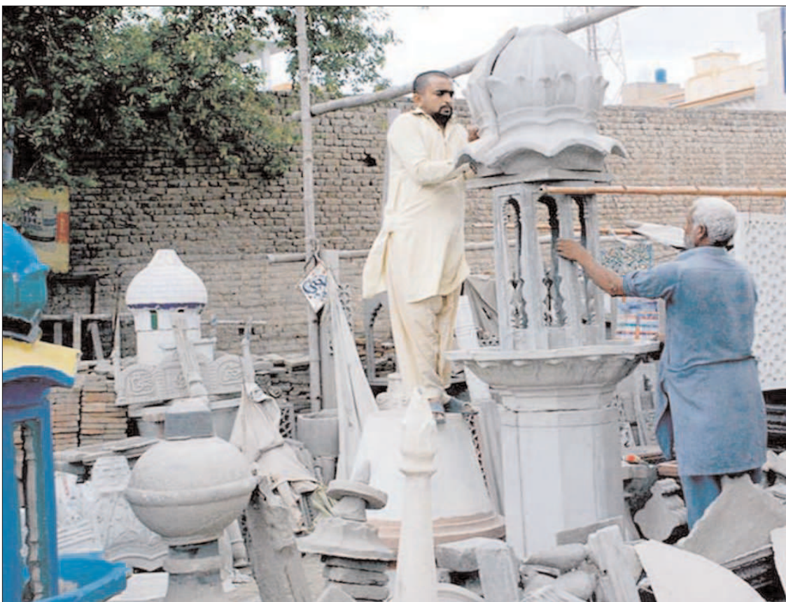
BAHAWALPUR: An artist working on crafting a mosque minaret at a local factory.