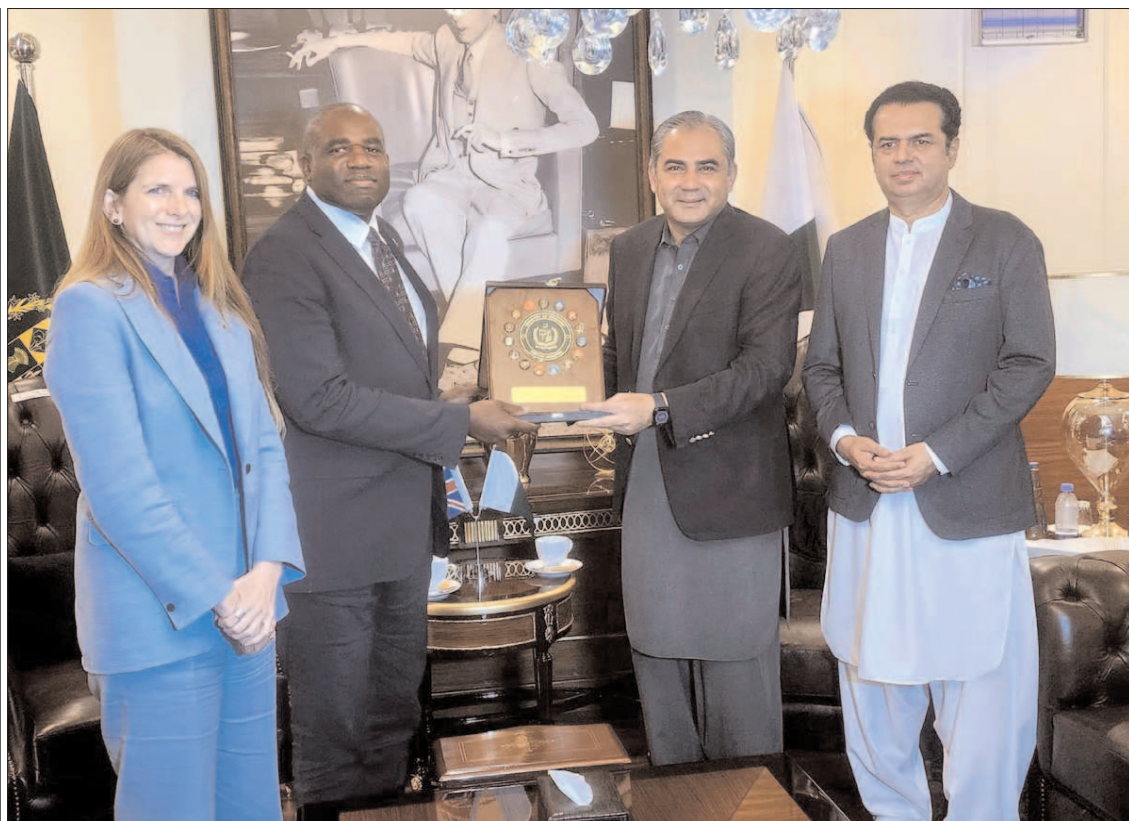
ISLAMABAD: Federal Minister for Interior Mohsin Naqvi presenting a souvenir to the Foreign Secretary of the United Kingdom Rt. Hon. David Lammy.

"This partnership will not only bring capable individuals to CDA but also contribute to national development," he added. NUST officials assured full adherence to merit-based principles, stating their modern examination system would ensure only the most qualified candidates are selected.