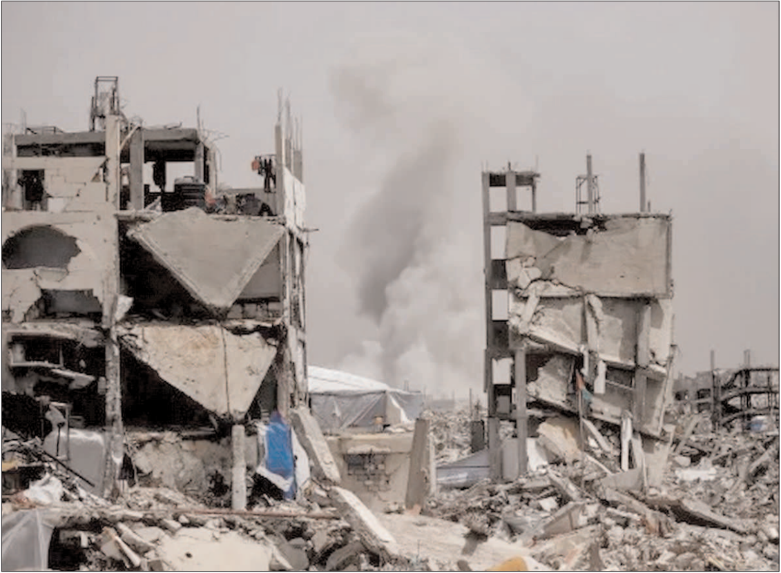
GAZA STRIP: Smoke rising following Israeli strikes, in Jabalia.