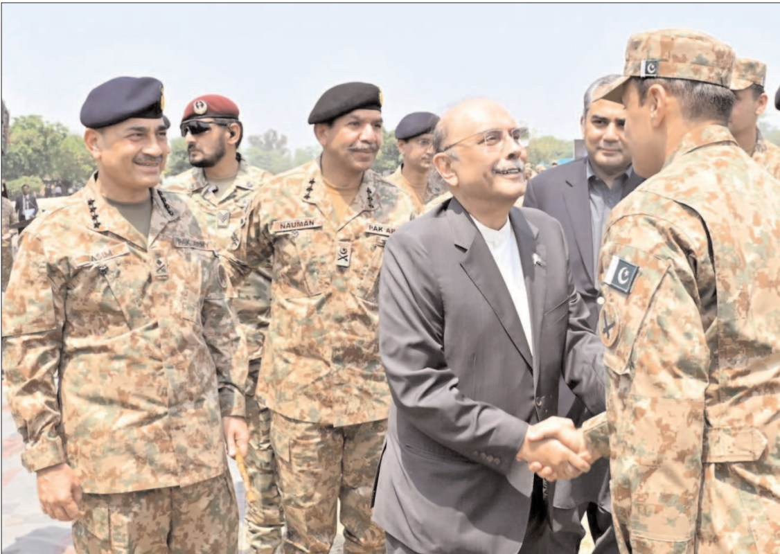
RAWALPINDI: President Asif Ali Zardari shaking hands with jawans during his visit to Gujranwala Cantonment.