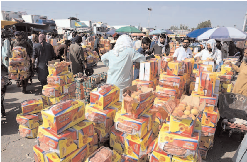
ISLAMABAD: People purchasing fruits displayed by vendors at market.

Huang also said that previous AI export regulations were wrong and should have been focused on maximising US technology globally. Trump has said he will cancel the AI diffusion rules that were introduced by the Biden administration.