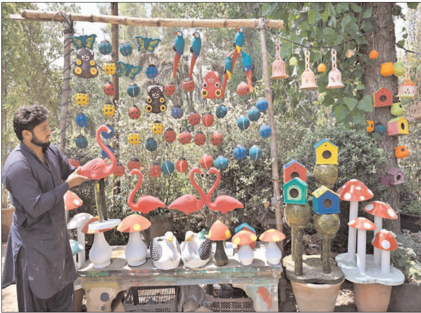
ISLAMABAD: A vendor displays crafted artificial bird nests for garden décor to attract customers at H-9 Nursery.

DIG Tariq stated that Islamabad Police is a highly professional and hardworking force that will continue to serve the public with the same dedication and resolve.