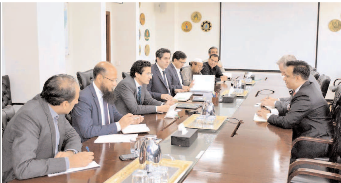
ISLAMABAD: Deloitte Advisory US delegation meeting Federal Minister for Petroleum Ali Pervaiz Malik to discuss energy sector collaboration.

The meeting concluded with a mutual commitment to strengthening public-private cooperation for enhancing the country's tobacco export potential and creating a more enabling environment for industry stakeholders.