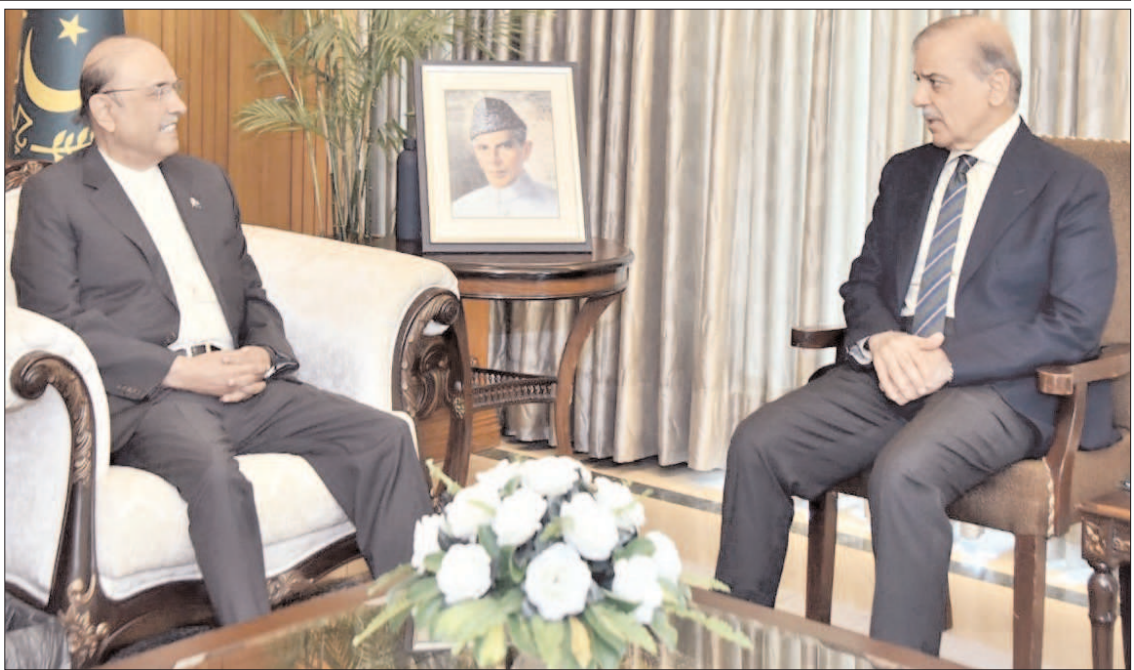
ISLAMABAD: Prime Minister Shehbaz Sharif called on President Asif Ali Zardari, at Aiwan-e-Sadr.