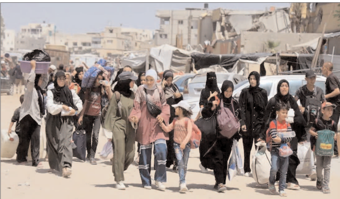
GAZA: Palestinians flee with their belongings after Israeli military issued displacement orders for eastern Khan Younis.