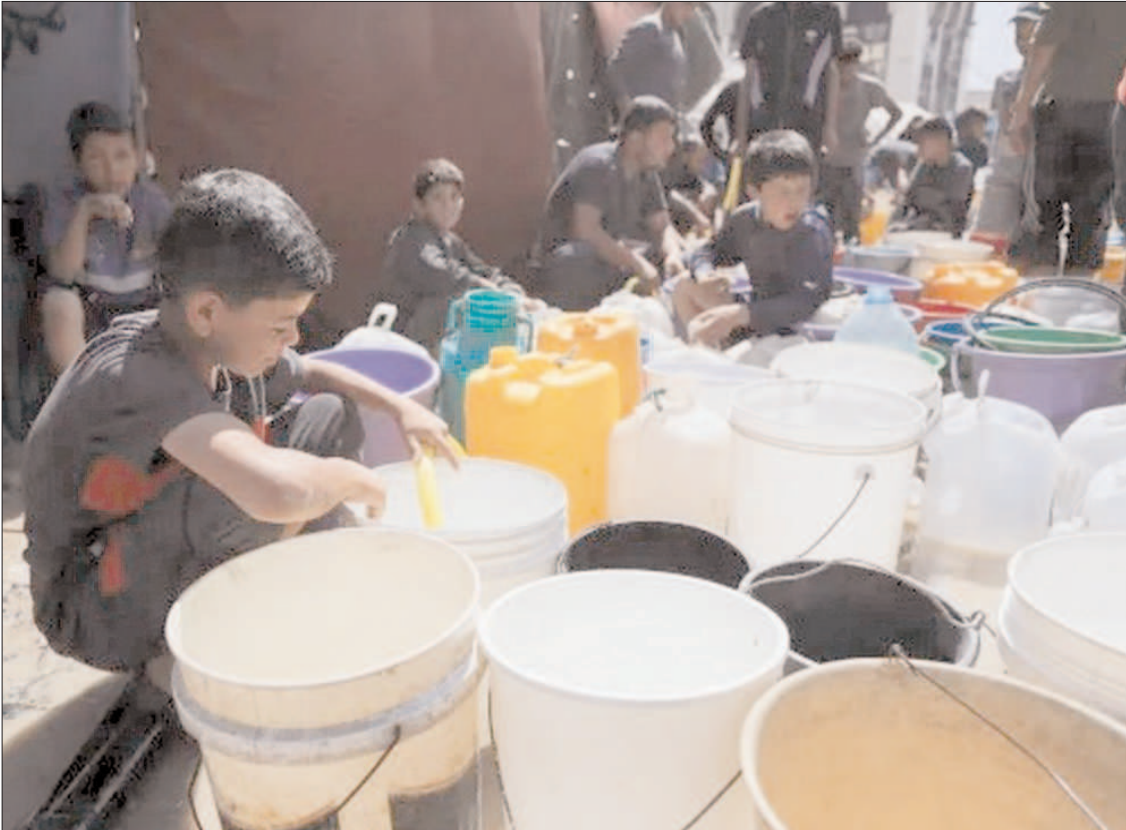
GAZA CITY: Palestinian children filling water containers at a tent camp.