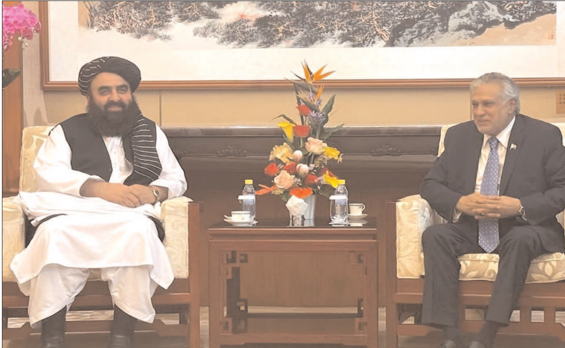
BEIJING: Deputy Prime Minister and Foreign Minister Senator Mohammad Ishaq Dar meeting with Acting Foreign Minister of Afghanistan Amir Khan Muttaqi in Beijing.