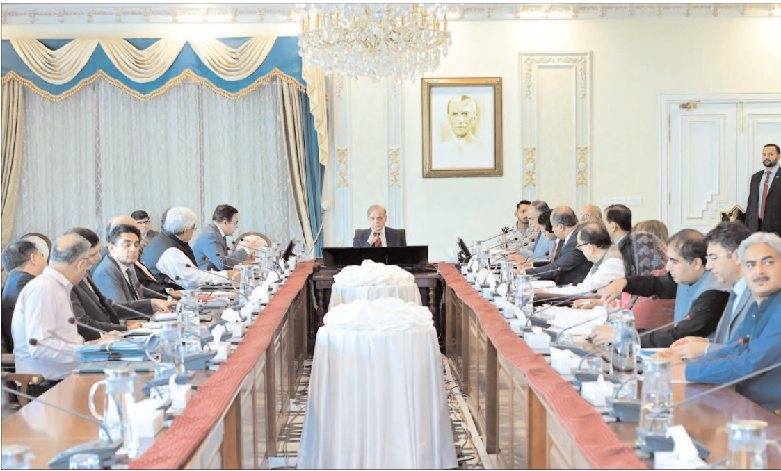
ISLAMABAD: Prime Minister Muhammad Shehbaz Sharif chairing a review meeting of the Task Force on housing sector development for low-cost housing projects.

Chairman Bilawal pointed out that this is not merely a bilateral issue. The international community and global media have acknowledged Pakistan's responsible conduct. "We are on the side of truth and peace, while India continues to spread propaganda rooted in hate and division," he said.