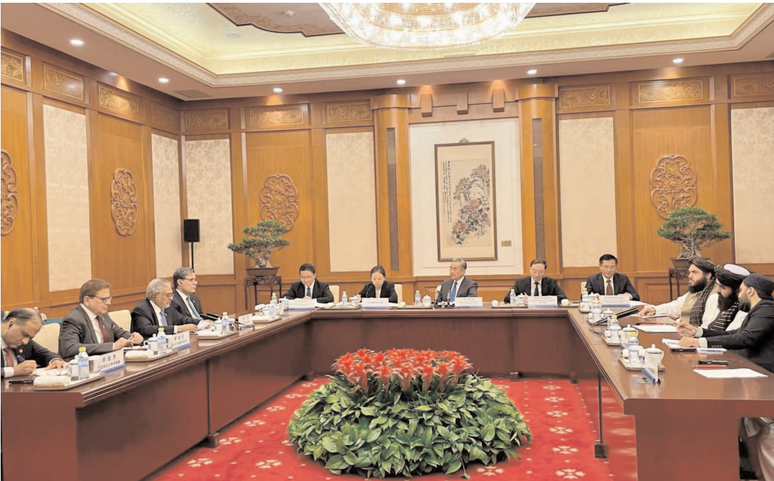
BEIJING: Deputy Prime Minister and Foreign Minister Senator Mohammad Ishaq Dar, member of CPC Political Bureau and Foreign Minister of the People’s Republic of China, Wang Yi and Acting Foreign Minister of Afghanistan, Amir Khan Muttaqi held an informal trilateral meeting