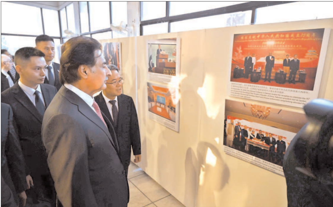
ISLAMABAD: Speaker of the National Assembly of Pakistan Sardar Ayaz Sadiq and Chinese Ambassador to Pakistan, Jiang Zaidong visiting the Photo Exhibition and Hanfu try-on tea break during the event "Celebrating the 74th Anniversary of the Establishment of Diplomatic Relations between Pakistan and China."

RAWALPINDI (APP): The Anti-Narcotics Force (ANF), conducting nine operations across the country, recovered as many as 2294.81 kilograms of drugs worth more than Rs 434.4 million and arrested six suspects, including a woman, said an ANF Headquarters spokesman on Wednesday. He informed that 4.5 kg of ice was recovered from the luggage of a passenger visiting Doha at Islamabad International Airport. In another operation, 40 grams of MDMA powder were recovered from a parcel sent from Holland at a courier office in Chaklala Garrison, Rawalpindi. Similarly, 470 grams of ice was recovered from two parcels sent to Australia at a courier office in Harbanspura, Lahore. As much as 2.4 kg of hashish was recovered from the possession of an accused near Gojra Bus Station Toba Tek Singh. On a tip-off, two suspects, including a woman riding a rickshaw, were arrested near Chan Da Qila, Gujranwala and 2.4 kg of opium and 15 kg of hashish were recovered on the information of the arrested accused during a search of the house located in Wapda Town, Gujranwala. As many as 300 kg of opium hidden for smuggling were recovered near Hazarganji, Quetta.