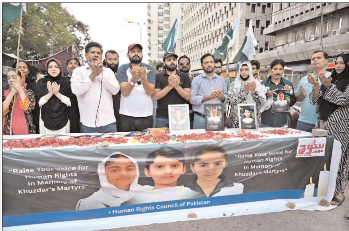
KARACHI: Human Rights Council of Pakistan offering Dua for the soul of the martyred children during protest against the terrorist attack in Khuzdar at Karachi Press Club.