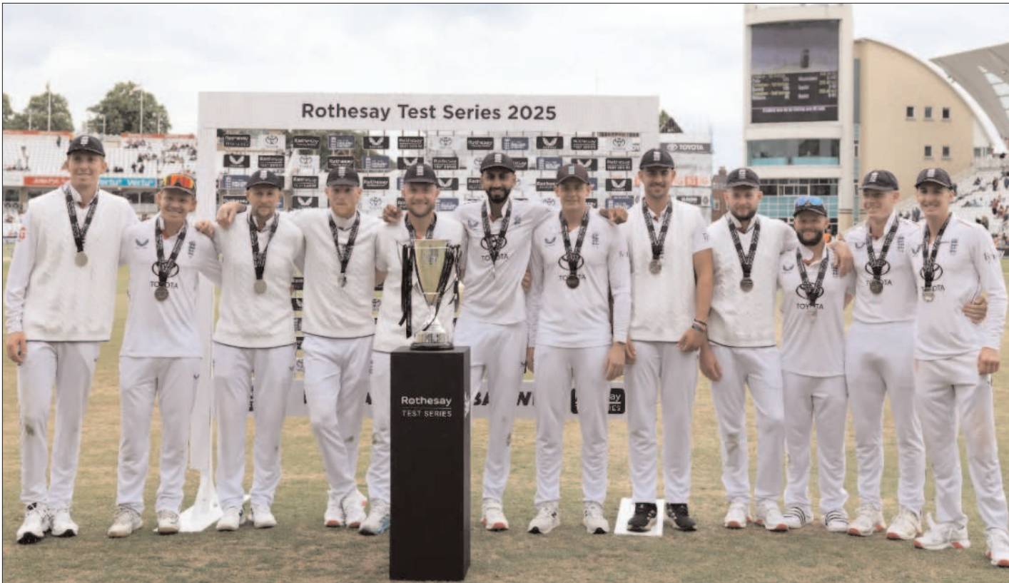
TRENT BRIDGE: England pose with the series trophy after their innings win over Zimbabwe.

LAHORE (APP): The Pakistan Cricket Board (PCB) on Saturday announced ticket prices ranging between 200 and 2000 rupees for the three-match T20I series between Pakistan and Bangladesh to be played at the Gaddafi Stadium in Lahore from 28 May to 1 June. Three T20Is will be played on 28, 30 May and 1 June, with the first ball set to be bowled at 8pm PST. Tickets will be available to fans from 25 May onwards at TCS Express Centres only. In the first phase, tickets will be available tomorrow at TCS Express centres located at Davis Road and Gulberg, Lahore. To encourage fans to come to the ground, affordable prices have been set for the matches. The general enclosures (Hanif Mohammad, Imtiaz Ahmed, Inzamam-ul-Haq and Saeed Ahmed) at the Gaddafi Stadium will be available to fans at PKR 200. The first-class enclosures (Abdul Hafeez Kardar, Abdul Qadir, Javed Miandad and Sarfaraz Nawaz) will be available at PKR 300, while the premium enclosures (Rajas and Saeed Anwar) will be available to fans at PKR 400. The VIP enclosures (Fazal Mahmood and Imran Khan) will be available to fans at PKR 500.