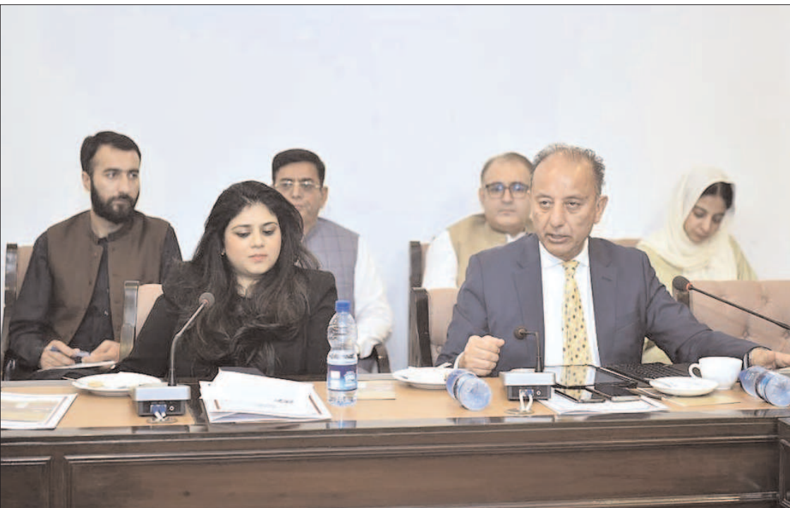
ISLAMABAD: Federal Minister for Climate Change and Environmental Coordination, Dr. Musadik Malik, participated in a panel session titled "Dialogue, Not Discord: Conflict Resolution, Diplomacy, and the Rule of Law in U.S.-Pakistan Relations".

He stressed action against drug dealers and criminal elements during search operations. Organized gangs of begging should be dealt strictly, he added. "Ensure the conviction of accused in drug cases," he instructed investigation officers, urging them to strengthen their cases with solid evidence. The CPO also warned officers to stay alert against any connections or support to drug dealers within the department, making it clear that strict action would be taken against any officer found involved in illegal activity.