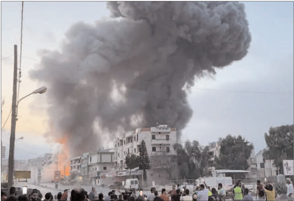
BEIRUT: People gathered as smoke billows near buildings following an Israeli strike in southern Lebanese town of Toul.