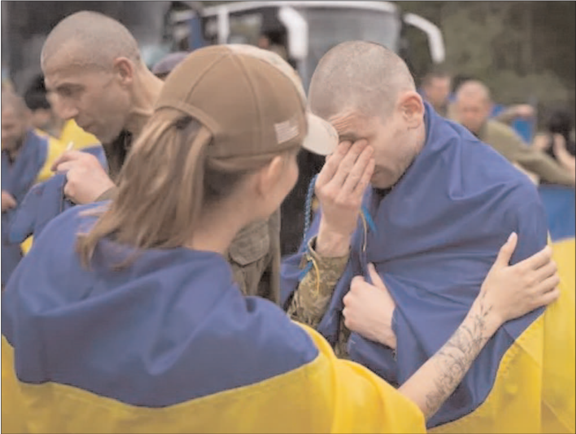
KYIV: Ukrainian servicemen welcomed back after being exchanged for Russian soldiers.