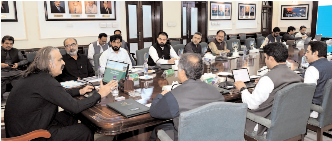
PESHAWAR: Chief Minister Khyber Pakhtunkhwa Ali Amin Khan Gandapur chairing a consultative meeting regarding upcoming Annual Development Program of D.I.Khan Division.