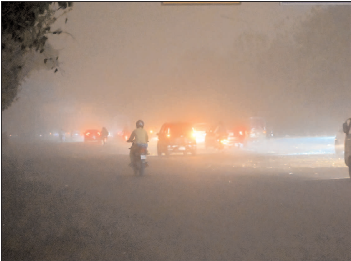
LAHORE: A view of dense dust storm before rain that engulf the city.