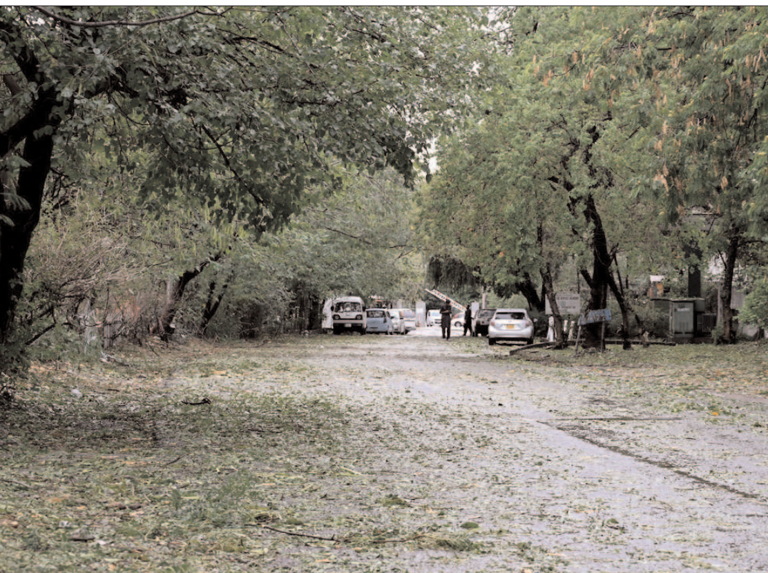
ISLAMABAD: A view of fallen fresh tree leaves on the ground after a strong hit of dust storm and heavy rain that experienced in the twin cities.

This substantial disbursement highlights NAB's commitment not only to holding offenders accountable but also to ensuring swift restitution for the victims of financial fraud. NAB remains resolute in its mission to recover looted public funds and advance its vision of a corruption-free Pakistan.