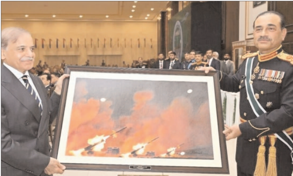
RAWALPINDI: Prime Minister Shehbaz Sharif and Field Marshal Syed Asim Munir during a dinner.