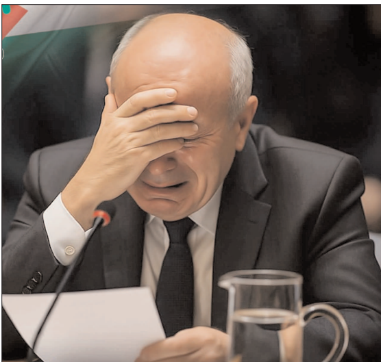
NEW YORK: Palestinian Ambassador weeping, during speech at UN Security Council on killing of children at Gaza.