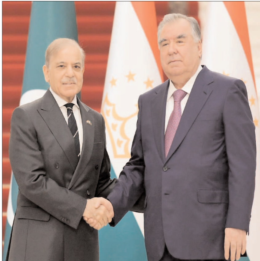
DUSHANBE: President of Tajikistan, Emomali Rahmon shaking hands with Prime Minister Shehbaz Sharif upon arrival at Palace of Nation.