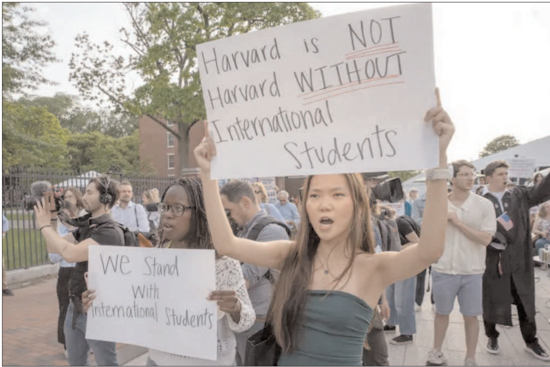
WASHINGTON: People hold up signs during the Harvard Students for Freedom rally in support of international students at Harvard.

Local authorities in Shandong met for a briefing on the blast and to discuss safety concerns, provincial media said. The meeting focused on high-risk industries such as chemicals and coal. The State Council, China's cabinet, said it would directly supervise the investigation, state broadcaster CCTV reported, as it does with major incidents. Set up in August 2019 in the Gaomi Renhe chemical park, the Shandong Youdao Chemical plant develops and makes chemicals used in pesticides and pharmaceuticals, the company said on its website, with more than 300 employees at the site. Blasts in recent years at chemical plants in China have included one in the northwest region of Ningxia in 2024 and another in the southeastern province of Jiangxi in 2023. In 2015, two massive explosions at warehouses of hazardous and flammable chemicals in the port city of Tianjin that killed more than 170 people and injured 700 prompted tougher laws on storage of chemicals.