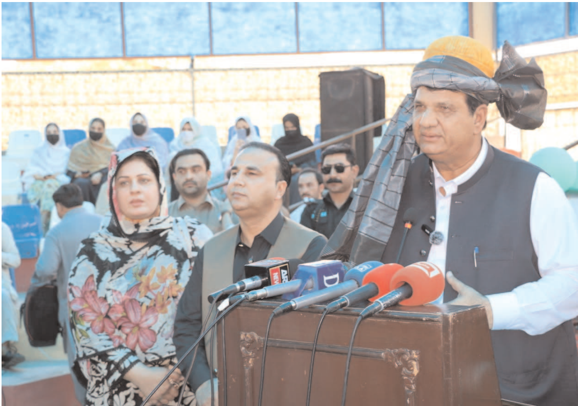
PESHAWAR: Federal Minister for Kashmir Affairs, Gilgit Baltistan and SAFRON Engr Amir Muqam addressing the participants of the women boxing trials.