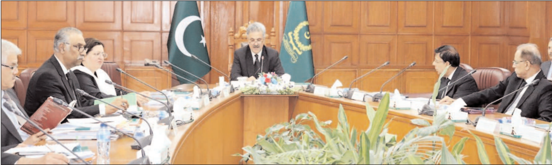
ISLAMABAD: Chief Justice of Pakistan, Justice Yahya Afridi presiding over 44th meeting of Law and Justice Commission.

The delegation also presented proposals to leverage the capabilities of the youth for the country’s progression. President Zardari stressed the significance of unity among all federal units, fostering cooperative relations with the provinces, and prioritizing the welfare of citizens in alignment with national interests.