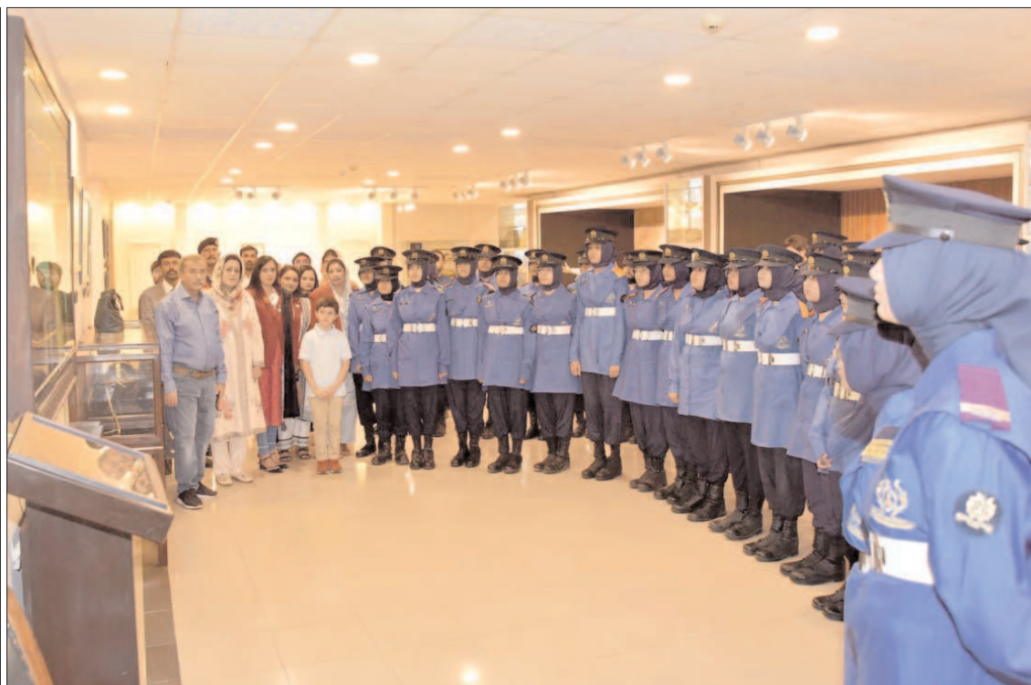
ISLAMABAD: A delegation of the Youth Leadership Camp conducting by Association for Academic Quality (AFAQ), visits the Senate Museum at Parliament House.

Cattle markets must only be set up at designated spots, and officers will visit marketplaces to ensure compliance, IG Rizvi emphasized. Strict measures will also be taken against professional beggars during the holidays, and all officers have been directed to carry out visits and enforcement, IG Rizvi added. Search and sweep operations across the city will be intensified to prevent any untoward incidents, IG Rizvi said.