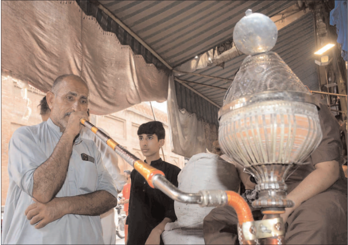
LAHORE: A man talking puff of Hukkah while sitting on tea stall on the eve of World No Tobacco Day is observed around the world every year on 31 May.