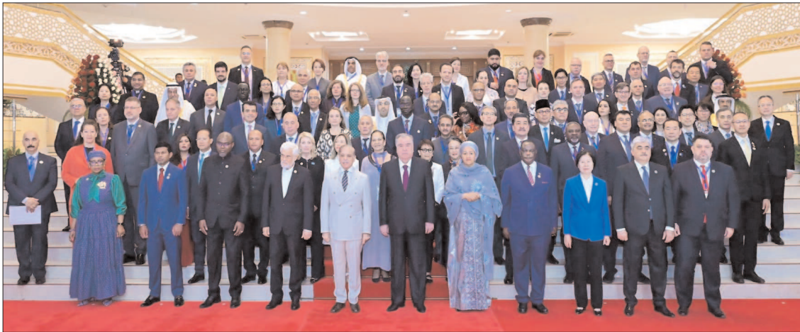
DUSHANBE: Prime Minister Shehbaz Sharif in a family photo with world leaders at high level international conference on glaciers' preservation (IGCP 2025) in Tajikistan.