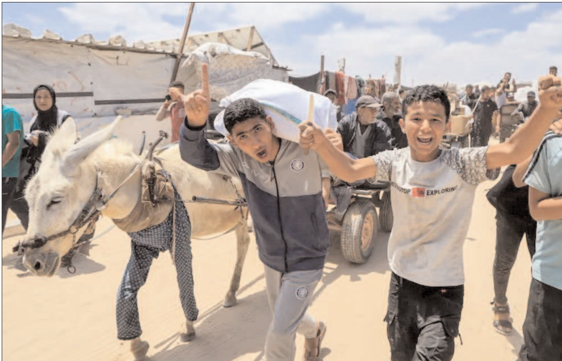
GAZA STRIP: Palestinians carrying aid supplies they received from US-backed Gaza Humanitarian Foundation, in Khan Younis.