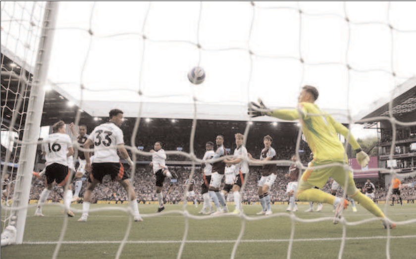
Aston Villa's Youri Tielemans scores their first goal past Fulham's Bernd Leno during their Premier League match.

Vardy cheekily blew the referee's whistle while he was being treated. Leicester finally won for the first time since January as Ayew grabbed the second goal in the 44th minute. Southampton have