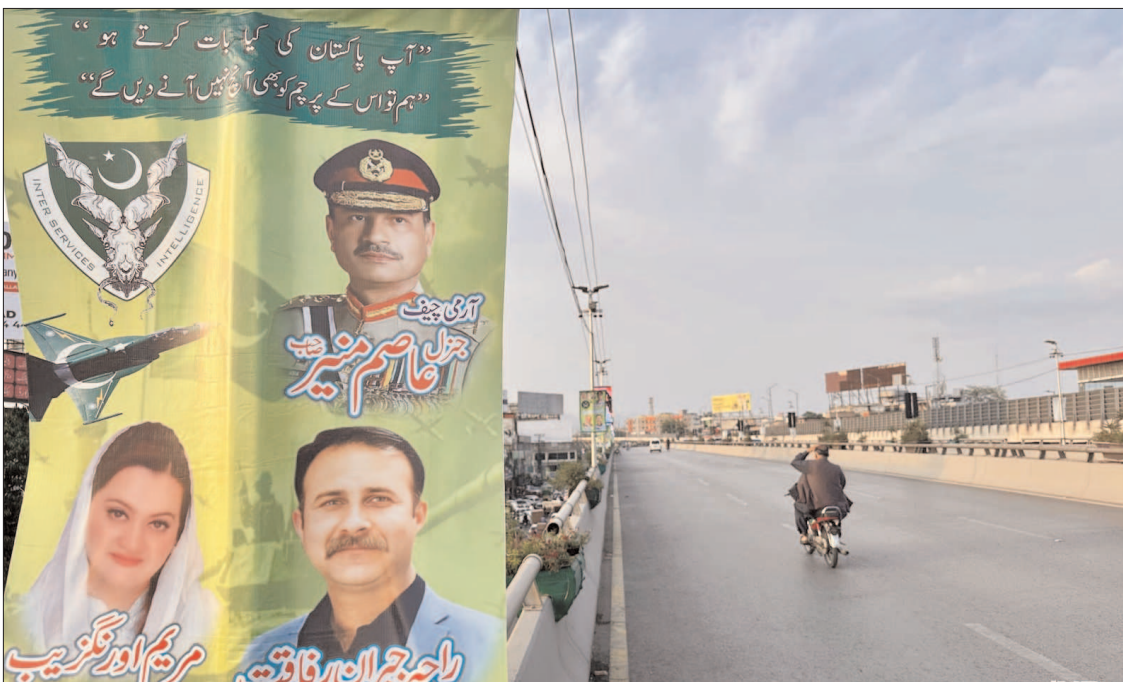
RAWALPINDI: A view of banners install on Muree road street light pole in favour of Pak Army.

RAWALPINDI (APP): Police have arrested seven liquor suppliers and recovered 40 liters of liquor from their possession during crackdown here Saturday. According to police spokesman, Bani police recovered have held four liquor suppliers, Imran, Hamza, Asif and Muhammad Asif and recovered 25 liquor from their possession.