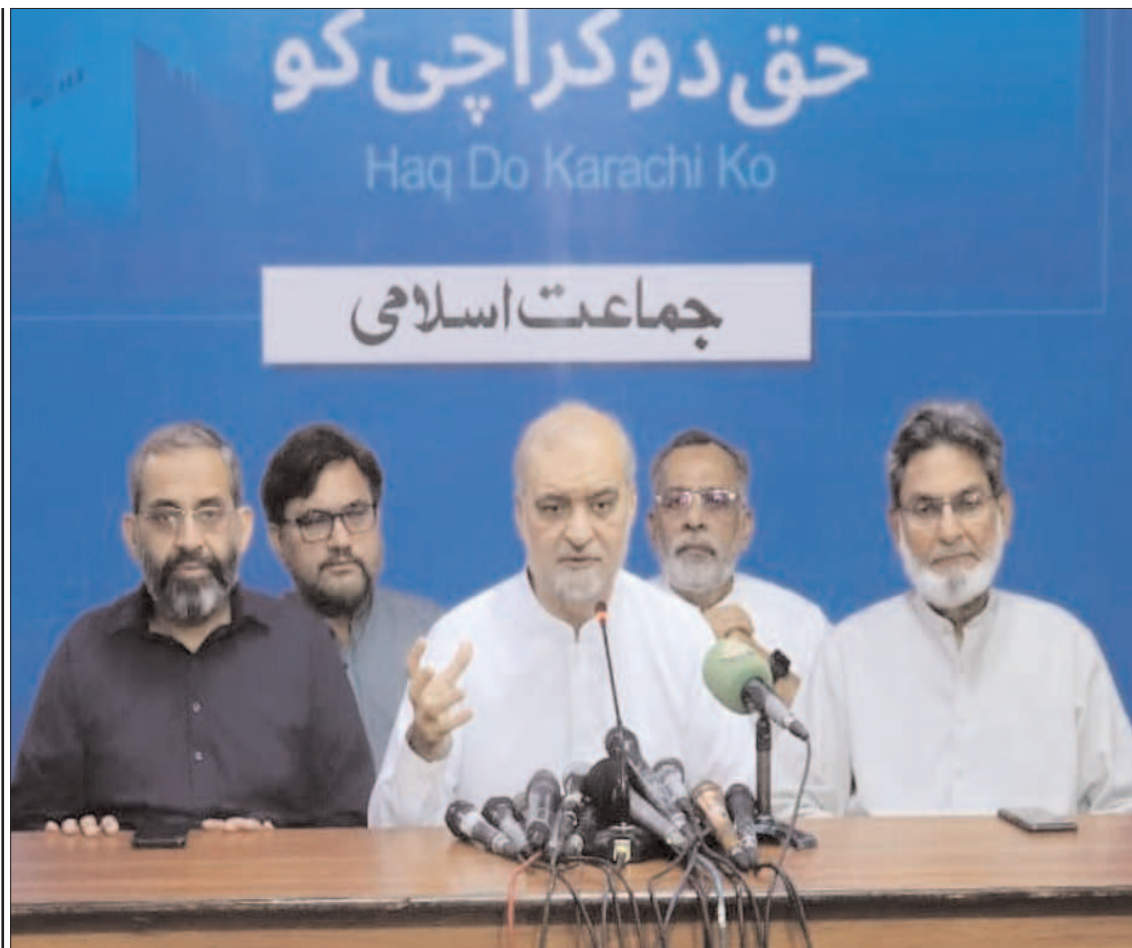
KARACHI: Ameer Jamaat-e-Islami Hafiz Naeem ur Rehman addressing a press conferences.