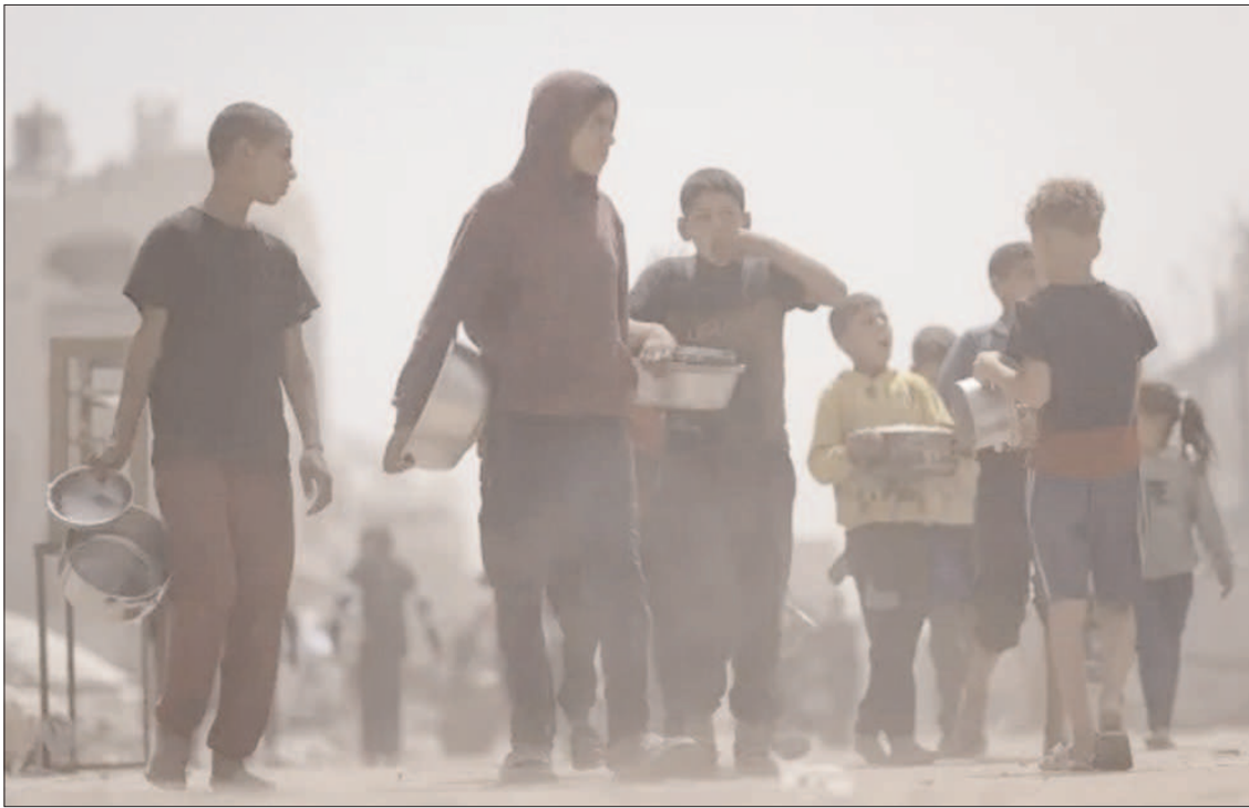
GAZA CITY: Palestinians, struggling to survive under difficult conditions, carrying pots to collect food at a charity kitchen.