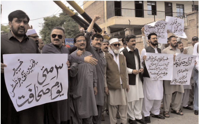
PESHAWAR: Activists of Khyber Union of Journalists hold protest on occasion of World Press Freedom Day.