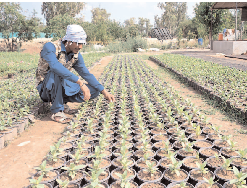
ISLAMABAD: A worker busy planting saplings at a local nursery near H-9 in the Federal Capital.

The high-level meeting was attended by the Federal Secretary for Communications, Chairman NHA and other senior officers who briefed the Federal Minister on ongoing and proposed projects especially of West Sector while importance decisions were also approved in this session.