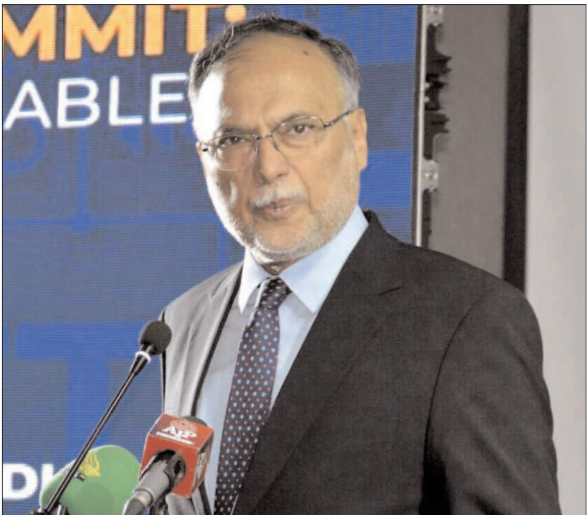
LAHORE: Minister for Planning and Development, Ahsan Iqbal speaking at the 10th UMT Budget Summit.