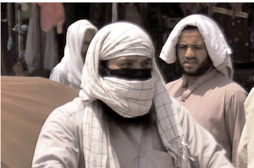
PESHAWAR: Peoples covered their head with piece of cloth to protect from sun heat.