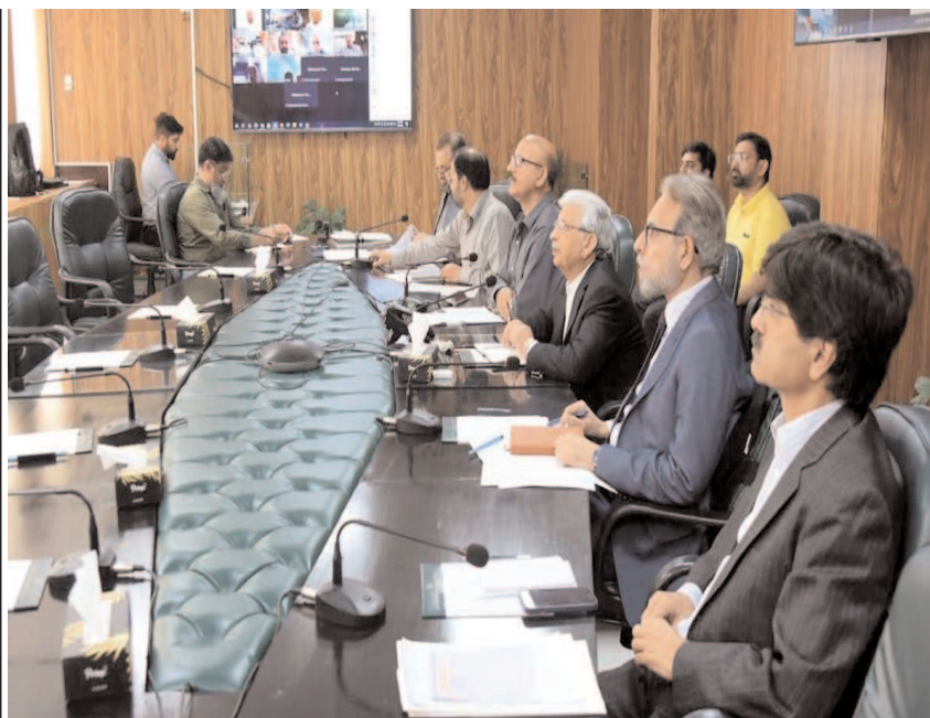
ISLAMABAD: Federal Minister for National Food Security & Research Rana Tanveer Hussain chairing high-level meeting on certified seed availability.

The visit of the US-Pakistan Business Council delegation from May 5-7, serves as a valuable platform for dialogue, partnership-building, and opportunity creation.