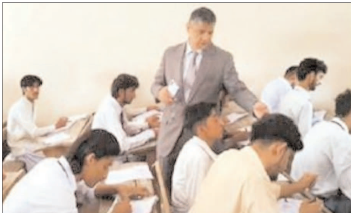
LARKANA: Students solving paper during annual examinations for classes 11th and 12th.