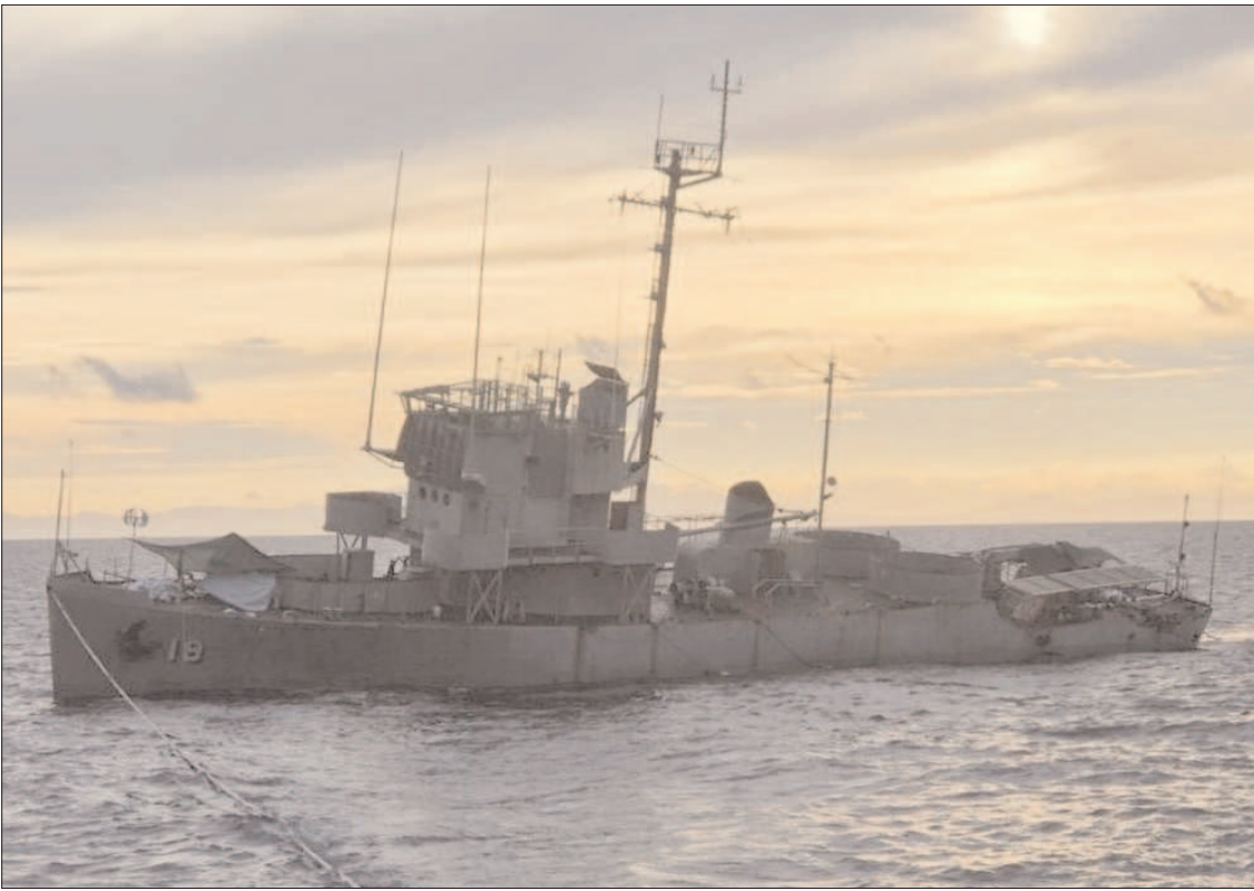
MANILA: Decommissioned Philippine Navy BRP Miguel Malvar (PS-19) takes on water before sinking while being positioned as vessel target prompting the cancellation of a live-fire drill as part of a joint US-Philippines military exercises called Balikatan or "shoulder to shoulder" approximately 30 nautical miles west of San Antonio, Zambales, Philippines.