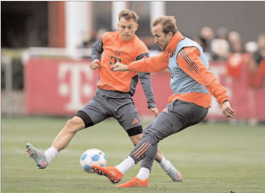
MUNICH: Harry Kane of Bayern Muenchen vies with Joshua Kimmich of Bayern Muenchen during a training session at on May 06, 2025 in Munich, Germany.

Buenos Aires (AFP): Luis Galvan, who played in every match in Argentina's 1978 World Cup winning campaign, died on Monday aged 77, the Argentinian Football Association (AFA) announced. Galvan had been in hospital in Cordoba for several weeks with kidney problems. Galvan formed a rock hard central defensive partnership with captain Daniel Passarella that laid the foundations for the Argentina side that lifted the World Cup trophy for the first time. Two goals from the tournament's leading scorer Mario Kempes and one from Daniel Bertoni saw off the Netherlands 3-1 after extra-time in Buenos Aires. "The Argentine Football Association, through its President, Claudio Tapia, mourns the passing of Luis Galvan, a defender who won a World Cup with the Argentine national team in 1978, and expresses its condolences to his family and loved ones," read an AFA statement. Galvan, who played the majority of his club career for Talleres de Cordoba, making over 250 appearances for them, also played at the 1982 finals. Like many of the 1978 side, age had caught up with him in the 1982 title defence -- Diego Maradona about the only new face in the line-up -- his 34-year-old legs unable to cope with second round opponents Brazil and Italy, who beat the champions 3-1 and 2-1 respectively.