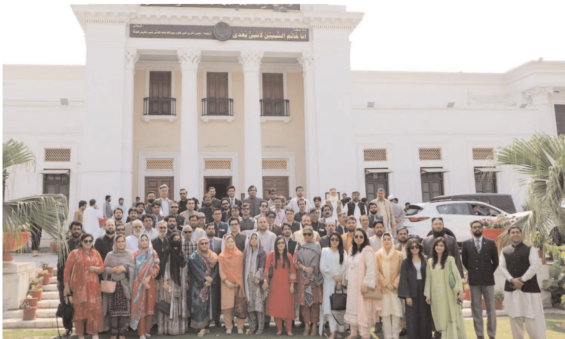
PESHAWAR: Participants of the Balochistan National Workshop in a group photo with the Speaker Khyber Pakhtunkhwa Assembly and Members of Provincial Assembly.

The forum was also briefed on the livelihood and economic potential of various regions. The Chief Secretary stressed the need for rapid economic development, particularly in the Merged Districts, to ensure that people experience the tangible benefits of government efforts. "Our goal is to create opportunities and bring about a visible improvement in people's lives. Effective governance must reflect in the economic uplift of our citizens," he said.