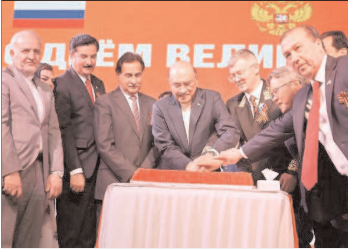
ISLAMABAD: President Asif Ali Zardari cutting cake to commemorate 80th anniversary of victory of Great Patriotic War of Russian Federation at Russian Embassy.

Gaza has been under total Israeli blockade since March 2 and faces a severe humanitarian crisis. Israel’s military resumed its offensive on the Gaza Strip on March 18, ending a two-month truce. French Foreign Minister Jean-Noel Barrot in a radio interview on Tuesday called Israel’s plan for a Gaza offensive “unacceptable”, and said its government was “in violation of humanitarian law”.