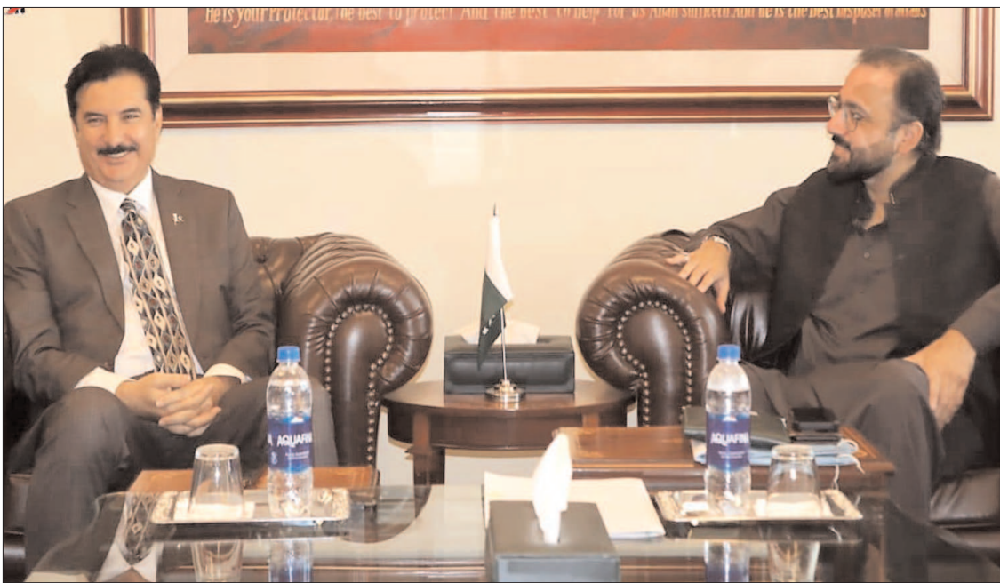
ISLAMABAD: Federal Minister for overseas Pakistani and Human Resource Development Chaudhry Salik Hussain meet with Khyber Pakhtunkhwa Governor Faisal Karim Kundi.