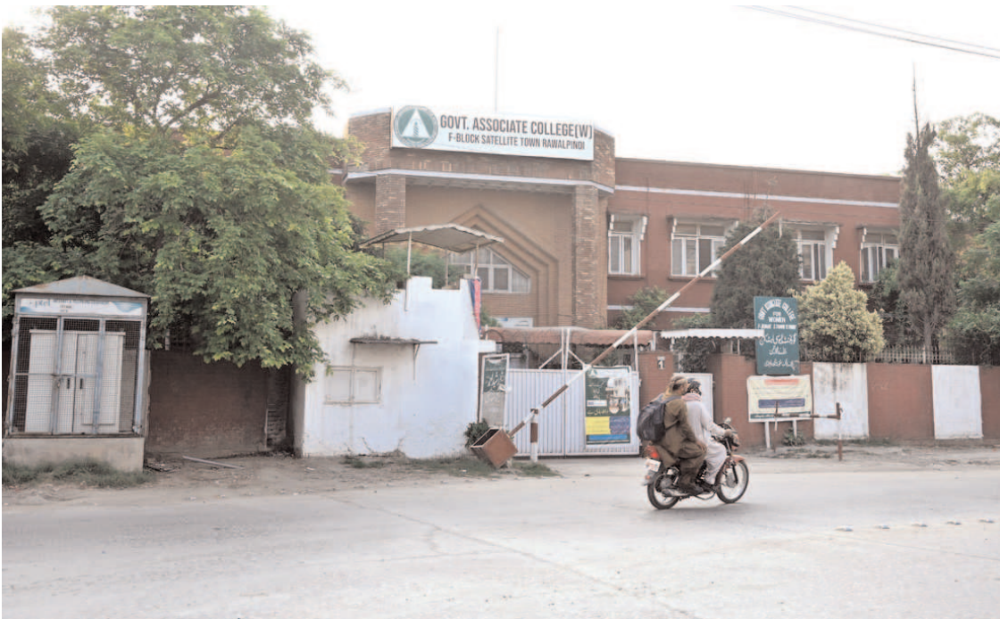
RAWALPINDI: A view of Government Associate College for Women, closed after the government announced the closure of all educational institutions due to the current situation.

Officials said the cooperation of the public is vital to ensure that food businesses maintain safe and clean operations. Complaints can be submitted to the district administration through helplines or official online platforms.