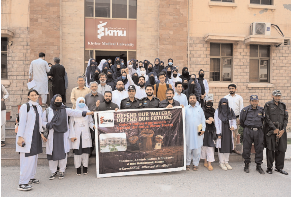
PESHAWAR: Officials, staff and students of Khyber Medical University Peshawar staging protest against Indian attack on Pakistan.

munity to take notice of India's provocations and hold it accountable for its gross violations of human rights. The protests concluded with students, faculty, and staff singing the national anthem and chanting slogans in support of the armed forces. The demonstrations, held in a spirit of discipline and patriotism across all KMU campuses, aimed to send a clear message to India and the world: the Pakistani nation is fully prepared to counter any aggression with unity and resolve.