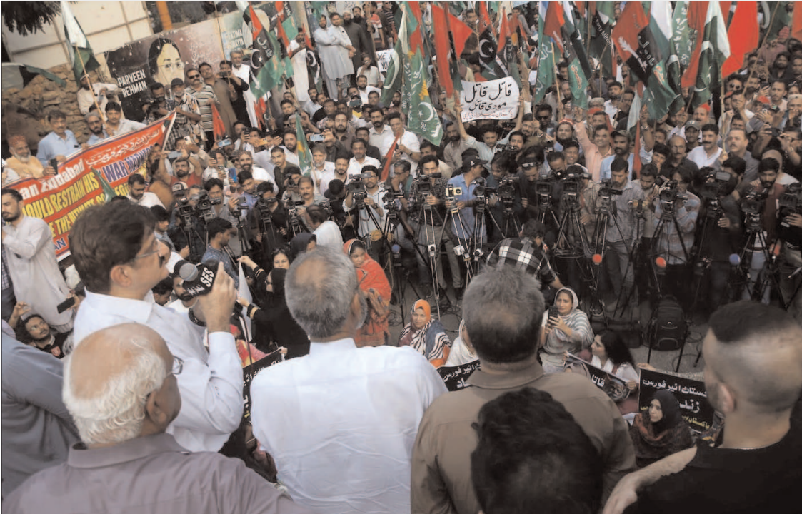
KARACHI: Chief Minister Sindh Syed Murad Ali Shah addressing Pakistan Zindabad Rally organized by different political parties.

The NSC said that the Pakistan's armed forces, in line with the exercise of the right of self defense and response framework outlined in NSC statement dated April 22, 2025, resolutely defended the territorial integrity of Pakistan, including Azad Jammu and Kashmir, against the Indian aggression, while also bringing down five Indian fighter aircrafts and Unmanned Aerial Vehicles in the process.