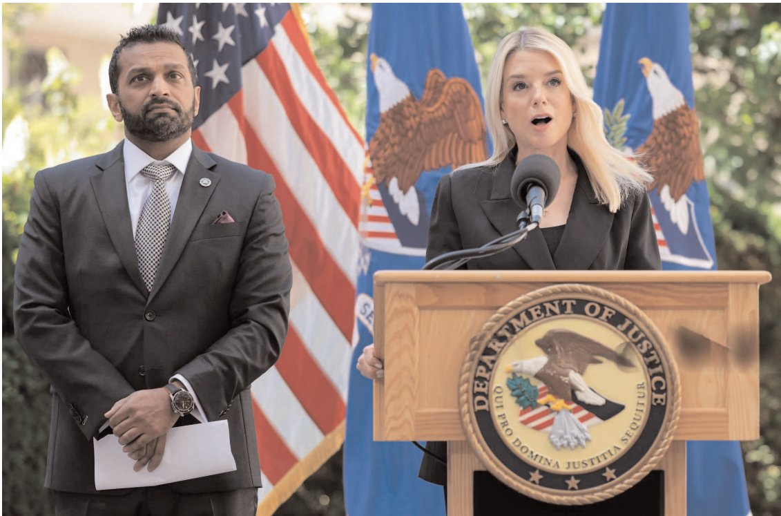
WASHINGTON, DC : Director of the Federal Bureau of Investigation (FBI) Kash Patel (L) and U.S. Attorney General Pam Bondi speak during a press conference to announce the results of Operation Restore Justice on Wednesday in Washington, DC. During the operation, 205 arrests were made nationwide in five days in a joint effort with federal, state, and local partners to arrest accused child sex abuse offenders and combat child exploitation.