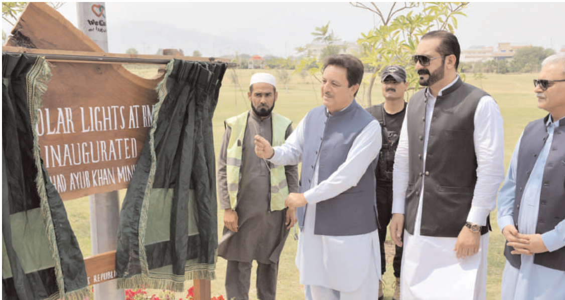
PESHAWAR: Provincial Minister for Local Bodies and Rural Development inaugurating solar lights in Regi Model Town Park.

play a vital role in preventing abuse, violence, and injustice against children, and serve as a coordination hub among all relevant institutions. The minister appreciated the joint efforts of the district administration, Social Welfare Department, UNICEF, and the Khyber Pakhtunkhwa Child Protection Commission. He expressed hope that the CPU would lay the foundation for a safer and brighter future for children in Batagram and beyond. On this occasion, he also announced that the provincial government will increase the grant-in-aid budget for the Child Protection Commission to facilitate the establishment of more CPUs across other districts.