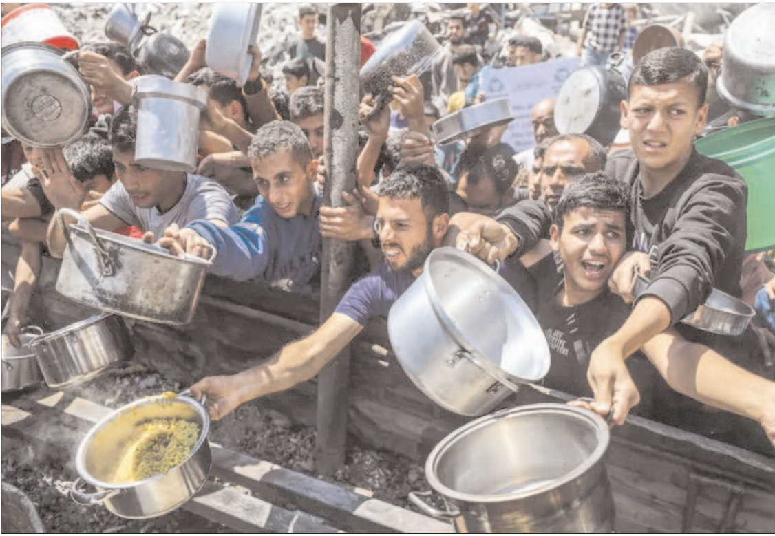
GAZA: Displaced Palestinians receiving hot meals distributed by aid organizations in Jabalia refugee camp.

The accusations were made by former officials from the National Unit for Disaster Risk Management (UNGRD), who are already in prison as part of the ongoing investigation. Both Name and Calle have denied the charges. Name has already been detained by police officials. As a result of the criminal proceedings, the lawmakers' congressional seats will be vacated and cannot be replaced while the legal process is underway.