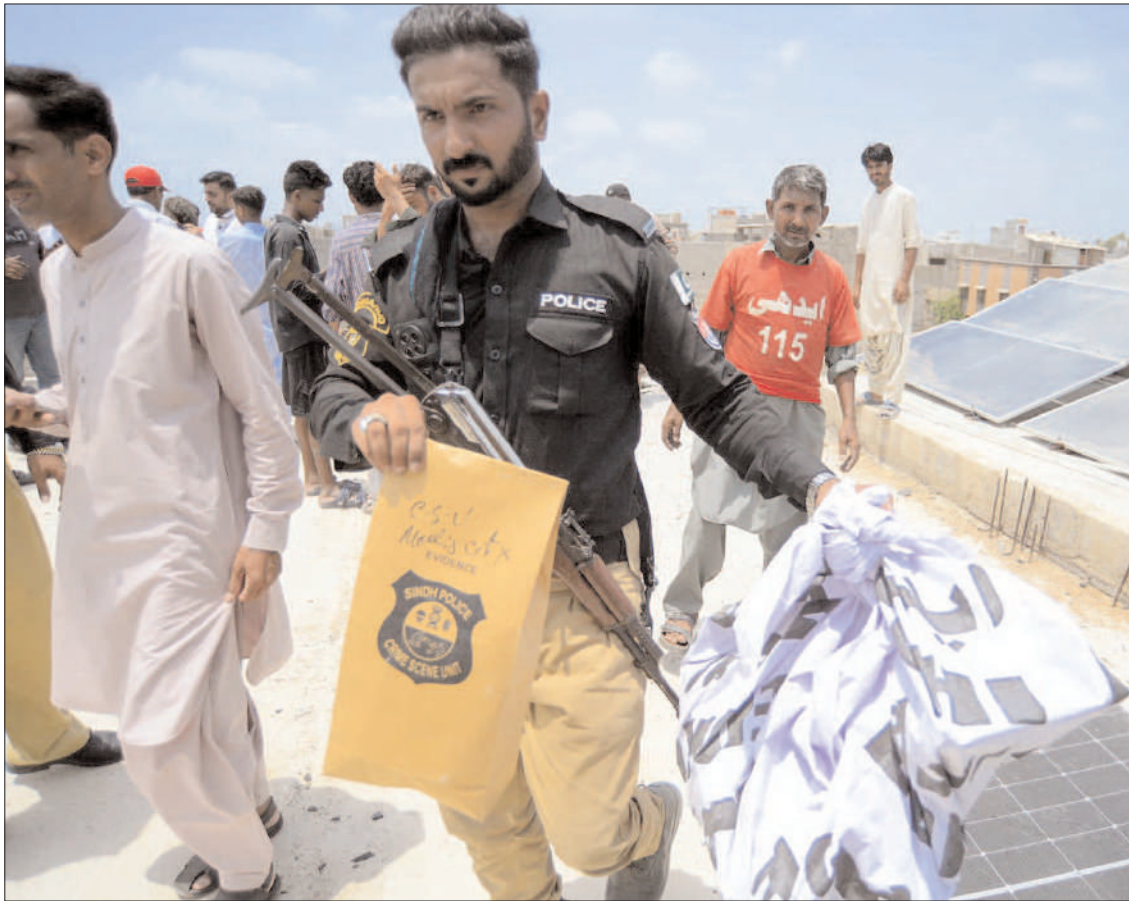
KARACHI: Security officials inspecting the site and collecting pieces of Indian drone after strike.

LAHORE: The US Consulate General in Lahore on Thursday issued a security alert for its staff and American citizens in the city, urging them to relocate to safer areas following reports of a drone being shot down in the provincial capital, says in media reports. According to the advisory, the Consulate has instructed its personnel to move to secure locations amid concerns that airstrikes could follow the incident.