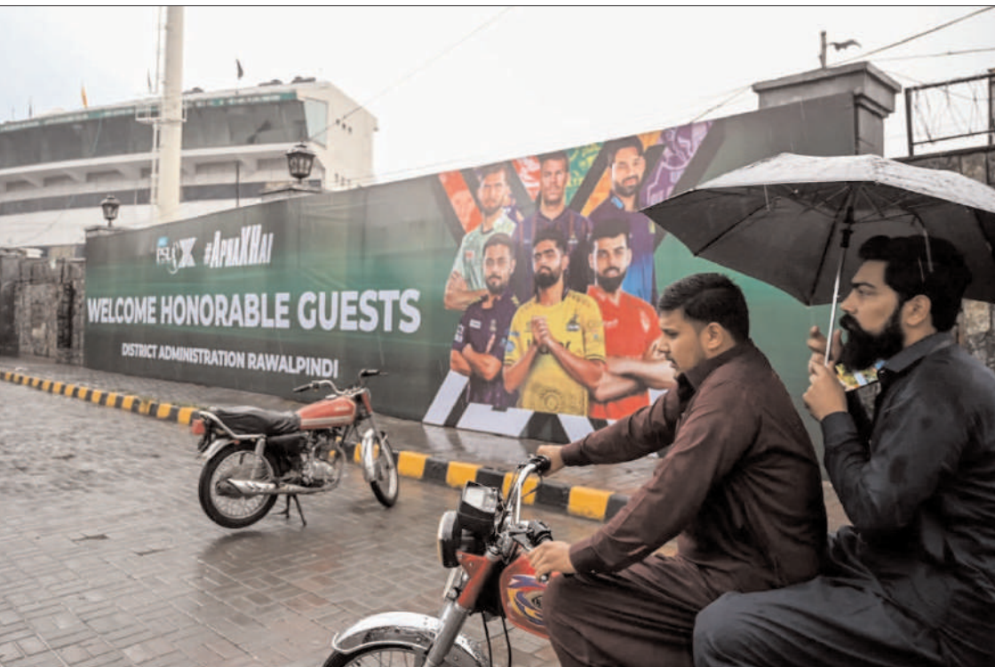
RAWALPINDI: Men ride on a motorbike in front of the Rawalpindi cricket stadium after an alleged drone was shot down.

A revised schedule for the postponed match will be announced in due course. An official statement from the PCB is expected soon.