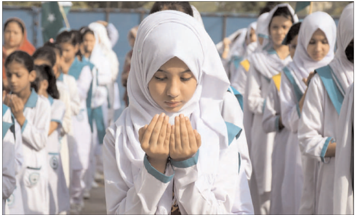
HYDERABAD: Students praying for those who lost their lives in recent Indian attacks on Pakistan.

rupees and in which was received 53,12,3144 Rupees and deposited in the treasury of Pakistan. He said that our task force is identifying the electricity thieves and taking actions against them and these actions will continue.