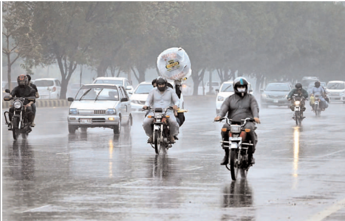
ISLAMABAD: Vehicles and motorcycles on way at Islamabad Expressway during rain.

Senior Pakistan People's Party (PPP) leader Raja Pervaiz Ashraf paid tribute to all members for demon-