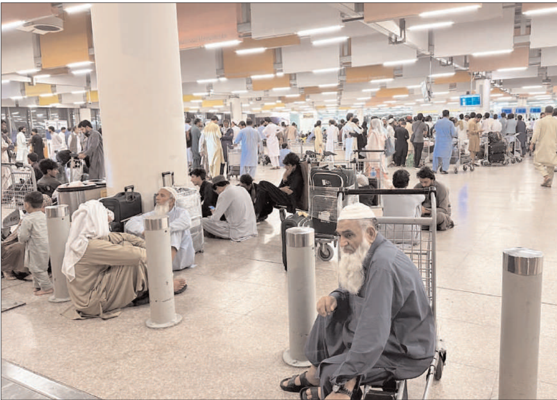
ISLAMABAD: Passengers waiting for flights at airport as schedule cancelled by government after Indian drone strikes in many cities.

He called for greater public involvement, urging stakeholders to share suggestions and exert positive pressure on the government to keep