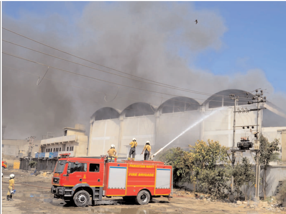
KARACHI: A view of fire caught on warehouse at Maripur locality.

Islamabad Police launched a strict crackdown against one-wheeling and public disorder, utilizing Safe City cameras and drone surveillance to maintain public safety. This effective strategy highlighted Islamabad Police's dedication and performance in ensuring community safety during Eid.