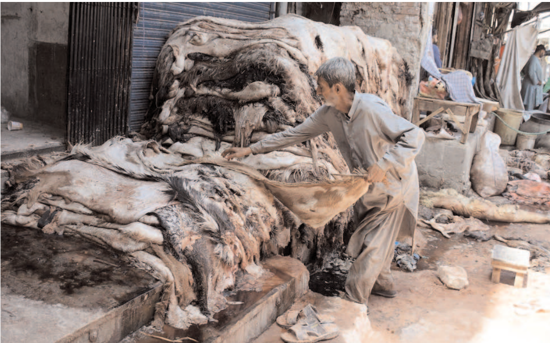
RAWALPINDI: A man collecting sacrificial animal skins at local market.

As of March 2025, over 30,000 IT and ITes companies are registered with the Securities and Exchange Commission of Pakistan (SECP), showing the sector's rapid growth and economic potential.