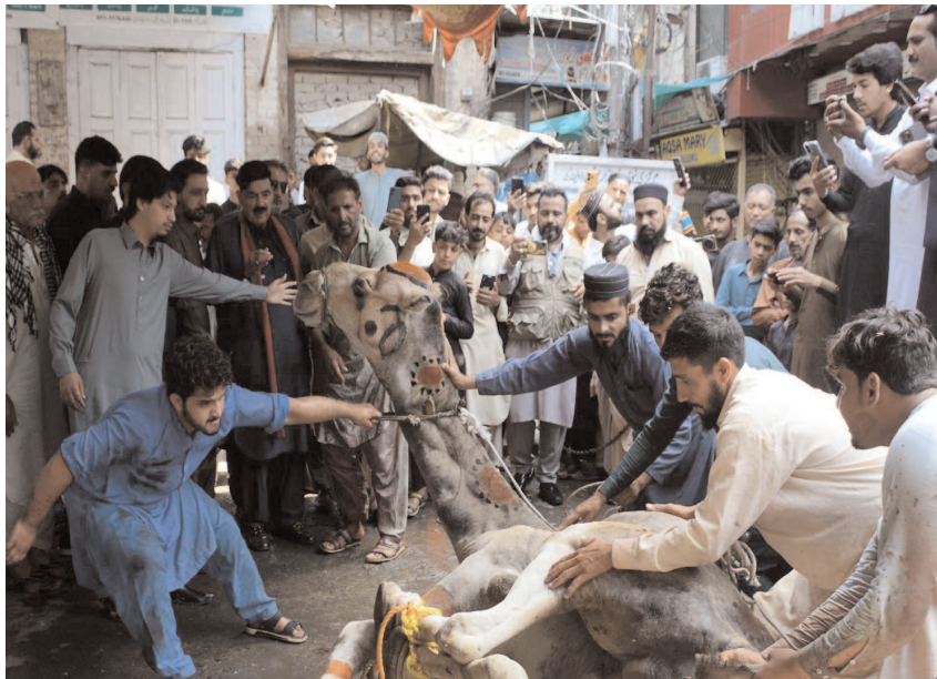
RAWALPINDI: Butchers attempt to bring down a camel to sacrifice on the religious ritual of Eid-ul-Adha prayers.

Rawal Dam, which supplies water to Islamabad and Rawalpindi, is also a popular spot for recreation. But authorities say its depth, water currents, and lack of proper safety measures make swimming extremely dangerous.