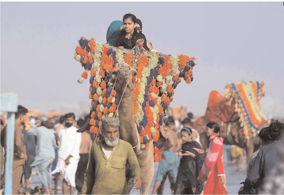
KARACHI: People enjoying at sea view during eid holidays.