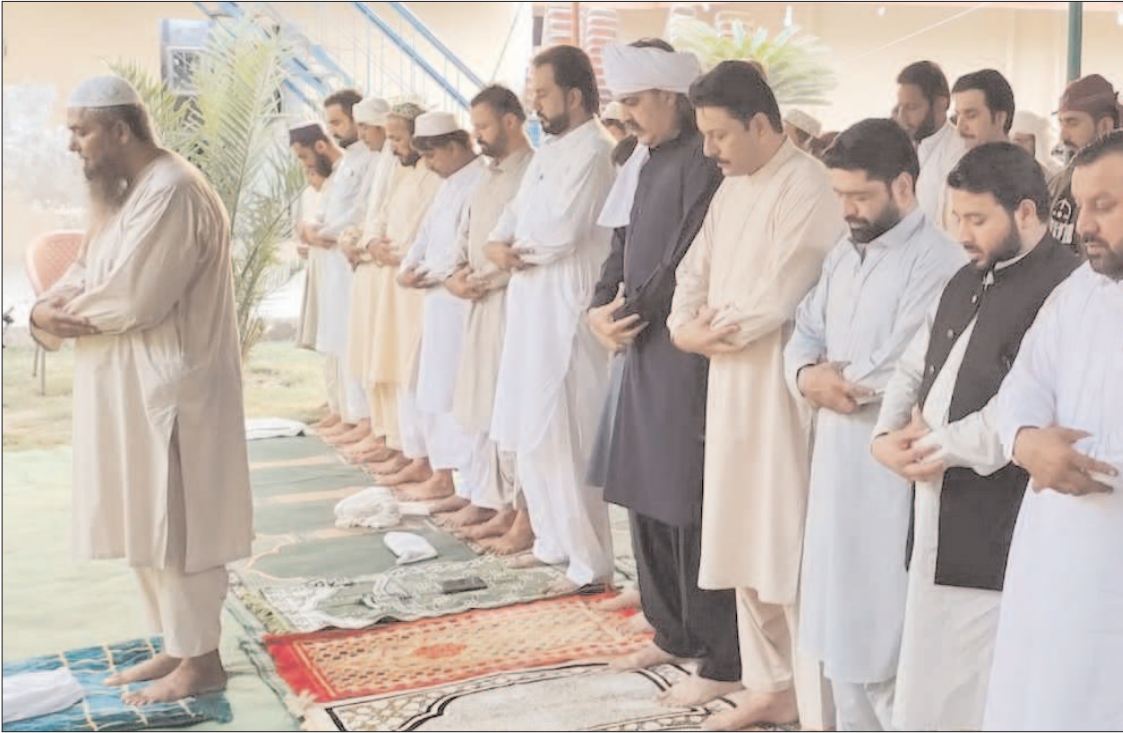
D I KHAN: Chief Minister of Khyber Pakhtunkhwa, Ali Amin Gandapur offering Eidul Azha prayer at his native village.

The United Nations' special rapporteur on human rights in the Palestinian territories, Francesca Albanese, has supported the FFC operation and on Sunday, urged other boats to challenge the Gaza blockade. "Madleen's journey may have ended, but the mission isn't over. Every Mediterranean port must send boats with aid & solidarity to Gaza," she wrote on X.