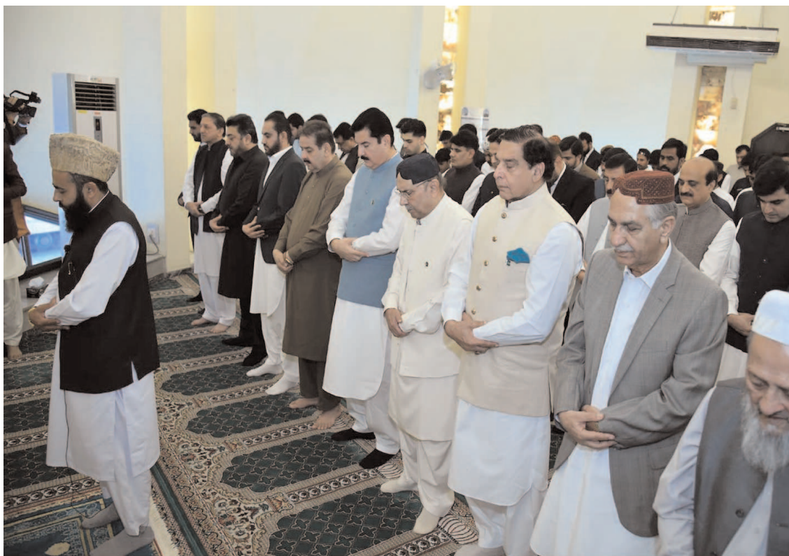
ISLAMABAD: President Asif Ali Zardari offering Eid-ul-Adha prayers at Aiwan-e-Sadr.