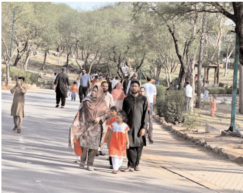
ISLAMABAD: A large number of family members visiting picnic point Daman e Koh on the 3rd day of Eid-ul-Adha celebrations.

Moreover, in the ongoing efforts to streamline academic records, 2,683 PhD applications were approved for inclusion in the PhD Country Directory (PCD) as of March 25, 2025.