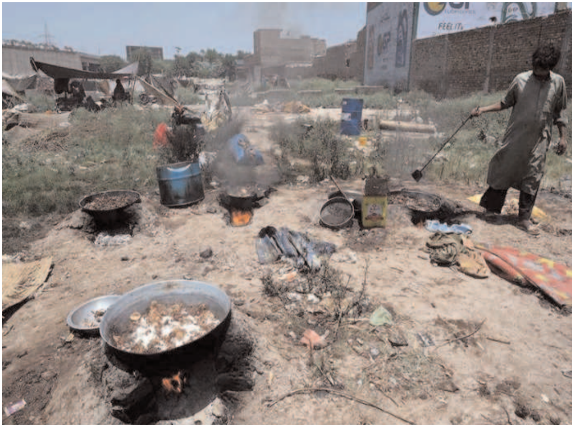
PESHAWAR: Gypsy person boiling meat after collecting on Eid ul Adha at Ring road.