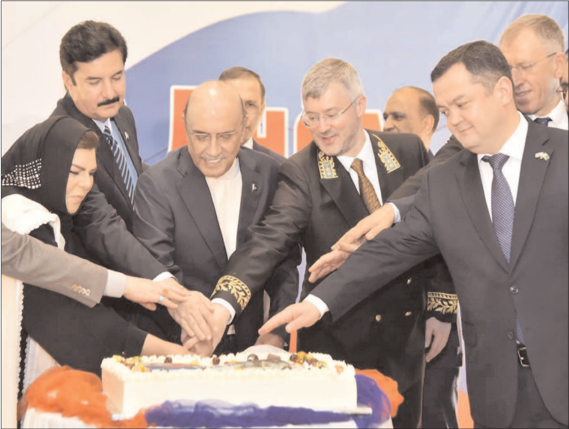
ISLAMABAD: President Asif Ali Zardari cutting cake to mark 35th National Day celebrations of Russian Federation.