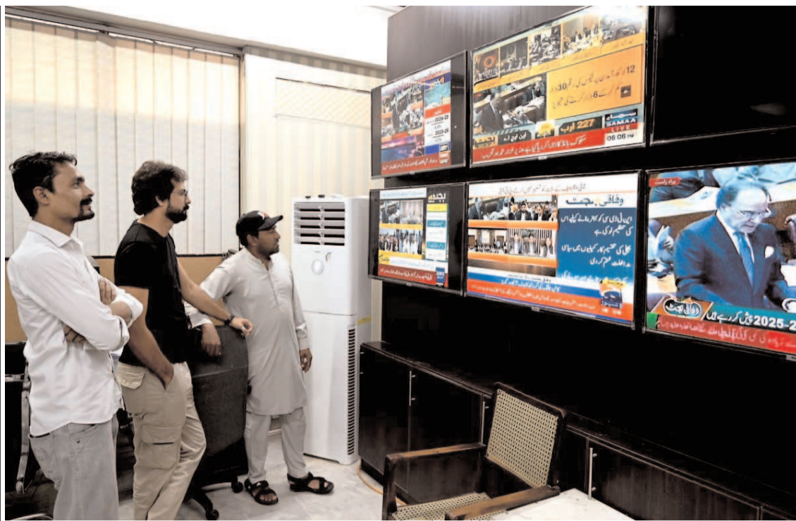
ISLAMABAD: Citizens watching the 2025-26 federal budget live on television screen at a roadside in the Federal Capital.

The uplift projects, he said, should be implemented as soon as possible. The commissioner said coordinated measures at all levels were the need of the hour for the convenience and betterment of citizens. Everyone had to play a role in that regard for creating a clean, developed and integrated system, he added.