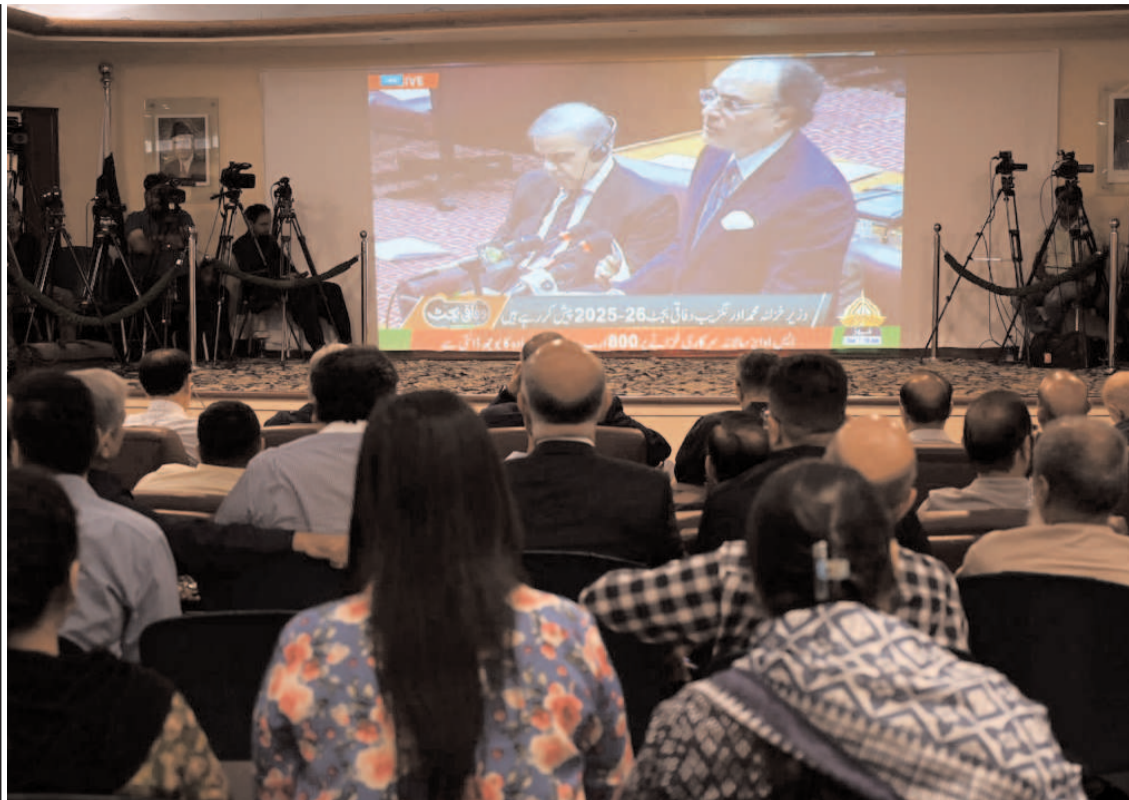
KARACHI: Business community watching the 2025-26 federal budget live on television screen at Chamber of Commerce.