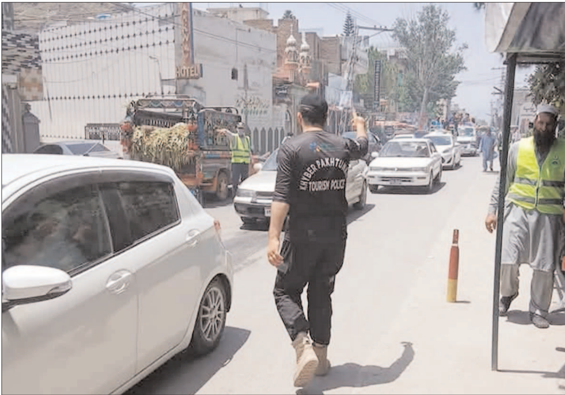
MINGORA: An official of KP Tourism Police Department, maintaining traffic on road in Swat.

KOHAT: Water and Sanitation Services Company Kohat (WSSCK) successfully completed a three-day special Eid cleanliness operation. By implementing its three-day Eid special cleanliness operation, 1430 tons sacrificial animal wastes were disposed of under environmentally friendly manner in six urban and KDA. Staff of the company remained on duty during three day of the Eid. In the operation, more than 96 vehicles, including Suzuki mini dumper, Garbage compactors, tractor trolleys, skip tractors, tractor shovels and excavators were participated. As many as 384 staff, including administrative officers, participated in the special Eid cleaning campaign. Member of the Provincial Assembly and DEDAC Chairman of the Assembly Shafi Jan along with Additional Deputy Commissioner Kohat Hamid Iqbal and WSSCK Board Chairman and Acting Chief Executive Officer Muhammad Saad from Sangerh School No. 3 formally inaugurated the Eid special cleanliness operation.