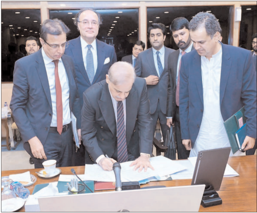
ISLAMABAD: Prime Minister Shehbaz Sharif signing document of Federal Budget 2025-26.