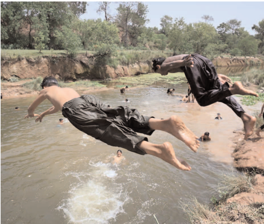
ISLAMABAD: Youngsters enjoy jumping and bathing in Rawal Lake spillway water to get some relief from hot weather in the Federal Capital.

ISLAMABAD (APP): A tragic accident occurred in Pindi Bhattian on Tuesday morning when a bus collided with a tree, resulting in the deaths of three passengers on the spot who were sitting on the roof of a bus. According to rescue sources, the bus heading from Gujrat to Muzaffargarh was involved in the fatal accident. The victims, including the deceased and injured were from Sindh province, private news channel reported. Following the accident report, a Rescue 1122 team swiftly arrived at the scene and began administering first aid to the injured, as the local hospital in Pindi Bhattian lacked sufficient staff and medical supplies.