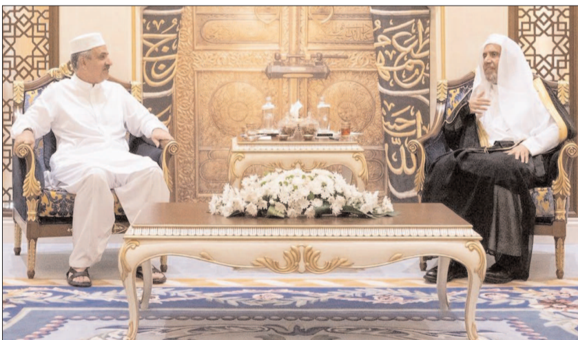
MAKKAH: Chief Justice of Pakistan, Justice Yahya Afridi called on Secretary General of Muslim World League and Chairman of Organization of Muslim Scholars, Sheikh Dr. Mohammed Alissa.

In January 2025, an 18-year-old man fatally stabbed a high school student and a teacher at a school in north-eastern Slovakia. In December 2024, a 19-year-old man stabbed a seven-year-old student to death and injured several others at a primary school in Zagreb, Croatia.