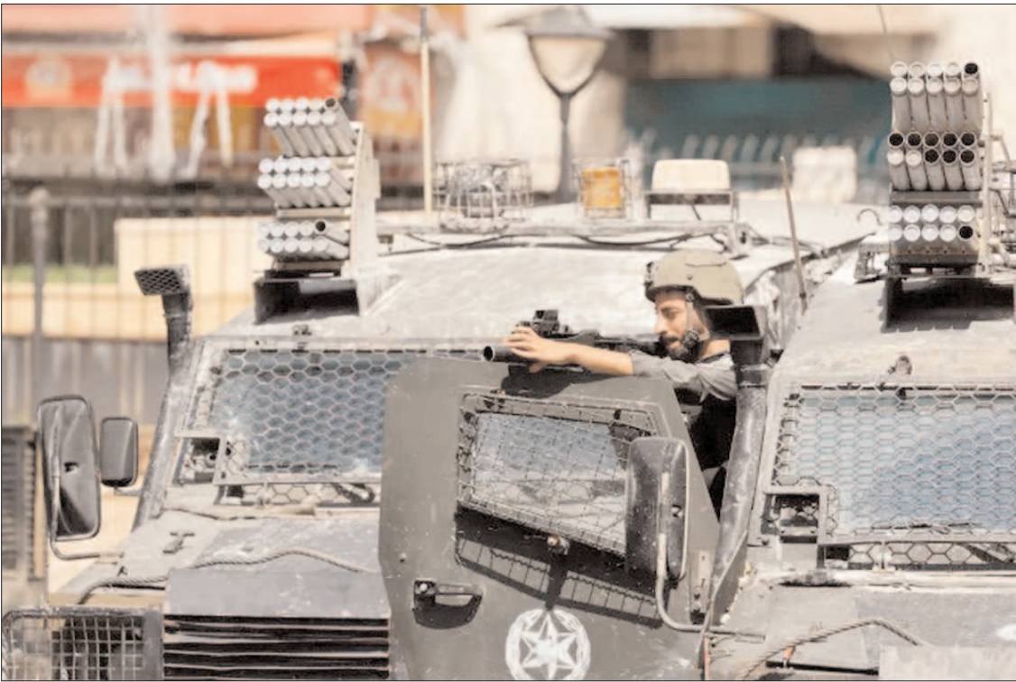
WEST BANK: An Israeli soldier taking part in an Israeli raid in Nablus.