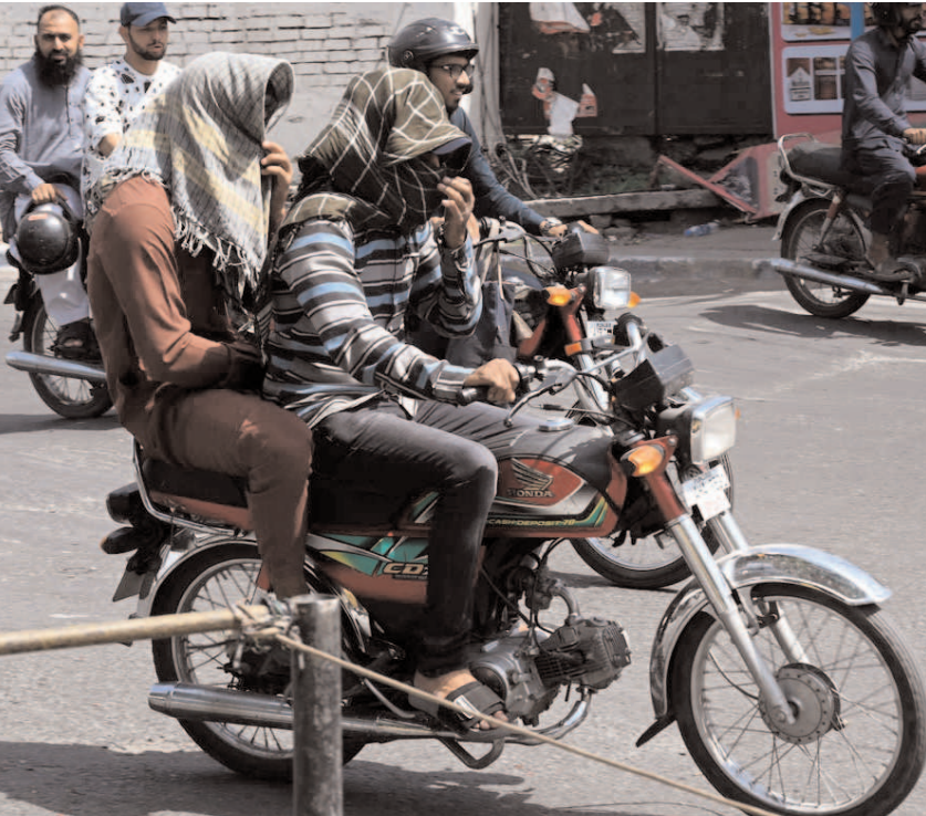
LAHORE: A motorcyclist covers his face with a scarf to shield against the soaring summer temperatures in the Provincial Capital.