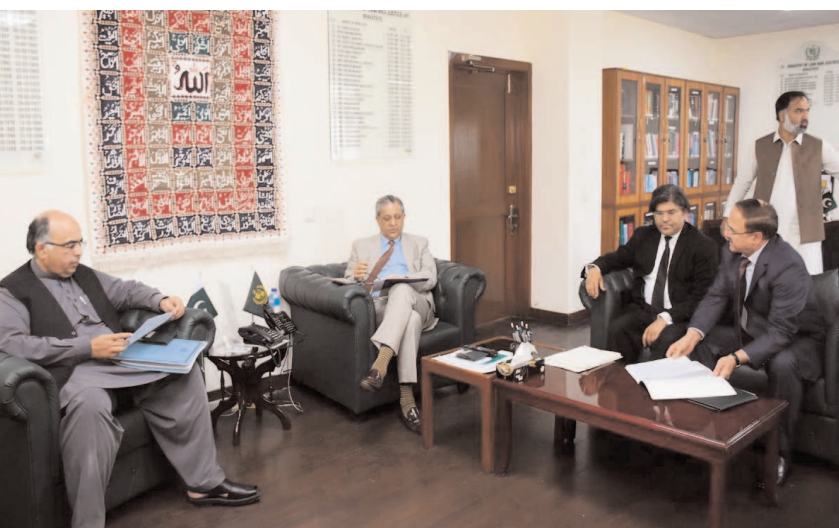
ISLAMABAD: A meeting of the FBR Review Committee was held today under the chairmanship of Federal Minister for Law and Justice, Senator Azam Nazeer Tarar.

He further directed that if larvae are found at any location, it must remain sealed for at least three days before being reopened.