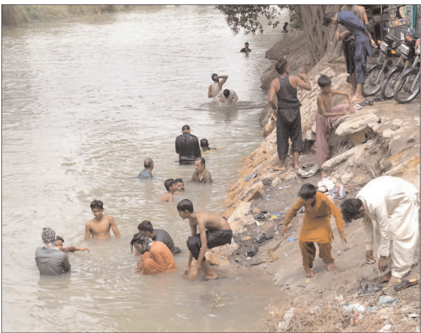
HYDERABAD: People enjoy bath in canal during hot weather.