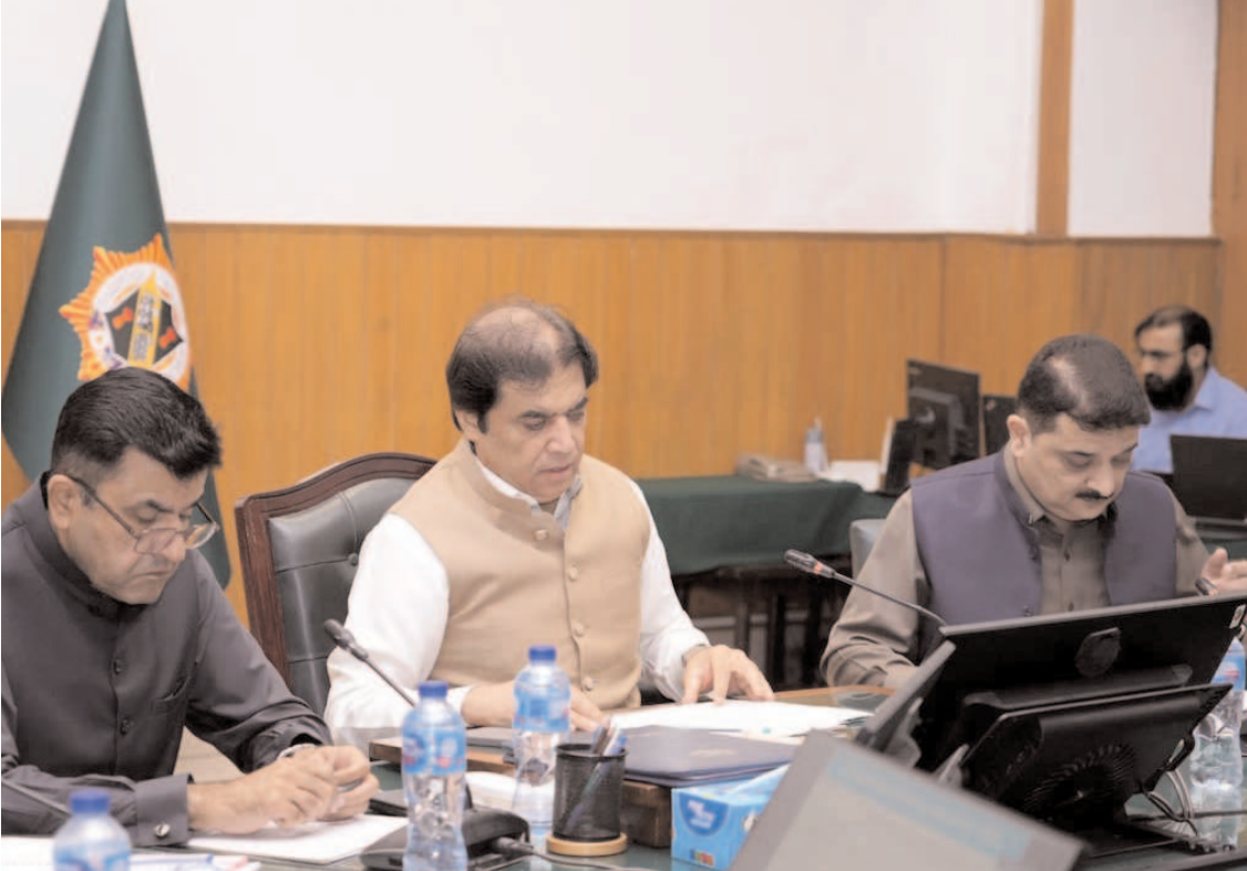
LAHORE: Federal Minister for Railways Muhammad Hanif Abbasi chairs important session at Railway Headquarter.