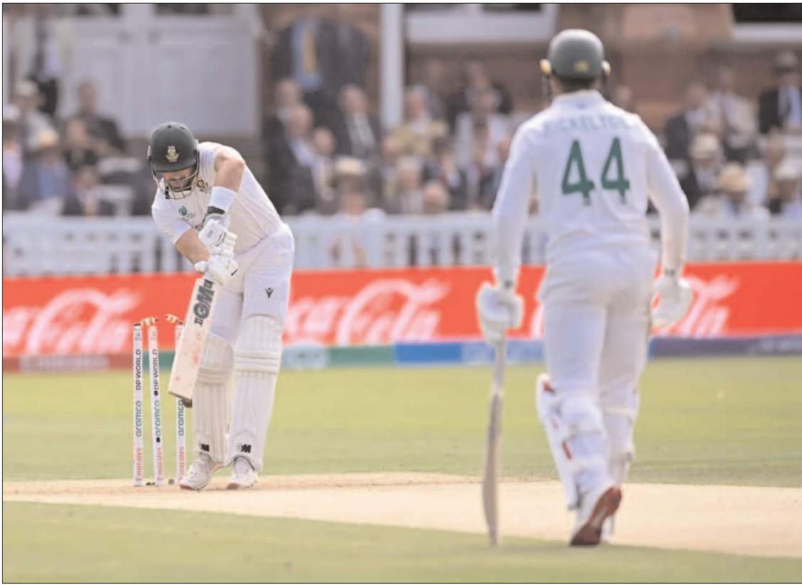
Aiden Markram inside-edged onto the stumps.

LONDON (Agencies): Australia's bowlers fought back after they were bowled out for a modest total by South Africa as 14 wickets fell on an engrossing first day of the World Test Championship final. Proteas quick bowler Kagiso Rabada claimed five of them after he helped skittle Australia for 212 shortly after the tea interval.