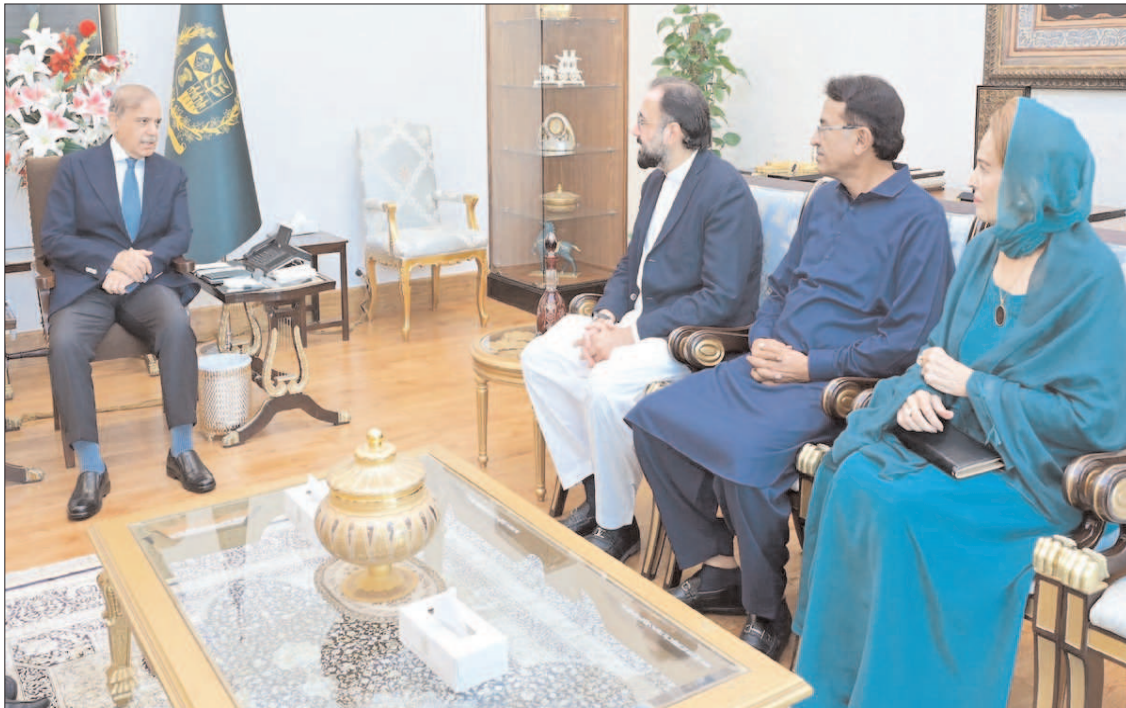
ISLAMABAD: A delegation of MNAs from PML-Q, led by Federal Minister for Overseas Pakistanis and Human Resource Development, Chaudhry Salik Hussain called on Prime Minister Shehbaz Sharif.

The confirmation of Trump’s willingness to mediate in the Kashmir issue could potentially pave the way for renewed dialogue and negotiations between the two South Asian neighbors, offering a glimmer of hope for peace in the region. The US administration’s proactive approach in addressing the Kashmir conflict underscores its broader strategy of fostering international stability and resolving long-standing disputes through diplomatic engagement. — Agencies