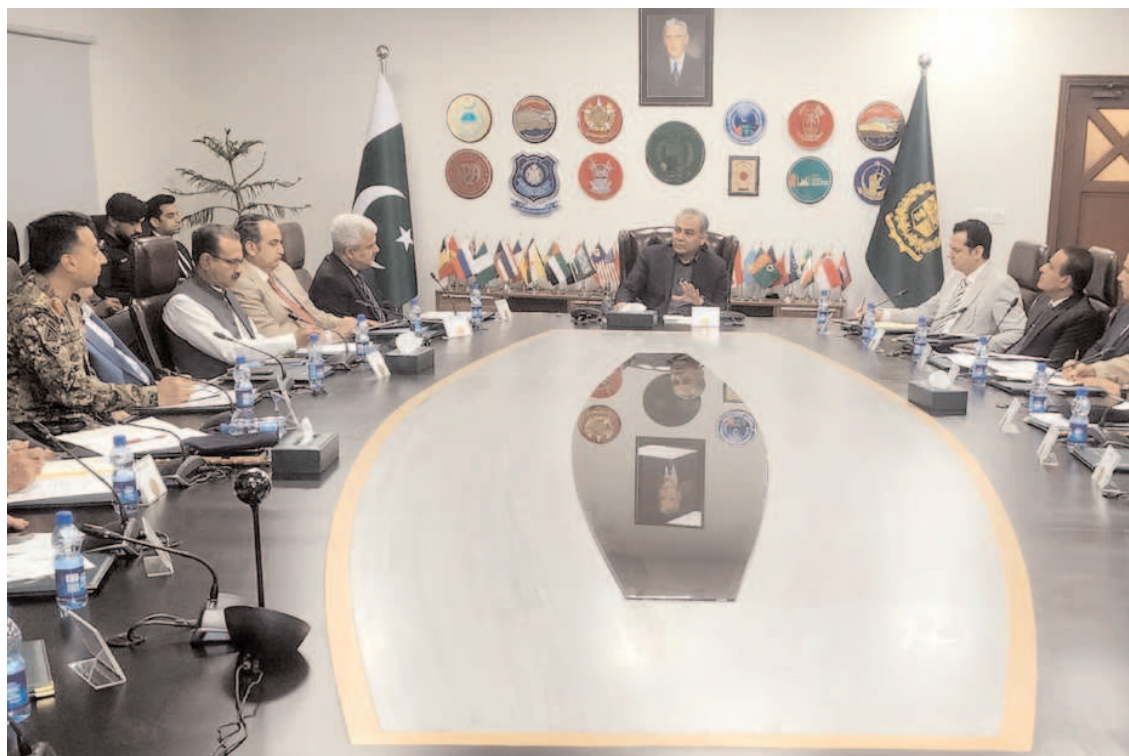
ISLAMABAD: Federal Minister for Interior Mohsin Naqvi chairing a coordination-focused meeting of all departmental heads.

Minister of State for Interior Talla Chaudhry, Secretary Interior, Additional Secretaries Interior, and heads of