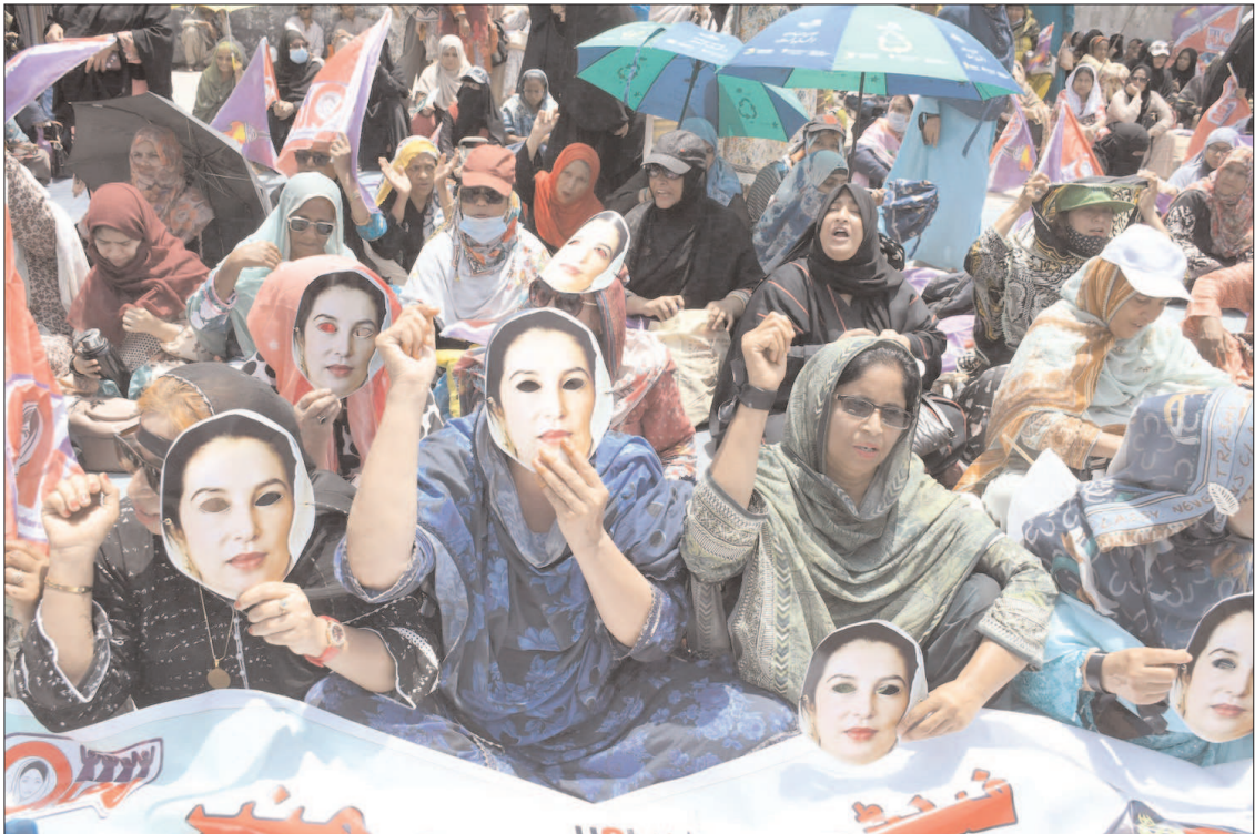
KARACHI: A large number of lady health workers holding a protest in favour of their demands outside Sindh Assembly.