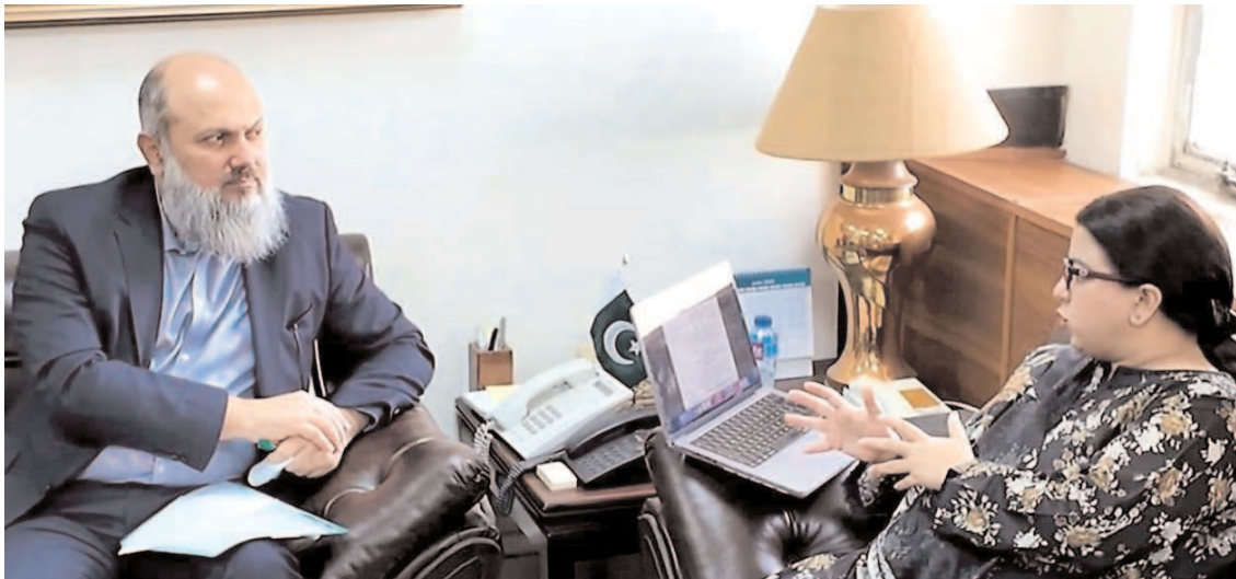
ISLAMABAD: Minister for Commerce Jam Kamal Khan and Minister for Information Technology and Telecommunication Shaza Fatima Khawaja discussing revisions in e-commerce taxation framework.

The price of gold in the international market went up by $30 to $3,375 from $3,345, whereas the prices of silver remain unchanged at $35.87, the Association reported.