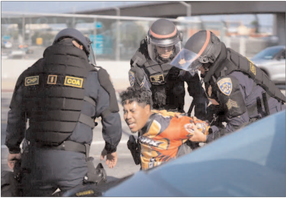
LOS ANGELES: A protester arrested by California Highway Patrol near federal building.