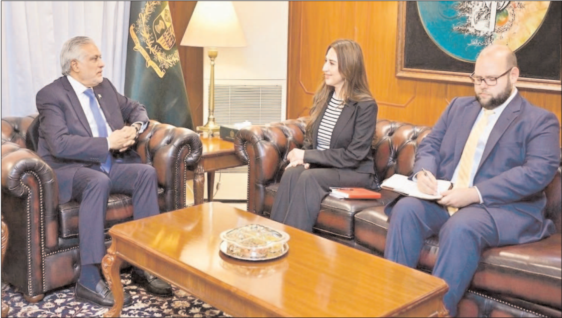
ISLAMABAD: US Charge d’Affaires, Natalie Baker, called on Deputy Prime Minister and Foreign Minister, Senator Ishaq Dar.