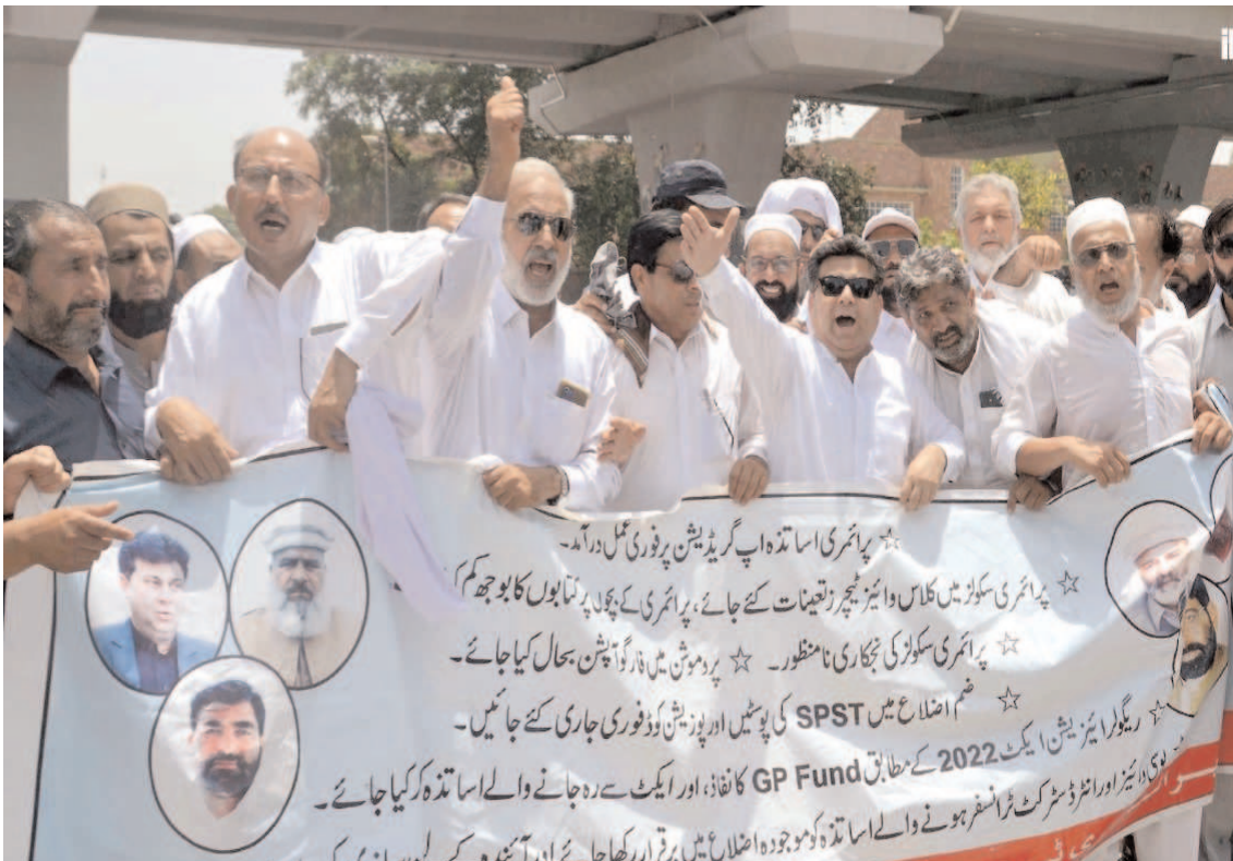
PESHAWAR: Members of All Primary Teachers Association holding protest outside Peshawar Press Club.