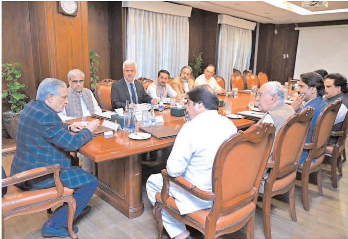
ISLAMABAD: Deputy Prime Minister and Foreign Minister, Senator Mohammad Ishaq Dar, chairs a meeting of the Committee for the Development and Management of the Hazrat Bari Imam Shrine.