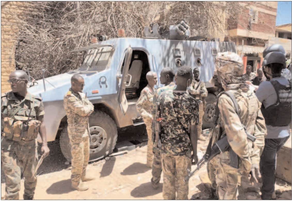
KHARTOUM: Members of Sudanese army gather next to a destroyed military vehicles after a battle with Rapid Support Forces in capital.