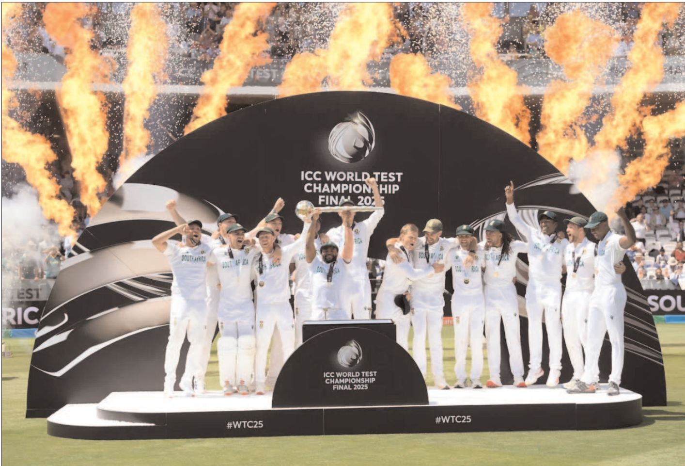
LONDON: Temba Bavuma of South Africa lifts the ICC World Test Championship Mace in celebration with his team.

LAHORE (Monitoring Desk): The tickets refund process of the HBL-Pakistan Super League-X matches which could not take place in Multan and Rawalpindi due to rescheduling of fixtures will commence on Monday (June 16). The refund will be processed from June 16 to 20 with physical tickets refund will be available at designated TCS Express Centres. The tickets will be processed daily from Monday to Friday between 10am to 4pm from Lahore's Gulberg Office, Multan's Area Office, Rawalpindi Main Express Centre, Bahawalpur's Main Express Centre Model Town, Rahim Yar Khan's Station Office and Islamabad's I/9 Express Centre.