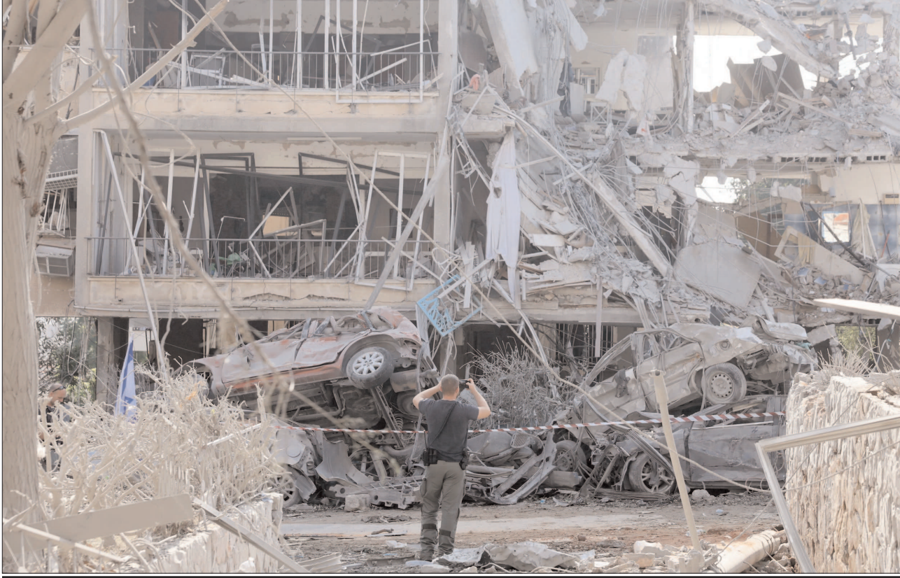
TELAVIV: An Israeli police officer inspecting a damaged residential building after a ballistic missile strike in Ramat Gan.

Iran has named the retaliatory strikes "Operation True Promise 3" with a senior Iranian