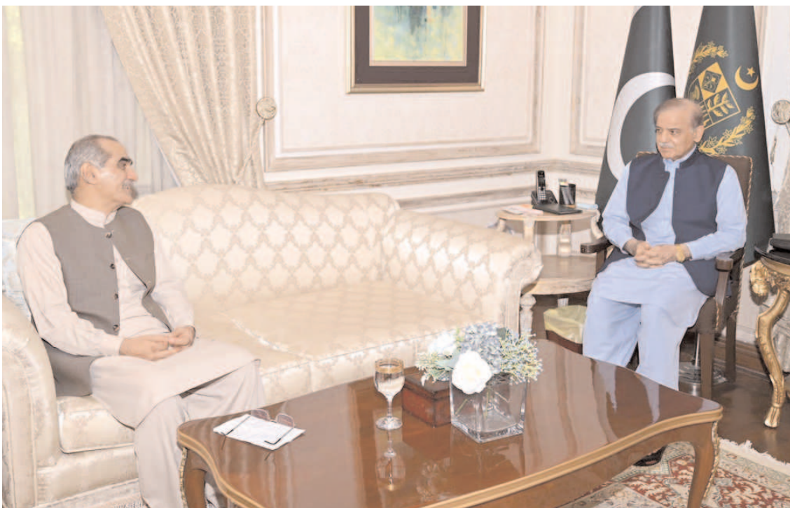
LAHORE: Former Federal Minister Khawaja Saad Rafique calls on Prime Minister Muhammad Shehbaz Sharif.