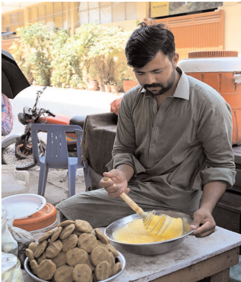
ISLAMABAD: Vendor busy mixing eggs to prepare burgers at their roadside food stall near Ghauri Town in the Federal Capital.