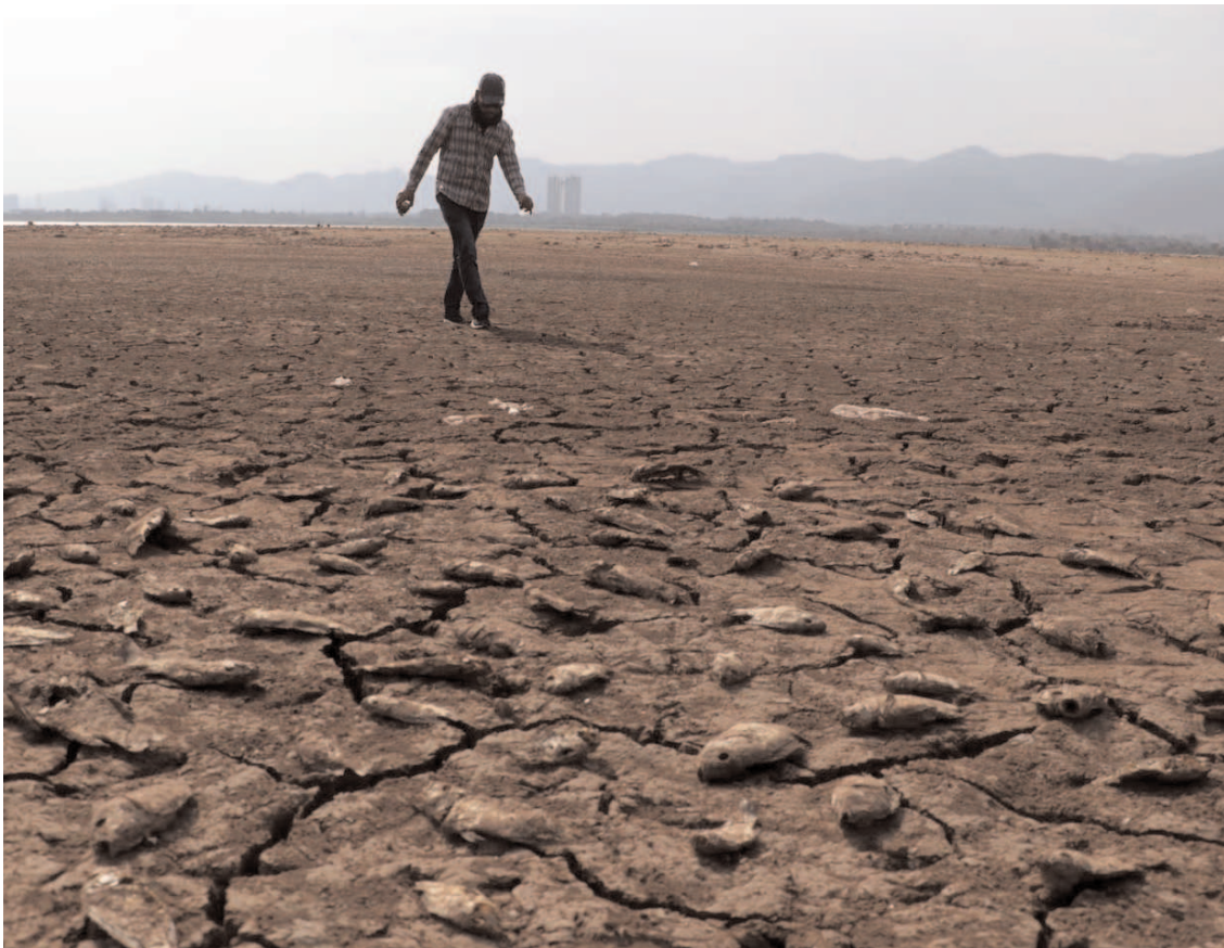
ISLAMABAD: A view of dead fish seen on dry Rawal Dam due to shortage of rain.