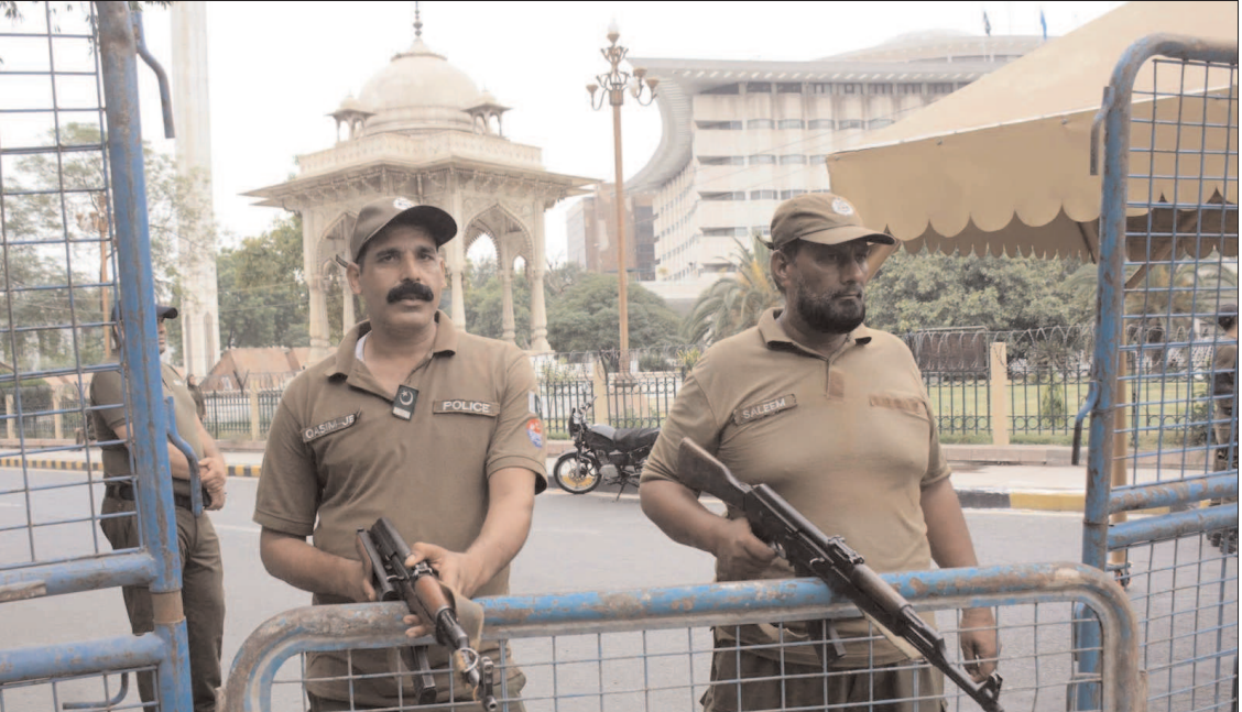
LAHORE: Police personal stand alert during Punjab Government unveils Rs5.35 trillion 'tax-free' budget for 2025-26 at Punjab Assembly in Lahore.

KARACHI (APP): In a continued crackdown on criminal activities, Karachi police engaged in 11 encounters with armed robbers over the past week, resulting in the deaths of three suspects and the arrest of 16 others, including 13 injured in exchange of fire. According to a spokesperson for Karachi Police on Monday, the arrested suspects were found in possession of 13 illegal weapons of various types and five motorcycles used in crimes. During operations conducted in the East, West, and South zones of the city, police apprehended more than 1058 suspects involved in various criminal activities. As part of their anti-narcotics campaign, law enforcement agencies recovered 22,566 kg of hashish, ice/crystal meth, and heroin, worth millions of rupees, from various locations across Karachi. Additionally, over 86 illegal firearms with ammunition reportedly used in muggings and other crimes were seized from the arrested suspects. Police also recovered a total of 32 snatched and stolen motorcycles and two large vehicles during separate operations.