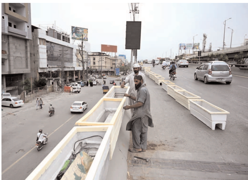
RAWALPINDI: RDA worker install plant pots along a roadside bridge as part of a beautification and greening drive in the twin cities.

More operations are expected in other commercial zones of the city as part of the broader initiative to ensure lawful use of public spaces.