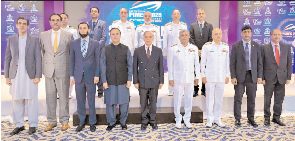
ISLAMABAD: Prime Minister Shehbaz Sharif in a group photo during soft launch of Pakistan International Maritime Expo and Conference.