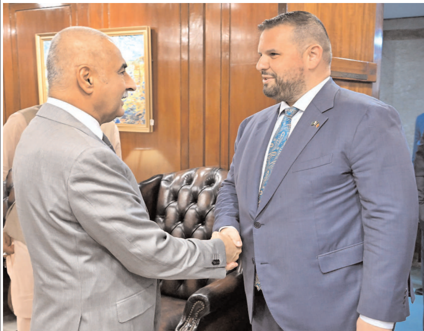
ISLAMABAD: Speaker National Assembly Sardar Ayaz Sadiq receiving Ambassador of Romania Dan Stoenescu at Parliament House.

Both sides expressed readiness to facilitate the exchange of high-level parliamentary delegations in the future.