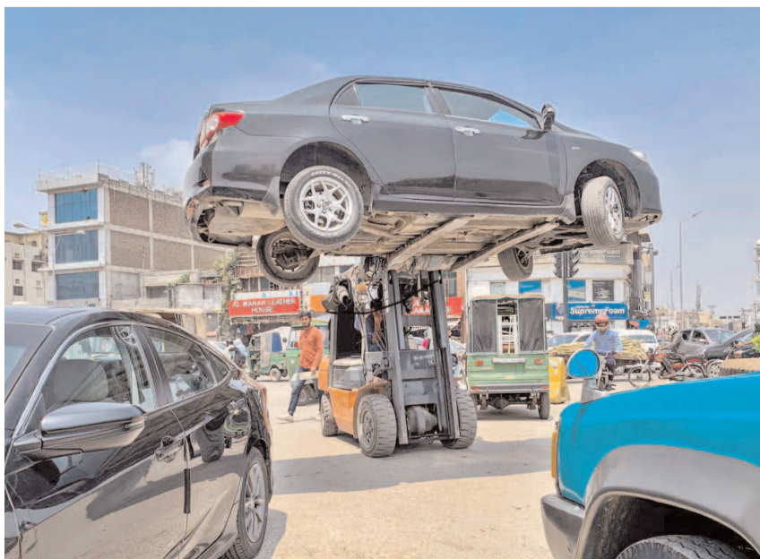
RAWALPINDI: A traffic police officer using a lifter to remove a wrongly parked vehicle in the Saddar area of the city.

He stressed the need for making significant investment in higher education to enable the educational institutions to play a more effective role in the development of Pakistan. He stated that the youth of Pakistan have a great potential that needs to be tapped. He underlined that the Pakistani youth graduated from the local universities are playing a pivotal role in the development of this country.