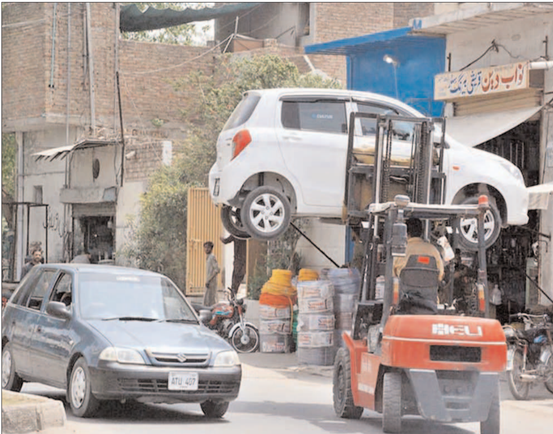
BAHAWALPUR: A traffic policeman using lifter to remove a wrongly parked vehicle obstructing the flow of traffic.