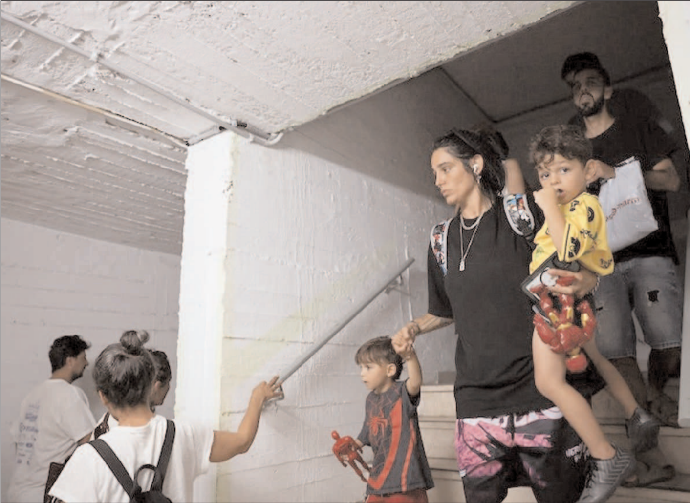
TEL AVIV: Israeli people taking shelter after missile attacks from Iran.