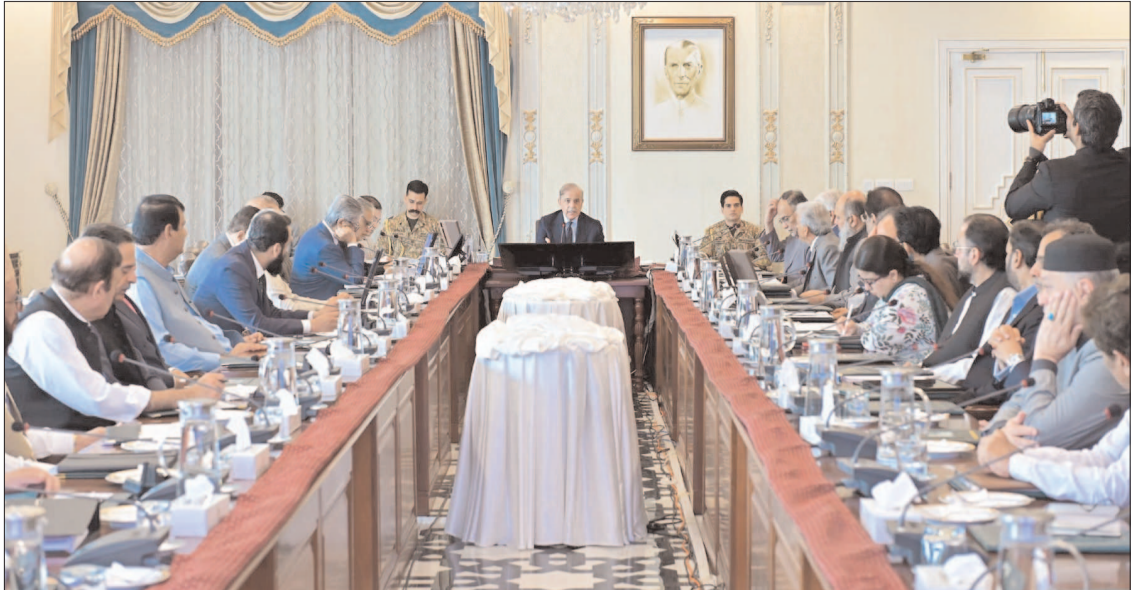
ISLAMABAD: Prime Minister Shehbaz Sharif chairing the federal cabinet meeting.