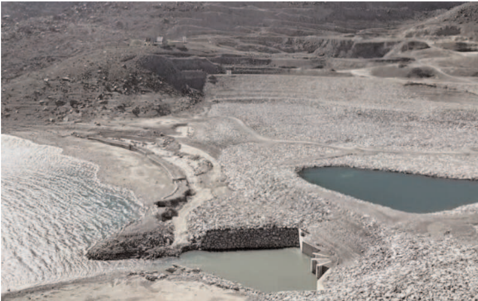
for visitors-resulting in a noticeable drop in tourist arrivals in certain seasons.