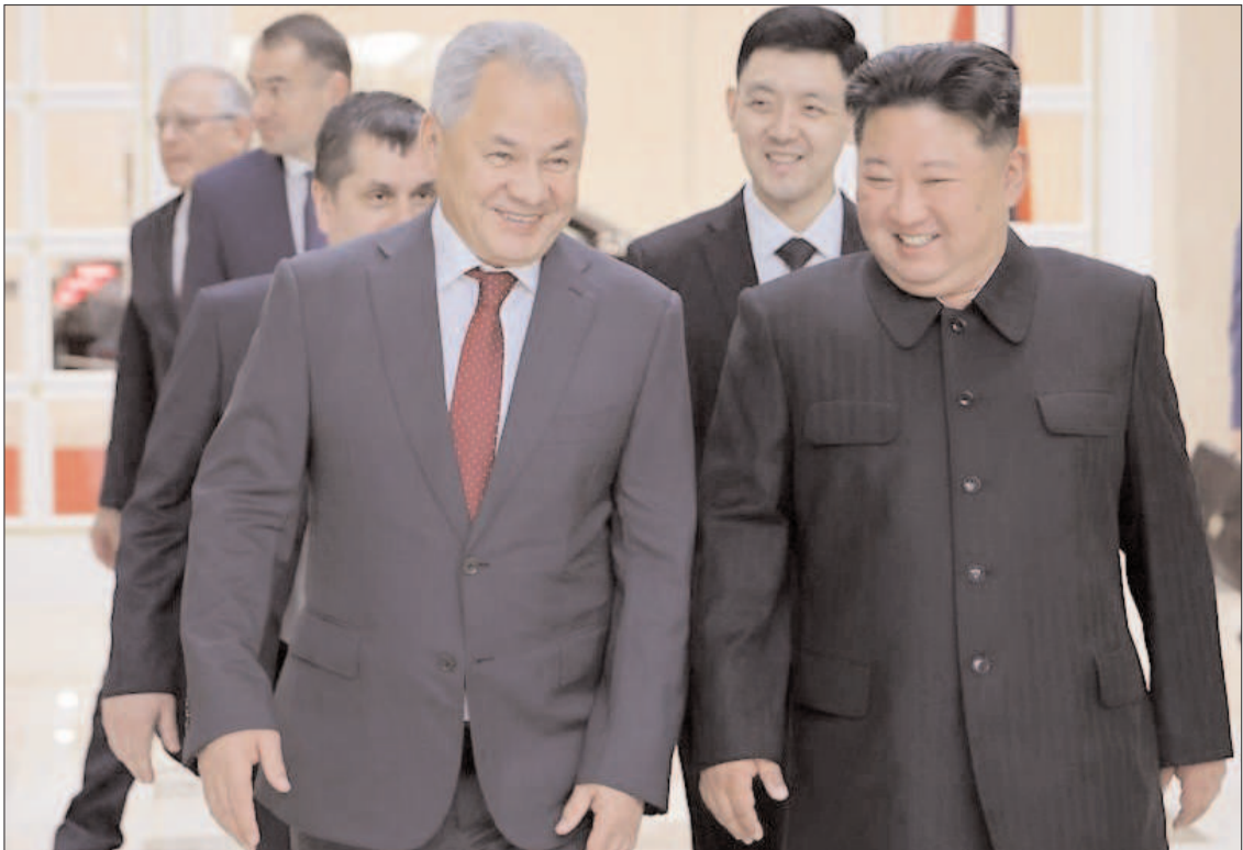
PYONGYANG: North Korean leader Kim Jong Un meets with Russian Security Council Secretary Sergei Shoigu at the headquarters of the ruling Workers' Party in North Korea.