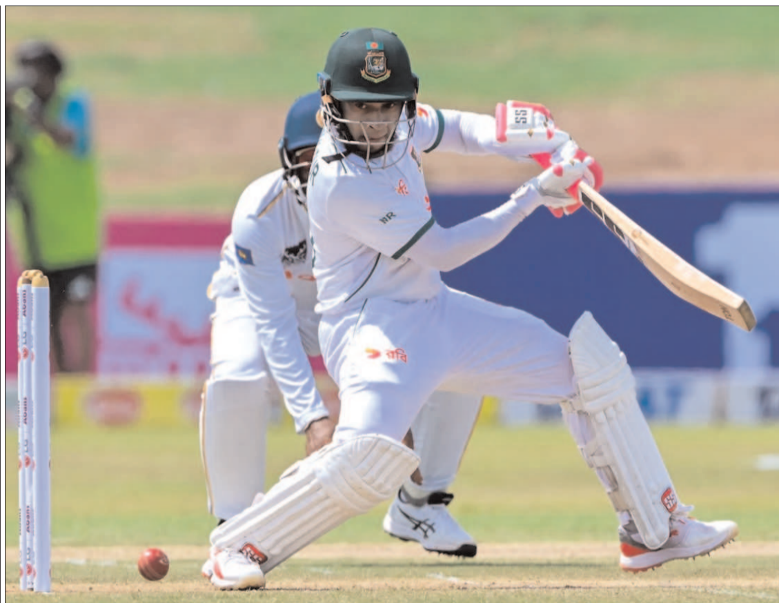
GALLE: Mushfiqur Rahim used the crease well against spin.

Looking ahead, certified individuals will be entrusted with leading training initiatives and contributing to the administrative framework of the sport.