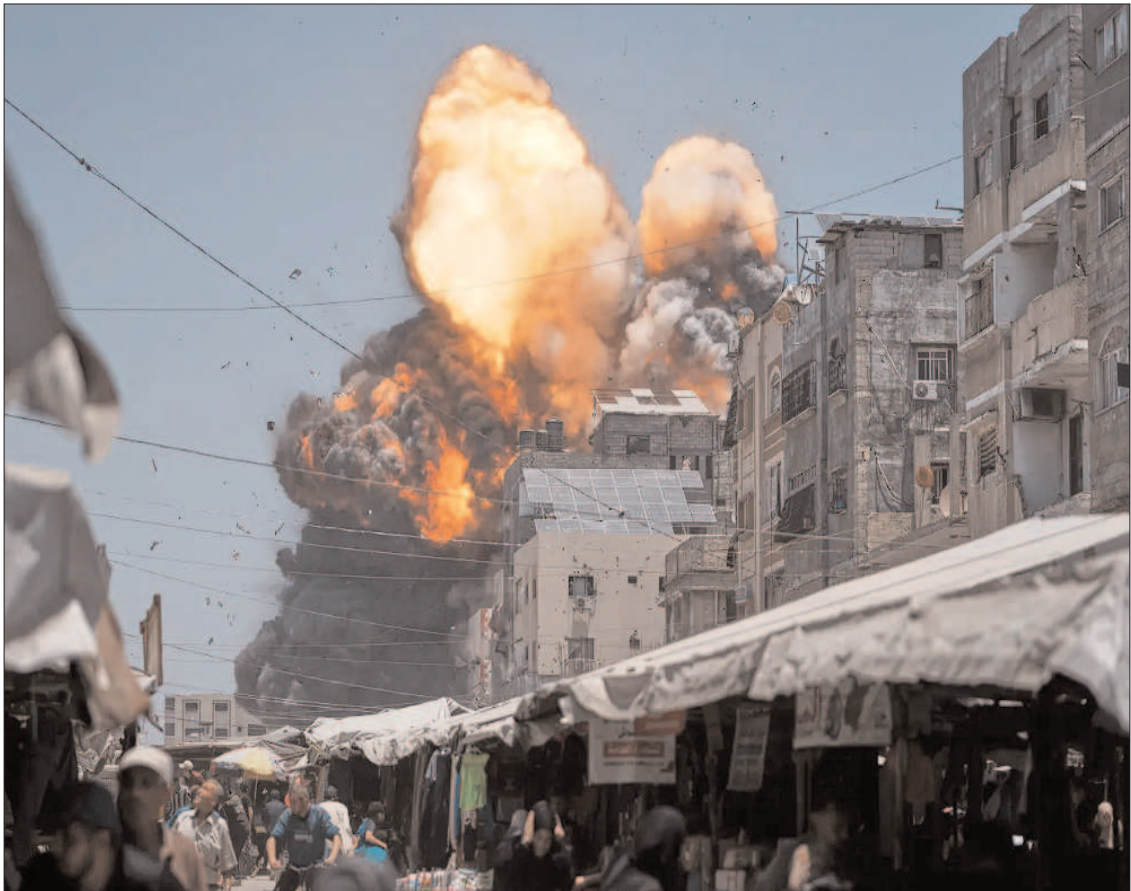
GAZA: Thick smoke and flames erupt from an Israeli airstrike in Gaza City, Sunday.