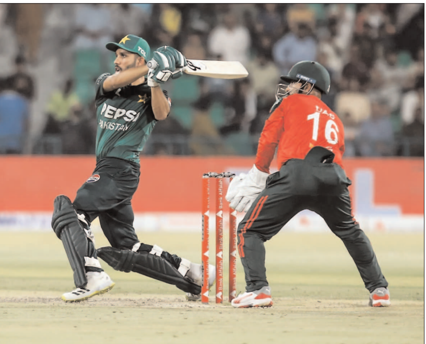
LAHORE: Mohammad Haris' fifty led Pakistan's chase.

Nawaz added 26, playing valuable supporting roles. This was the Pakistan's first T20I series whitewash against any opposition since 2021. PLAYING XI Pakistan: Sahibzada Farhan, Saim Ayub, Mohammad Haris (wk), Salman Agha (c), Hasan Nawaz, Shadab Khan, Khushdil Shah, Faheem Ashraf, Abbas Afridi, Hasan Ali, Abrar Ahmed Bangladesh: Tanzid Hasan, Parvez Hossain Emon, Litton Das (c), Towhid Hridoy, Mehidy Hasan Miraz, Jaker Ali, Shamim Hossain, Rishad Hossain, Tanzim Hasan Sakib, Hasan Mahmud, Khaled Ahmed.