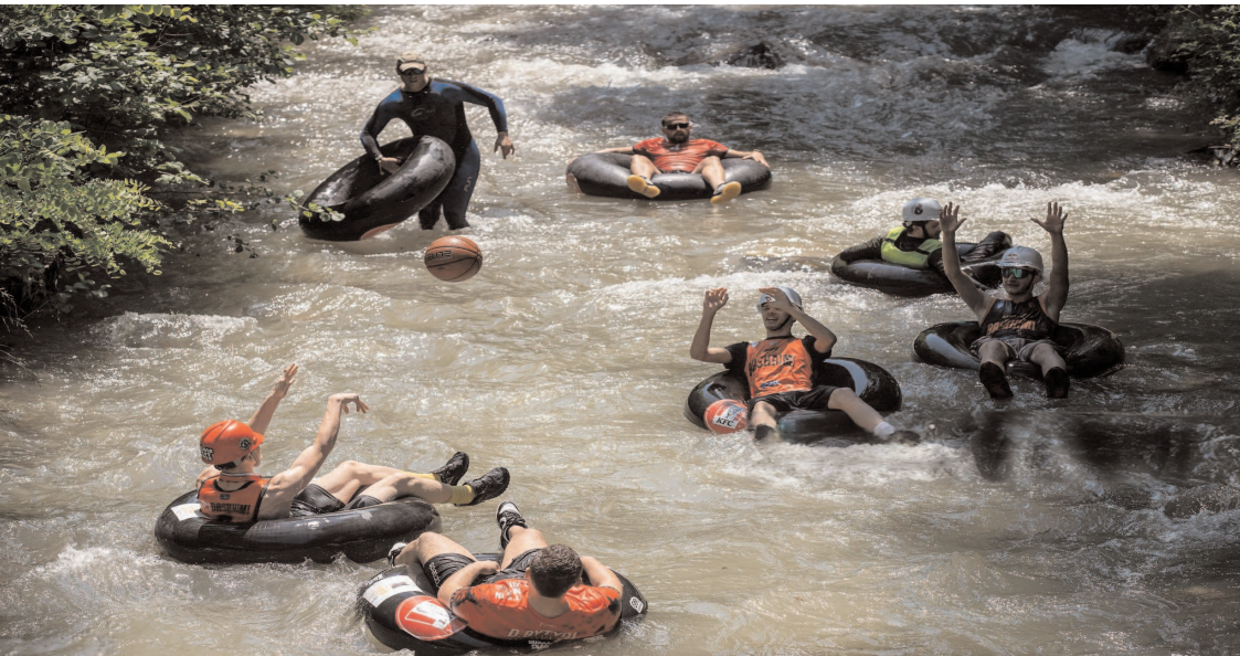
PRIZREN, KOSOVO: Competitors throw basketball during the 21st edition of BunarFest on June 1, 2025 in Prizren, Kosovo. The center piece of BunarFest is a race down the Lumbardh River in large tractor-tire tubes.

from drones, to artillery, to human instinct and intelligence, into one formidable, integrated fighting machine," Starmer said. The review, led by former NATO secretary general George Robertson, warns that Britain is entering "a new era of threat" as drones and artificial intelligence transform modern warfare, The Guardian newspaper reported Saturday. The document will describe the "immediate and pressing" danger posed by Russia, as well as focusing on China, Iran and North Korea. Robertson has described the four countries as a "deadly quartet" which were "increasingly working together".