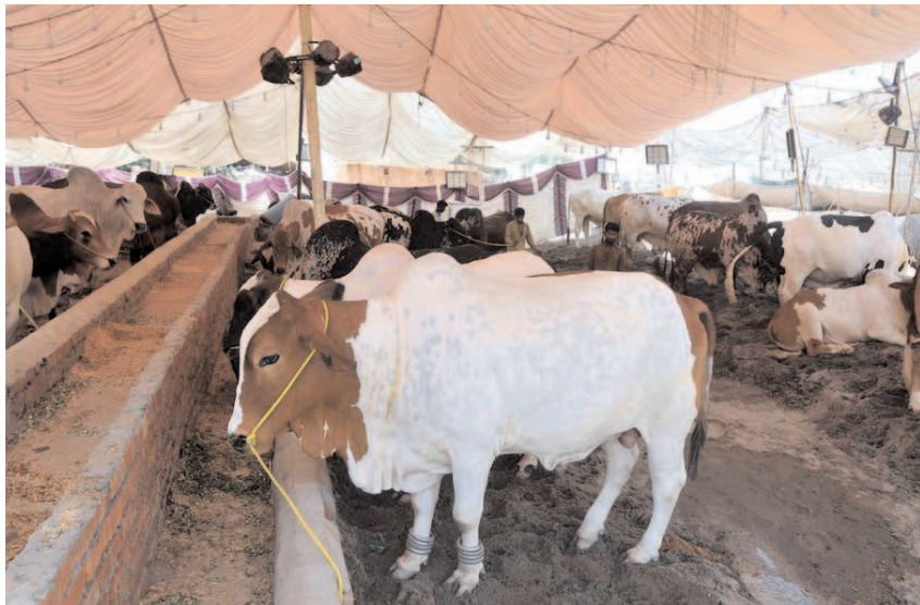
MULTAN: Vendors displaying sacrificial animals to attract customers at cattle market.

Chairman Ibrahim Qureshi highlighted that while Pakistan requires 1.5 to 2 million new jobs annually, the current economic structure lacks the capacity to deliver without SME empowerment. “The SME sector was the hardest hit during the COVID-19 pandemic and has yet to fully recover. Government financing to SMEs still accounts for less than 7% of total private sector lending, and SME borrowers remain below 250,000 nationwide. This must change,” he said.