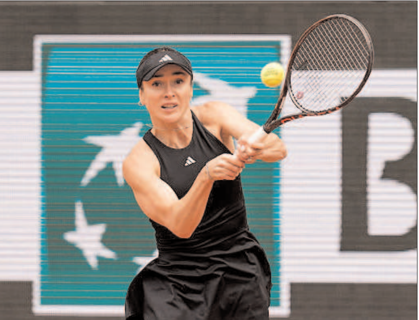
PARIS: Elina Svitolina of Ukraine during Roland Garros 2025 day 8 at Roland Garros.

has dominated since her first title in 2020. "Well it was tough you know, first set I felt like I was playing against Jannik Sinner," said Swiatek. "I needed to do something to get back in the game, but with her playing like that I didn't feel like I had much hope." Rybakina hardly put a foot wrong in the first set as she raced into a 5-0 lead, with fifth seed Swiatek finally getting on the scoreboard after a lengthy service game before the world number 11 served out. But the 24-year-old showed her fighting spirit to level up the second set after being broken in the first game by Rybakina. She racked up double-faults on crucial points in the fifth game, but managed to secure a vital hold, which turned the tide of the match. The five-time major winner then broke to love in the very next game, before forcing a decider. Swiatek seized the advantage in the seventh game of the third set, but another untimely double-fault by the Pole in the next game restored parity. At 5-5, Swiatek made her move as she broke Rybakina to 15, before holding for a gritty win. Swiatek now holds a 5-4 head-to-head record over Rybakina, after claiming her first victory against the 25-year-old on the red dirt.