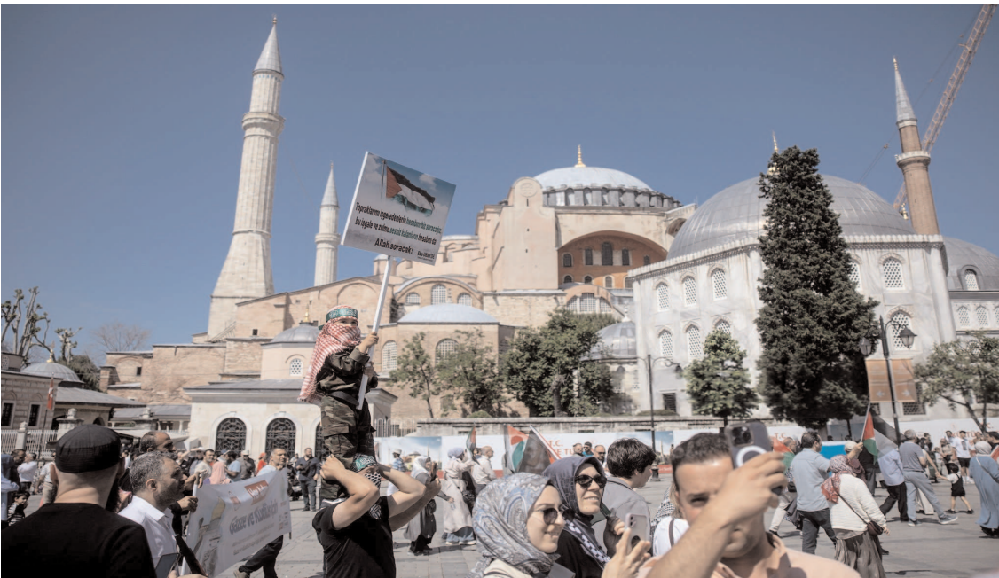
ISTANBUL, TURKEY: People chant slogans and carry signs during a protest to express support for Palestinians in Gaza outside the Hagia Sophia Grand Mosque on Sunday in Istanbul.

for a review of the 2013 high court order banning it. Sunday's decision comes after the Supreme Court on May 27 overturned a conviction against a key leader of Jamaat-e-Islami, A.T.M. Azharul Islam. Islam had been sentenced to death in 2014 for rape, murder and genocide during Bangladesh's 1971 war of independence from Pakistan. Jamaat-e-Islami supported Islamabad during the war, a role that still sparks anger among many Bangladeshis today. They were rivals of Hasina's father, Sheikh Mujibur Rahman of the Awami League, who would become Bangladesh's founding figure. Hasina banned Jamaat-e-Islami during her tenure and cracked down on its leaders. In May, Bangladesh's interim government banned the Awami League, pending the outcome of a trial over its crackdown on mass protests that prompted her ouster last year.