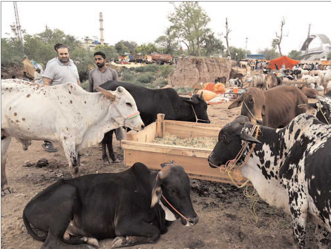
ISLAMABAD: A worker feeds sacrificial animals at the cattle market near Expressway ahead of Eid-ul-Adha.

ISLAMABAD (PPI): A coordinated operation by Islamabad Police led to the arrest of 14 individuals, including five on the run, seizing a significant cache of drugs and weapons, police said Sunday. Teams from various police stations, including Kohisar, Margalla, and Shalimar, apprehended nine suspects linked to criminal activities, confiscating 632 grams of heroin, 520 grams of hashish, 210 grams of ice, 30 bottles of liquor, four pistols, and three rifles. Authorities have registered cases against those detained, with investigations underway. In a concurrent campaign targeting proclaimed offenders and absconders, police teams successfully captured five fugitives. Inspector General of Police Syed Ali Nasir Rizvi emphasized the force's commitment to maintaining peace in Islamabad, highlighting ongoing efforts to combat crime. The police reassured residents that safeguarding lives and property remains their primary mission. Residents are encouraged to report suspicious activities to local police stations or through the "Pucar-15" emergency helpline to aid in crime prevention through community collaboration.