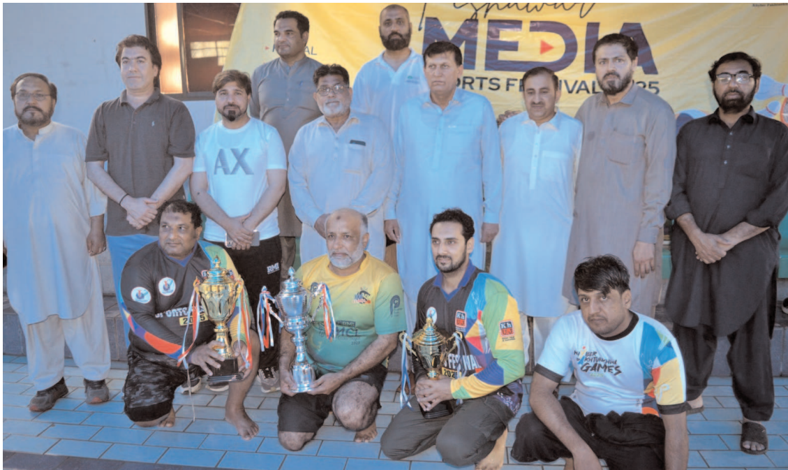
PESHAWAR: Winners of the Swimming competition of the ongoing Media Sports Festival organized by Khyber Union of Journalists and Sports Writers Association Khyber Pakhtunkhwa posing for the photographers at the end of the swimming competitions.