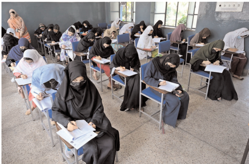
PESHAWAR: Matric students from across the province appear in Goodwill and CUSIT Tatent Scholarship Test organized by Peshawar Model Degree College.