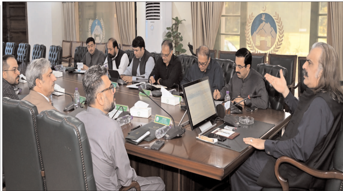
PESHAWAR: Chief Minister Khyber Pakhtunkhwa, Ali Amin Khan Gandapur chairing meeting regarding upcoming Annual Development Programme.

President Asif Ali Zardari was also presented a memento by Chairman PCB Mohsin Naqvi.