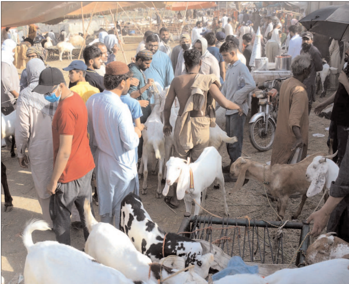
LAHORE: People visiting Manawa Cattle Market for buying sacrificial animals ahead of Eid-ul-Adha.