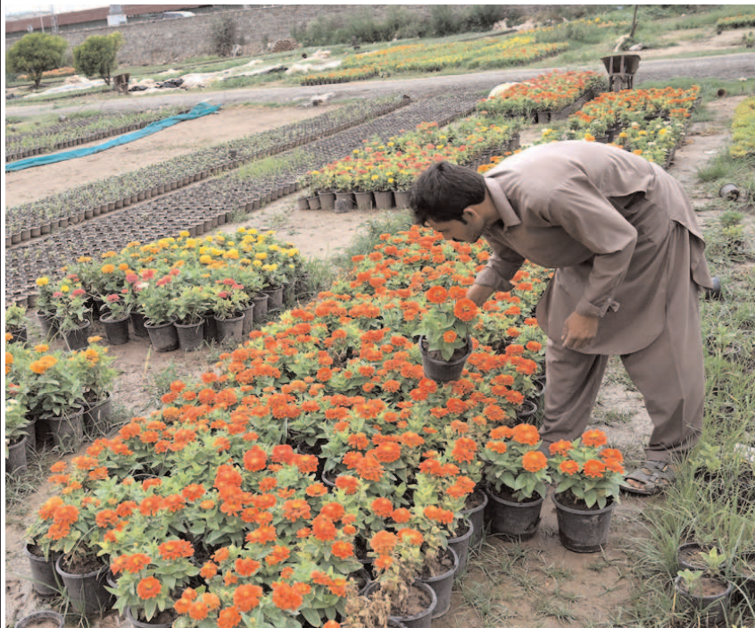
ISLAMABAD: A worker arranging flower plants at local nursery near H-9 in the Federal Capital.

DIG said protecting the lives and property of citizens is the top priority, and all officers must maintain proper check and balance on their subordinates while ensuring the welfare of the force during the Eid holidays.