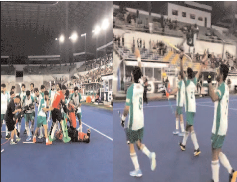
Pakistan team celebrates after defeating France in the semifinal of the FIH Hockey Nations Cup in Kuala Lumpur, Malaysia, June 20.