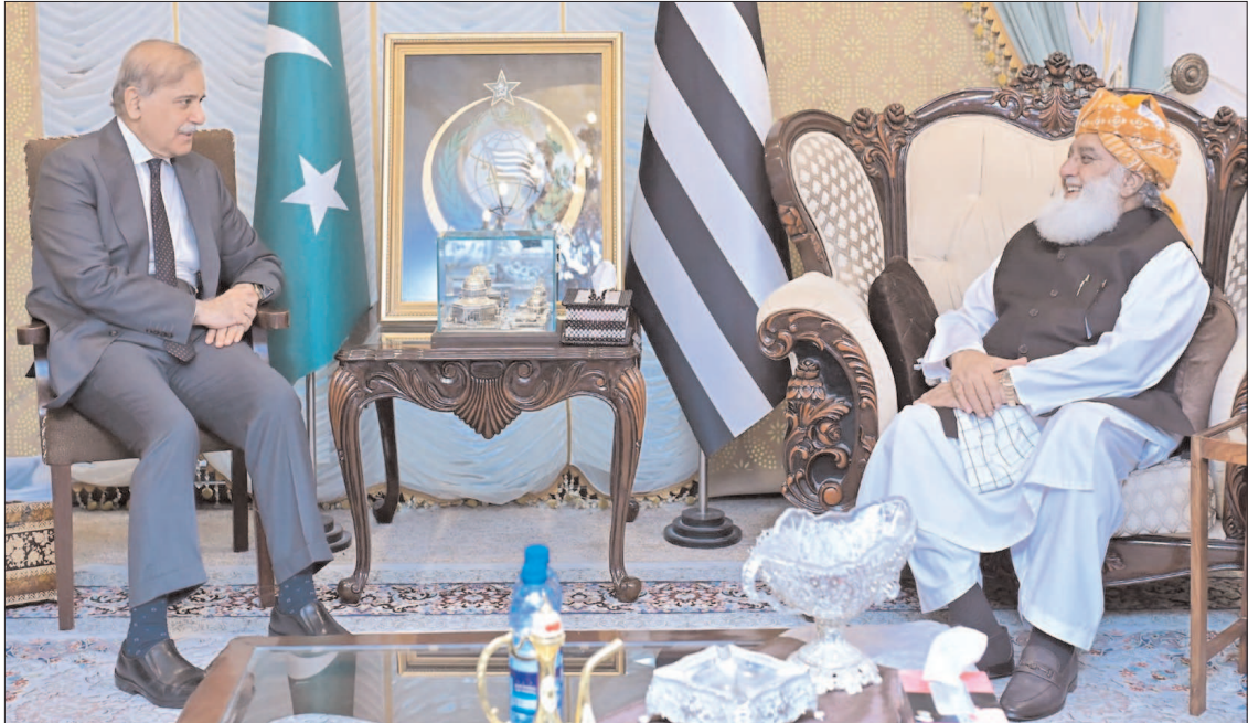
ISLAMABAD: Prime Minister Shehbaz Sharif meeting with Chief of Jamiat Ulema-e-Islam (F), Maulana Fazlur Rahman.