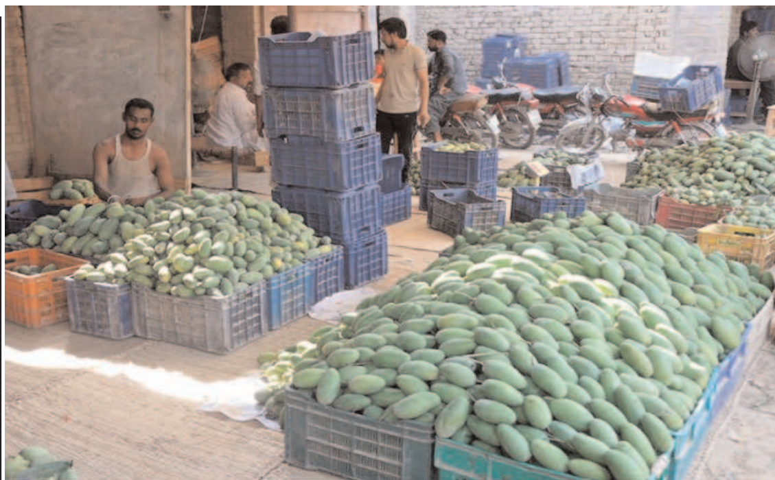
MULTAN: Workers sort freshly harvested premium-quality mangoes and pack them into plastic crates at a local market to meet high seasonal demand

The Skardu International Airport Upgradation Project represents a major milestone in the development of Gilgit-Baltistan and will open new opportunities for growth, prosperity, and global integration.