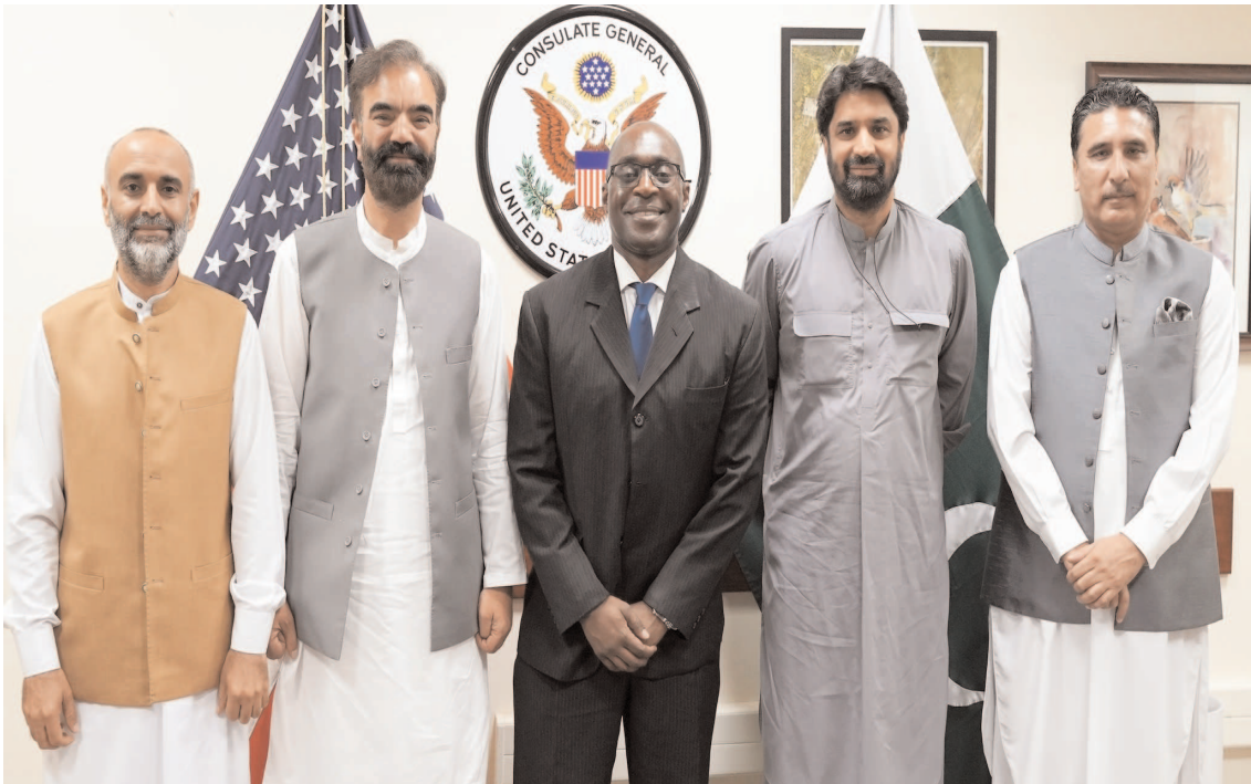
PESHAWAR: Consul General Shante Moore met with a group of business and political leaders from Khyber Pakhtunkhwa, including Provincial Minister of Labor Fazal Shakoor Khan, Additional Secretary of Information (PML-N) Arbab Khizar Hayat, former KP Assembly Member Syed Mazhar Ali Shah, and former Mayor Kohat Gohar Ali to discuss different aspects of the U.S.-Pakistan bilateral relationship as it pertains to Khyber Pakhtunkhwa, with emphasis on strengthening economic and commercial ties.