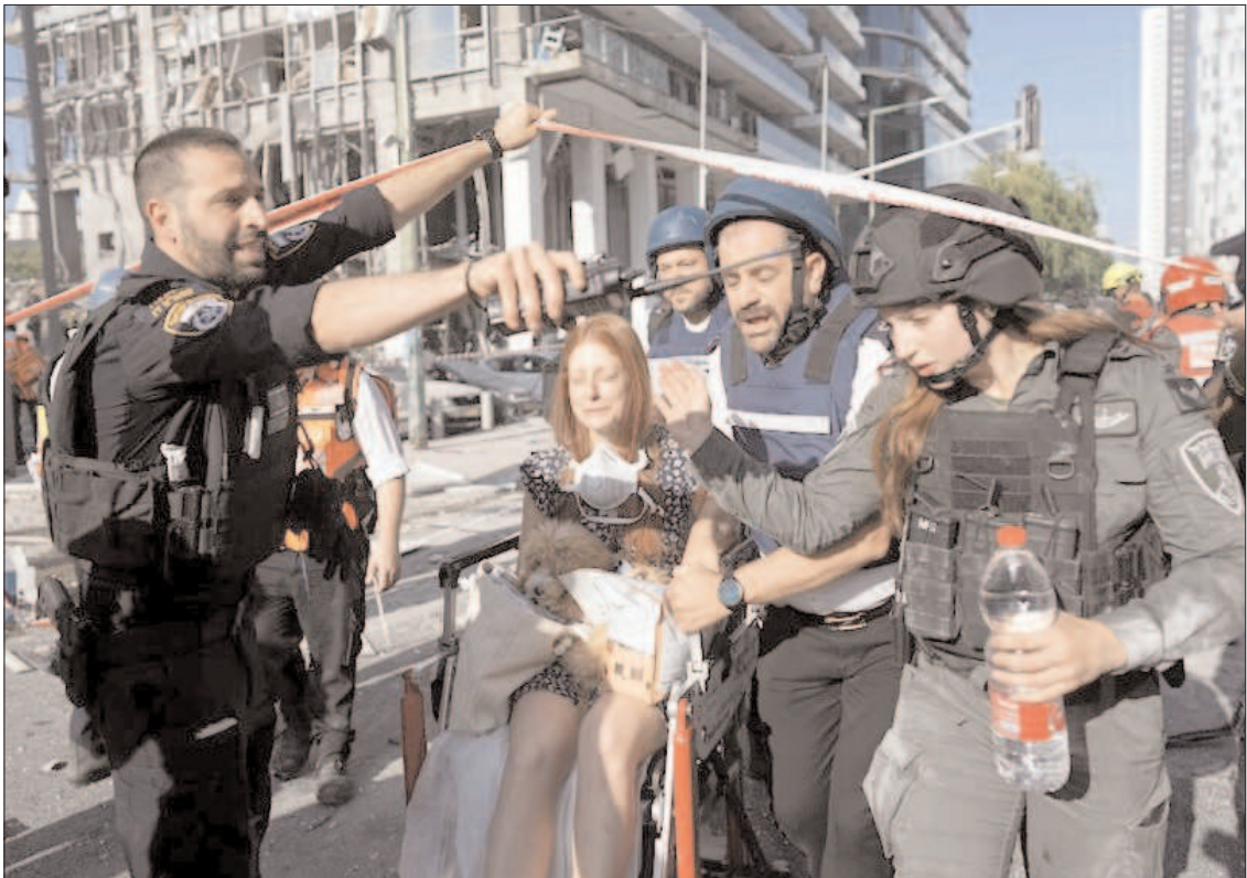
TEL AVIV: A woman evacuated from the site of a direct hit from an Iranian missile strike in Ramat Gan, Israel.