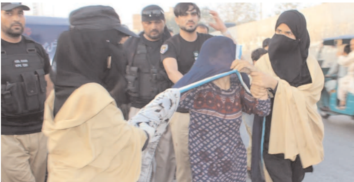
PESHAWAR: Female police arresting a woman drug addict to shift her to rehabilitation center as part of Drug-Free Peshawar campaign.

significantly reducing the visible presence of drug users in the city. Commissioner Riaz Khan Mehsum expressed satisfaction over the progress and issued directives to continue the operation until every addict has been rehabilitated. He also expressed his determination to make Peshawar the first drug-free city in Pakistan by the end of the campaign’s fourth phase.