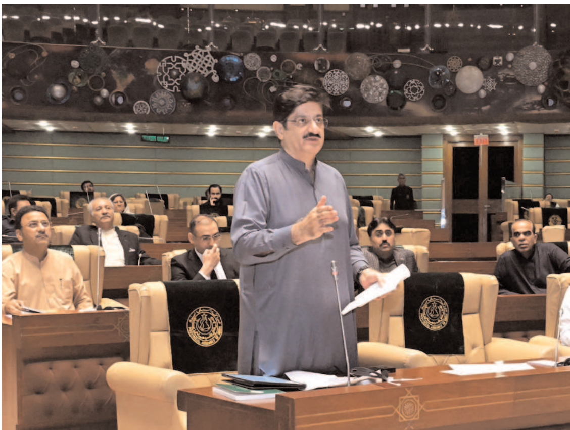
KARACHI: Sindh Chief Minister Syed Murad Ali Shah speaks on the floor of the provincial Assembly during the budget session.