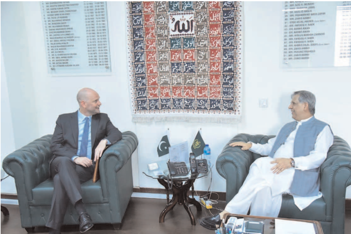
ISLAMABAD: H.E. Idesbald Van der Gracht, Ambassador of the Kingdom of Belgium, met with Senator Azam Nazeer Tarar, Federal Minister for Law and Human Rights, to review bilateral cooperation and Pakistan's recent legal and human rights reforms.

RAWALPINDI (APP): The New Town Police on Friday nabbed two accused involved in robbery cases. An amount of Rs 31,000 snatched from the citizens was recovered from the detained persons, the Rawalpindi Police spokesman said.