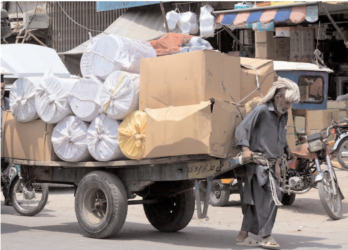
ISLAMABAD: An elderly man pulls an overloaded cart with his full force through Raja Bazaar to earn a livelihood for his family under burning sun as temperatures soar in the city.

“My community is protesting. I request the interior minister to immediately contact Sindh government and took quick action over this incident,” he said. “I cannot face my people in Sindh if immediate action is not taken.” He said the Prime Minister Shehbaz Sharif and PML-N leader Nawaz Sharif, have always advocated for interfaith harmony and equal protection for all citizens.