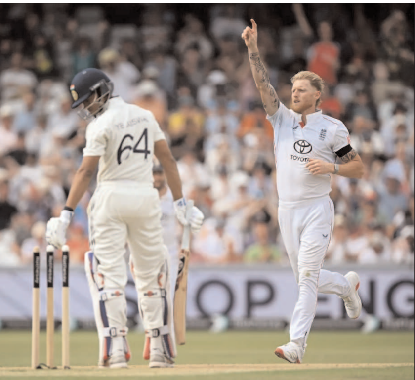
LEEDS: Ben Stokes sends Yashasvi Jaiswal back.

a league-best 68 regular-season games -- pulled their starters after falling behind by 30 going into the fourth quarter. They'll be searching for answers as the series heads back to Oklahoma City for game seven on Sunday -- the first game seven in the championship series since 2016. The Thunder are seeking their first title since the franchise relocated to Oklahoma City in 2008, having won it all in 1979 as the Seattle SuperSonics. The Pacers are in search of a first NBA title. They won American Basketball Association titles in 1970, 1972 and 1973 before joining the NBA as part of the ABA-NBA merger in 1976. One game "You know, we've got one game," Haliburton said. "All cards on the table. It's going to be a lot of fun." For a few minutes, it looked like the Thunder might roll to the title. The Pacers missed their first eight shots and fell into a quick eight-point hole. But they settled in to connect on six straight attempts and took the lead on a three-pointer from Nembhard midway through the first quarter. Indiana piled on the pressure with a pair of three-pointers and a trey from Haliburton -- his first basket of the night -- pushing their lead to as many as nine points.