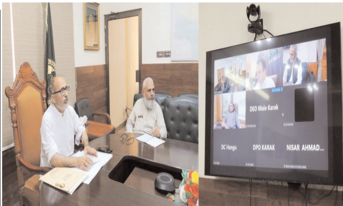
KOHAT: Commissioner Kohat Division Syed Motasim Billah Shah chairing a high-level meeting on the need, importance and usefulness of the use of helmets and seat belts.

The Chief Minister ordered that the ongoing cleanliness campaign under the "Safa Quetta Program" would be expanded and be made more effective.