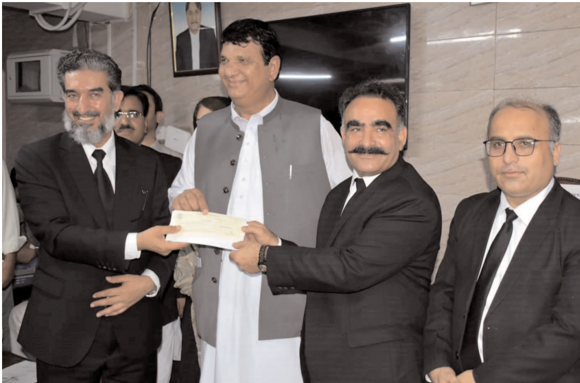
PESHAWAR: Federal Minister for Kashmir Affairs, Gilgit-Baltistan and SAFRON, Engineer Amir Muqam giving away a cheque of Rs10million to members of PHCBA.

In conclusion, he stated that his office is always open for lawyers and promised never to disappoint them. He appealed to the public, lawyers, and all institutions to unite for the development and stability of Pakistan.