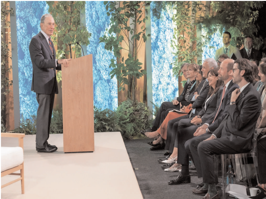
LONDON, ENGLAND: Former Mayor of New York, Michael R. Bloomberg speaks during the "Leading with Impact" event, as part of London Climate Action Week at Bloomberg London on Tuesday in London, England.