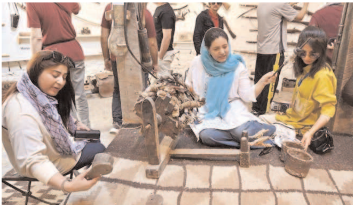
CHITRAL: Female visitors taking interest in on display items at Heritage Museum Lasapur.