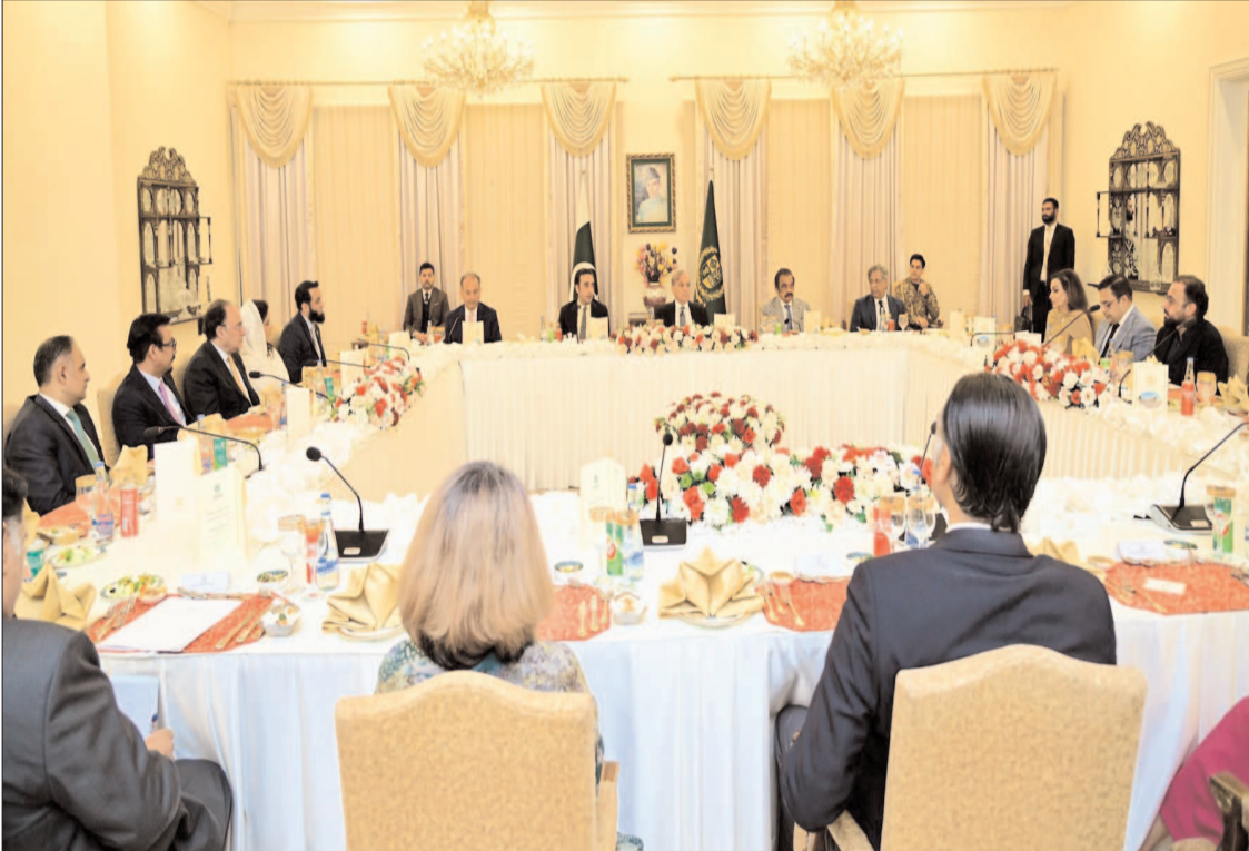
ISLAMABAD: Prime Minister Muhammad Shehbaz Sharif hosting a dinner in honour of high level diplomatic delegation headed by PPP Chairman Bilawal Bhutto Zardari that recently visited important world capitals to highlight Pakistan's perspective on the recent Indian aggression.

Emergency response units are advised to stay on alert for possible rescue and evacuation operations. Public is encouraged to stay informed by regularly checking weather updates and downloading the "Pak NDMA Disaster Alert" mobile application for real-time information and advisories.