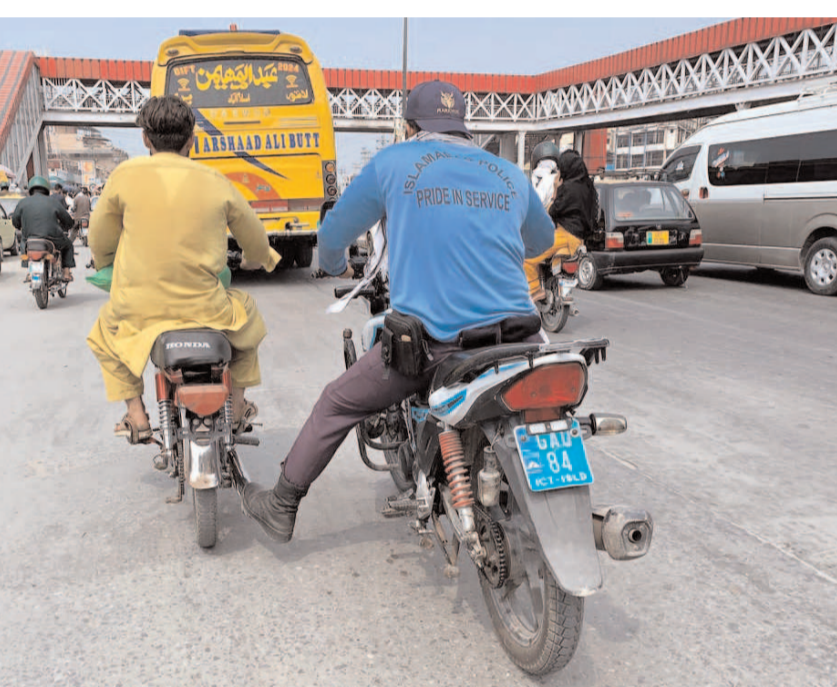
ISLAMABAD: A police official on motorcycle helps an out of order motorcyclist by pushing with his foot to reach his destination.

Earlier, the Saudi delegation arrived at Parliament House, where they received a warm welcome from the Senate Chairman. The delegation's head thanked Gilani for the hospitality and said Pakistan holds a key place in the region. He added that both countries highly value their strong bilateral ties and wide-ranging cooperation.