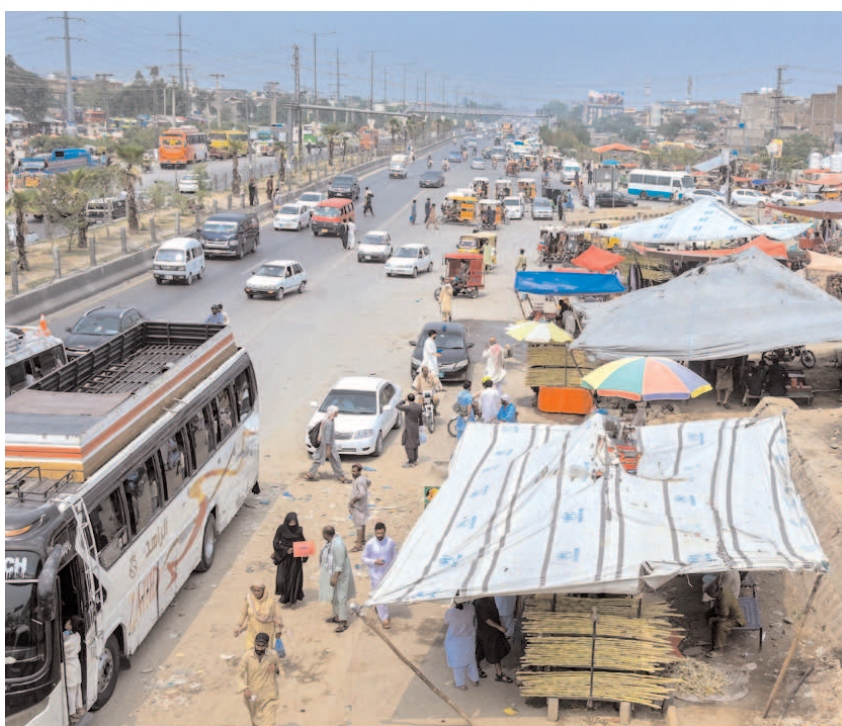
RAWALPINDI: Vendors have occupied the Pirwadhai bus stop, forcing vehicles to stand on the road and disrupting traffic flow – a situation that demands immediate attention from authorities.

"We are ready to respond to any situation and ensure the safety of the public," he added.