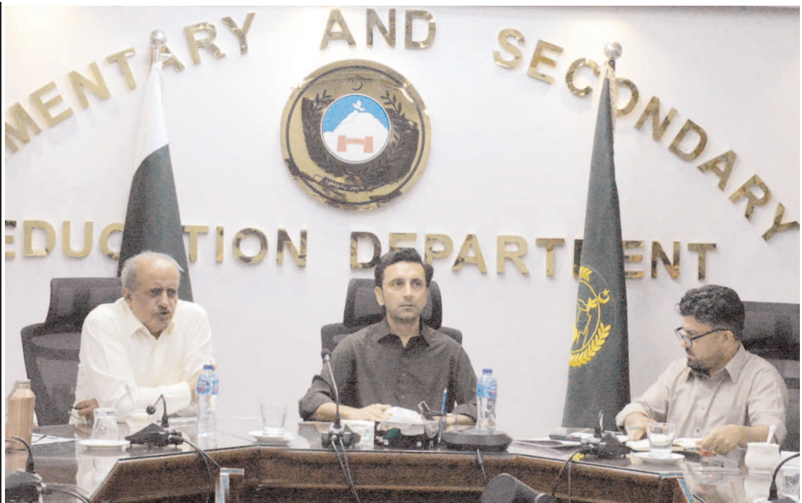
PESHAWAR: Provincial Minister for Education Faisal Khan Tarakai chairing meeting regarding appointments of teachers.

On this occasion, Special Assistant for Transport Rangez Khan stated that the subsidies offered in the policy for two- and three-wheeled electric vehicles would benefit low-income individuals, provided that charging stations are made available in rural areas. He proposed that all procedures related to the establishment of EV charging stations be completed through a one-window operation to facilitate both investors and consumers.