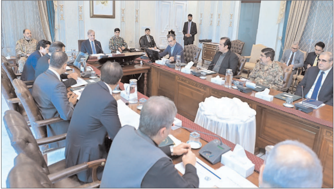
ISLAMABAD: Prime Minister Shehbaz Sharif chairing a meeting on power sector reforms.