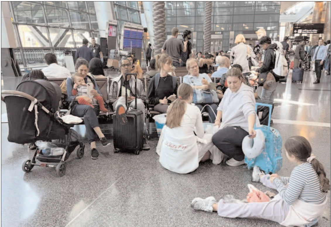
DOHA: People sitting at Hamad International Airport after Qatar reopened its airspace following a brief closure in the wake of Iran's missile attack on Al Udeid Air Base in Qatar.