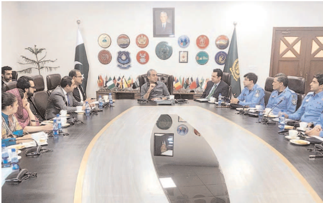
ISLAMABAD: Interior Minister Mohsin Nagvi chairing a meeting regarding arrangements during Muharram in Islamabad.

RAWALPINDI (APP): The Rawalpindi Waste Management Company (RWMC) conducted extensive cleaning and desilting operations throughout the city during the recent rainfall to ensure the smooth operation of the drainage system. According to the RWMC spokesperson, the Company's special teams remained actively engaged in cleaning drains, manholes, and drainage channels in various parts of the city. With the help of heavy machinery and manual workforce, mud, stones, plastic and other waste materials were removed to ensure uninterrupted water flow during rainfall. Under this campaign, a special cleanliness operation was underway in commercial areas, residential localities, markets, parks, and densely populated zones. He said that Company officers and field staff were inspecting daily and promptly identifying and resolving drainage-related issues. Highlighting the importance of public cooperation, RWMC has appealed to citizens to avoid dumping garbage, construction debris, or household waste into drains, as such practices clog the drainage system, resulting in stagnant water and potentially causing urban flooding. He said that social and mobilisation teams were distributing pamphlets, making announcements in mosques, and engaging community leaders in various areas to create awareness about the importance of cleanliness.