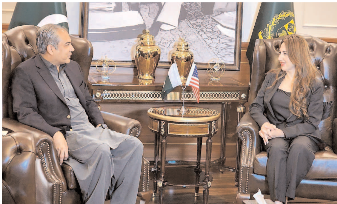
ISLAMABAD: Federal Minister for Interior Mohsin Naqvi in a meeting with Acting US Ambassador Natalie Baker in federal capital.

The meeting concluded on a positive note, with both sides reaffirming their commitment to expanding cooperation in security, counterterrorism, drug control, and regional peace-building efforts.