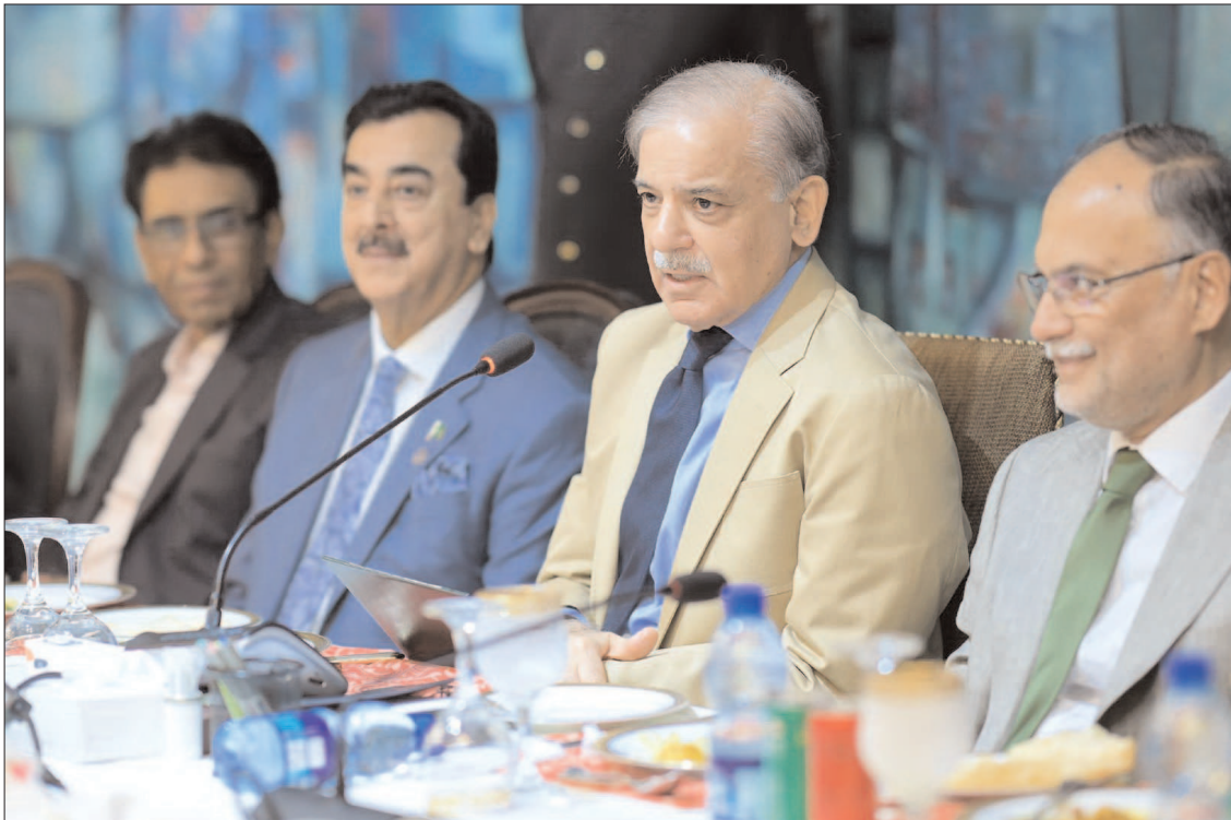
ISLAMABAD: Prime Minister Shehbaz Sharif addressing parliamentarians after passing of Finance Bill 2025-26.