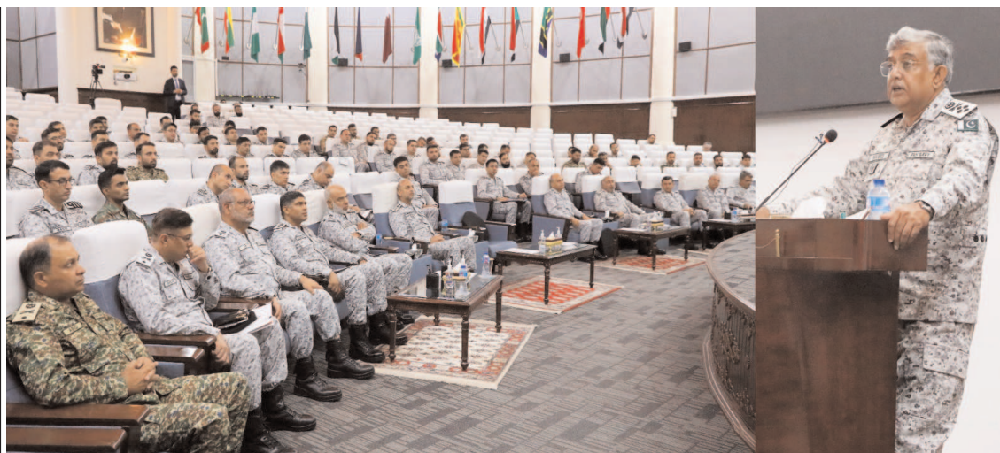
LAHORE: Chief of the Naval Staff Admiral Naveed Ashraf addressing the course participants of 54th PN Staff Course at Pakistan Navy War College.

He further stated that the people of Karachi deserve access to world-class transportation facilities, which is a key part of the Pakistan Peoples Party's service manifesto.