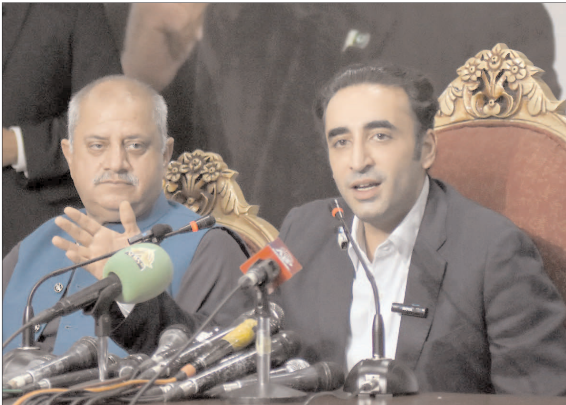
ISLAMABAD: Chairman Pakistan People's Party Bilawal Bhutto Zardari addressing during meet the press at National Press Club.