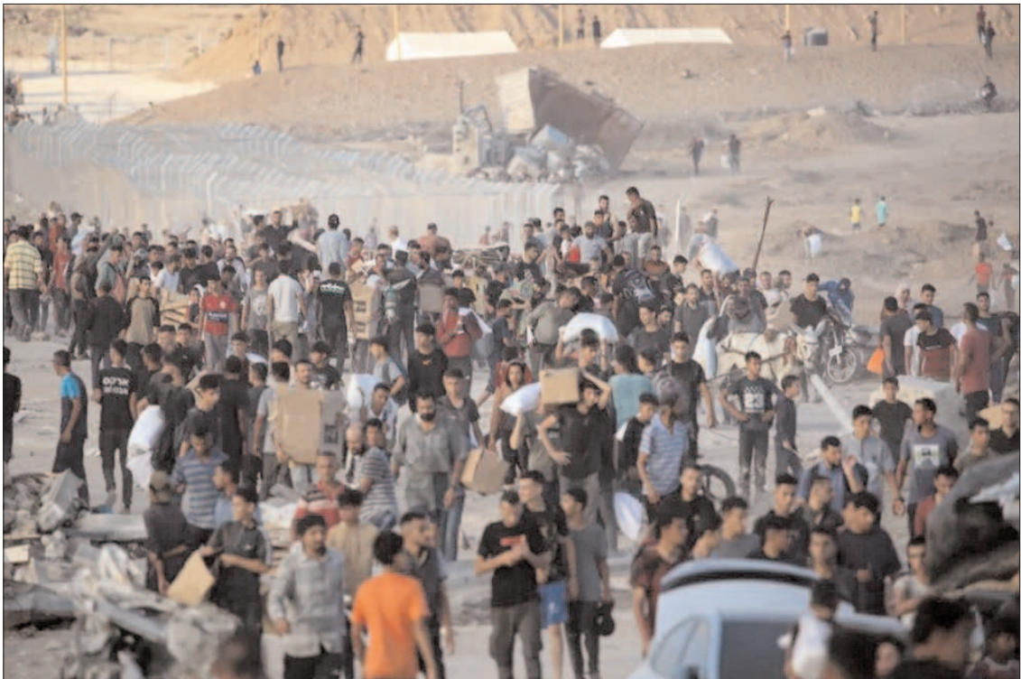
GAZA: Palestinians gathered at an aid distribution point set up by the US-backed Gaza Humanitarian Foundation, near the Nuseirat refugee camp.