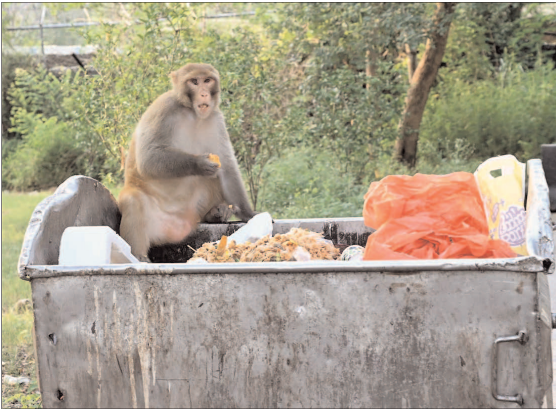
ISLAMABAD: A monkey eating food after picking from garbage container near Margalla Hills in the Federal Capital.

RAWALPINDI (APP): As per the vision of Punjab Chief Minister Maryam Nawaz Sharif, the City Traffic Police (CTP) Rawalpindi has established a special Anti-Beggars Squad to end begging in public places and provide a cleaner, safer environment for citizens. According to CTP spokesman, beggars were found at key locations in the city, including Mall Road, Murree Road, and Old Airport Road. Their presence not only disrupted the smooth flow of traffic but also posed a security risk. On the instructions of Chief Traffic Officer (CTO) Rawalpindi Beenish Fatima, the dedicated squad has started mega operations against begging across the city. So far, 16 beggars including men and women have been booked during the campaign, while 04 underage children found begging were handed over to the Child Protection Bureau for care and rehabilitation. "The operations are conducting daily so that the social problem of begging can be controlled," said CTO Beenish Fatima. "Beggings is a social issue that disturbs the public and also leads to the exploitation of children.