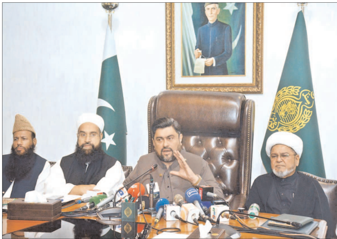
KARACHI: Sindh Governor Kamran Khan Tessori addressing a press conference after chairing a meeting with Ulema regarding the law and order situation in Muharram ul Haram at Governor House.

PRI is an essential driver striving for Pakistan's financial independence and diversion from reliance on international debt and forex assistance.