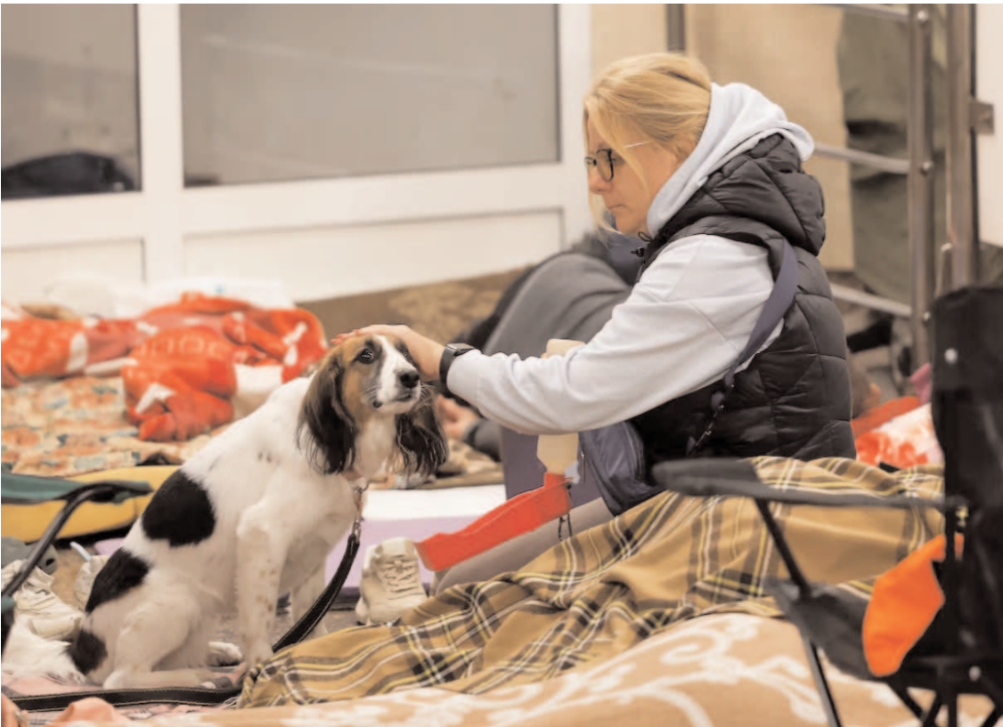
Kyiv: A woman pets a dog as she takes shelter inside a metro station during a Russian military strike, amid Russia's attack on Ukraine, in Kyiv, Ukraine on Sunday.