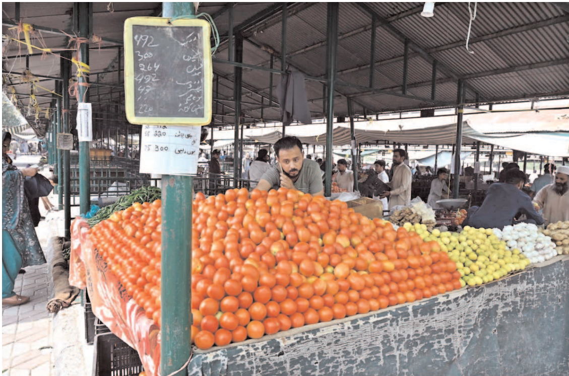
ISLAMABAD: A vendor arranging and displaying vegetables to attract customers at Sunday Bazaar in Aabpara.

During his stay in Xinjiang, the Ambassador also met different levels of Xinjiang leadership, interacted with Chinese enterprises and media, and visited the Urumqi branch of Habib Bank Limited.