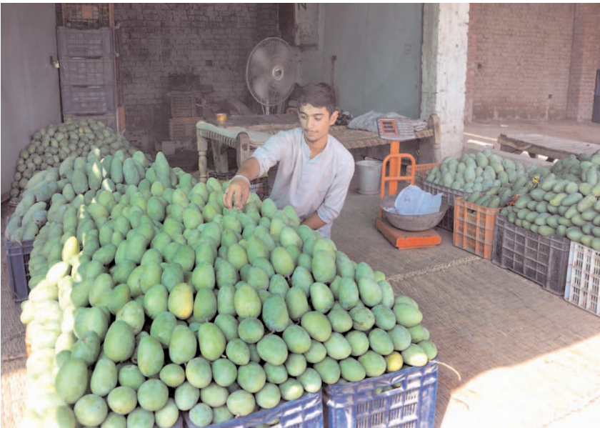
MULTAN: A vendor displaying freshly harvested mangoes to attract customers at market.

The officials assured the delegation that all points would be considered, and cooperation would be provided. The meeting aimed to improve rail services and address the concerns of passengers and traders in Sukkur.