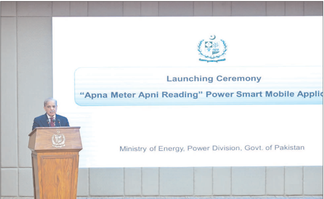
ISLAMABAD: Prime Minister Muhammad Shehbaz Sharif addressing the launching ceremony of Apna Meter Apni Reading-Power Smart Mobile Application.

due to solarization in the country. He said that they were fully cognizant of these challenges and were exploring ways to take the country on the path of progress, besides ensuring to further reduce the power tariff for the industrial or household consumers. Minister for Energy Power Division Sardar Awaiz Ahmed Khan Leghari, addressing the ceremony, said they were depending upon the use of latest technology to ensure transparency and provide relief to the consumers. He said overbilling was a big issue and they were able to reimburse billions of rupees to consumers charged in this regard. Meter readers’ mechanism was now handed over to consumers through the developed app, he added. Meanwhile, the Ministry of Power Division has introduced the Power Smart App under the “Apna Meter, Apni Reading” initiative to make electricity consumers directly part of the system and promote transparency in the billing process. The App was formally launched by Prime Minister Muhammad Shehbaz Sharif on Sunday, said the spokesperson of the power division. The app enables consumers to take a photograph of their electricity meter on a specified date and upload it to the App. Based on this user-submitted image, monthly electricity bills will