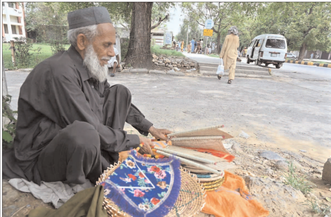
ISLAMABAD: An elderly vendor displaying handmade items while sitting at roadside to attract the customers in Federal Capital.

He emphasized that the CM's vision encompasses a wide range of initiatives including e-challan cameras, cycle tracks, eco-friendly transport solutions, route optimization with transport companies and fitness programs, all designed to create a safer, more sustainable and tech-driven transportation network in Punjab, with a focus on reducing accidents and improving public health across the province.