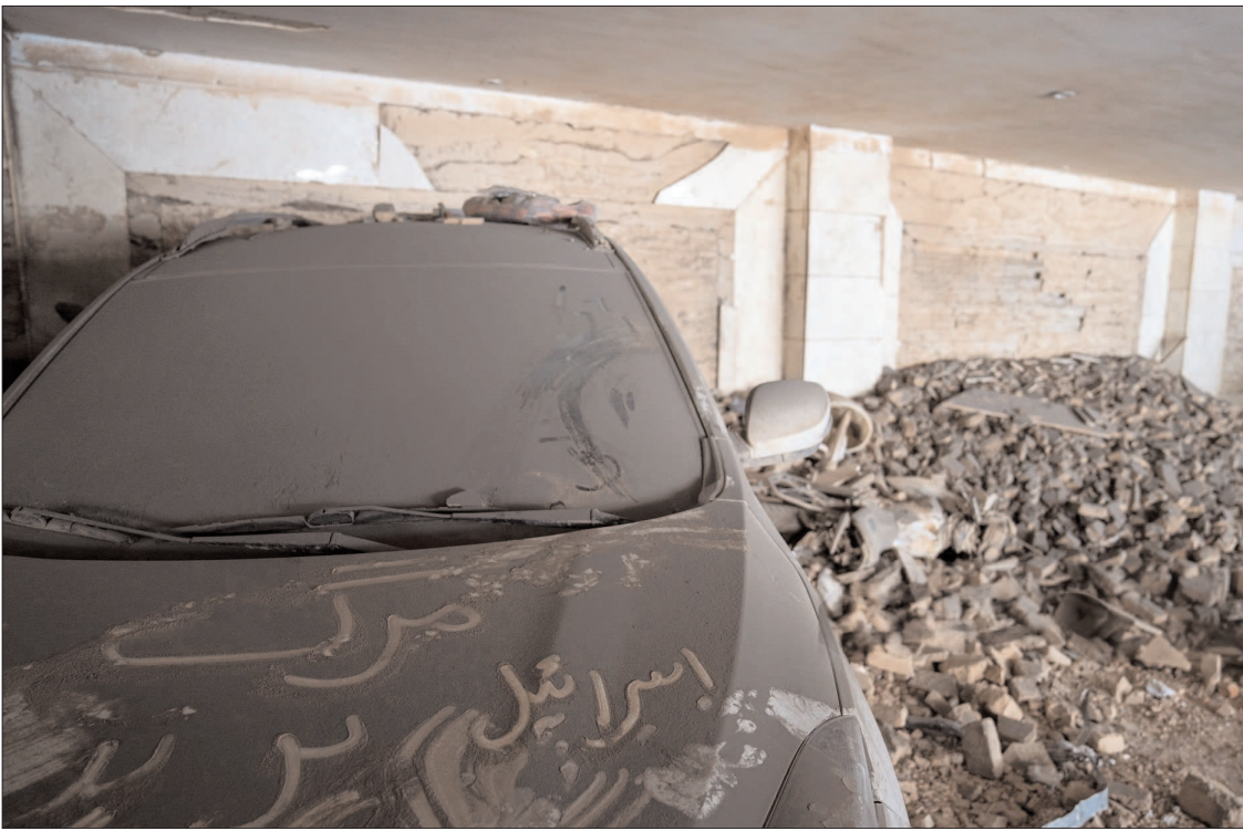
TEHRAN, IRAN: A damaged car is seen amid the destruction of a residential property, in northern Tehran, Iran, after it was hit during an Israeli airstrike on the last day of the fighting between Israel and Iran last week. Iranians have been surveying the damage in Tehran following 12 days of trading aerial attacks with Israel, after the latter launched a preemptive strike on Iran's nuclear program, military leadership and other sites starting on June 13.

For real-time alerts and preparedness guidelines, download the Pak NDMA Disaster Alert App and follow NDMA's official communication channels.