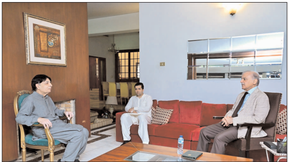
RAWALPINDI : Muhammad Shehbaz Sharif Sunday visited

political leader Chaudhry Nisar at his residence. In the meeting, the prime minister inquired about Chaudhry Nisar’s well-being. They discussed the national and international situation during the meeting. The meeting took place in a very pleasant atmosphere and both the leaders revived memories of the past.