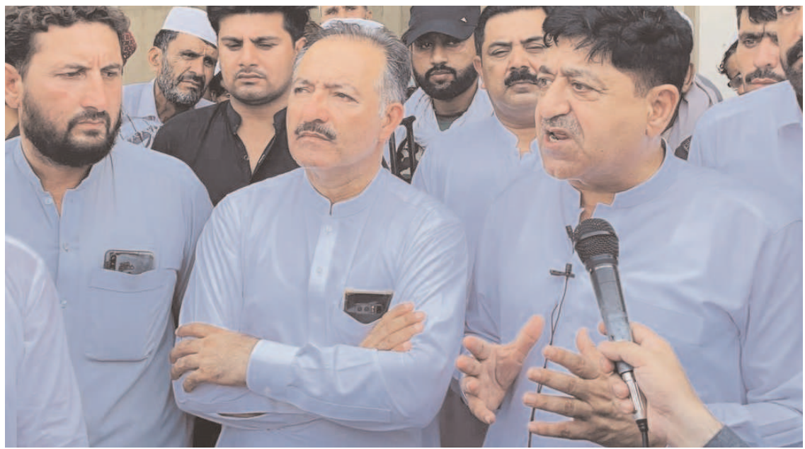
MARDAN: Provincial Minister for Food Zahir Shah Toru talking to media.