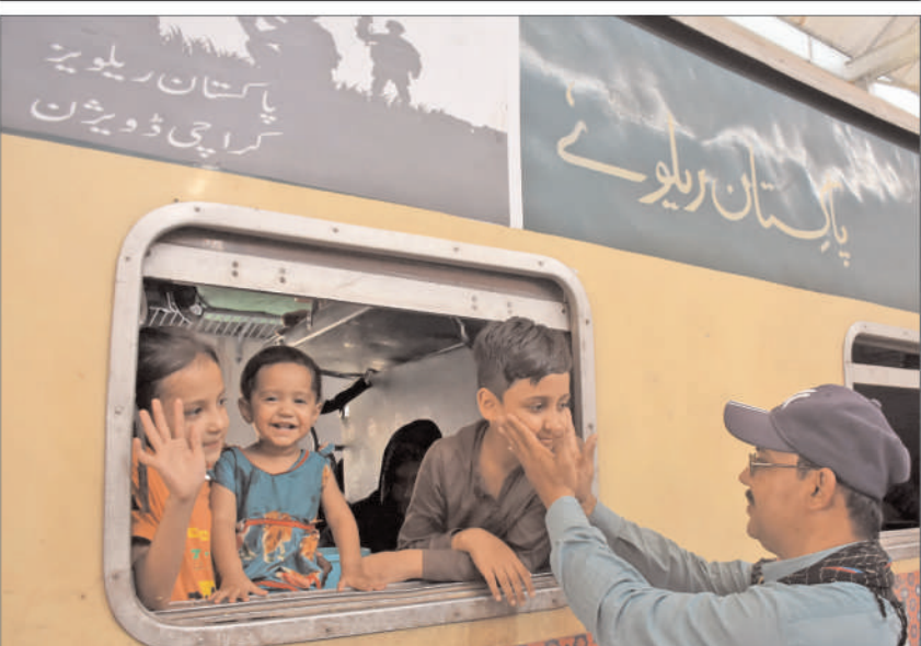
LAHORE: People leaving towards their native villages for celebrating Eidul Azha.

In recent years, the United States has identified China as its top geopolitical rival and the only country in the world able to challenge the US economically and militarily. Despite this and repeated trade threats and tariff announcements, Trump has spoken admiringly of Xi, including of the Chinese leader's toughness and ability to stay in power without the term limits imposed on US presidents.