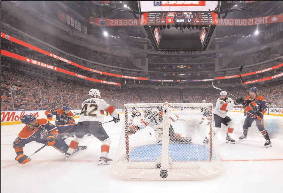
EDMONTON, CANADA: Leon Draisaitl #29 of the Edmonton Oilers scores a goal on Sergei Bobrovsky #72 of the Florida Panthers during the first period in Game One of the 2025 Stanley Cup Final at Rogers Place in Edmonton, Alberta, Canada.

while in the colours of Barca. He has actually won two La Liga titles, as he played once as a 15-year-old in 2022-23. But in the space of two years his influence has grown significantly as Yamal, who has already passed 100 appearances for Barcelona, scored 18 goals and made 25 assists in 55 games this season. He was named in the Champions League team of the year after some remarkable displays - including in the thrilling semi-final defeat by Inter Milan. "Lamine is the kind of talent that comes along every 50 years, and to see him up close really impressed me," said opposition manager Simone Inzaghi. "He caused us huge problems because we were supposed to double up on him and it wasn't enough." It is not just the quantity of Yamal's goals but the quality and big-game nature of them. He netted three goals in four Clasicos against Real Madrid this season, plus a fantastic strike in that epic tie against Inter. And he struck in the Nations League quarter-final against the Netherlands. The CIES Football Observatory recently valued him at 400m euros (£340m). Yamal recently signed a new six-year deal with Barca, and BBC pundit Stephen Warnock called him "a future Ballon d'Or winner". Brazil legend Ronaldo is the youngest winner of the award at the age of 21 - so Yamal has three attempts to break that record.