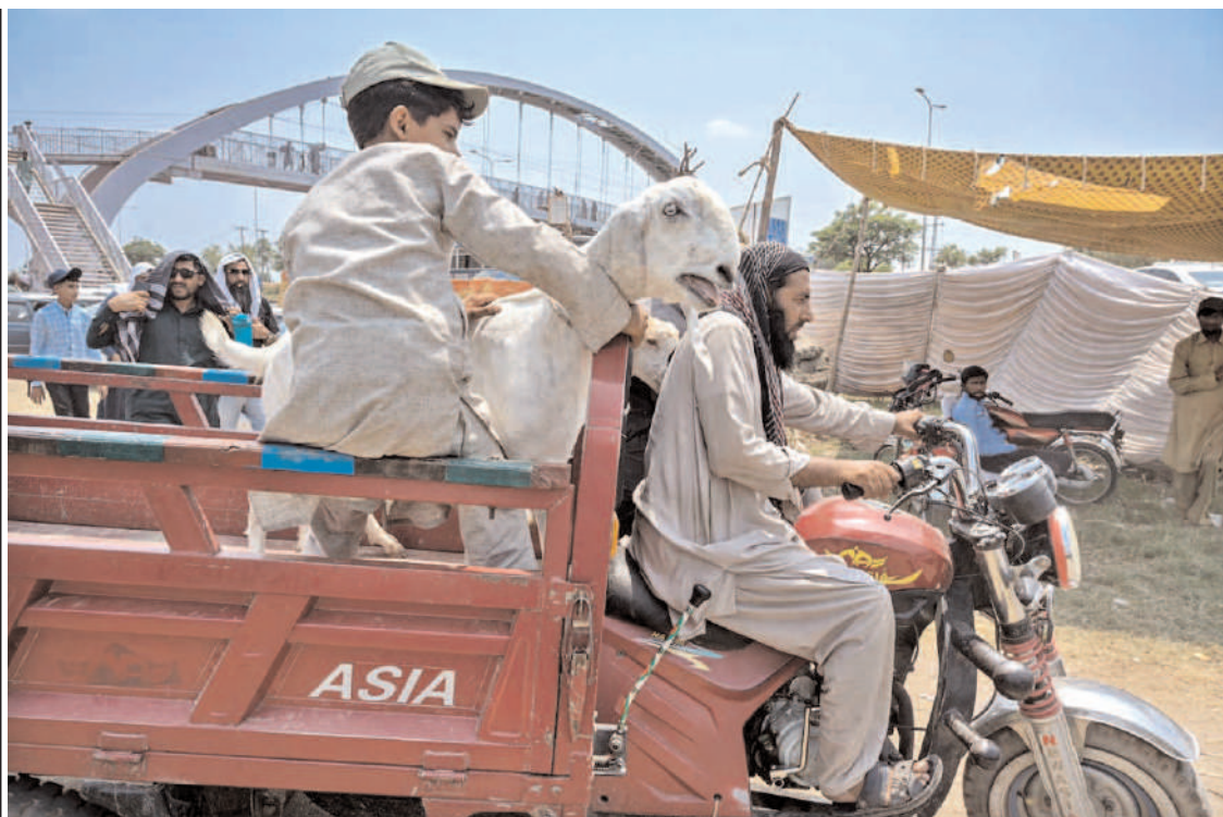
ISLAMABAD: A tricycle loader on way loaded with sacrificial animal after purchasing from Animal Market.