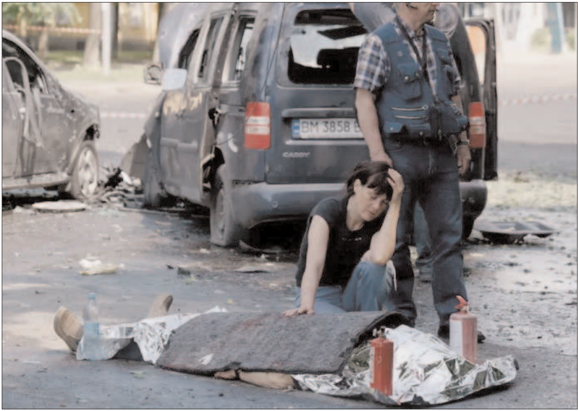
KYIV: A woman kneels by a victim of a Russian attack on the Sumy region of Ukraine.