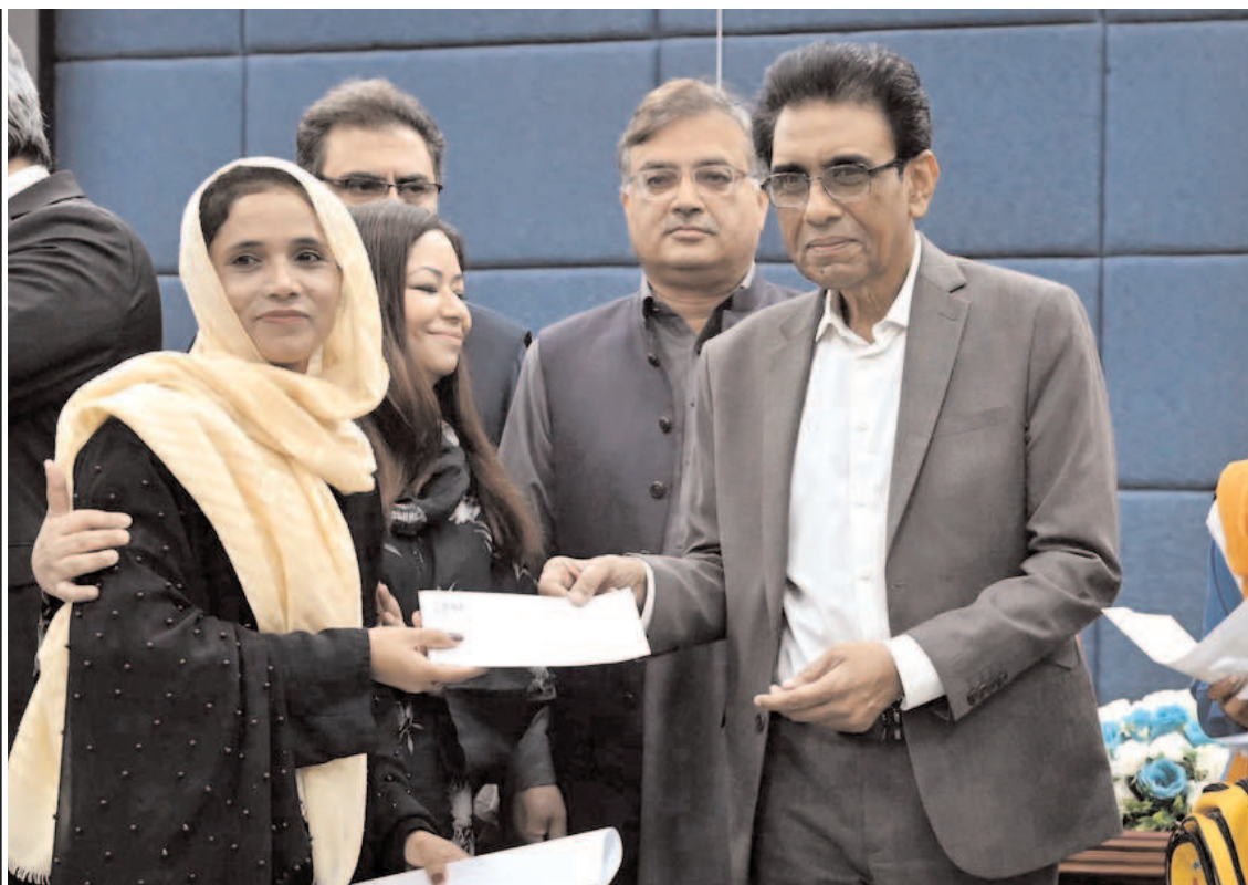
ISLAMABAD: Federal Minister Dr. Khalid Maqbool Siddiqui distributing prizes among position holders during launching ceremony of Annual Pakistan Non-Formal Education Statistical Report 2023-24.

Emphasizing the importance of helmets, the CTO noted that their use can reduce the risk of head injuries by up to 50 percent during accidents.