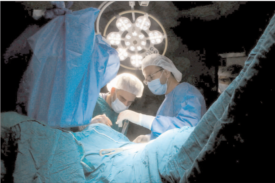
GAZA: Medical personnel working in an operating room at Nasser Hospital.

But Piperea's own group, the ECR, is split. Its largest faction, the party of Italian Prime Minister Giorgia Meloni, said it would back the EU chief. The two largest groups in parliament, the centre-right EPP and the centre-left Socialists and Democrats, have also flatly rejected the challenge, which needs two-thirds of votes cast, representing a majority of all lawmakers to pass.