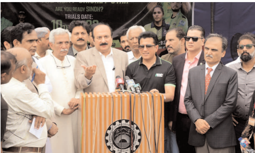
KARACHI: Chairman PM's Youth Programme Rana Mashood addressing Cricket Talent Hunt Program lunching ceremony at NED University Karachi.

The launch event at NED University marks a pivotal milestone in the national drive to empower youth through inclusive, merit-based sports initiatives - with strong backing from both government leadership and iconic figures from Pakistan's cricketing world.