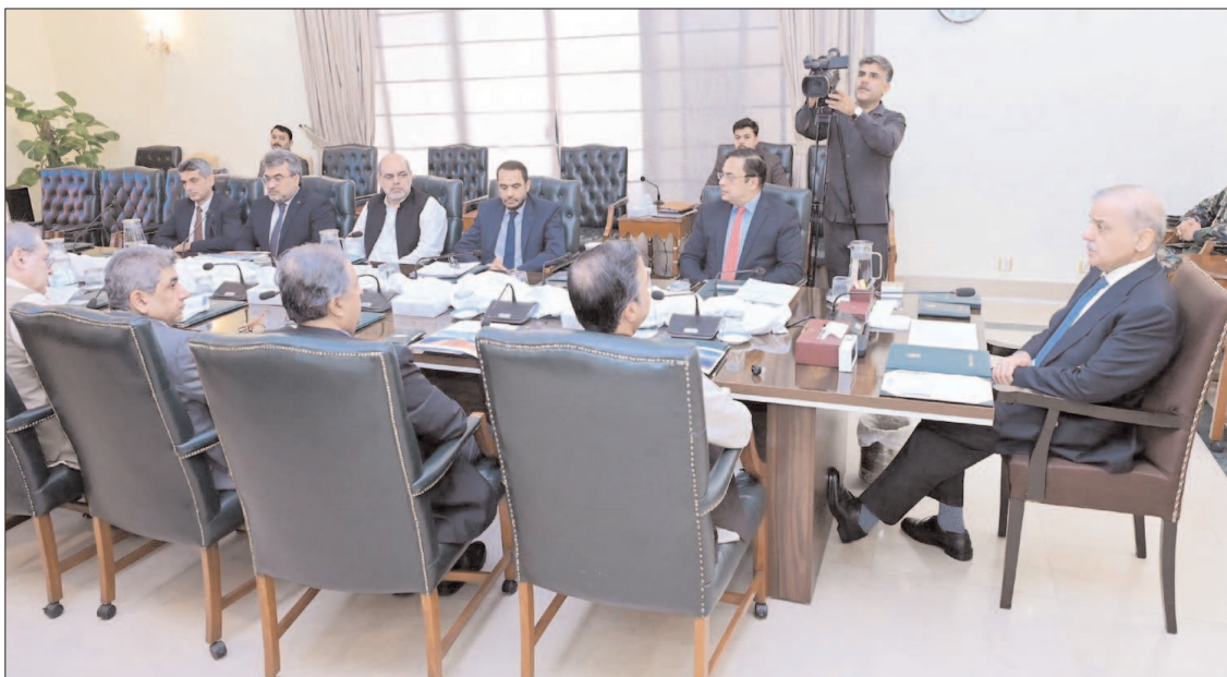
ISLAMABAD: Prime Minister Shehbaz Sharif chairing a meeting of PNSC.

However, there is an atmosphere of mourning in the Amazi area on this tragic accident and everyone is saddened by the sudden accidental death of local mrn, women and children and the atmosphere of the entire Mandanar tehsil was mournful.