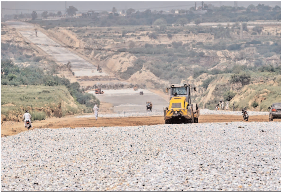
RAWALPINDI: Construction work is underway on the Rawalpindi Ring Road, also known as the Rawalpindi–Islamabad Ring Road—a 38.3-kilometer highway connecting Rawalpindi and Islamabad in Pakistan. The project, which began in March 2022, is currently under construction