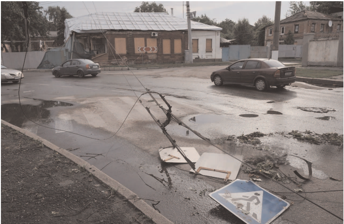
KHARKIV, UKRAINE: Power lines remain downed after the storm in Kharkiv, Ukraine. On the evening of July 12, heavy rain and gale-force winds hit Kharkiv and the region, with gusts reaching up to 20 meters per second. In the Zmiiv community, a woman died and five people were injured.

2003. He returned as premier in 2018 after leading the opposition coalition to a historic win, but his government collapsed in less than two years due to infighting.