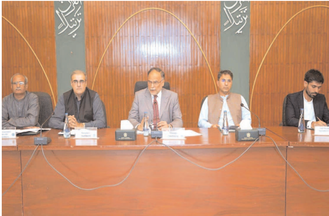
ISLAMABAD: Minister for Planning Ahsan Iqbal chairing a high-level meeting to review implementation and finalization of sectoral action plan based on Chinese Experts' Report.

He also directed that China should be formally informed about the progress made by Pakistan on the recommendations, and efforts should be made to fully capitalize on the areas and projects for which China has already expressed willingness to cooperate. The meeting marks a significant step towards deepening Pakistan-China economic cooperation and ensuring that both sides move forward with a shared understanding and commitment to mutual development goals.