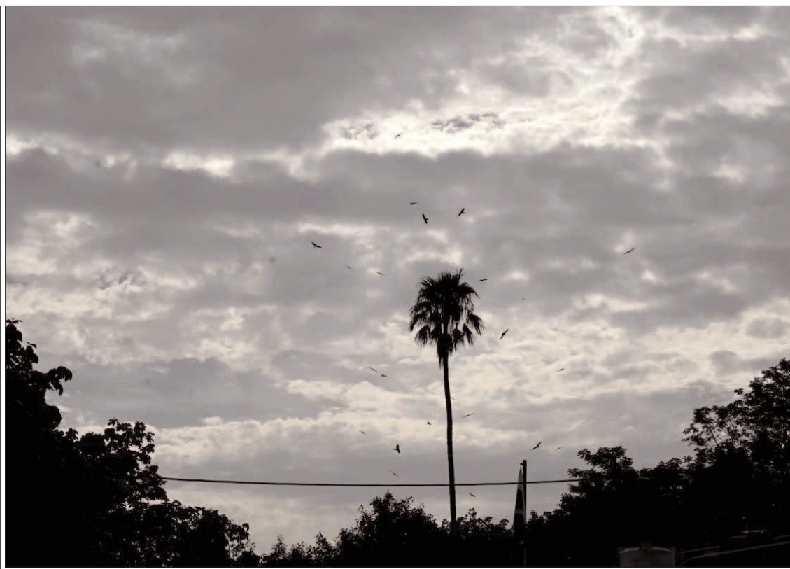
LAHORE: A view of dark clouds hovering over the sky in the Provincial Capital.