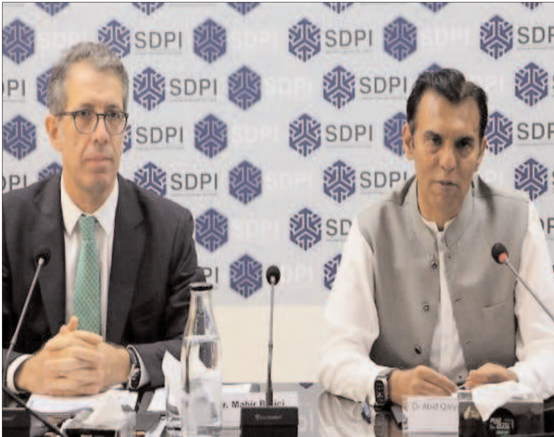
ISLAMABAD: IMF Resident Representative for Pakistan, Mahir Binici addressing a press conference.

The lecture concluded with an interactive discussion on fiscal and monetary policy frameworks, external buffers, and the role of international institutions in fostering inclusive growth.