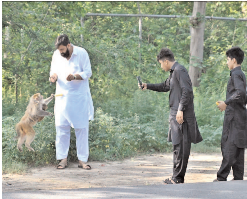
ISLAMABAD: A family captures video with their cell phones as a person feeds corn to a monkey on Margalla Road in the Federal Capital.

According to police spokesman, two stolen vehicles worth more than Rs 7.5 million have been recovered from his possession during operation.