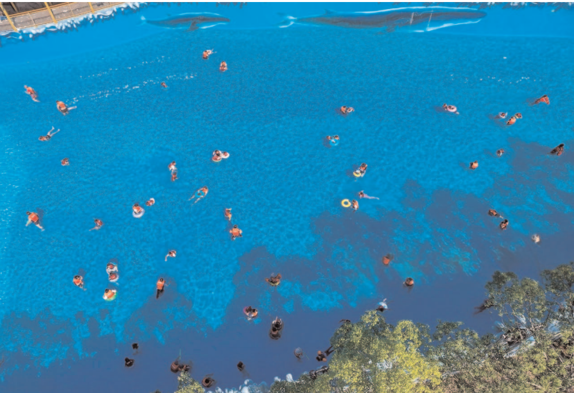
HUANGSHAN, CHINA: Aerial view of local residents enjoying the coolness at a water park in summer on Sunday in Huangshan City, Anhui Province of China.

Editorial Insight As global security threats evolve, partnerships like that between the UAE and Pakistan offer hope for joint resilience. This meeting could lay the groundwork for future agreements in areas such as: - Cybersecurity - AI-based policing - Border control technologies - Intelligence-sharing networks With both countries determined to harness technology, training, and intelligence exchange, this diplomatic engagement underscores a mutual vision for peace and stability in South Asia and the Middle East. Writer is UAE Correspondent of The Frontier Post and Member, Pakistan Journalists Forum - UAE