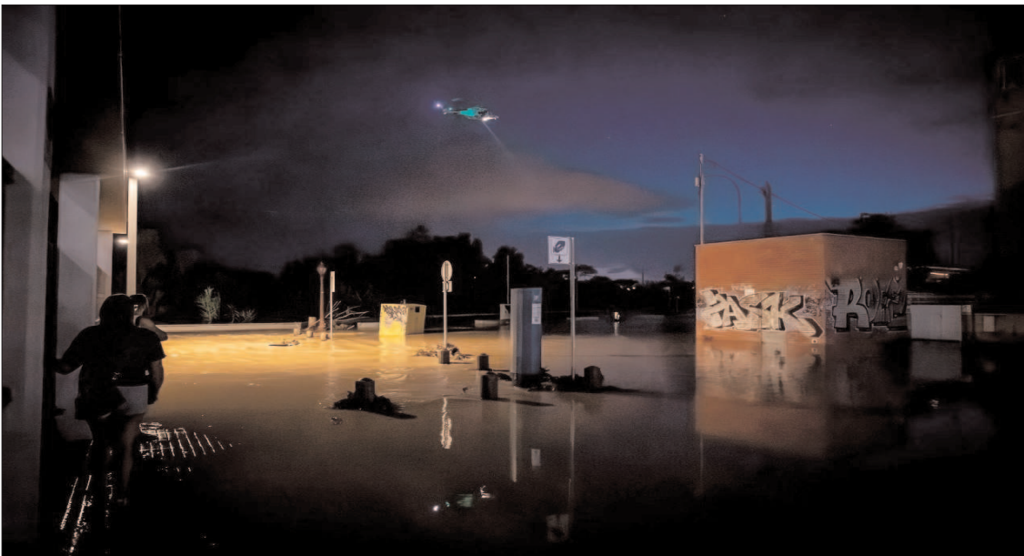
BARCELONA: Severe storms strike Catalonia, causing major damage and flooding across several towns. Two people remain missing in Cubelles, south of Barcelona, after the Foix river overflows. Emergency services deploy a large search operation in the area. The storm also affects towns like Suria, Igualada, and Vilafranca del Penedes, where the local hospital is temporarily evacuated and closed. First responders handle hundreds of incidents throughout the region as roads are cut off and rivers burst their banks.

“He’s very nice all the time, but it turns out to be meaningless.” Congress has been prepared to act on the legislation, sponsored by Republican Sen. Lindsey Graham of South Carolina and Democrat Richard Blumenthal of Connecticut, for some time. The bill has overwhelming support in the Senate, but Republican leadership has been waiting for Trump to give the green light before moving ahead with it. The White House had expressed some reservations about the legislation. Trump made clear he wants full authority over the waiver process to lift the sanctions, tariffs or other penalties, without having to cede control to Congress. Under the initial bill, the president “may terminate” the penalties under certain circumstances, but immediately reimpose them if the violations resume. Graham has said the president would be allowed to waive the sanctions, for 180 days, and could also renew a waiver.