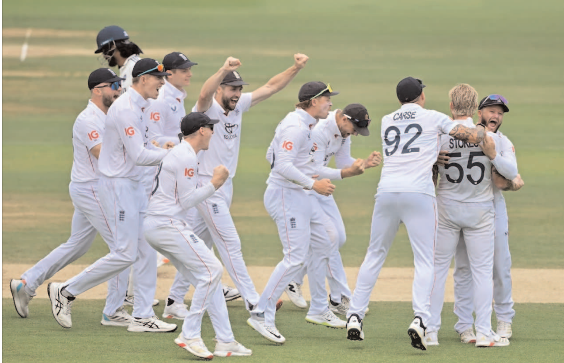
LONDON: The England fielders are ecstatic after Ben Stokes sent back KL Rahul.

But he had added just six runs to his overnight 33 when he was lbw on review to Stokes. Archer, who made his Test debut at Lord's in 2019, then reduced India to 82-7 when he held a sharp one-handed caught and bowled chance to dismiss Washington Sundar for a duck.