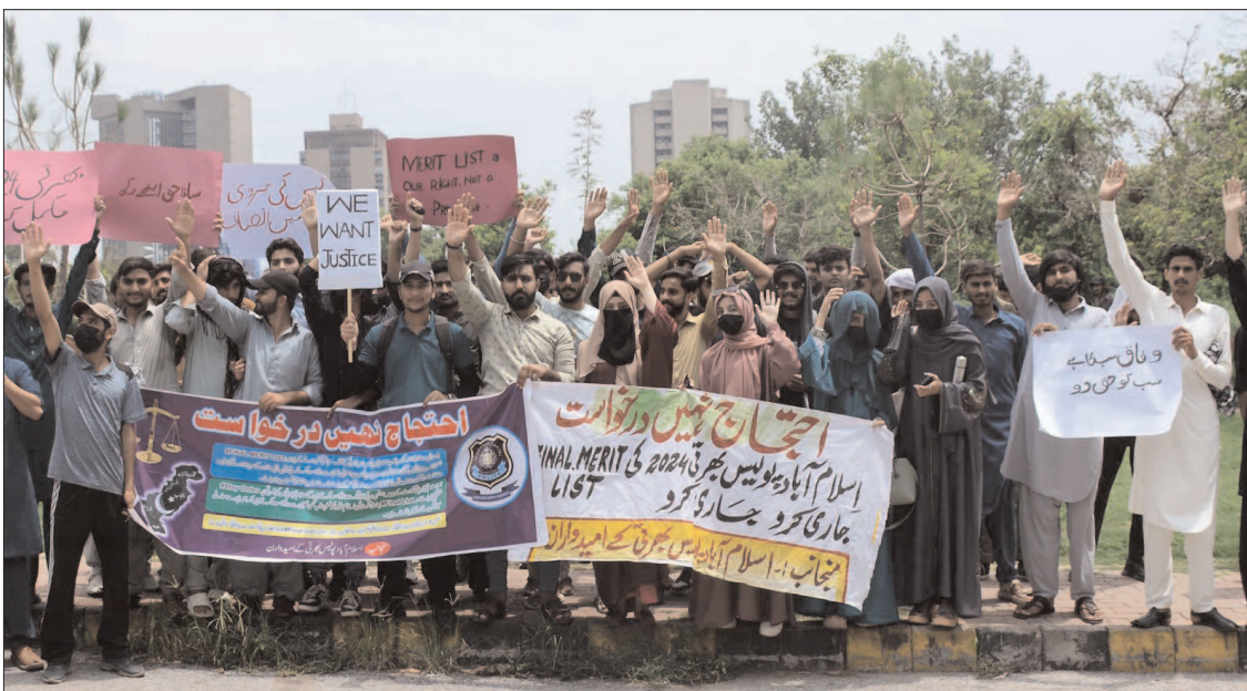
ISLAMABAD: candidates for police recruitment hold protest in favour of their demands outside NPC.

He said they were monitoring the drains across the city, where water flow at present was normal.