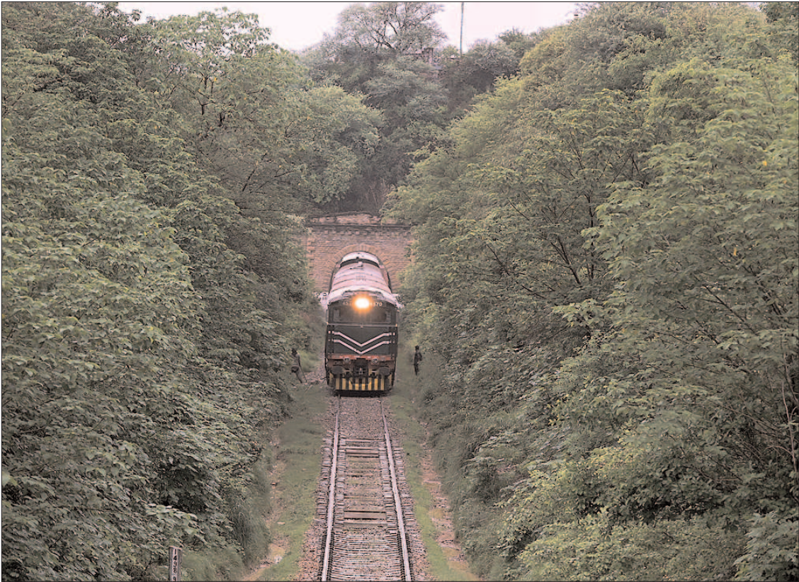
ISLAMABAD: A Pakistan Railways train from Rawalpindi to Lahore, passing through the Korang Tunnel, The tunnel is part of an integrated infrastructure - originating from the Murree Hills constructed by British engineers in 1914.