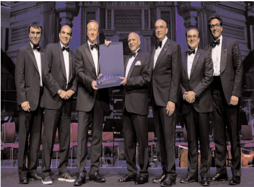
said Lord Choudrey, "Bestway's story is still

"Tonight is not only about looking back - it's about looking forward,"