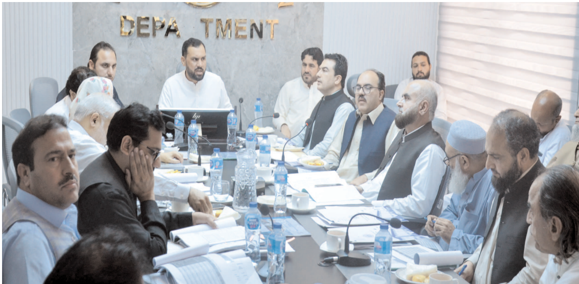
PESHAWAR: Minister for Higher Education Meena Khan Afridi chairing UET Peshawar's Senate meeting at Civil Secretariate.

other negative consequences. Law Minister Aftab Alam also highlighted the importance of restoring the eight seats in the Senate for the newly merged districts, which he referred to as an act of animosity. He stressed the need to restore these seats and also reiterated the demand for an additional 4.84% share in the NFC Award for the merged districts following their merger into Khyber Pakhtunkhwa. The participants agreed to hold further consultations on the proposed bill in an upcoming meeting.