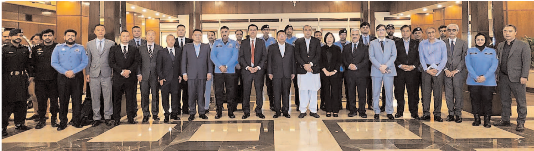
ISLAMABAD: Federal Minister for Interior Mohsin Naqvi in a group photo with high-level delegation of Beijing Police.

RAWALPINDI (APP): The Punjab Food Authority (PFA) in Rawalpindi discarded approximately 2,000 litres of adulterated and unhygienic milk early on Wednesday morning. According to the PFA spokesman, the action was taken against a milk shop located in the Khayaban-e-Sir Syed area. The shop owner was found involved in mixing dry powder with milk. A case was also registered against the accused. The PFA urged the public to lodge their complaints, if any, regarding food, bakery items or milk at 1223.