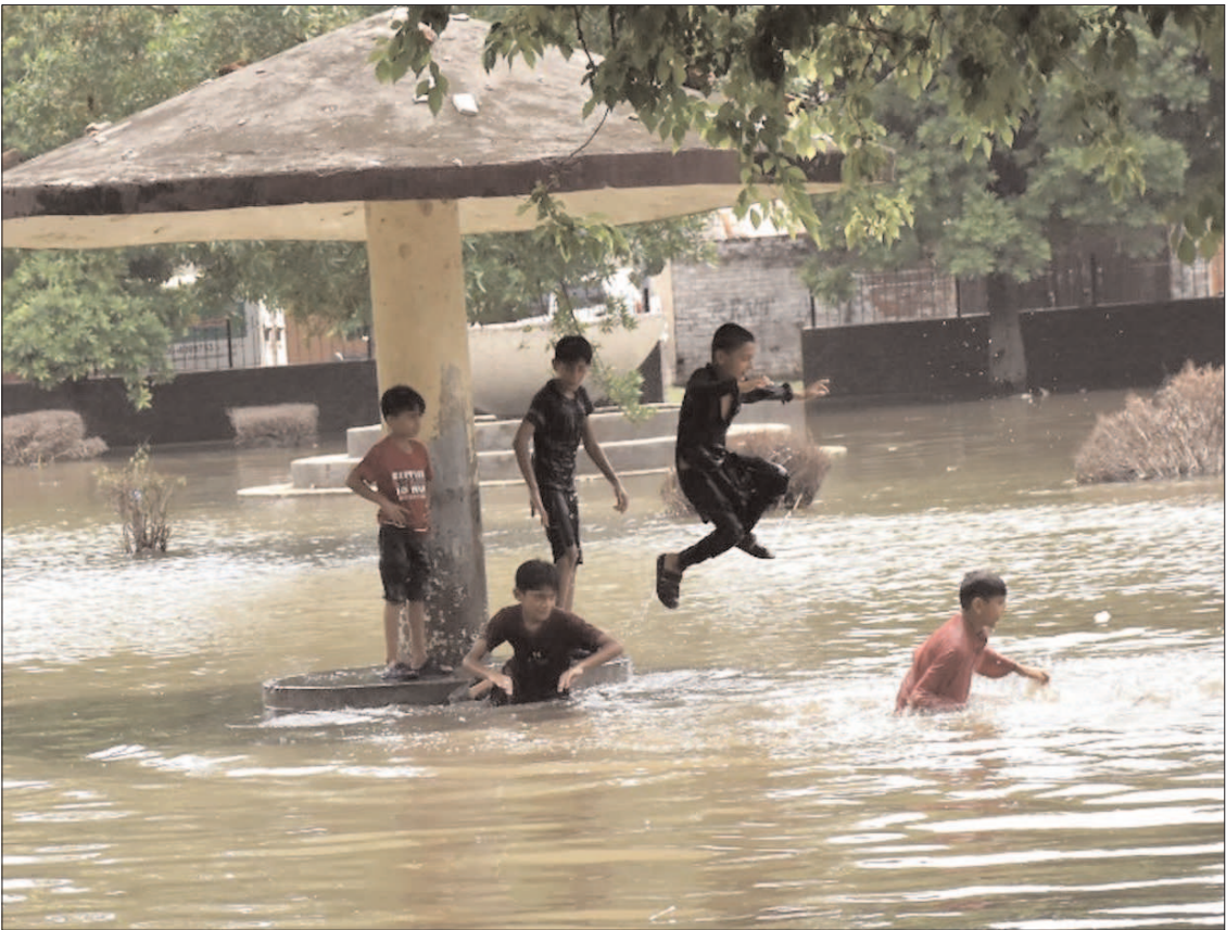
LAHORE: A view of children playing in accumulated rain water on Taj Pura scheme park.