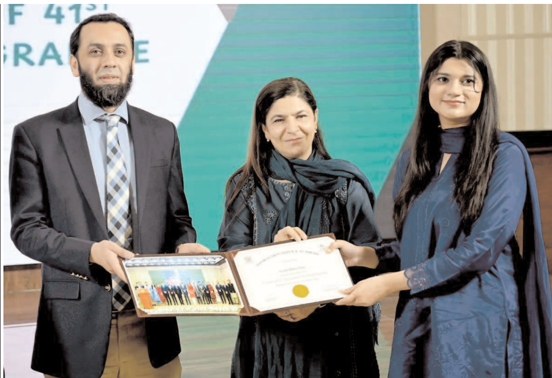
ISLAMABAD: Federal Minister for Information and Broadcasting Atta Tarar giving away certificate to a participant at passing out ceremony of 41st Specialized Training Programme at ISA.

According to official documents, the scheme offered plots in three sizes—50x90, 40x80, and 35x70—to members of Category-I, Category-II, and Category-III, respectively. The total number of plots is 6,746, of which 2,457 are reserved for registered members of Category-I (BPS 20–22), 2,259 for Category-II (BPS 18–19), and 2,030 for Category-III (BPS 16–17).