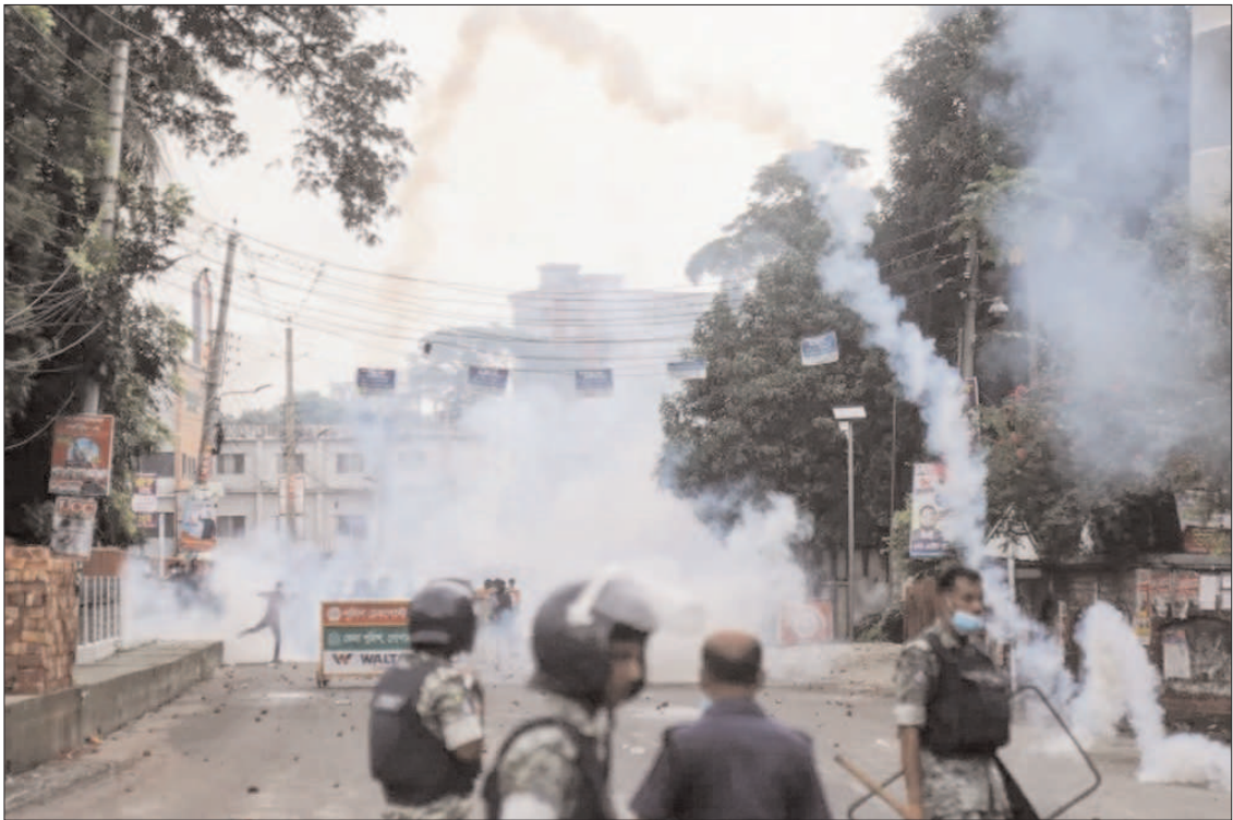
DHAKA: Security forces throwing tear gas cans and sound grenades to disperse Awami League supporters loyal to ousted leader Sheikh Hasina, who attempted to disrupt a rally being held by the new student-led National Citizens Party in Gopalganj, Bangladesh.