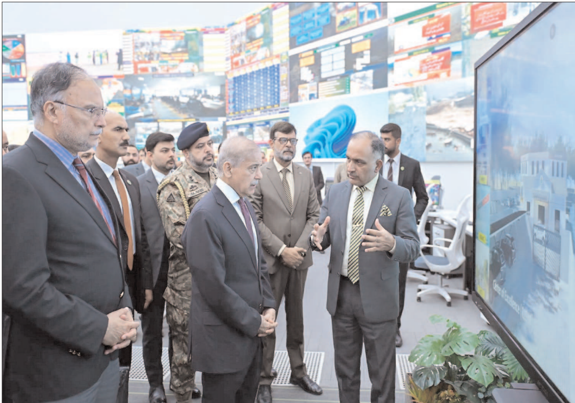
ISLAMABAD: Prime Minister Shehbaz Sharif being briefed on measures regarding recent monsoon rains and floods at National Emergencies Operations Centre.