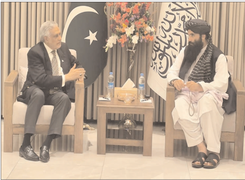
KABUL: Deputy Prime Minister, Senator Ishaq Dar exchanging views with Actig Interior Minister of Afghanistan, Sirajuddin Haqqani.

The two sides reaffirmed their aspiration to convene the 7th Strategic Dialogue in 2025, underscoring its importance in strengthening Pakistan-EU cooperation. They agreed to hold the next Political Dialogue meeting in 2026 in Islamabad. The EU delegation was headed by Olof Skoog, Deputy Secretary General of the European External Action Service and the Pakistani delegation by Amna Baloch, Foreign Secretary in the Ministry of Foreign Affairs of Pakistan.