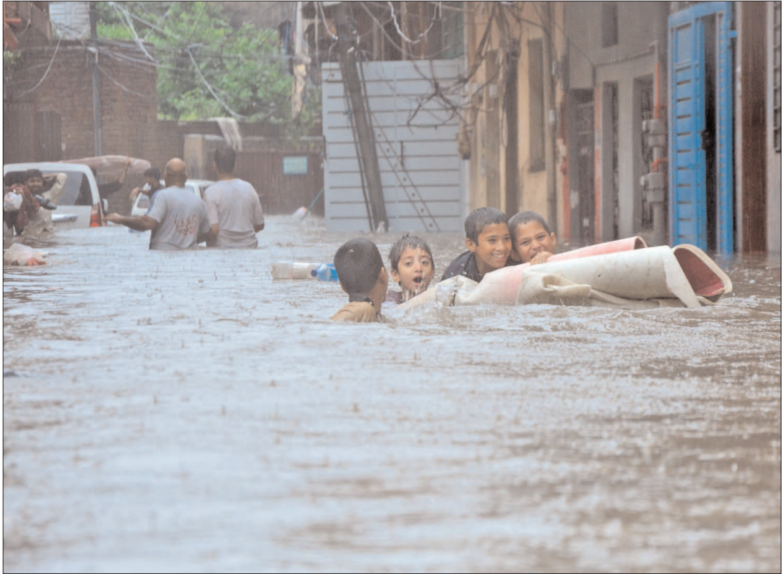
RAWALPINDI: Children trying to move to safer place along with their luggage in a flooded street during heavy monsoon rains.