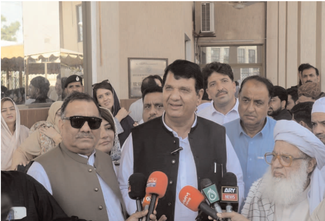
PESHAWAR: Federal Minister and President of PML-N Khyber Pakhtunkhwa, Engineer Amir Muqam talking to media after meeting with JUI-F delegation.