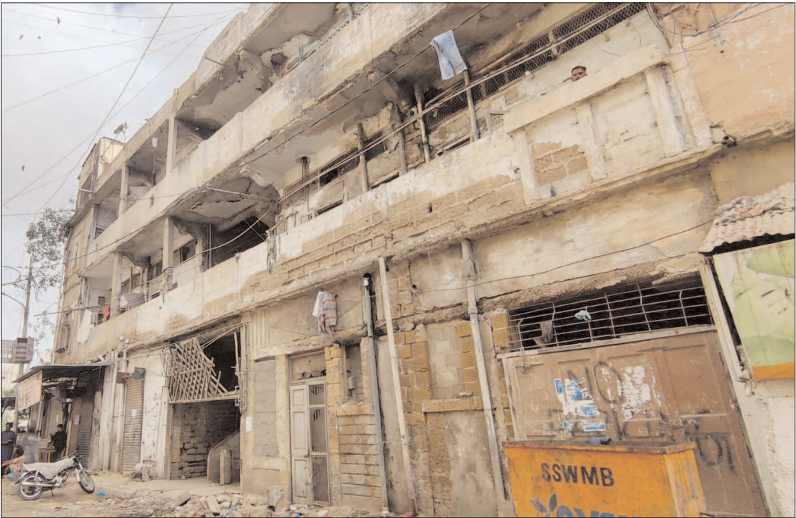
KARACHI: A view of dilapidated condition of building in city as Sindh Government announced action against old buildings.