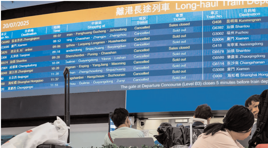
HONG KONG, CHINA: A train departure screen lists trains as cancelled at Hong Kong West Kowloon Station as Typhoon Wipha approaches on Sunday in Hong Kong, China.