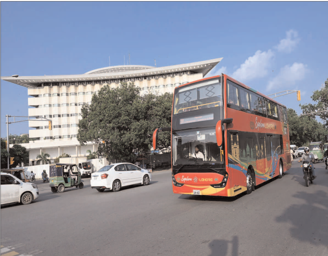
LAHORE: A double-decker tourism bus passes in front of the iconic WAPDA House.