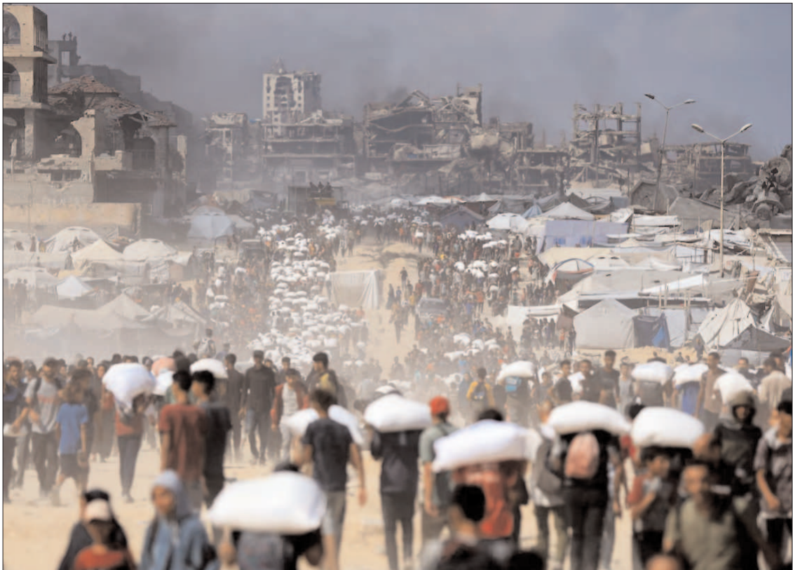
GAZA Palestinians gather as they carry aid supplies that entered Gaza through Israel, amid a hunger crisis, in Beit Lahia in the northern Gaza Strip on Sunday.