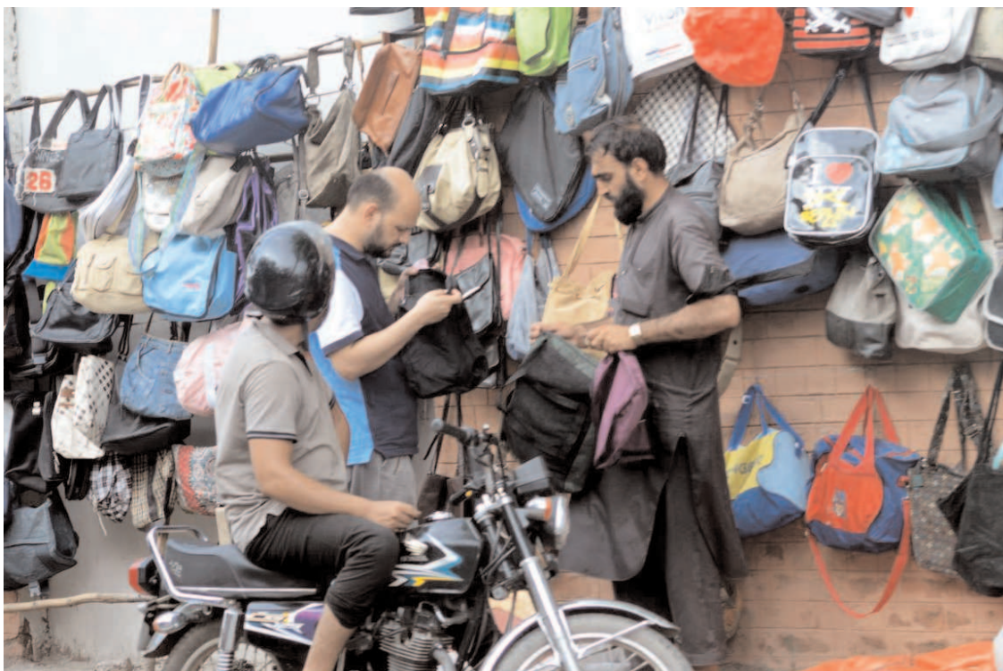
LAHORE: People buying bags from a vendor's roadside stall in city.

He also suggested for setting aside business from politics with the objective of tapping the vast economic potential of trade in the region through which the collective problem of poverty can be overcome by creating hundreds of thousands of commercial and livelihood opportunities on both sides of the border.