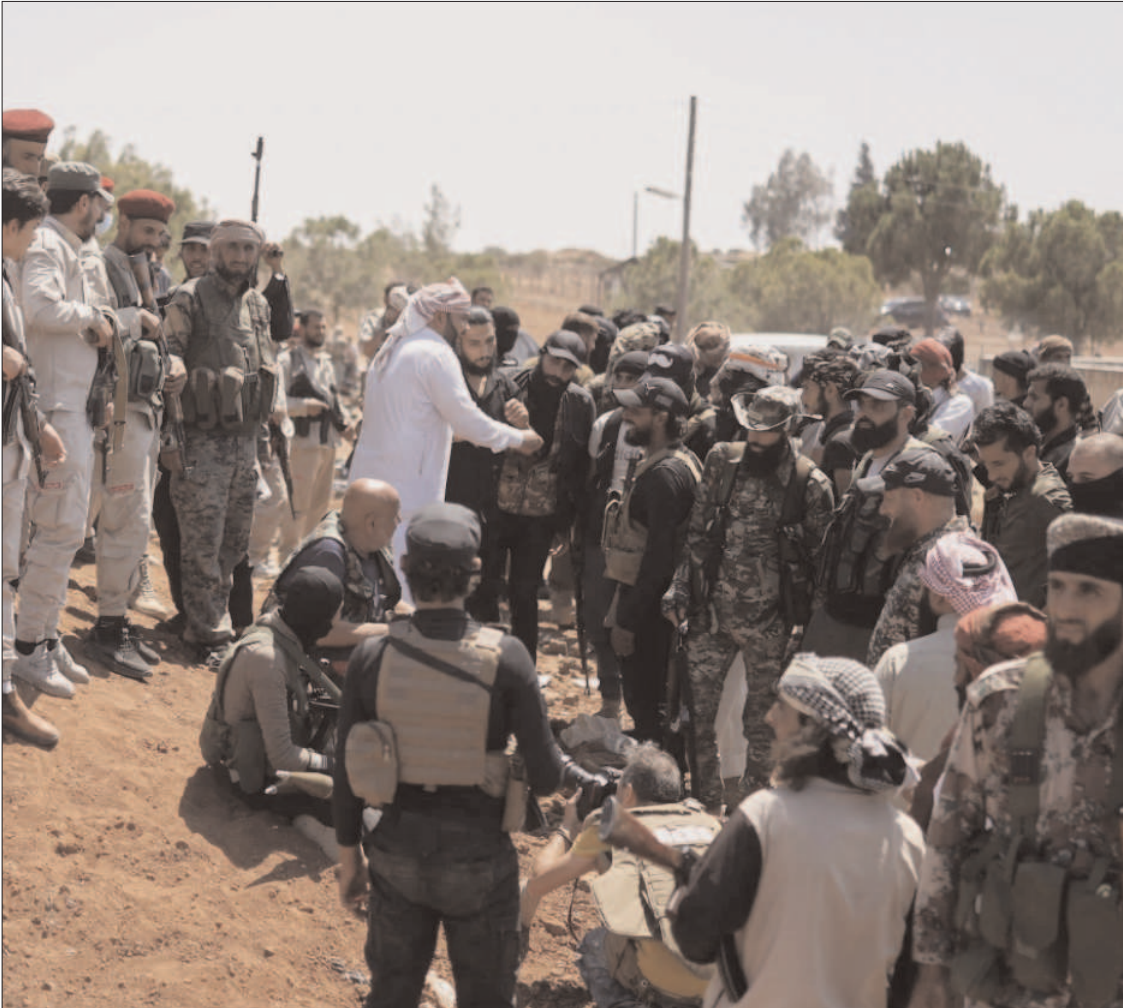
MAZRAA, Syria: Bedouin fighters, right, gather as Syrian government security forces, left, block them from entering Sweida province, in Busra al-Harir village, southern Syria, Sunday.

Meanwhile, Russia’s Defense Ministry said its forces overnight shot down 93 Ukrainian drones targeting Russian territory, including at least 15 that appeared to head for Moscow. Ten more drones were downed on the approach to the capital Sunday, according to Mayor Sergei Sobyenin. He said that one drone struck a residential building in Zelenograd, on the outskirts of Moscow, damaging an apartment but causing no casualties.