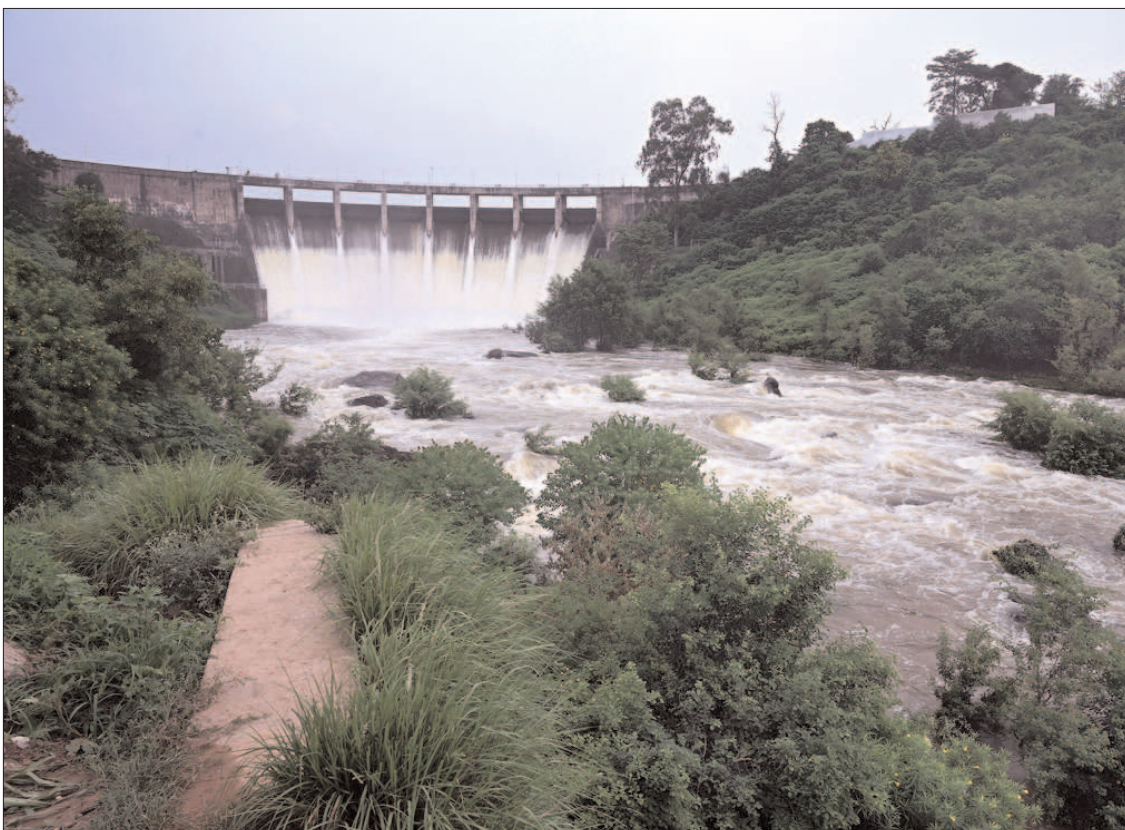
ISLAMABAD: A view of the spillways of Rawal Dam being opened as a precautionary measure following a rise in water levels due to recent heavy rains.