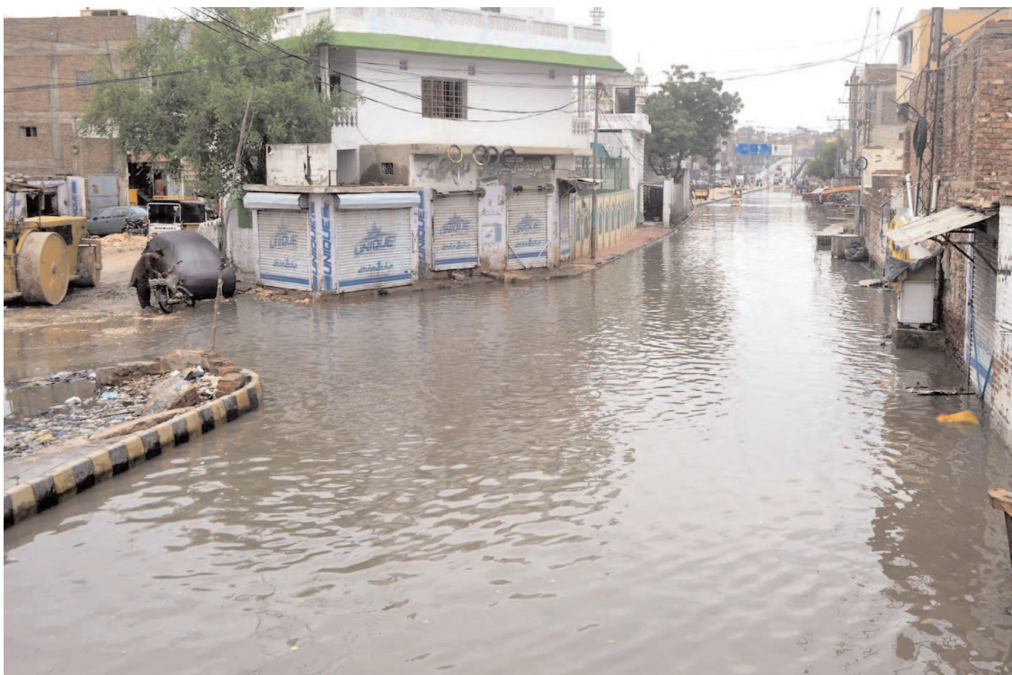
HYDERABAD: A view of Makki Shah's main road submerged with rainwater after heavy rainfall.

The Director General said that the Chief Minister has issued clear directives, if any department found negligent will face strict action. Each department's responsibilities have been clearly outlined in the contingency plan, he added.