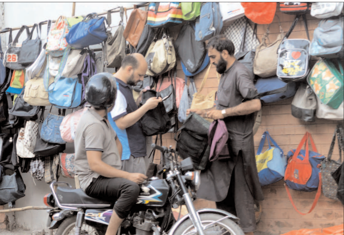
LAHORE: People buying bags from a vendor's roadside stall in the city.

The Badizai Welfare Committee reiterated its full support for SRSP and expressed hope that similar development initiatives will continue to be introduced for the benefit of the village and its residents.