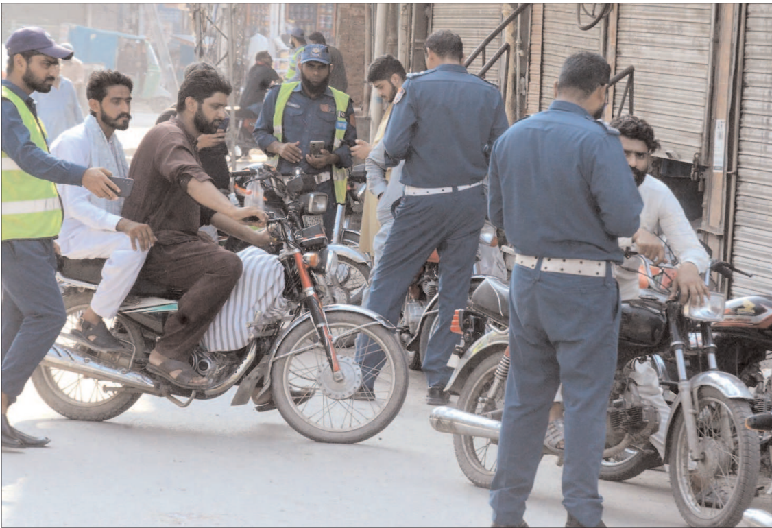
LAHORE: Traffic wardens issuing the fine tickets to motorcyclists over the violation of not warning the helmet at Shah Almi Chowk.