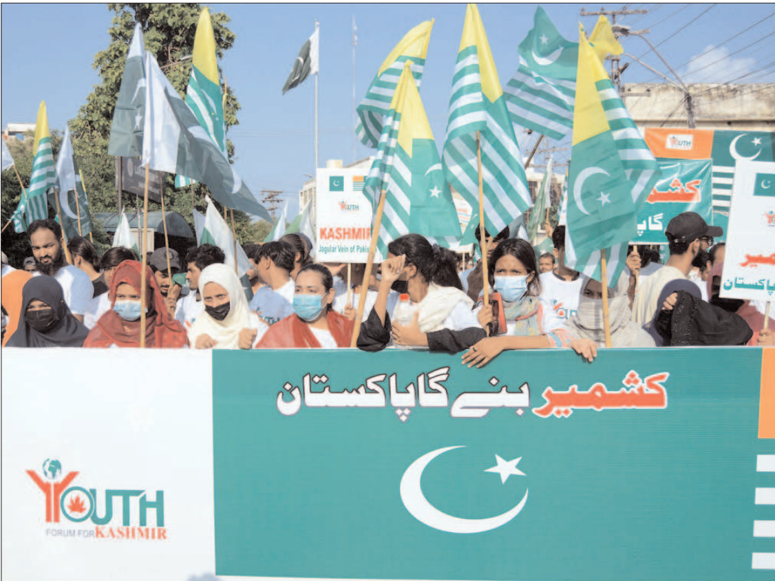
LAHORE: Youth Forum for Kashmir Lahore organizes a grand rally to mark Pakistan Accession Day.