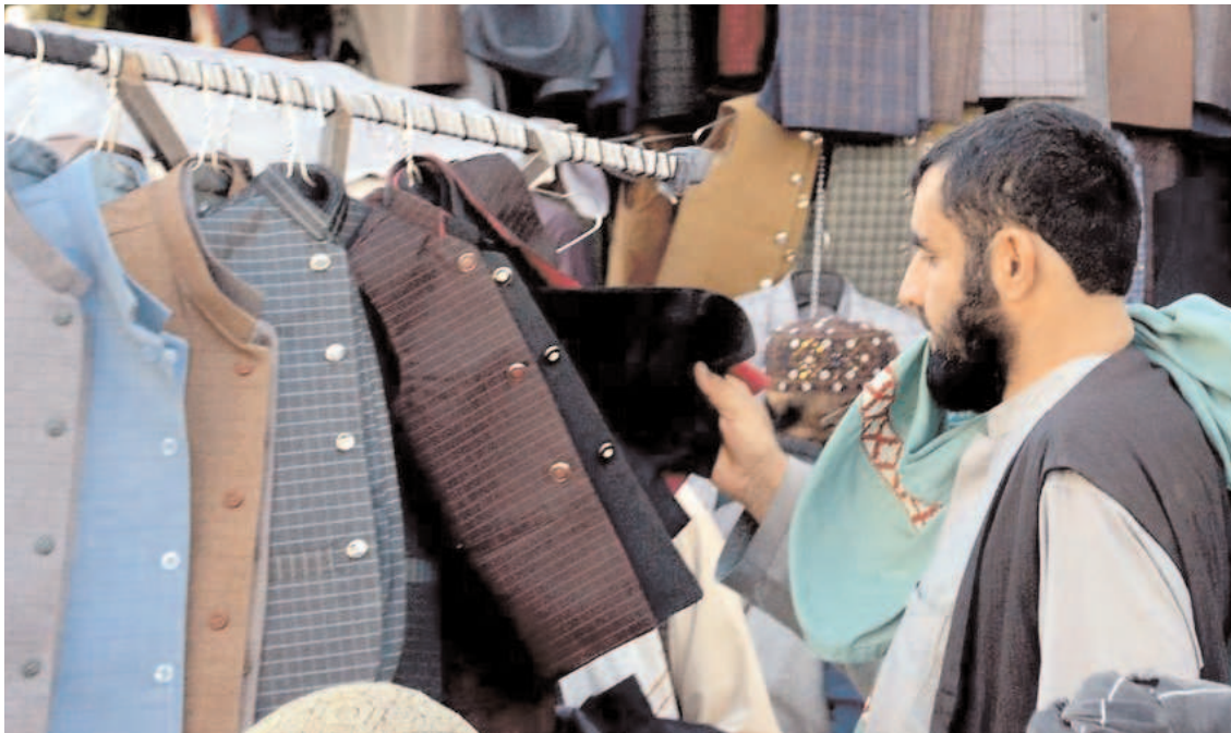
QUETTA: A man selecting waistcoat from a roadside stall.