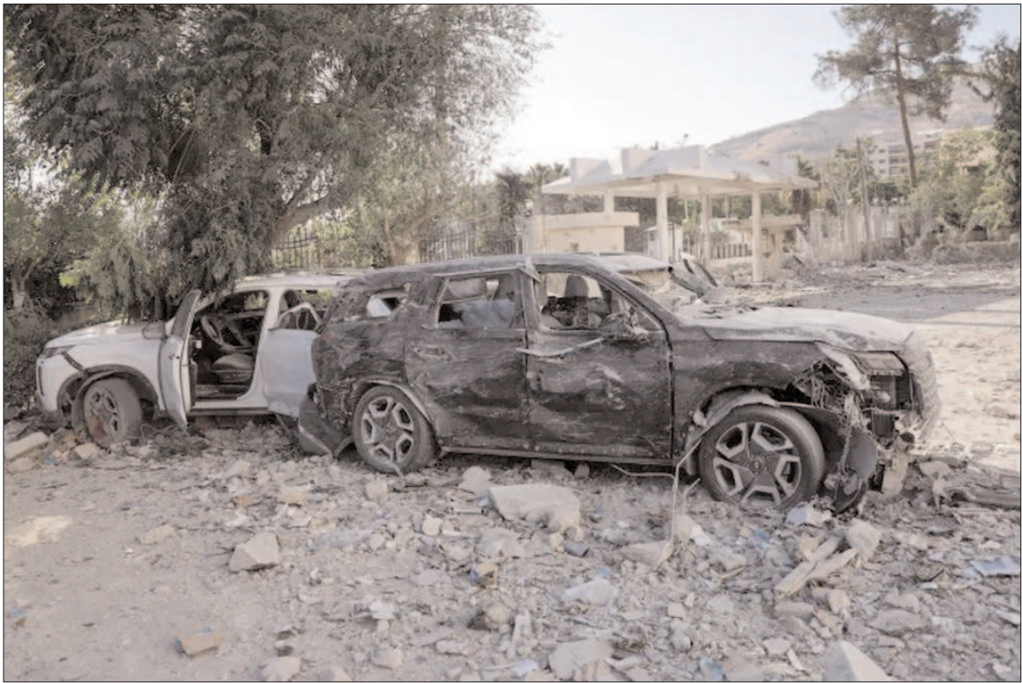
DAMASCUS: Destroyed cars sit in the street after powerful Israeli air strikes in Syria.