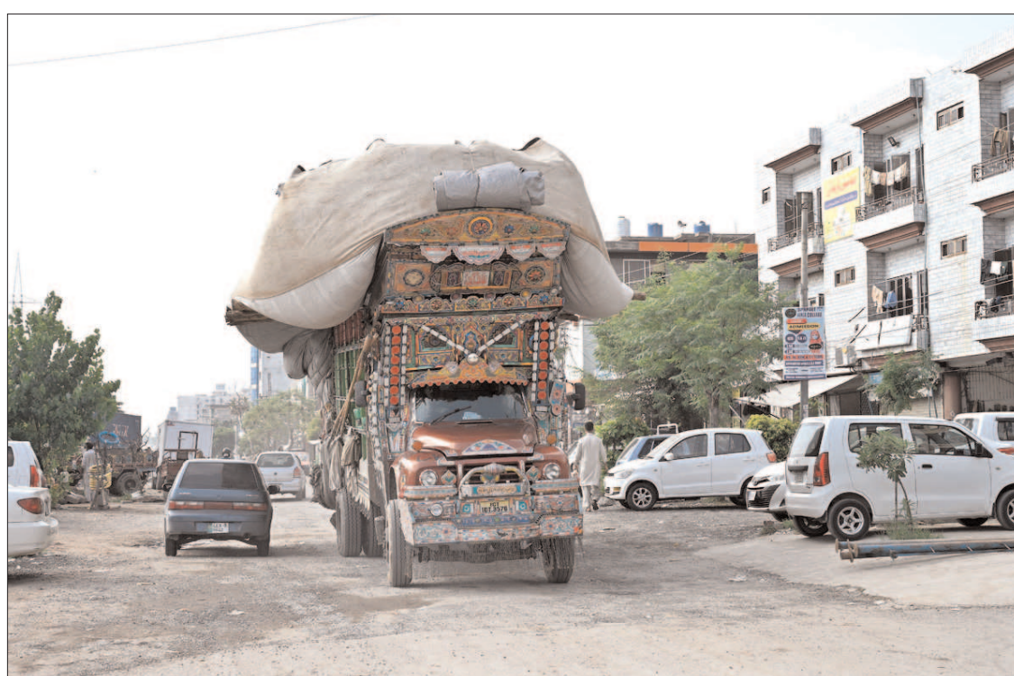
ISLAMABAD: A heavily loaded, brightly decorated truck makes its way through a service road in Iqbal Town area.

"Volunteers have served valiantly in both peace and war," he said. "With proper training and resources, they can become the frontline force during crises."