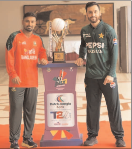
MIRPUR: Litton Das and Salman Agha pose with the series trophy.

Litton Das (captain), Jaker Ali Anik, Mehidy Hasan Miraz, Mohammad Naim Sheikh, Mohammad Saifuddin, Mustafizur Rahman, Nasum Ahmed, Parvez Hossain Emon, Rishad Hossain, Shak Mahedi Hasan, Shamim Hossain Patwari, Shoriful Islam, Tanzid Hasan Tamim, Tanzim Hasan Sakib, Taskin Ahmed and Towhid Hridoy.