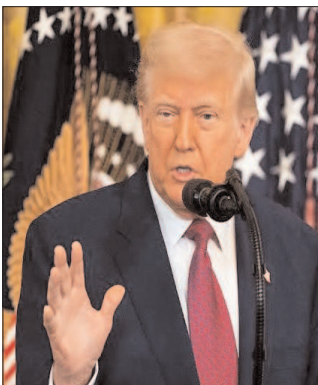
Trump hosted Pakistan Army Chief Asim Munir for a lunch meeting at the White House.

"Something I'm very proud of, we stopped a lot of wars, a lot of wars. And these were serious wars," Trump said. Since May 10, Trump has repeatedly asserted several times on various occasions that he "helped settle" the tensions between India and Pakistan and that he told the nuclear-armed South Asian neighbors that America will do a "lot of trade" with them if they stopped the conflict. On June 18, President