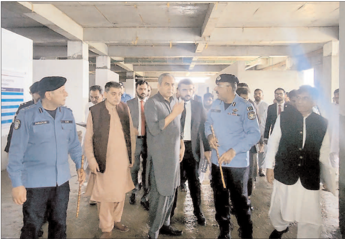
ISLAMABAD: Federal Minister for Interior Mohsin Naqvi visiting under construction National Police Hospital at the Police Headquarters.

RAWALPINDI (APP): The Rawalpindi Police on Saturday have intensified their crackdown against drug dealers following the arrest of three drug dealers and recovered over 4.5 kilograms of drugs from their possession. According to police, Kallar Syedan Police carried out successful operation and arrested two drug dealers. During the operation, police have also recovered 3.1 kg drugs from their custody. In a separate operation, Gujjar Khan Police arrested drug supplier and confiscated 1.6 kg drugs from him. The arrested drug dealers have been booked under anti narcotics act. The dealers will be presented in court with solid evidence to ensure strict legal action. A spokesperson for Rawalpindi Police stated that the force, on the direction of City Police Officer (CPO) Syed Khalid Mehmood Hamdani, was taking all possible steps to eliminate the menace of drugs from the society. "Drug peddlers are threats to our youth and future generations. We will not allow them to operate freely," he added.