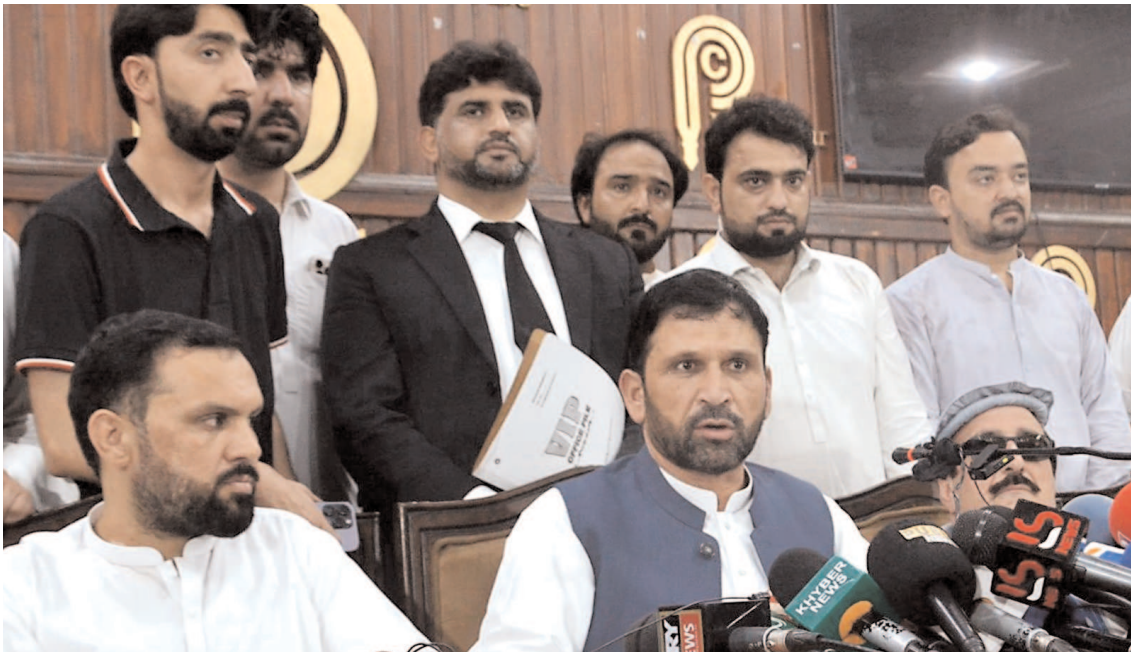
PESHAWAR: Former Senator and MPA Aurangzeb Khan Orakzai addressing a press conference.