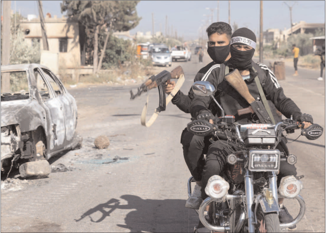
DAMASCUS: Tribal and Bedouin fighters crossing Al-Dur village in Syria's southern Sweida governorate as they mobilize amid clashes with Druze gunmen.