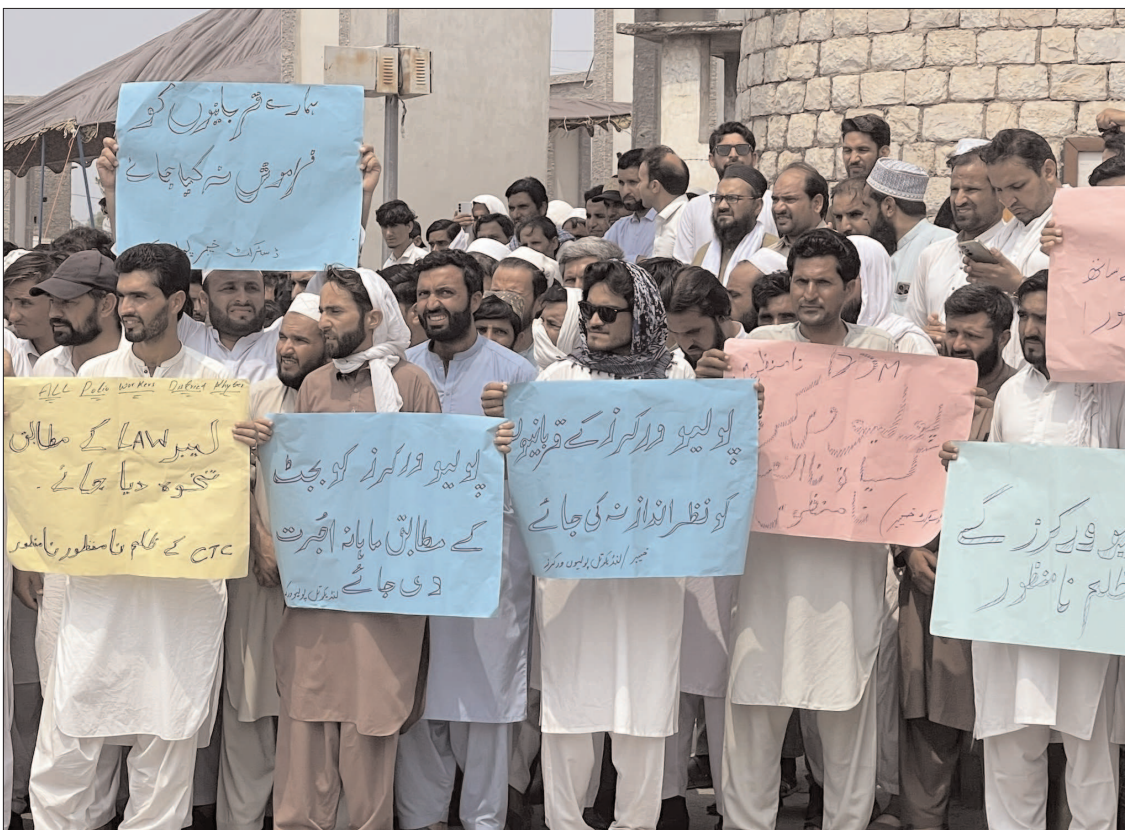
JAMRUD: Formers polio workers holding placards during a protest in favour of their demands.

NAROWAL: Lasani Express, which was on its way to Narowal from Lahore, derailed near Kala Khatai, resulting in the suspension of railway traffic on Monday. After the incident, Lasani Express came to a halt at Kala Khatai Railway Station. Allama Iqbal Express which was approaching fast behind Lasani Express was made to stop at a railway station. The passengers of Lasani train faced difficulties due to the incident. This was the second incident at the same place and at the same track in a month. A traveller told that the railway track between Narowal and Lahore is in poor condition.