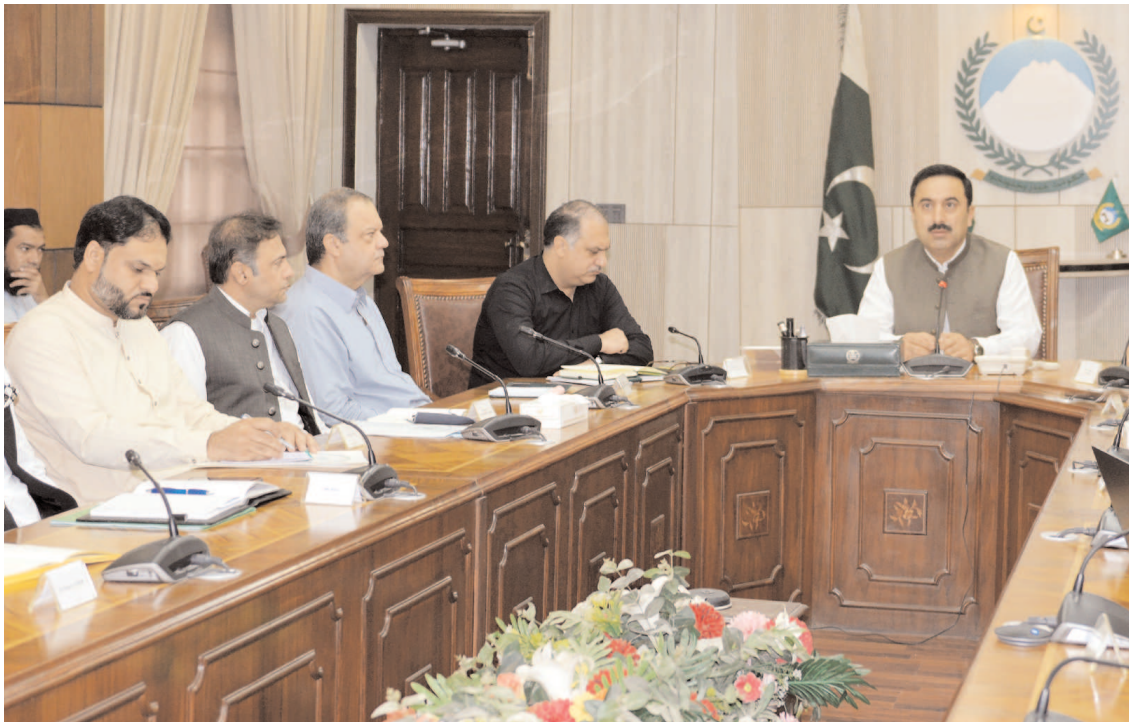
PESHAWAR: Khyber Pakhtunkhwa Chief Secretary Shahab Ali Shah chairing a high level meeting.

Participants were also briefed on progress under Public-Private Partnership (PPP) initiatives and the implementation of the provincial government's Good Governance Roadmap. A comparative analysis of essential commodity prices was presented, and the district administrations were issued instructions to maintain price stability across districts.