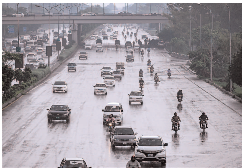
ISLAMABAD: Vehicles move along expressway during rainfall experienced in the Federal Capital.

The spokesman of ICT administration said the release of water continued for five hours to manage the rising levels caused by rainfall in Murree and adjoining areas. After the discharge, the water level in the dam decreased by one foot, reaching 1747 feet.