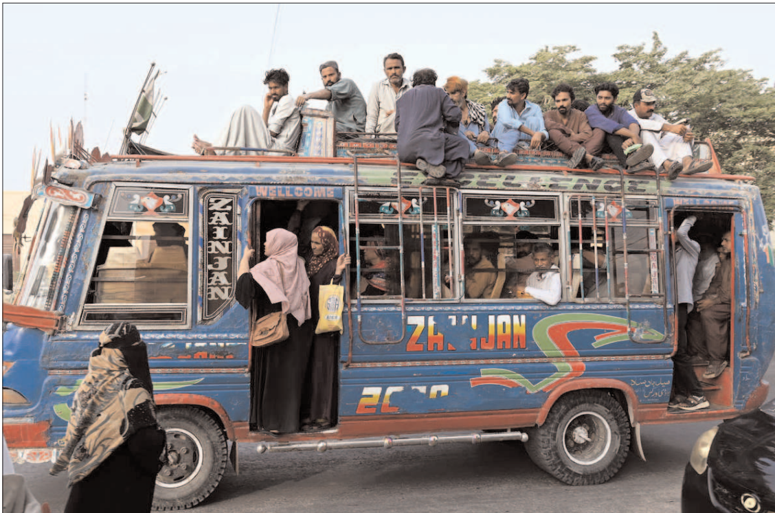
KARACHI: Women hanging on the gate and other passengers sitting on the rooftop of a moving bus pose serious safety risks.