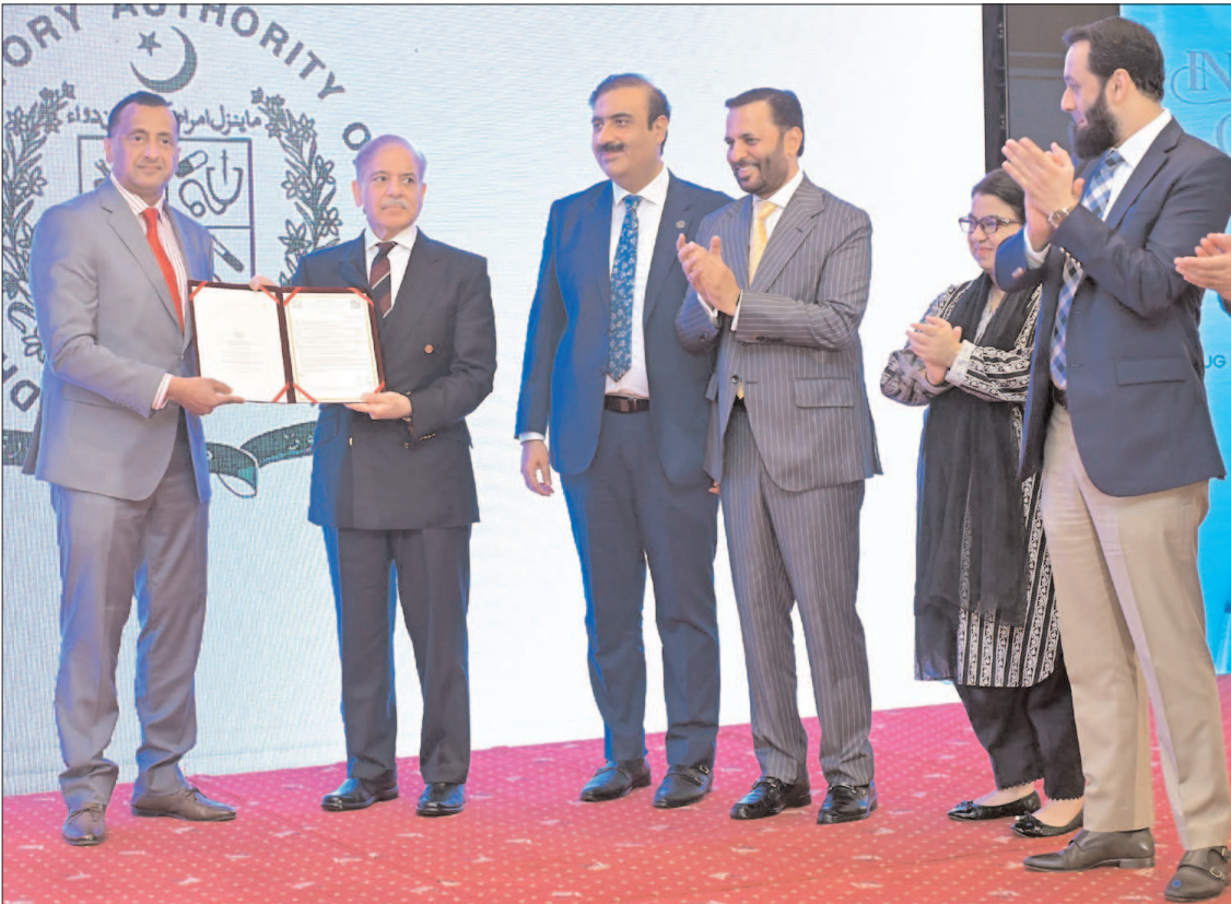
ISLAMABAD: Prime Minister Shehbaz Sharif presenting first digitally issued medical licence to CEO of Kwik Test Private Ltd. at a ceremony.