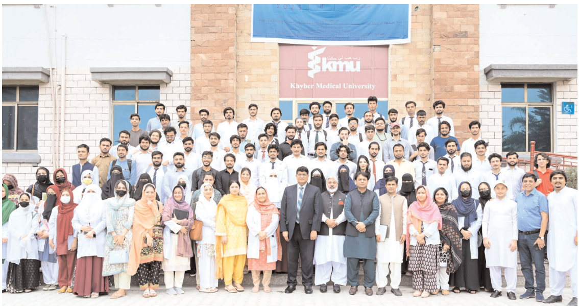
PESHAWAR: Participants in a group photo after a one-day national seminar titled “Building Resilient Youth Communities for a Peaceful and Prosperous Pakistan” held at Khyber Medical University.