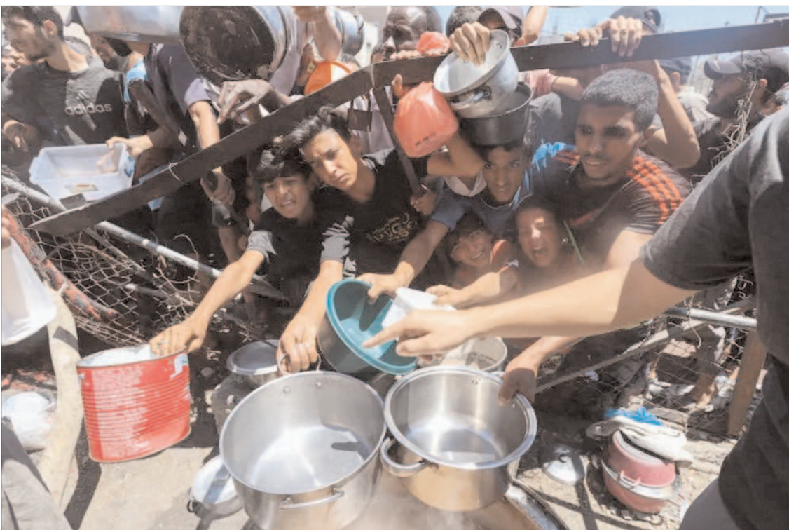
GAZA: Starving Palestinians seek desperately needed food aid in Nuseirat.