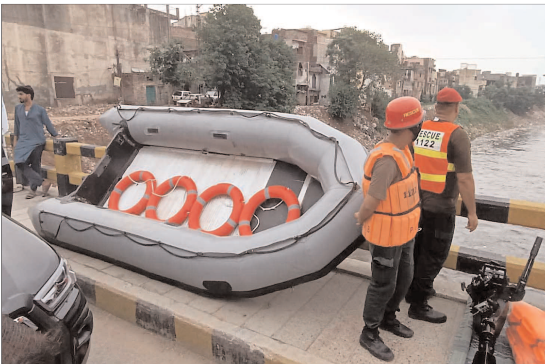
RAWALPINDI: Rescue workers along with rescue goods and boats standing on Gowalmandi Bridge for any flood situation during heavy monsoon rain in city.

RAWALPINDI (APP): Rawalpindi Police have intensified operations against criminal elements and detained seven liquor suppliers and illegal arm holders during crackdown here on Tuesday. Police have also recovered 33 liter of liquor, arms, and bullets from their possession. According to police spokesman, the operations were carried out in the jurisdictions of Gujjar Khan, Naseerabad, Jatli, and Taxila police stations. The arrested individuals have been shifted to respective police stations, where separate cases have been registered against them under relevant sections related to the possession of liquor and unlicensed weapons.