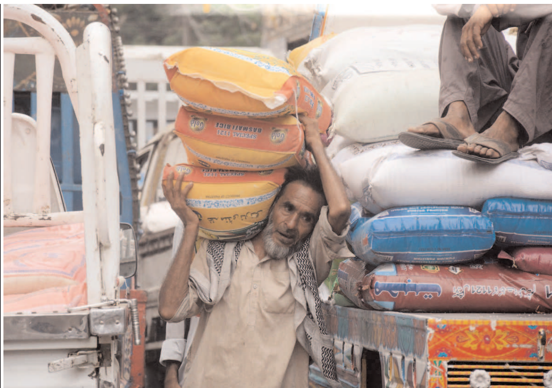
KARACHI: A labourer carries heavy rice sacks on his shoulder while unloading supplies at Jodia Bazaar.

The price of gold in the international market remained stagnant at $3,387, however prices of silver increased by $0.23 to $38.88, the Association reported.