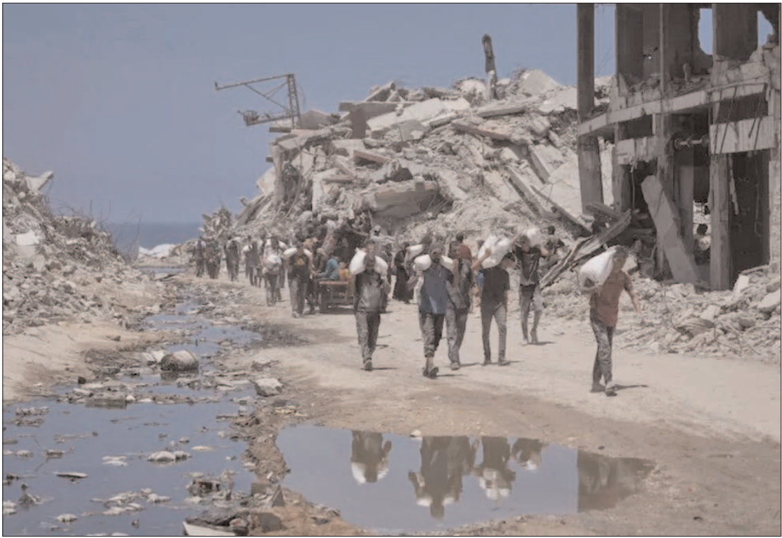
GAZA STRIP: Palestinians carrying sacks of flour unloaded from a humanitarian aid convoy.