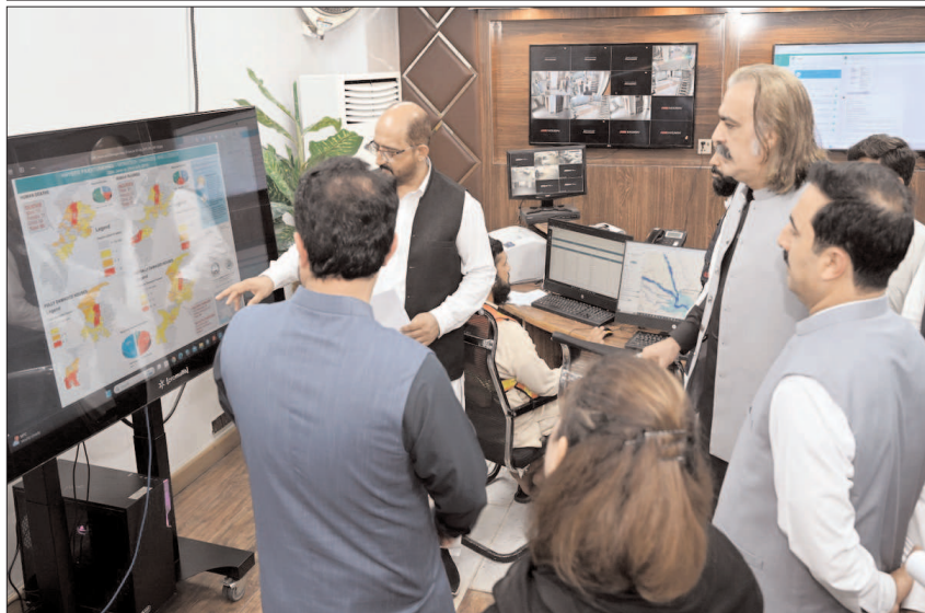
PESHAWAR: Chief Minister of Khyber Pakhtunkhwa, Ali Amin Gandapur being briefed about monsoon damages and losses during his visit to Emergency Operation Centre of PDMA.

The residents of Topki, Sameer, Gosar, Amal Kot, Gharbena, Sangena, Kandezar, Mengak, Tangay, Manda, Marokhel and the suburbs of Lower Kurram and from Sadda, Kochi, Sateen, Shasho, Darani, Per Qayum, Sakhi Ahmad Shah, Mala Kaly, Chakai Kaly, Jan Haji Kaly, Malak Mulajan Kaly, Arawaly, Marokhel, Lower Mandori and adjacent areas signed the agreement unanimously.