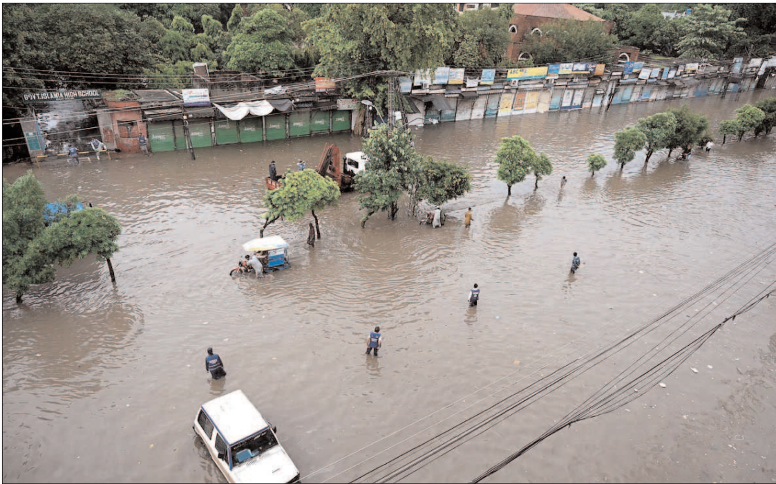
LAHORE: An aerial view of WASA employees monitor and for assist traffic and pedestrians on a rain-flooded street during a heavy monsoon downpour in the Provincial Capital.

The K-IV Project is a critical infrastructure initiative aimed at addressing Karachi's acute water shortage by providing an additional 650 million gallons per day (MGD) water to Karachi from Keenjhar lake. The Project is planned to be completed in two phases. At present, WAPDA is constructing Phase-I of to supply 260 MGD water to Karachi.