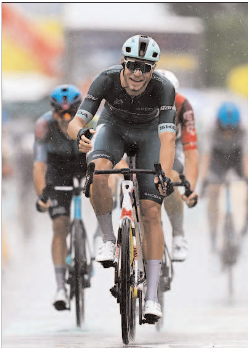
VALENCE: Jonathan Milan of Italy and Team Lidl - Trek - Green Sprint Jersey celebrates at finish line as stage winner.