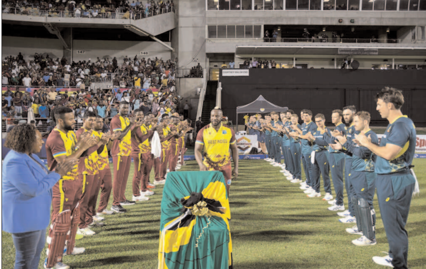
Andre Russell of West Indies is given a guard of honour before his final appearance for the West Indies in Kingston.

"I enjoy seeing the ball go over the ropes," he added. "As a kid you dream about playing here. Thanks to all the fans who came out to support me." Russell, who was given a guard of honour before the match by both teams, played just one Test match. It was as a Twenty20 specialist that he made his name, winning the T20 World Cup twice with the West Indies in 2012 and 2016. A more than lively seam bowler, Russell's free-scoring late-order batting and athletic fielding saw him sought after by T20 leagues around the world. He has been with Kolkata Knight Riders in the IPL since 2014, scoring more than 2,400 runs.