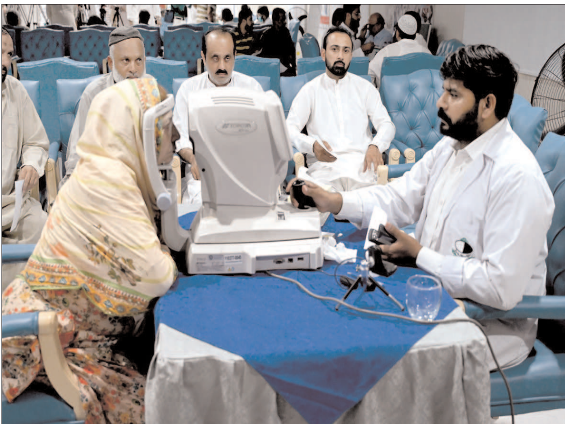
ISLAMABAD: Doctors examine patients' eyes during a free surgical eye camp organized by Al-Shifa Trust Eye Hospital at the National Press Club.

RAWALPINDI (APP): Police have arrested eight drug dealers and recovered more than 7.5 kilograms drugs from their possession during a crackdown here Saturday. According to police spokesman, Sadiqabad Police detained two drug pushers and recovered 3.8 kg drugs from their custody. Similarly, Bani Police held two drug suppliers and recovered 2.6 kg drugs from their possession. While, Dhamyal Police arrested two drug dealers and recovered 1.8 kg drugs from them. Following operation, Gujjar Khan Police detained another drug dealer and recovered 720 grams of hashish from him. Westridge Police nabbed drug supplier and recovered 560 grams of hashish from his possession.