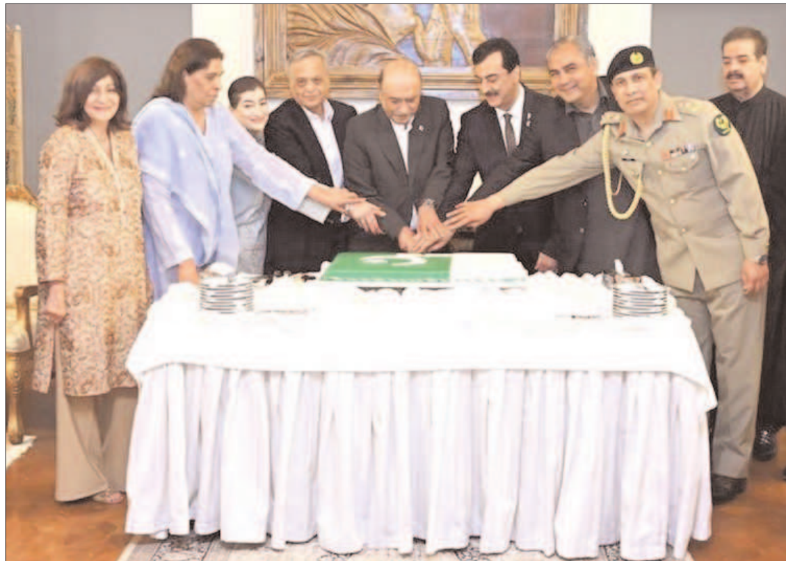
QUETTA: Chairman Senate, Syed Yousaf Raza Gillani participating in cake-cutting ceremony held in honour of President Asif Ali Zardari's birth at President House.