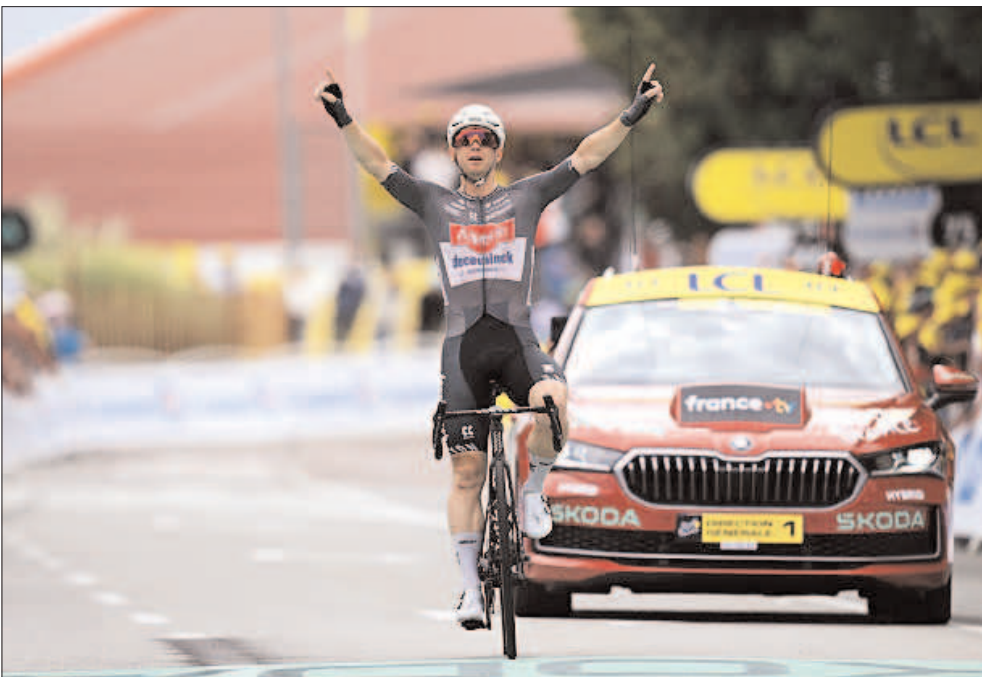
PONTARLIER: Kaden Groves of Australia and Team Alpecin - Deceuninck celebrates at finish line as stage winner during the 112th Tour de France 2025.

right and get into an early move. But the uphill start made that incredibly difficult. When I made the decision, I knew that [Matteo] Jorgenson and [Tim] Wellens would watch each other, so I tried to distance myself from them. "Then after the crash, Van den Broek goes full, so I closed