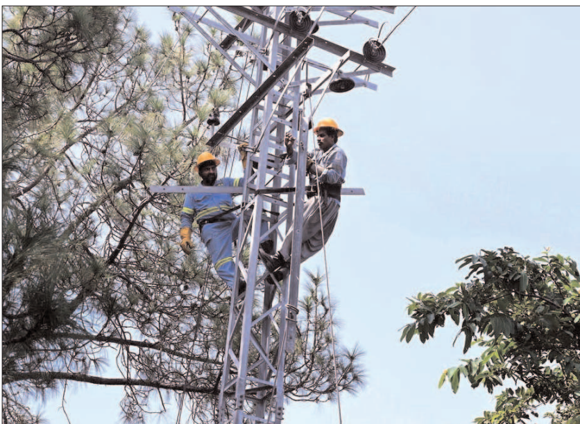
ISLAMABAD: IESCO workers busy installing new electric wires on a pole near Zero Point in the Federal Capital.

The camp features free eye examinations, medicines, eyeglasses, laboratory services and laser (phaco) surgery for media workers suffering from white cataracts. On the opening day, hundreds of members received these services free of charge, including surgical interventions where needed.