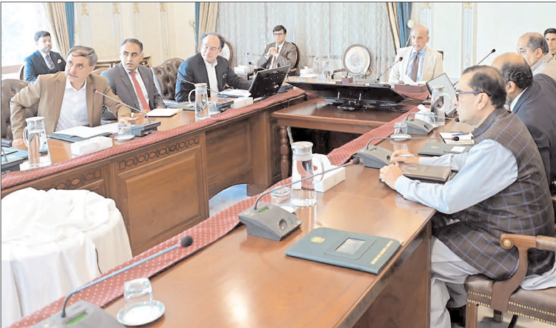
ISLAMABAD: Prime Minister Shehbaz Sharif chairing a meeting to review progress on FBR reforms.

Rain is forecast in the following areas: Murree, Galiyat, Attock, Chakwal, Jhelum, Mandi Bahauddin, Gujrat, Gujranwala, Hafizabad, Lahore, Sheikhupura, Sialkot, Narowal, Sahiwal, Jhang, Toba Tek Singh, Khushab, Sargodha, Mianwali, Nankana Sahib, Chiniot, Faisalabad, and Okara. Between July 29 and 31, rain is also expected in Dera Ghazi Khan, Bhakkar, Bahawalpur, Khanewal, Pakpattan, Vehari, Lodhran, Muzaffargarh, and Rajanpur.