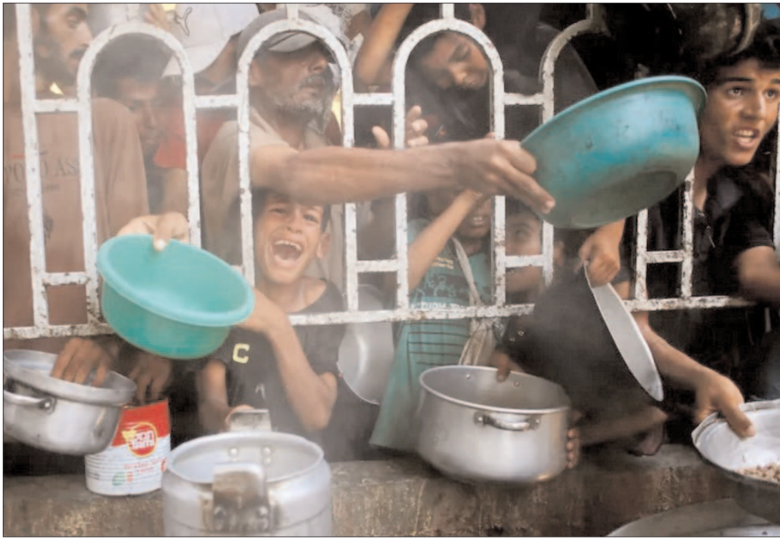
GAZA: Palestinians gather to receiving a meal at a charity kitchen in al-Mawasi area of Khan Younis.