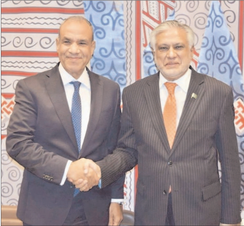
NEW YORK: Deputy Prime Minister, Senator Ishaq Dar, met with Foreign Minister of Egypt, Dr. Badr Abdelatyf, on the sidelines of International Conference on two-state solution.

The NAB investigation revealed that Ayub Khan was involved in suspicious bank transactions and had acquired illegal assets. The accused has also submitted a plea bargain application to the NAB, which will be considered later.