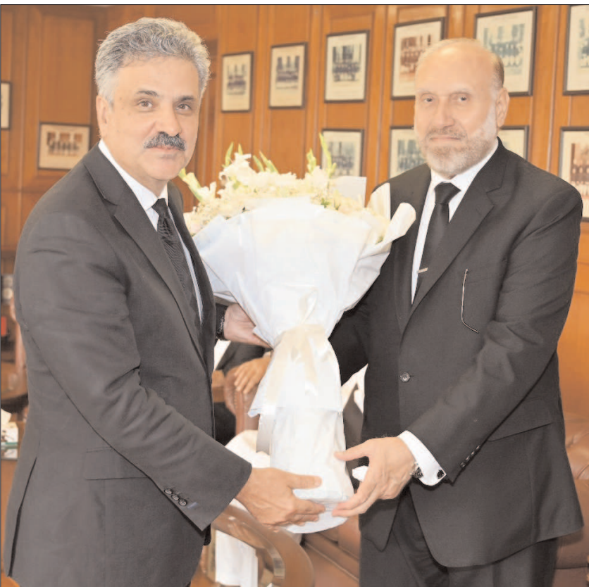
ISLAMABAD: Justice Yahya Afridi, Chief Justice of Pakistan, presenting bouquet to Justice Mazhar Alam Khan Miankhel.