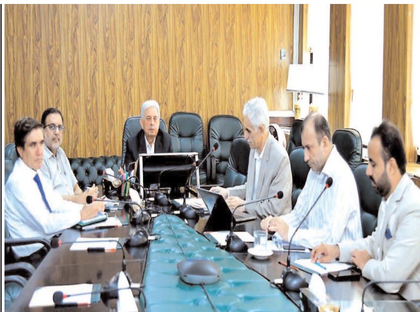
ISLAMABAD: Federal Minister for National Food Security and Research Rana Tanveer Hussain chairing a high level meeting with Pakistan Sugar Mills Association and stakeholders to review sugar supply and stock monitoring.

The price of gold in the international market decreased by $1 to $3,336 from $3,337, whereas that of silver remained stagnant and closed at $38.14, the Association reported.