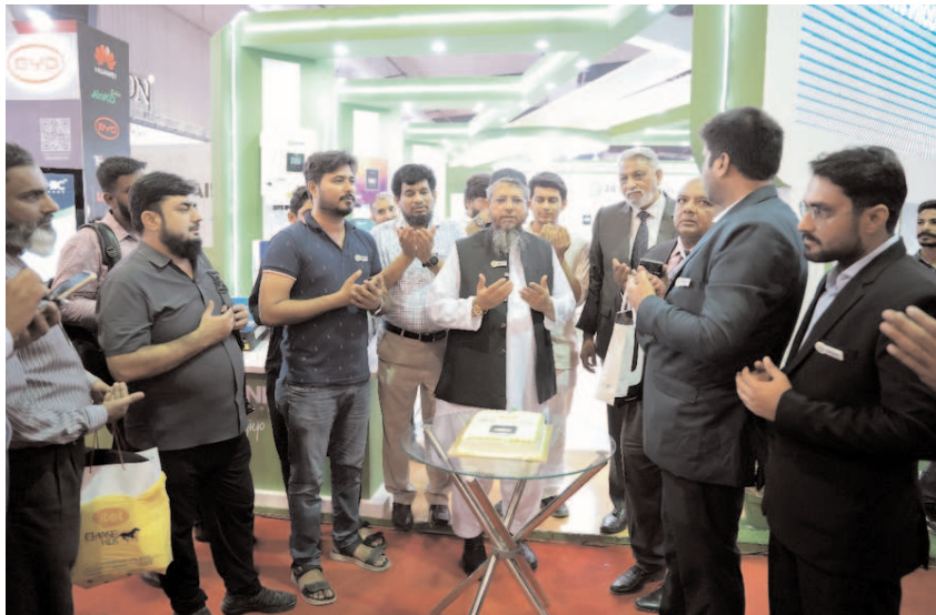
Ziewnic solar inverter lineup: Ziewnic offers a powerful range of inverters to cater to different energy needs - from small homes to large industries.

With an aim to make Pakistan energy-independent, Ziewnic offers unmatched quality, after-sales service, and innovative solar products built for Pakistani conditions.