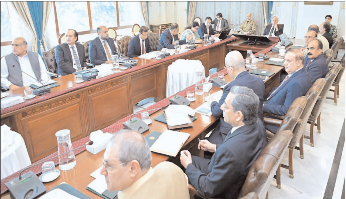
ISLAMABAD: Prime Minister Shehbaz Sharif chairing a weekly review meeting on cashless and digital economy.