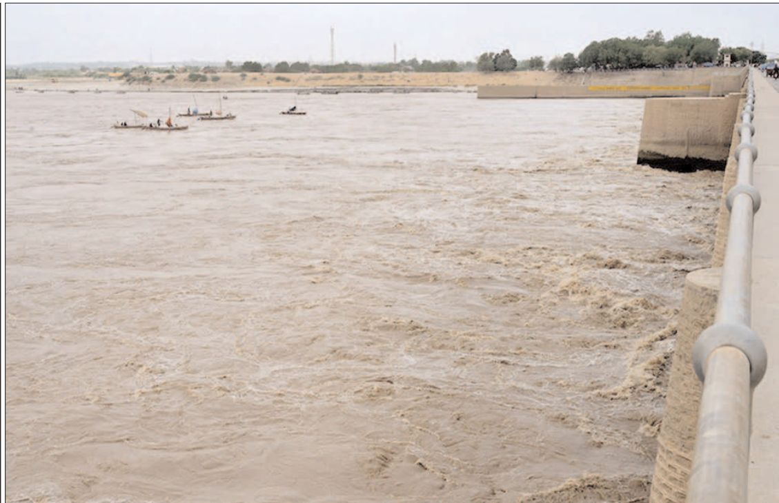
HYDERABAD: A view of the rising water level in Indus River at Kotri Barrage, caused by ongoing heavy monsoon rains across country.

The Chief Information Security Officer plays an indispensable role in safeguarding any sector against an increasingly sophisticated array of cyber threats. The evolution of the CISO from a technical expert to a strategic business leader, often reporting directly to the CEO or Board, underscores the growing recognition of cybersecurity as a fundamental business risk. The future of the CISO role will continue to demand adaptability, a deep understanding of emerging technologies like AI, and a strong emphasis on collaboration and regulatory compliance. By embracing these principles, CISOs can not only protect their organizations but also contribute significantly to the stability and trustworthiness of the global financial system.