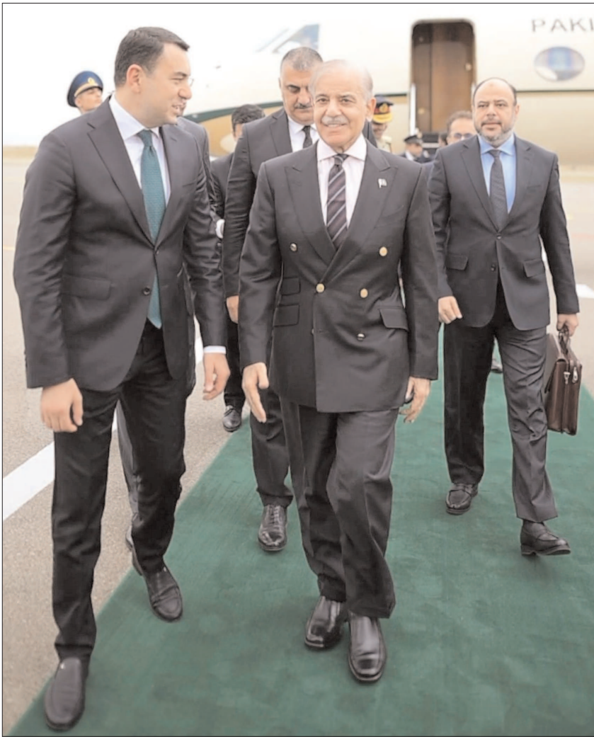
SHUSHA: Prime Minister Shehbaz Sharif arriving in Azerbaijan to attend 17th Summit of ECO.

ISLAMABAD: The federal government has announced public holidays on July 5 and 6, corresponding to the 9th and 10th of Muharram-ul-Haram. According to an official notification issued, the holidays, falling on a Saturday and Sunday typically non-working days in Pakistan will further facilitate citizens in observing the religious significance of these days with solemnity and respect.