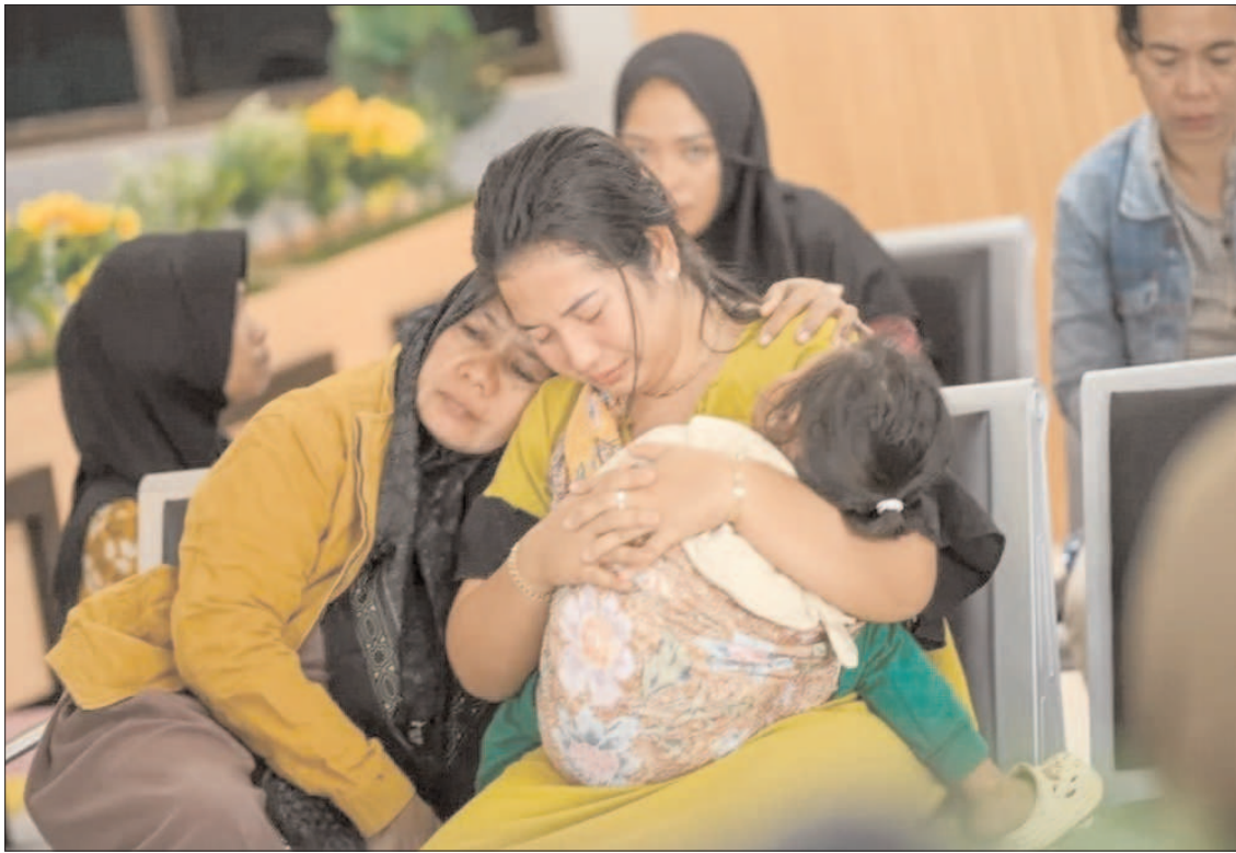
BALI: Family members waiting at Ketapang Port in East Java for updates on the search for missing people after a ferry sank on its way to the popular Indonesian resort island.

Europe is "facing various challenges", Wang said, but stressed that none were caused by China "in the past, present or future". Ahead of their meeting, Kallas, the EU's foreign affairs chief, said China was "not our adversary, but on security our relationship is under increasing strain". She said Chinese firms were "Moscow's lifeline to sustain its war against Ukraine" and accused Beijing of carrying out cyberattacks, democratic interference and unfair trade practices that "harm European security and jobs".