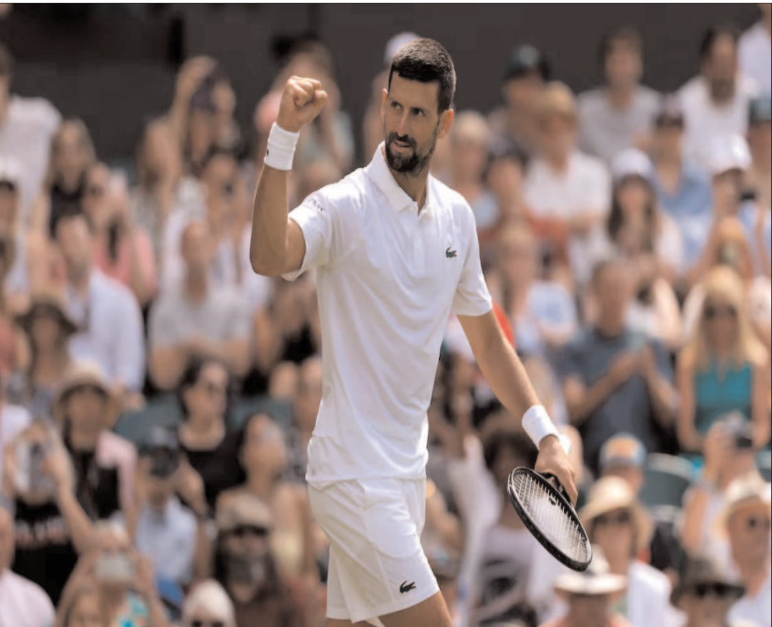
LONDON: Serbia's Novak Djokovic celebrates winning his second round match against Britain's Daniel Evans.