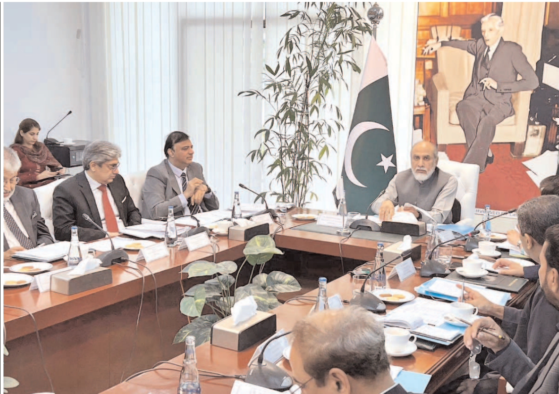
ISLAMABAD: Federal Minister for Science and Technology Khalid Hussain Magsi chairs meeting to review nominations for National Civil Awards.