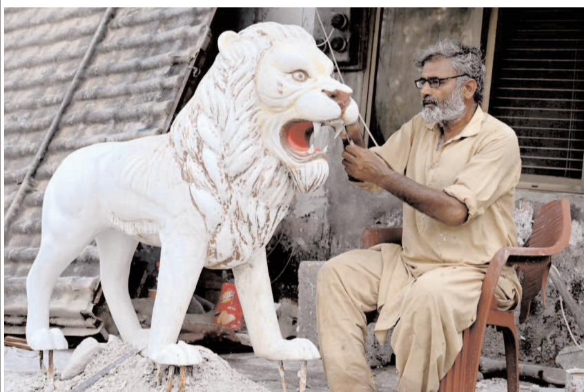
ISLAMABAD: A skilled person carving a replica of lion at his roadside workshop to attract the customers at 17Mil area.