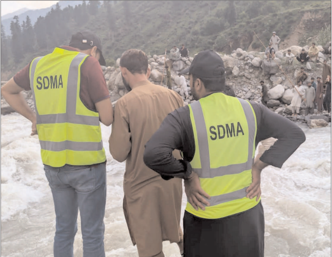
MUZAFFRABAD: Rescue workers trying to rescue dead bodies of passengers as tourists vehicles fell down in Neelum River.