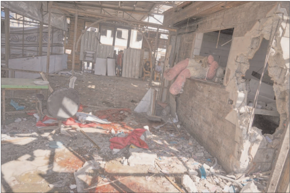
GAZA CITY: Blood, rubble, and what appears to be a giant stuffed doll lie scattered in a cafe after it was hit in an Israeli air strike.