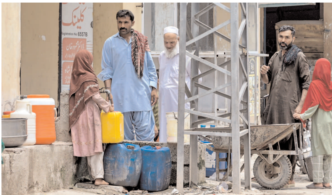
ISLAMABAD: Residents of Tarlai area fetching drinking water from a nearby Naan shop due to insufficient supply of water in the area.

At the conclusion of the gathering, Langar and Niaz-e-Hussain were distributed among the attendees. Additionally, a traditional Sabeel (refreshment station) was arranged. The proceedings of the event were graciously conducted by Nasir Ali Nasir.