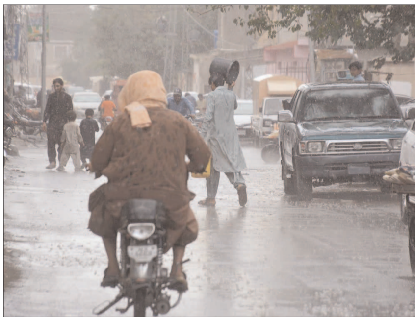
QUETTA: A view of rain the provincial capital.