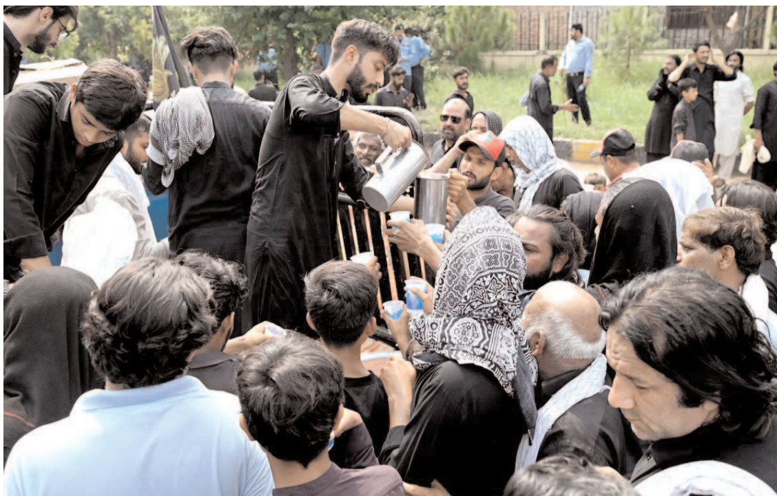
ISLAMABAD: A large number of people attending the main procession of 8th Muharram-ul-Haram observing Youm-e-Ashura at G-9 Road. Muharram ul Haram, the first month of the Islamic calendar is known as the mourning month to pay homage in remembrance of the martyrdom (Shahadat) of Hazrat Imam Hussain (AS).

ISLAMABAD (APP): Indus River System Authority (IRSA) on Friday released 275,954 cusecs water from various rim stations with inflow of 408,931 cusecs. According to the data released by IRSA, the water level in River Indus at Tarbela Dam was 1520.00 feet which was 118.00 feet higher than the dead level of 1402.00 feet. Water inflow and outflow in the dam was recorded as 272,900 cusecs and 151,500 cusecs, respectively. The water level in River Jhelum at Mangla Dam was 1178.50 feet, which was 128.50 feet higher than its dead level of 1,050 feet. The inflow and outflow of water was recorded 21,577 cusecs and 10,000 cusecs, respectively. The release of water at Kalabagh, Taunsa, Guddu and Sukkur was recorded as 203,798, 178,886, 122,717 and 54,770 cusecs, respectively. Similarly, from River Kabul, a total of 45,200 cusecs of water released at Nowshera and 42,779 cusecs released from River Chenab at Marala.