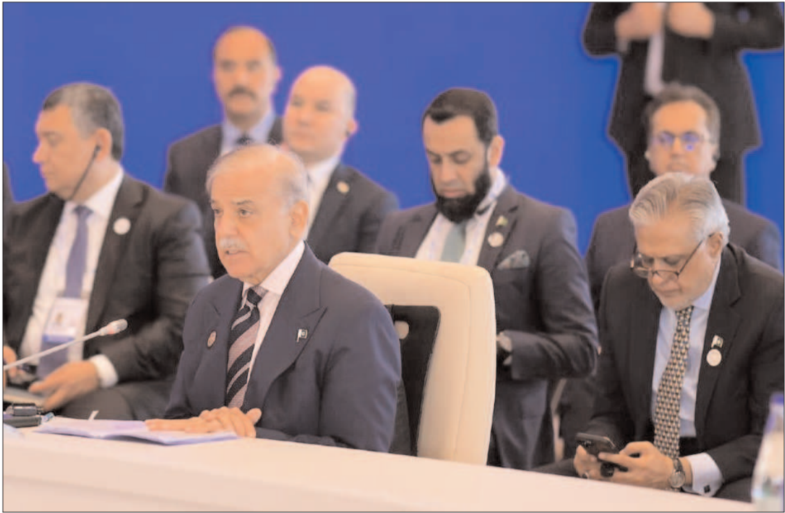
KHANKENDI: Prime Minister Shehbaz Sharif addressing the 17th ECO Summit in Azerbaijan.

Vol. XXXIXII No. 155 Regd. No. 241 MUHARRAM 09 1447 -- SATURDAY, JULY 05 2025 PESHAWAR EDITION 12 PAGES PRICE. 30