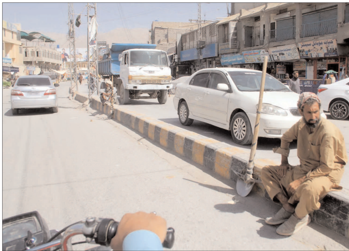
QUETTA: Unemployed labors sitting at roadside as they are waiting for their employment during hot weather of summer season.

friendly. With smart planning, community support, and a shift in mindset toward building upward, Pakistan can create modern, livable cities that protect natural resources for future generations.