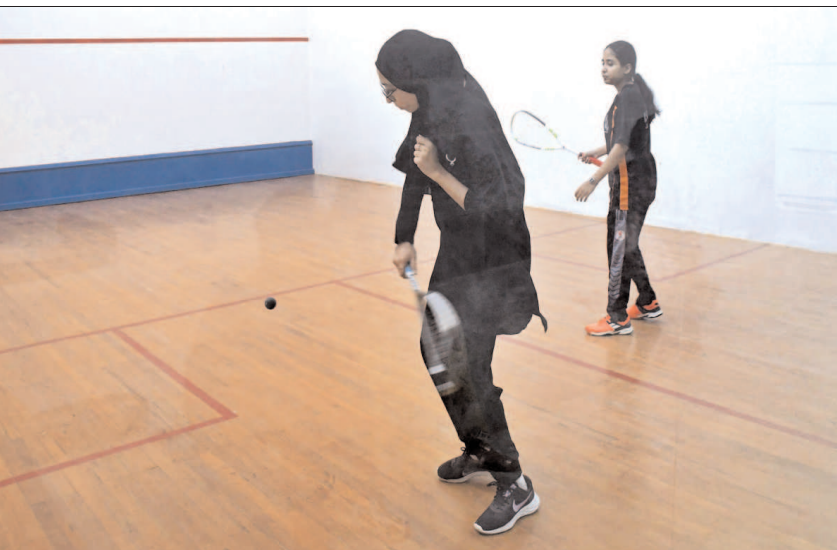
HYDERABAD: A student athlete competes in a squash match during the indoor sports festival, organized to mark the 'Maarka-e-Haq' at LUMHS Jamshoro.

Sunday included three sixes — two of them in what turned out to be the last over of Pakistan's innings after more rain. Hussain Talat got 31 off 32 balls but most Pakistan batters were much slower, including captain Mohammad Rizwan who was trapped lbw by Gudakesh Motie for a 38-ball 16. Pakistan beat West Indies in the first one-day international on Friday, also by five wickets. The third and final match in the ODI series is scheduled for Tuesday at the same stadium. Pakistan won the preceding Twenty20 series 2-1 played in Florida.