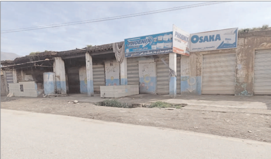
KHAR: A view of closed shops as curfew imposed in Bajaur.