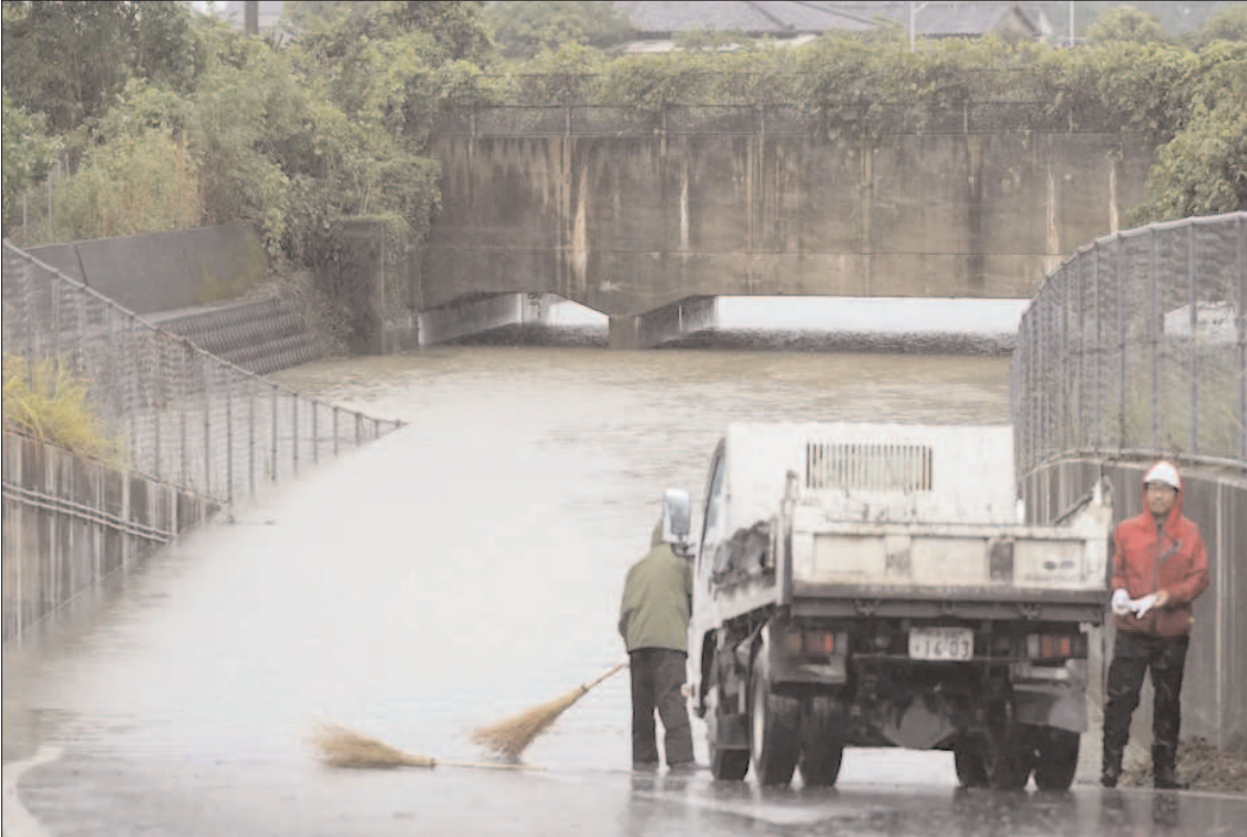
TOKYO: A road flooded follwoing a heavy rain in Nagasu town, Kumamoto prefecture, southern Japan.

"Our countries agreed that about 10,000 Korean companies operating in Vietnam contribute to Vietnam's economic development and mutually beneficial cooperation between the two countries," Lee said in a televised address. "I asked for a continued interest in the stable economic activities of our companies in Vietnam." Lam said the countries agreed to further open up their markets and expand trade to $150 billion by 2030, adding Vietnam welcomed an increase in investment by South Korean businesses along with greater technological cooperation. The countries are due to sign at least 10 memoranda of understanding at the summit meeting, pledging cooperation in areas including nuclear and renewable energy, monetary and financial policies, and science and technology, Lee's office said. Other agreements covered cooperation in infrastructure, including high-speed rail, Lee's office said. The rare visit by the Vietnamese leader is expected to contribute to a favourable condition for South Korean businesses to invest in major infrastructure and nuclear energy projects planned in Vietnam, it said.