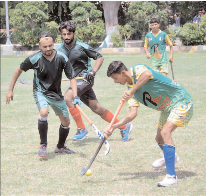
FAISALABAD: A hockey match between the University of Agriculture Faisalabad (UAF) and Government College University Faisalabad, held at the GCUF hockey ground.