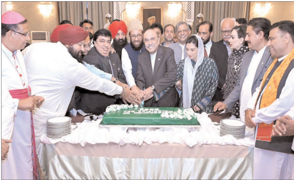
ISLAMABAD: President, Asif Ali Zardari along with ministers and heads of minority communities cutting a cake to celebrate National Minorities Day, at Aiwan-e- Sadr.

The equipment has been procured under the World Bank supported Khyber Pakhtunkhwa Integrated Tourism Project (KITE), with the purchase process for four additional machines already underway. Speaking at the event, the chief minister said the provincial government, in collaboration with partner organizations, is taking practical steps to