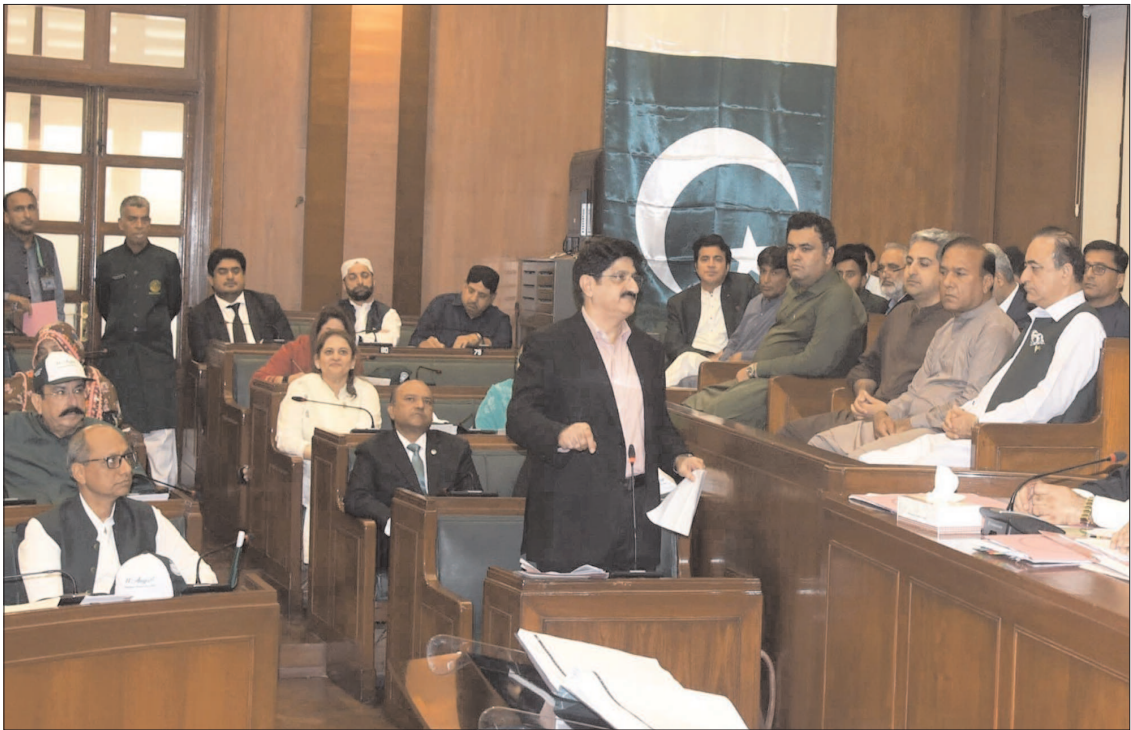
KARACHI: Sindh Chief Minister, Syed Murad Ali Shah addresses during the assembly session on the occasion of the National Minorities Day, held at Old Sindh Assembly building in Karachi.