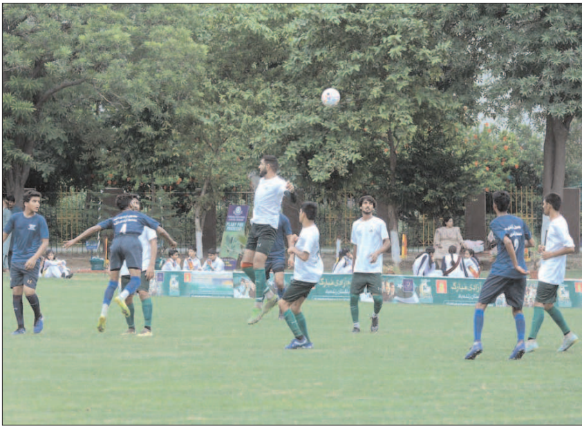
FAISALABAD: Action-packed moments from the football match between Faisalabad Blue and Faisalabad White at Divisional Public School and College Ground during Marka-e-Haq Sports Competition on the occasion of Independence Day.

meet the Additional Secretary Finance in the upcoming days and once the financial matters will settle. The Government and PHF will make an announcement regarding the participation in Pro League. The Secretary IPC and Deputy DG Shahid Islam also participated in the meeting.