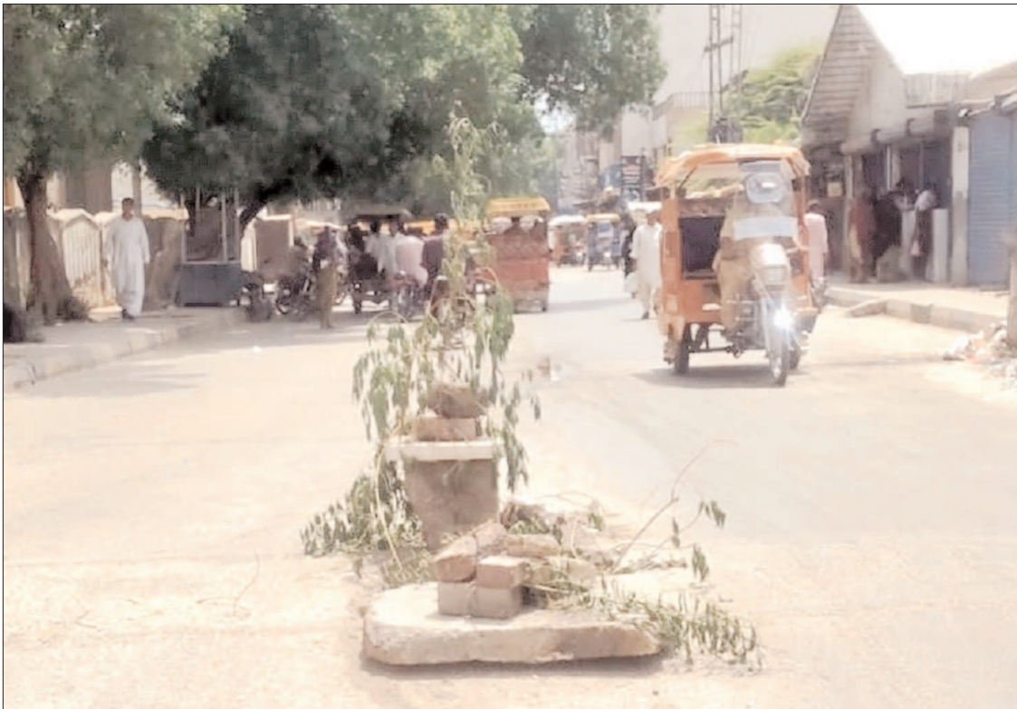
LARKANA: Commuters passing through nearby an open sewerage manhole which may cause any accident specially in night time, showing negligence of authorities concerned.

QUETTA: Balochistan Chief Minister Mir Sarfaraz Bugti welcomed the United States' decision to designate the Baloch Liberation Army (BLA) and its sub-group, the Majeed Brigade, as terrorist organisations, calling it a commendable and timely step. In a message on social media platform X, the Chief Minister said that the federal government and Field Marshal Asim Munir had presented Pakistan's stance before the US administration in a highly effective and well-reasoned manner, which led to this important decision. He stated that the BLA and Majeed Brigade had long been shedding the blood of innocent civilians under the false guise of ethnic and linguistic rights, and their hands were stained with the blood of countless innocents. He stressed that terrorism can never be justified under any circumstances, and no cause can legitimise the killing of innocent civilians. The Chief Minister urged the international community to unite and adopt a joint strategy to eradicate the scourge of terrorism so that the world can be freed from this dangerous menace. Mir Sarfaraz Bugti expressed hope that this decision would help promote peace and stability in Pakistan and further strengthen the ongoing fight against terrorism.