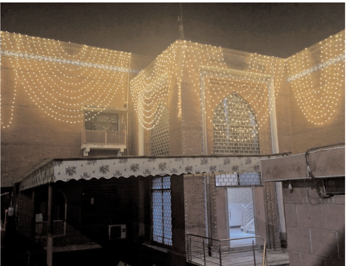
PESHAWAR: Peshawar Press Club (PPC) is beautifully decorated with lights as part of the Independence Day celebrations.