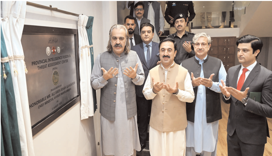
PESHAWAR: Chief Minister Khyber Pakhtunkhwa Ali Amin Khan Gandapur offering dua after inaugurating the newly established Provincial Intelligence Fusion and Threat Assessment Centre (PIFTAC). Khyber Pakhtunkhwa Chief Secretary Shahab Ali Shah is also present.