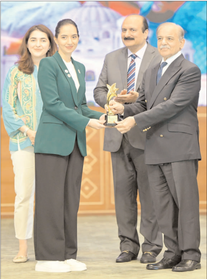
ISLAMABAD: Prime Minister Shehbaz Sharif presenting awards for recognition of services in various sectors, of individuals from minority communities at a ceremony on International Youth Day.