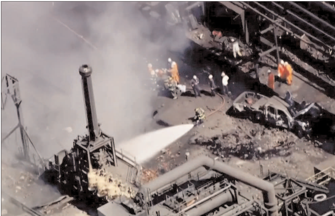
CLAIRTON: Firefighters spraying water on the site of an explosion at US Steel's Clairton Coke Works plant in Pennsylvania.