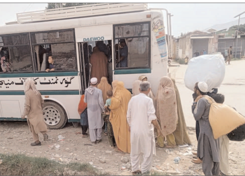
KHAR: Administration shifting local people to safer places as operation against militant hideouts continues.

The Speaker of the National Assembly is expected to issue a notification for the appointment of a new Opposition Leader soon. PTI-backed independent members will also be required to submit fresh nominations for the roles of Parliamentary Leader and Deputy Parliamentary Leader. Additionally, PTI leader Omar Ayub has been delisted from both the Public Accounts Committee and the Finance Committee following his disqualification.