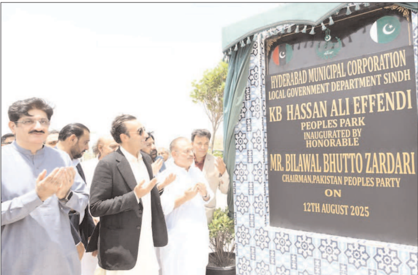
HYDERABAD: Chairman PPP, Bilawal Bhutto Zardari inaugurating Khan Bahadur Hassan Ali Effendi Park.

PM also praised the professional capabilities of the security forces for killing three more Indian-backed terrorists on Monday night, following a successful operation that neutralized 47 terrorists in the same area a few days ago. "We will continue this war against the scourge of terrorism until it is eradicated from the country. Pakistan armed forces are engaged day and night in the mission to cleanse the homeland of terrorists, and for this, the entire nation, including myself, pays tribute to them," he added.