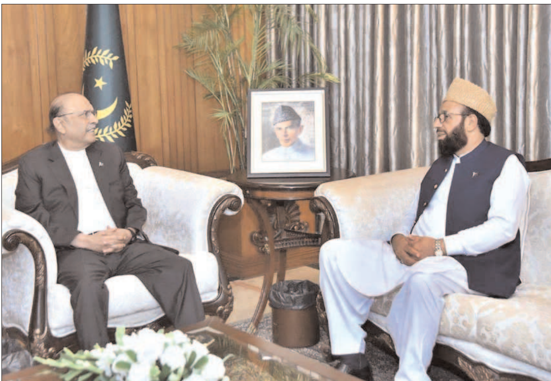
ISLAMABAD: Federal Minister for Religious Affairs and Interfaith Harmony, Sardar Muhammad Yousaf, called on President Asif Ali Zardari, at Aiwan-e-Sadr.