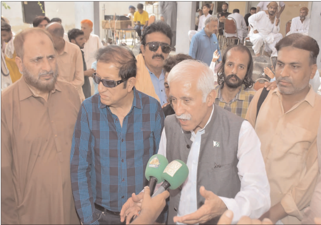
CHINIOT: Federal Minister for Board of Investment, Qaiser Ahmad Sheikh, talking to media persons.