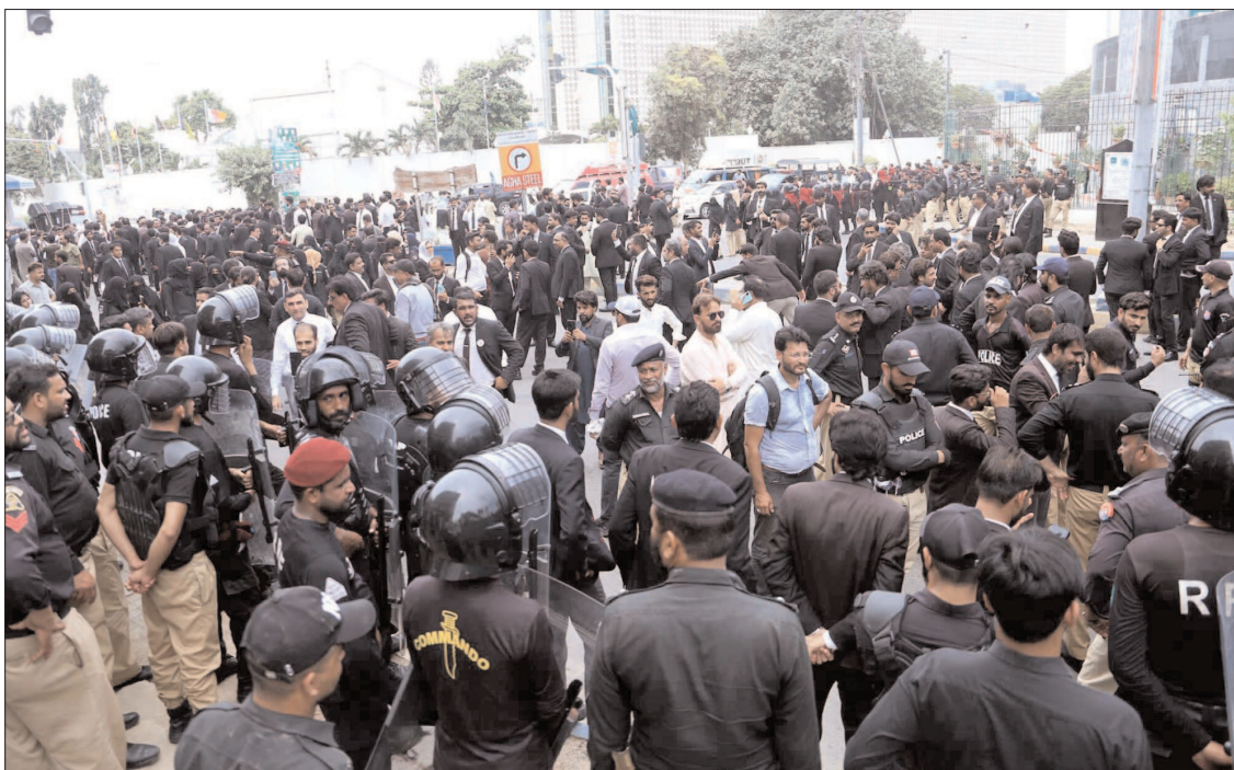
KARACHI: Police officials barricade protesters when they try to move towards the red zone area during the protest demonstration of All Sindh Lawyers Action Committee for acceptance of their demands.

Under the directions of PFA Director General Muhammad Asim Javaid, food safety teams inspected a beverages industry, an ice cream factory, coffee and cake production units and an oil mill. During the operation, teams also discarded two maunds of honey, spices and chemicals found unfit for human consumption. The DG said that unhygienic conditions were observed in the storage and processing areas, where flies, lizards, rats, fungus-infested walls, dirty floors, broken tiles and lack of pest control measures were found.