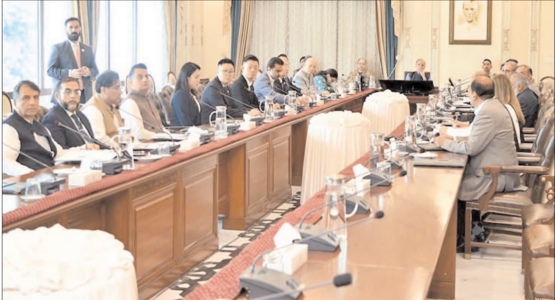
ISLAMABAD: Prime Minister Shehbaz Sharif chairing a review meeting on Jinnah Medical Complex and Research Centre.