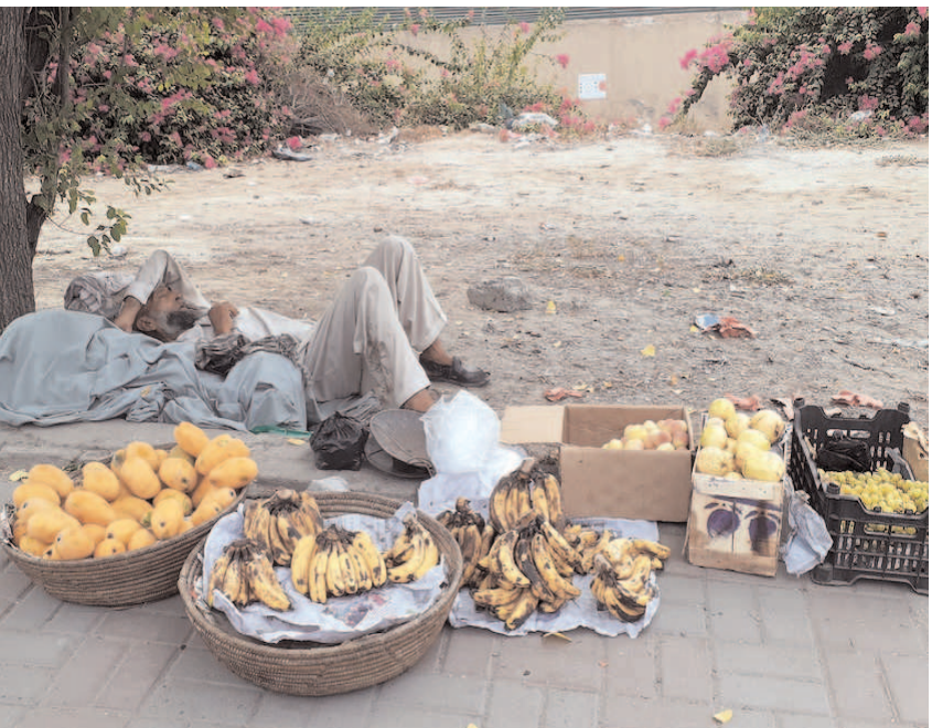
PESHAWAR: A fruit vendor taking nap near stall along roadside at Saddar locality.