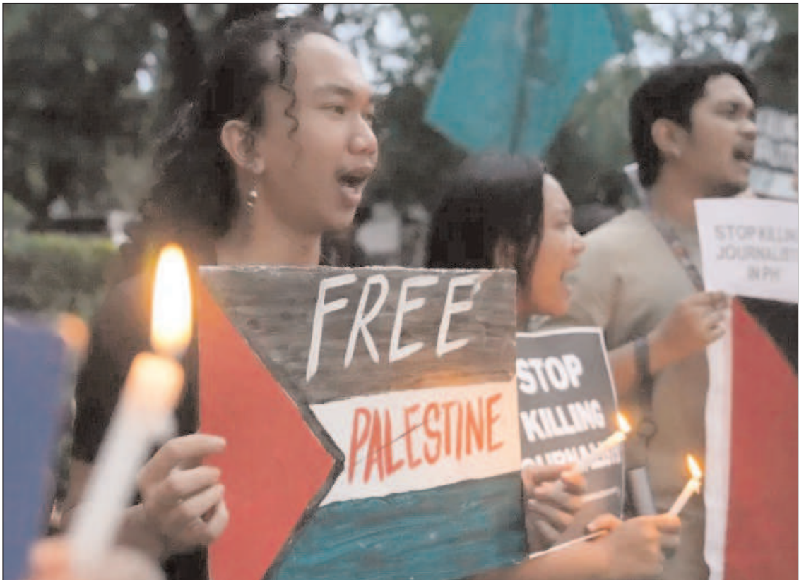
MANILA: Filipino activists shouting slogans as they condemn the killing of Palestinian Al Jazeera journalists and media workers in a recent Israeli air strike in Gaza, during a protest in Quezon City, the Philippines.