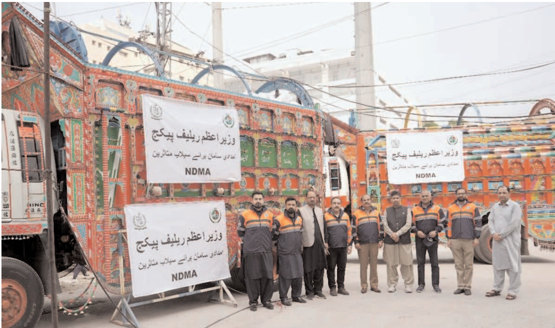
PESHAWAR: NDMO handed over relief consignments to PDMA Khyber Pakhtunkhwa for flood affected areas.