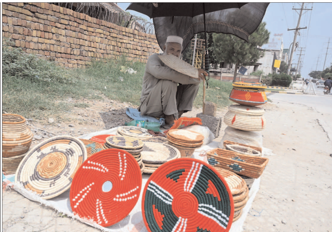
ISLAMABAD: An elderly vendor waits for customers to sell household items at his roadside.

All Pakistanis are urged to remember the victims in their prayers. He said the government's swift response and commitment to relief efforts have brought hope to the affected families, and the nation stands united in this hour of need.