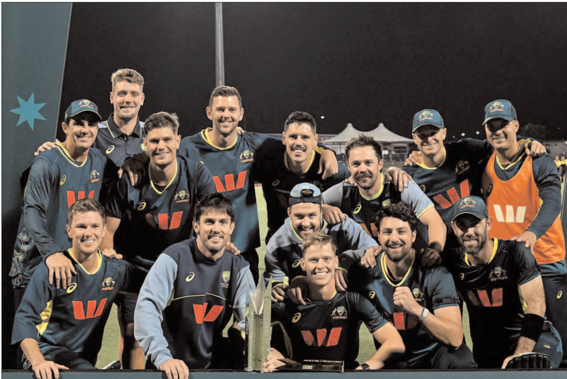
CAIRNS: Australia get their hands on the series trophy.

ISLAMABAD (PPI): The Pakistan Cricket Board (PCB) is set to launch a nationwide talent hunt for the next generation of women cricketers. The trials, aimed at identifying promising U19 and Emerging players, will commence on August 21st and span eight cities across Pakistan. The two-week program will scout players for upcoming U19 and Emerging squads.