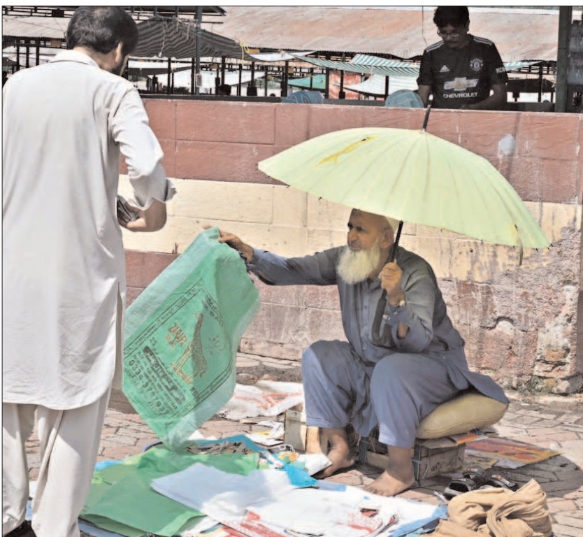
ISLAMABAD: An elderly vendor selling shopping bags outside Aabpara Sunday Bazaar in the Federal Capital.

The Prime Minister's Youth Program is a testament to the government's commitment to empowering the next generation of Pakistanis. As the program continues to evolve and expand, it is likely to have a lasting impact on the country's socio-economic landscape, fostering a culture of innovation, entrepreneurship, and digital literacy.