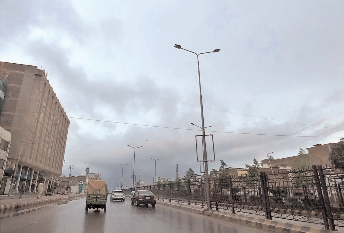
PESHAWAR: Eye-catching view of dark clouds hovering over the sky after heavy downpour on Sunday morning.