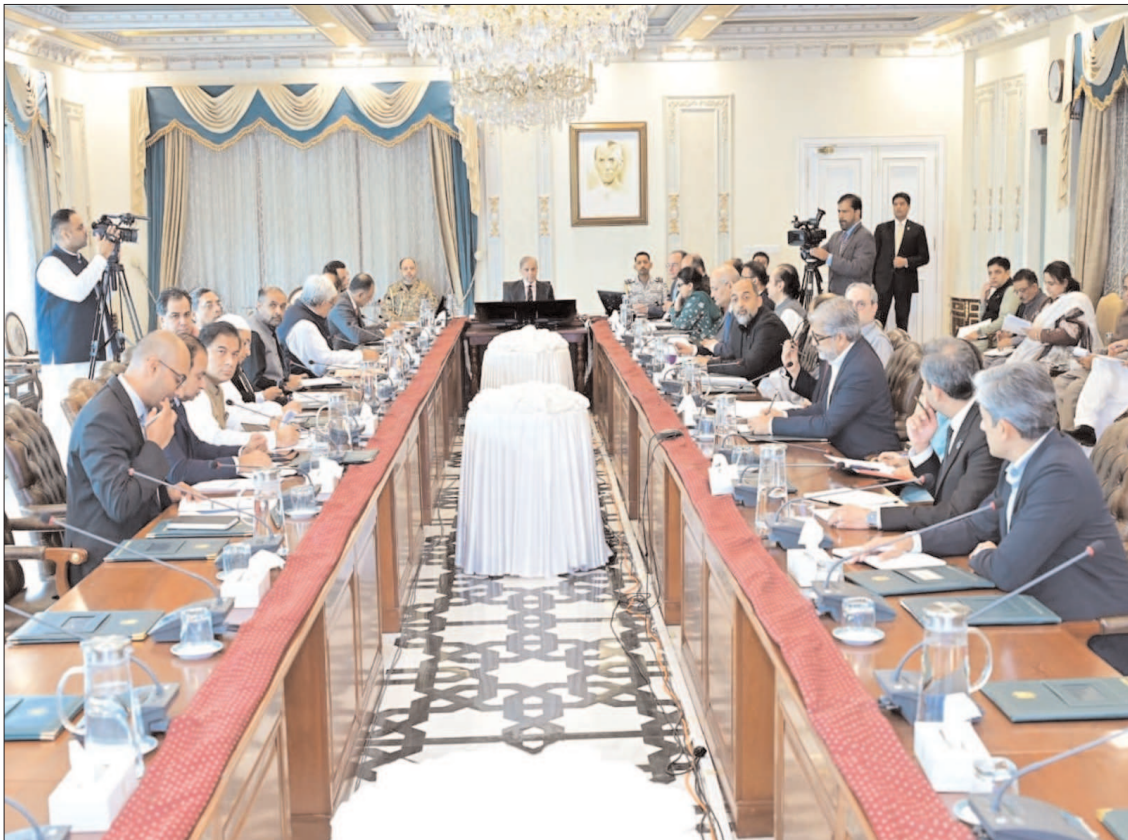
ISLAMABAD: Prime Minister Muhammad Shehbaz Sharif chairing a review meeting on Cashless economy.