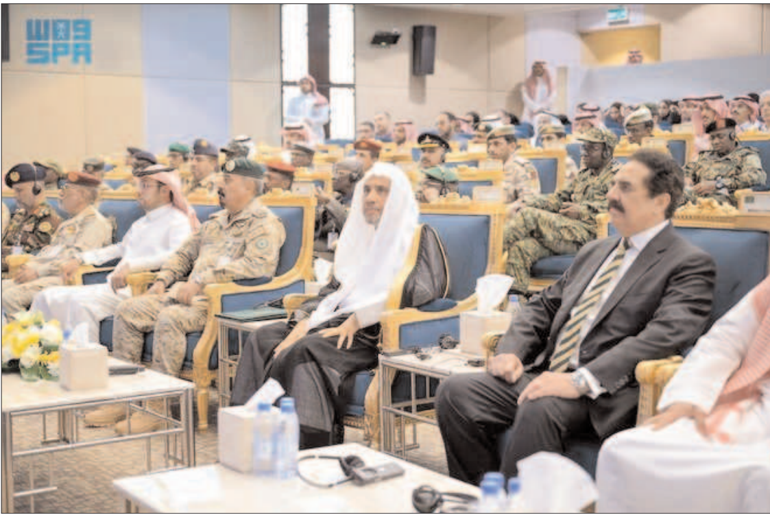
JEDDAH: The secretary-general of the Muslim World League and chairman of the association of Muslim scholars on Sunday visited the headquarters of the Islamic Military Counter Terrorism Coalition in Riyadh.