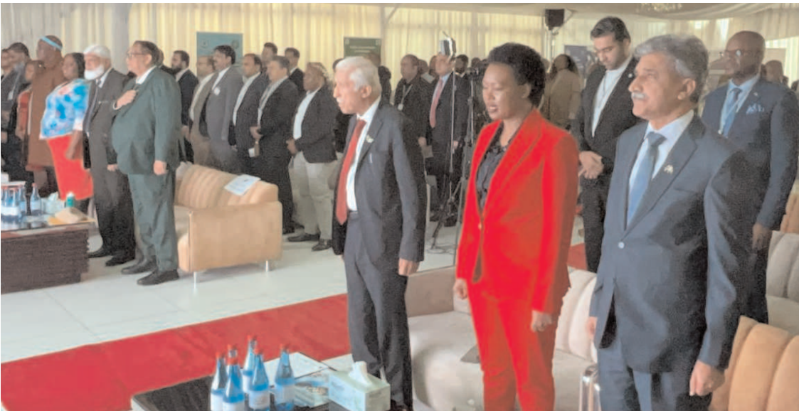
JOHANNESBURG: Distinguished guests and delegates listening to national anthem in inaugural ceremony of 2nd Pak-Africa Trade Summit 2025.