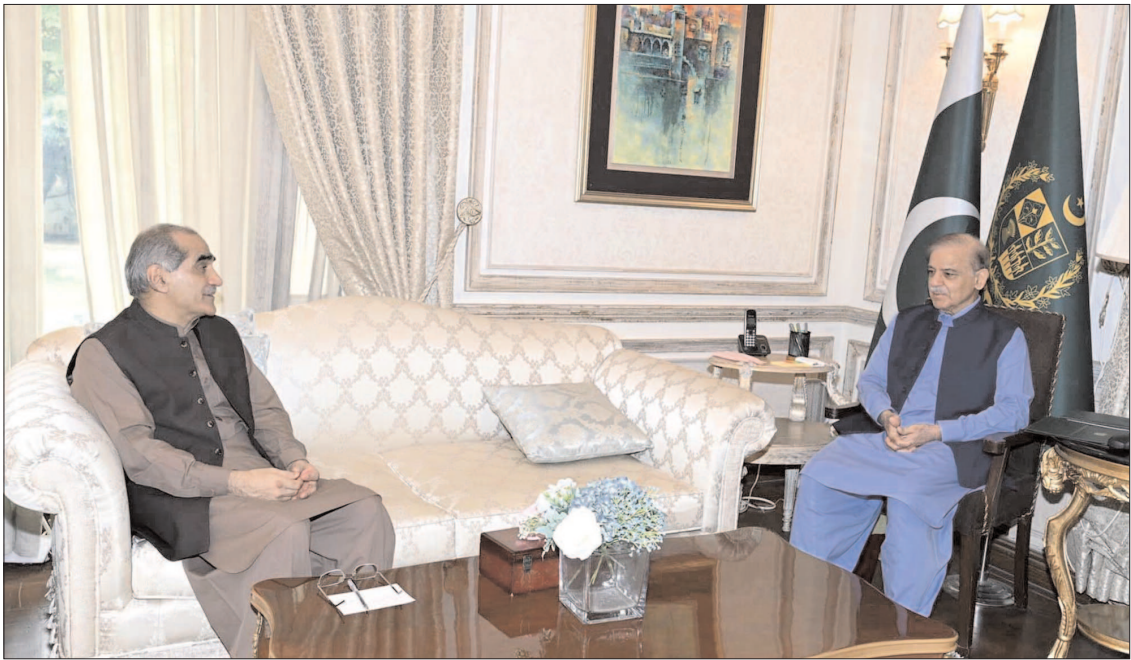
LAHORE: Prime Minister, Muhammad Shehbaz Sharif exchanges views with former Federal Minister, Khawaja Saad Rafique during meeting held in Lahore.