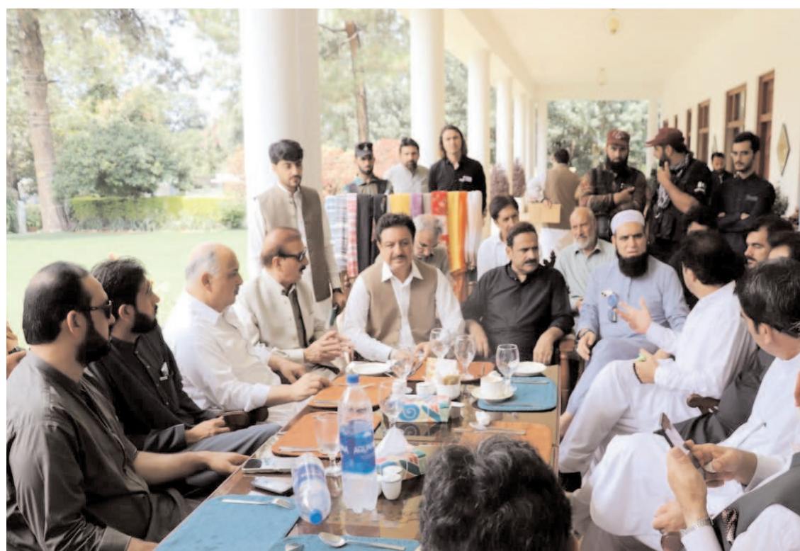
SWAT: Provincial Minister for Rural Development Arshad Ayub talking to MPAs regarding a meeting about flood relief activities in Saidu Sharif.