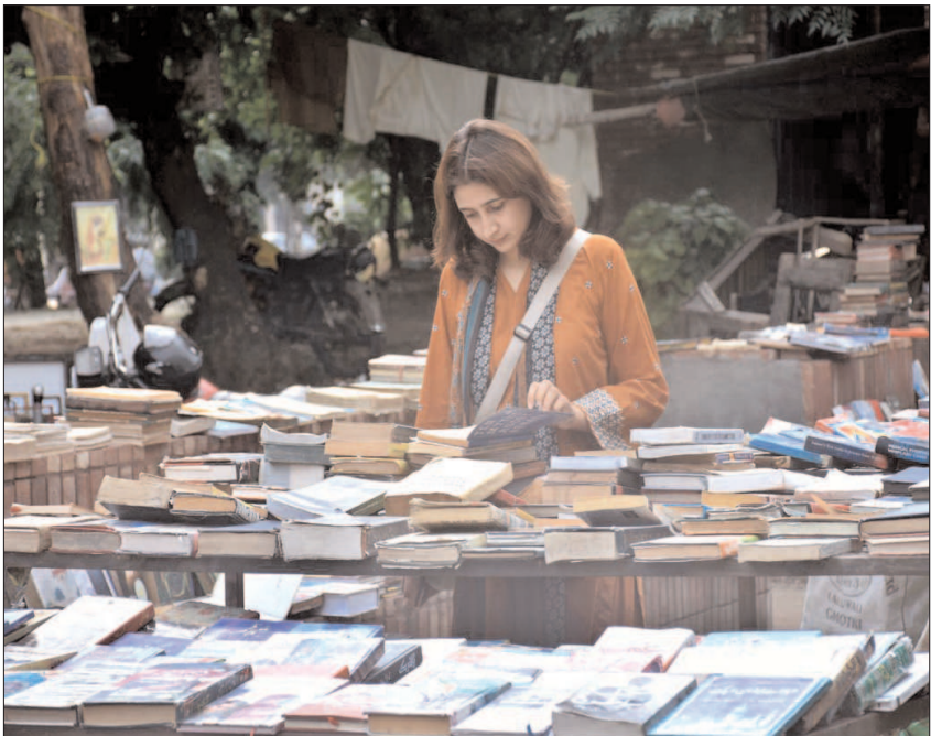
LAHORE: A woman selecting old books from a roadside stall at Mall Road.

and sustainability kept in focus to provide long-term benefits to citizens. The DC also directed the immediate removal of illegal platforms and sheds to improve the city's streetscape. He noted that significant progress has already been made in MCL's schemes, and further efforts are required to meet the set deadlines. "Citizens deserve development works that are sustainable, durable, and beneficial. All schemes must be completed strictly within the given timelines," he concluded.