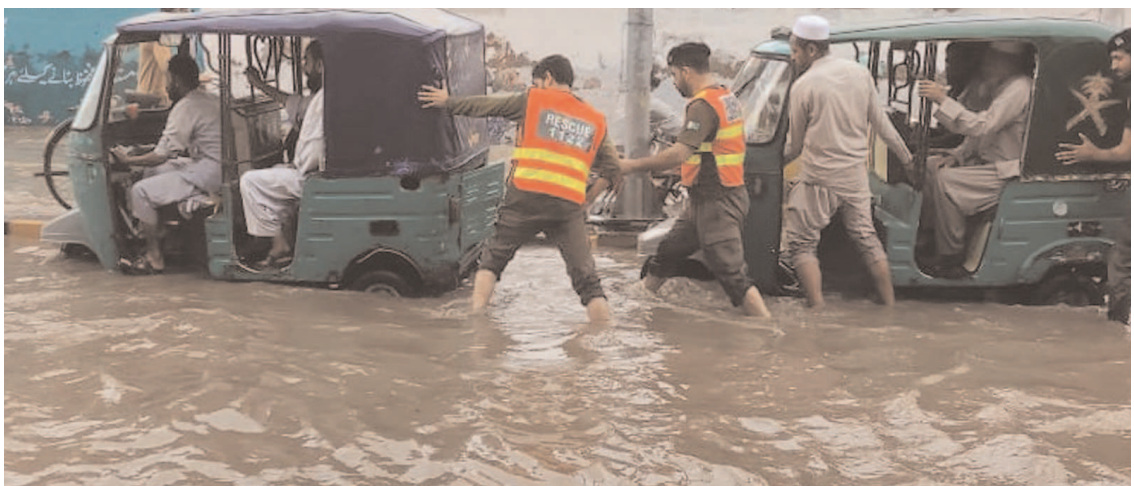
PESHAWAR: Rescue workers pushing the rickshaws stuck in the inundated rainwater after heavy downpour in provincial capital.

Pakistan, with 14 murders documented. She further alleged that transgender persons are being extorted for sums of 2.5 to 3 million rupees, and when they file cases, the extortionists are released the very next day and return to threaten them again. "Laws are passed, but there is no implementation. The transgender community in Khyber Pakhtunkhwa continues to live in fear, uncertainty, and without protection," she said. Both leaders stressed that if the judiciary and government fail to intervene, the violations will only increase, giving more power and impunity to criminals. They demanded equal protection, justice, and the fulfillment of constitutional guarantees of equality and security for transgender citizens.