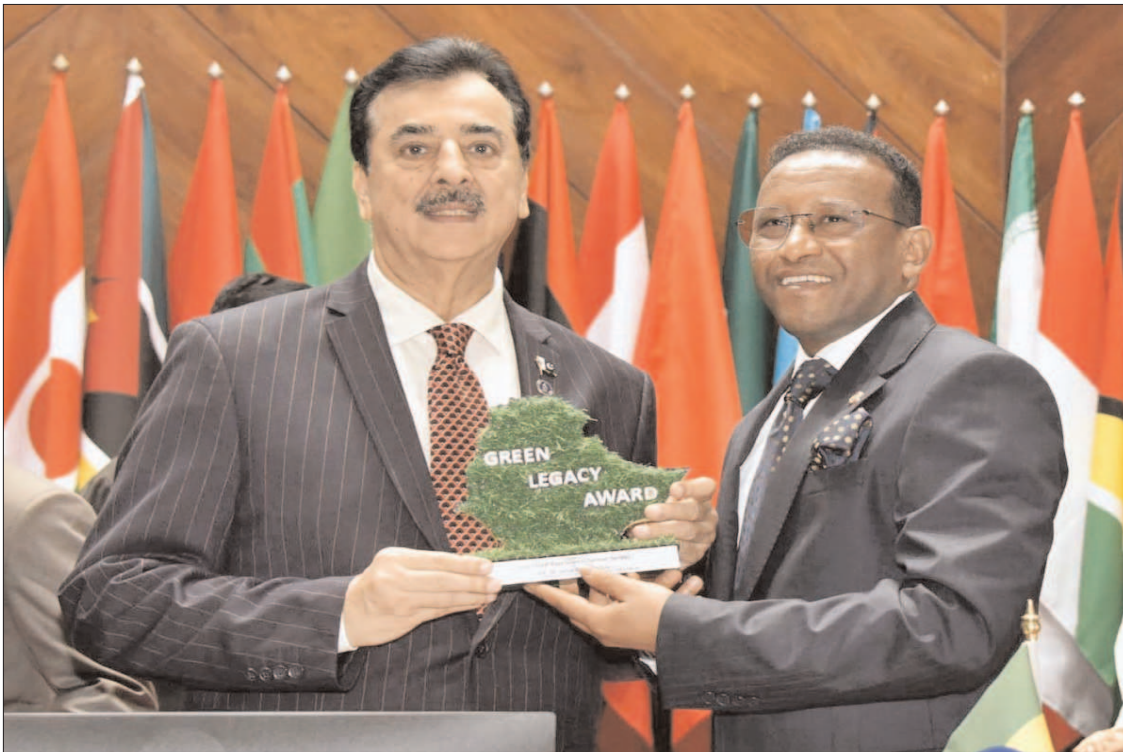
ISLAMABAD: Dr. Jemal Beker Abdula Ambassador of Federal Democratic Republic of Ethiopia presenting a green legacy award to Chairman Senate, Syed Yousaf Raza Gilani.

ISLAMABAD (APP): Indus River System Authority (IRSA) on Monday released 544,000 cusecs water from various rim stations with inflow of 541,800 cusecs. According to the data released by IRSA, the water level in River Indus at Tarbela Dam was 1546.60 feet which was 144.60 feet higher than the dead level of 1402.00 feet. Water inflow and outflow in the dam was recorded as 338,300 cusecs and 379,100 cusecs, respectively. The water level in River Jhelum at Mangla Dam was 1213.00 feet, which was 163.00 feet higher than its dead level of 1,050 feet. The inflow and outflow of water was recorded 46,100 cusecs and 8,000 cusecs, respectively. The release of water at Kalabagh, Taunsa, Guddu and Sukkur was recorded as 431,500, 453,900, 299,000 and 189,800 cusecs, respectively. Similarly, from River Kabul, a total of 55,300 cusecs of water released at Nowshera and 74,400 cusecs released from River Chenab at Marala.