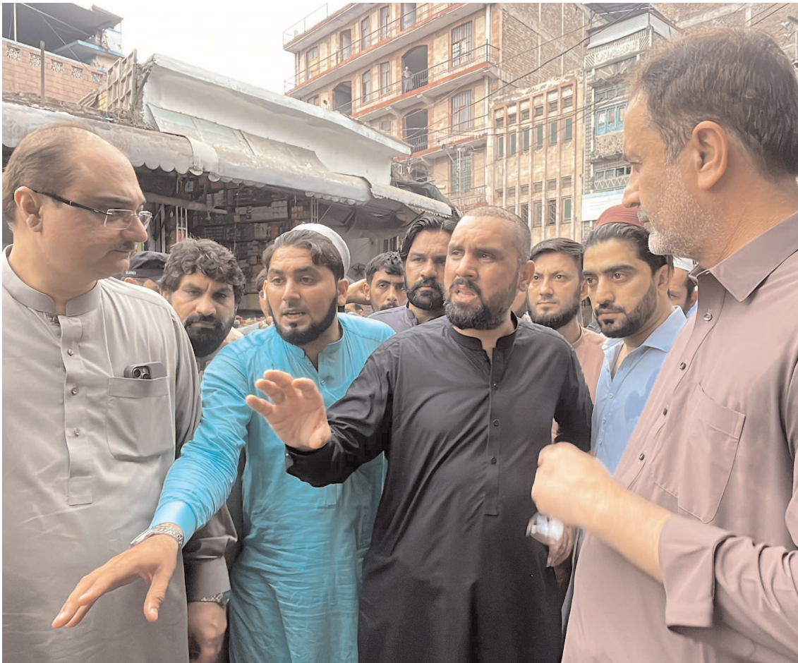
PESHAWAR: Provincial Minister for Higher Education Meena Khan Afridi talking to people during his visit to city area after heavy rain lashed provincial capital.