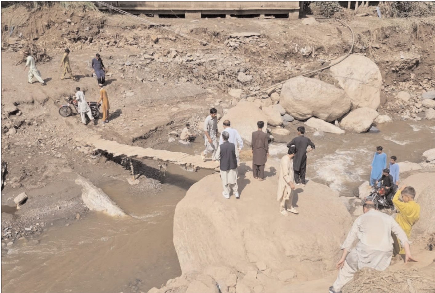
SHANGLA: Residents walking on a makeshift crossway made of wooden planks over rain water flowing from mountains crossing a damaged area, following a storm that caused heavy rains and flooding in Gambat Puran area.

Rana to contest for Senate F.P. Report SIALKOT: PML-N senior leader and Adviser to the Prime Minister on Inter-Provincial Coordination, Rana Sanaullah, will contest the Senate by-election for the vacant general seat from Punjab. In a statement, Punjab Senior Minister Marriyum Aurangzeb said: "(PML-N Supremo) Nawaz Sharif has awarded the Senate general seat ticket from the Punjab Assembly to Sanaullah."