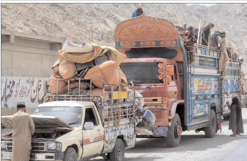
QUETTA: A convoy of unregistered Afghan Refugees going back to Afghanistan, at Kuchlak area.

Trump's team has said there will have to be compromises on both sides to end the conflict. But the president himself has put the burden on Zelenskyy to end the war, saying Ukraine should give up hopes of getting back Crimea, annexed by Russia in 2014, or of joining the NATO military alliance. Zelenskyy "can end the war with Russia almost immediately, if he wants to, or he can continue to fight," Trump said on social media.