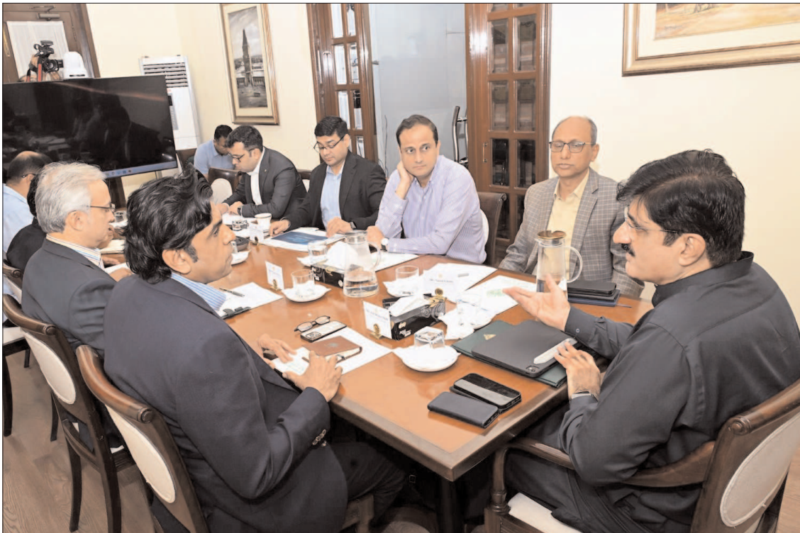
KARACHI: Sindh Chief Minister Syed Murad Ali Shah presides over a rain emergency preparedness meeting at CM House.