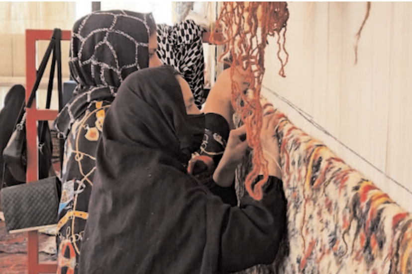
B A D A K H S H A N (TOLONews):

schools closed to girls above the sixth grade, a number of girls deprived of education in