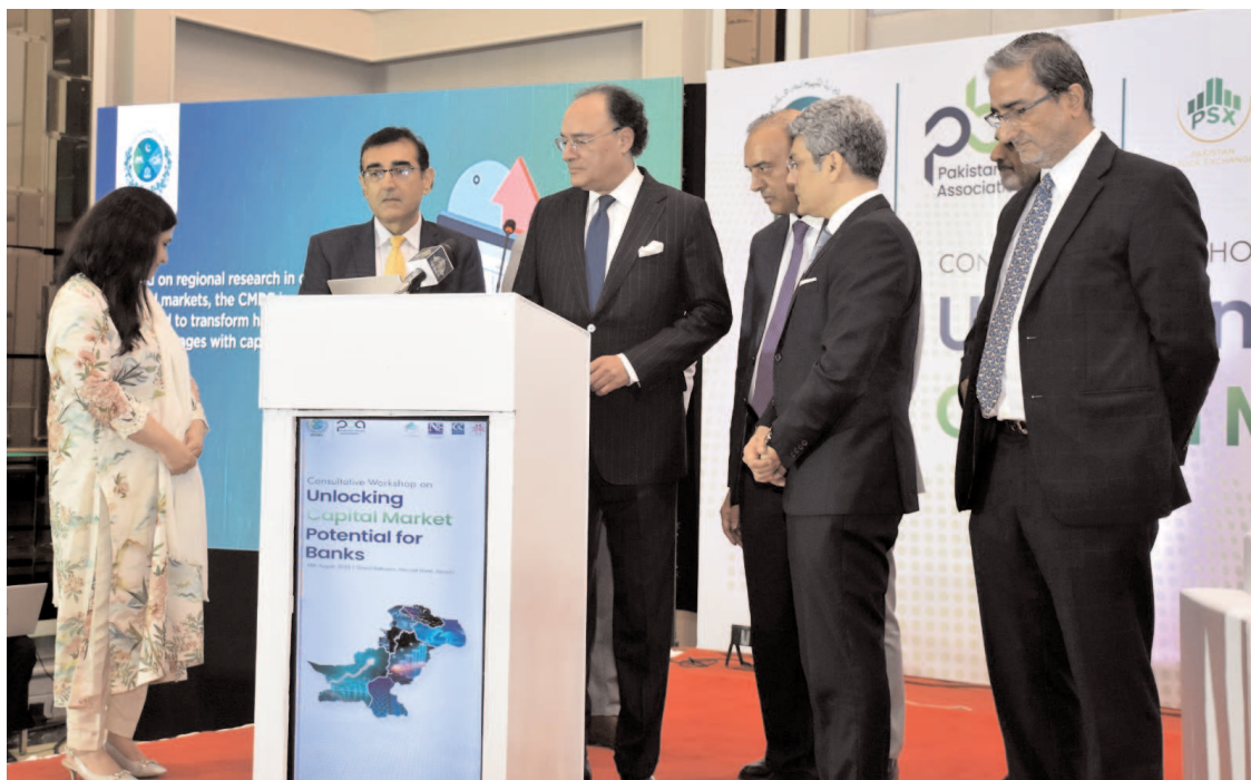
KARACHI: Federal Minister for Finance Senator Muhammad Aurangzeb launching Capital Market Development Fund and Agahi Portal during consultative workshop organized by PBA.