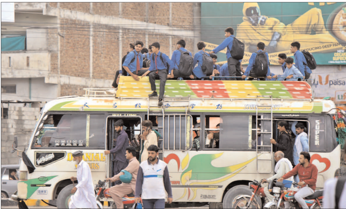
ISLAMABAD: Students travelling on rooftop of passenger bus at Tralai may cause any misshape and needs the attention of concerned authorities.

After thorough deliberation, directives were issued to devise the best strategy for the anti-polio campaign and dengue control and to ensure its strict implementation. The district administration and Health Department have appealed to parents and guardians to ensure that their children under five years of age receive polio drops during the forthcoming anti-polio campaign so that future generations can be permanently protected from this debilitating disease.