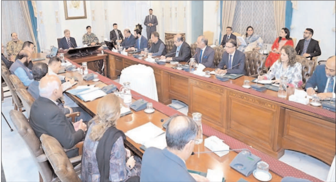
ISLAMABAD: Prime Minister Shehbaz Sharif chairing a meeting to review ongoing relief efforts by federal government in flood affected areas of Khyber Pakhtunkhwa, Gilgit-Baltistan and Azad Jammu and Kashmir.