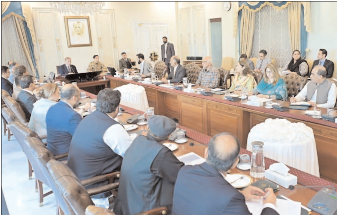
ISLAMABAD: Prime Minister Muhammad Shehbaz Sharif chairing a meeting to review the ongoing rescue and relief activities of Federal Government in KP, Gilgit Baltistan and Azad Jammu Kashmir.

ISLAMABAD (APP): Prime Minister Muhammad Shehbaz Sharif expressed satisfaction over the performance of the Pakistan Stock Exchange, as the benchmark KSE-100 Index surged past the historic 150,000-point milestone. Prime Minister's Office, Shehbaz Sharif said the bullish trend in the stock market was a strong reflection of investor confidence in the government's economic policies.