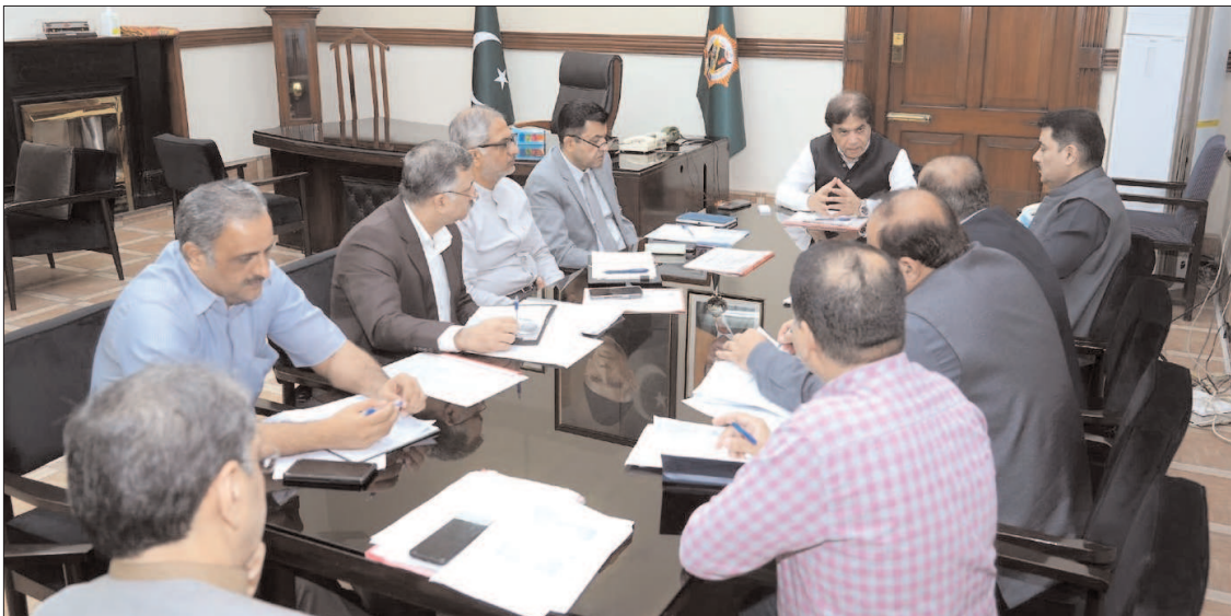
LAHORE: Federal Minister for Railways Hanif Abbasi chairs a meeting at Lahore Railway Headquarter.

In response to these challenges, the water board has initiated several proactive measures, including a crackdown on illegal connections, a consistent strike against illegal connections and hydrants. Disconnection of water supply to chronic defaulters and a police station dedicated to water-related issues is currently in progress at COD.