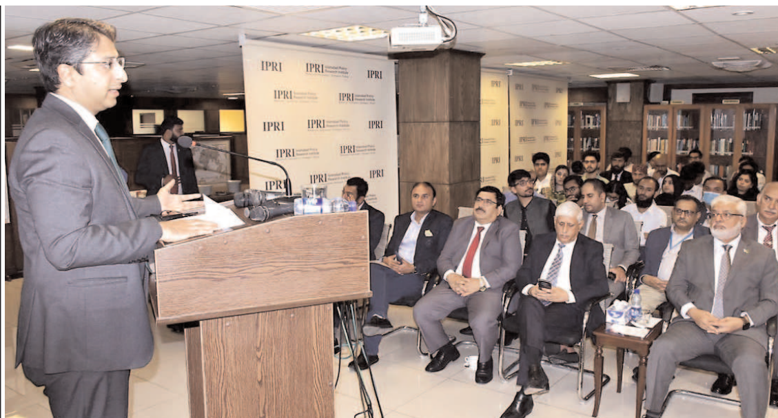
ISLAMABAD: Coordinator to PM on Commerce delivering his remarks at launch of book 'Economy; Backbone of National Security' attended by senior policy-maker, economists and business leaders.

The State Bank of Pakistan (SBP) remains committed to strengthening the financial infrastructure and building a digitally empowered and inclusive economy.