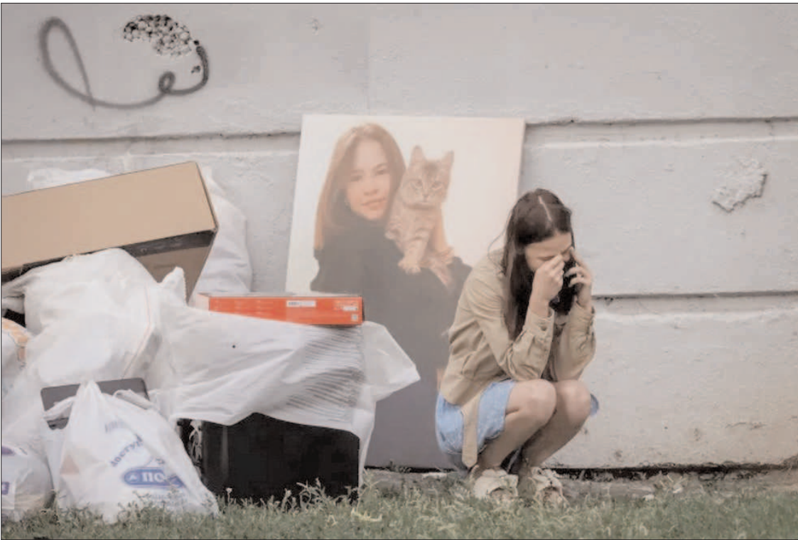
KYIV: An entire family, including a toddler and a 16-year-old, are among seven people killed in an overnight drone strike on a residential neighbourhood in the northeastern Ukrainian city of Kharkiv.

As for killings, Sudan, where civil war is still raging, was second to Gaza and the West Bank with 60 aid workers losing their lives in 2024. That was more than double the 25 aid worker deaths in 2023. Lebanon, where Israel and Hezbollah militants fought a war last year, saw 20 aid workers killed compared with none in 2023. Ethiopia and Syria each had 14 killings, about double the number in 2023, and Ukraine had 13 aid workers killed in 2024, up from 6 in 2023, according to the database.