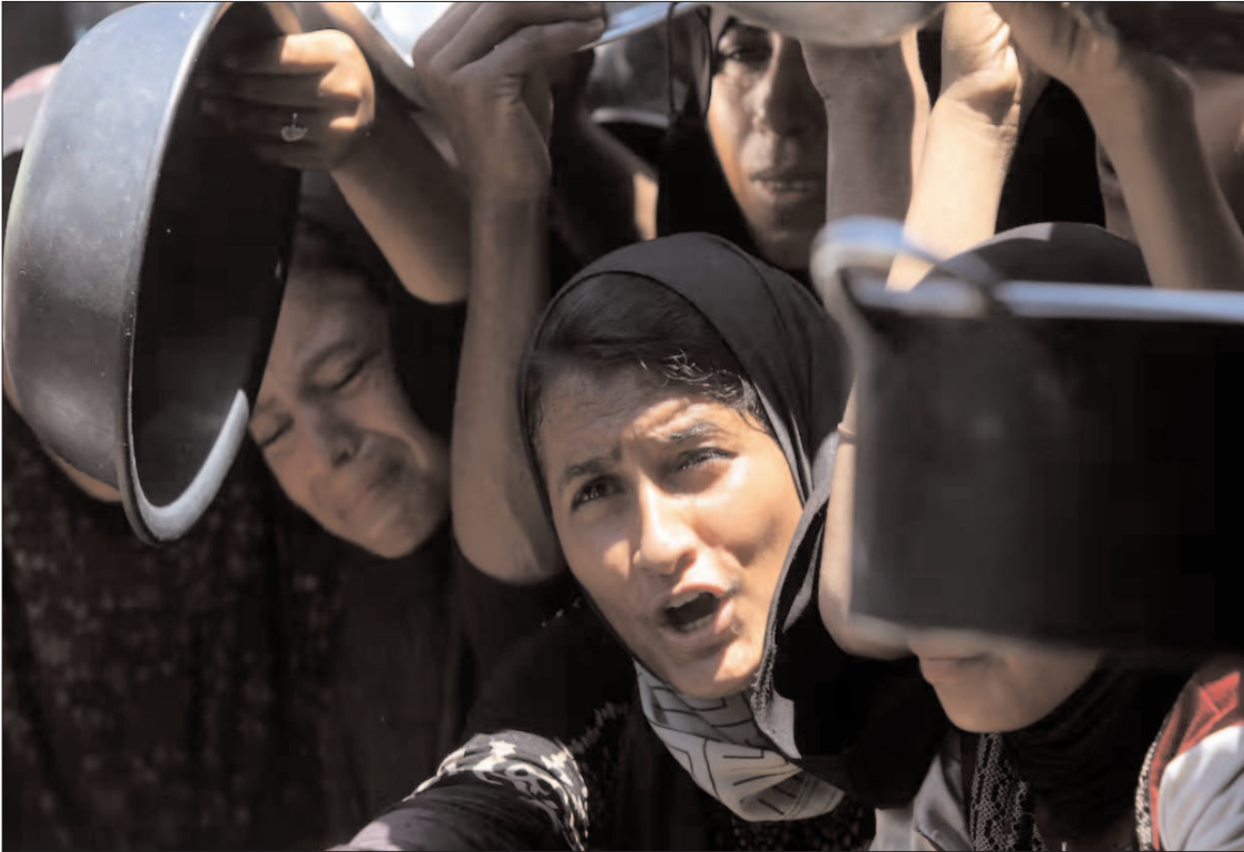
GAZA: Palestinians wait to receive food from a charity kitchen, amid a hunger crisis, in Khan Younis, southern Gaza Strip on Monday.

Participants viewed the initiative of local Jirgas as a positive step and called for it to be made more effective so that its outcomes could benefit other regions as well.