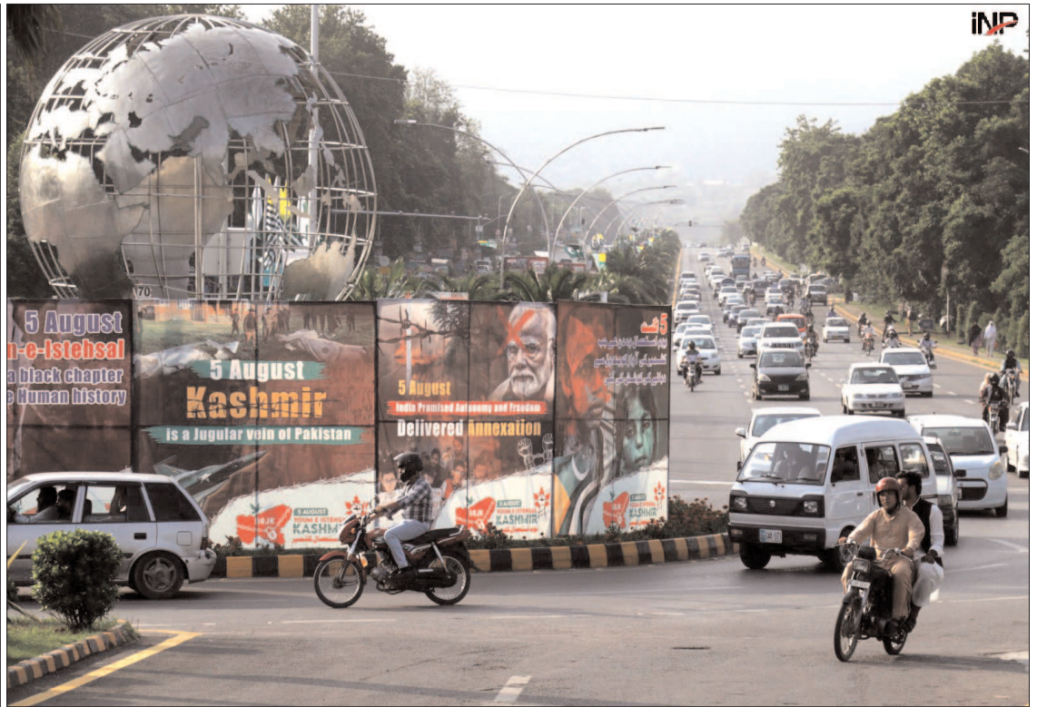
ISLAMABAD: A view of banner install on constitution avenue on the eve of Youm-e-Istehsal on August 5, 2025 in solidarity with the people of India's illegally Occupied Jammu and Kashmir.

The visit reflects the ongoing international support for Pakistan's efforts to develop a resilient, transparent, and inclusive social protection system that places the needs and dignity of its most vulnerable citizens at the center of policy and practice.