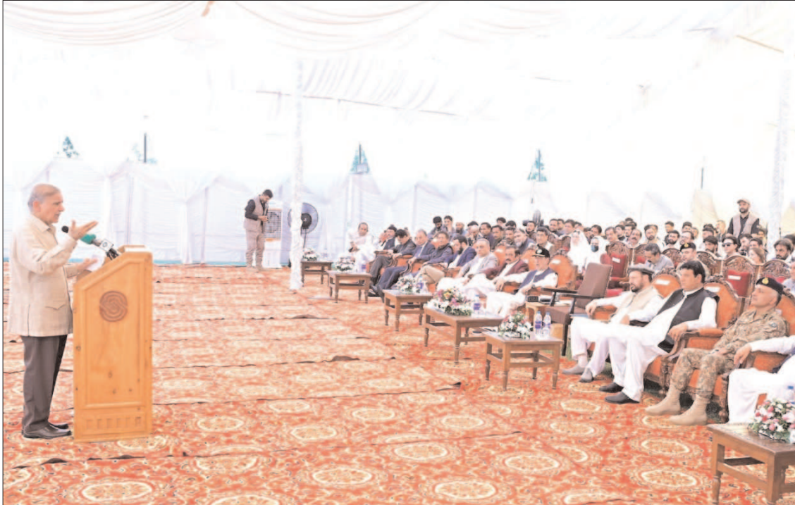
GILGIT: Prime Minister Muhammad Shehbaz Sharif addressing a cheque distribution ceremony for flood affectees in Gilgit Baltistan.