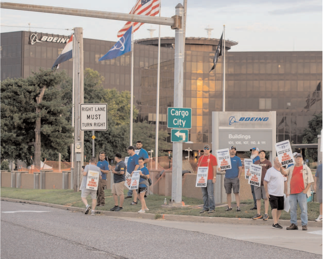
MISSOURI: Workers picket outside the Boeing Defense, Space & Security facility in Berkeley, Missouri, US, on Monday.

Nations. It has pushed on with that tactic despite Trump’s public calls for it to stop over the past three months. On the 1,000-kilometer (620-mile) front line, Russia’s bigger army has made slow and costly progress. It is carrying out a sustained operation to take the eastern city of Pokrovsk, a key logistical hub whose fall could open the way for a deeper drive into Ukraine. Ukraine has developed technology that has allowed it to launch long-range drone attacks deep inside Russia. In its latest strike it hit an oil depot near Russia’s Black Sea resort of Sochi, starting a major fire.