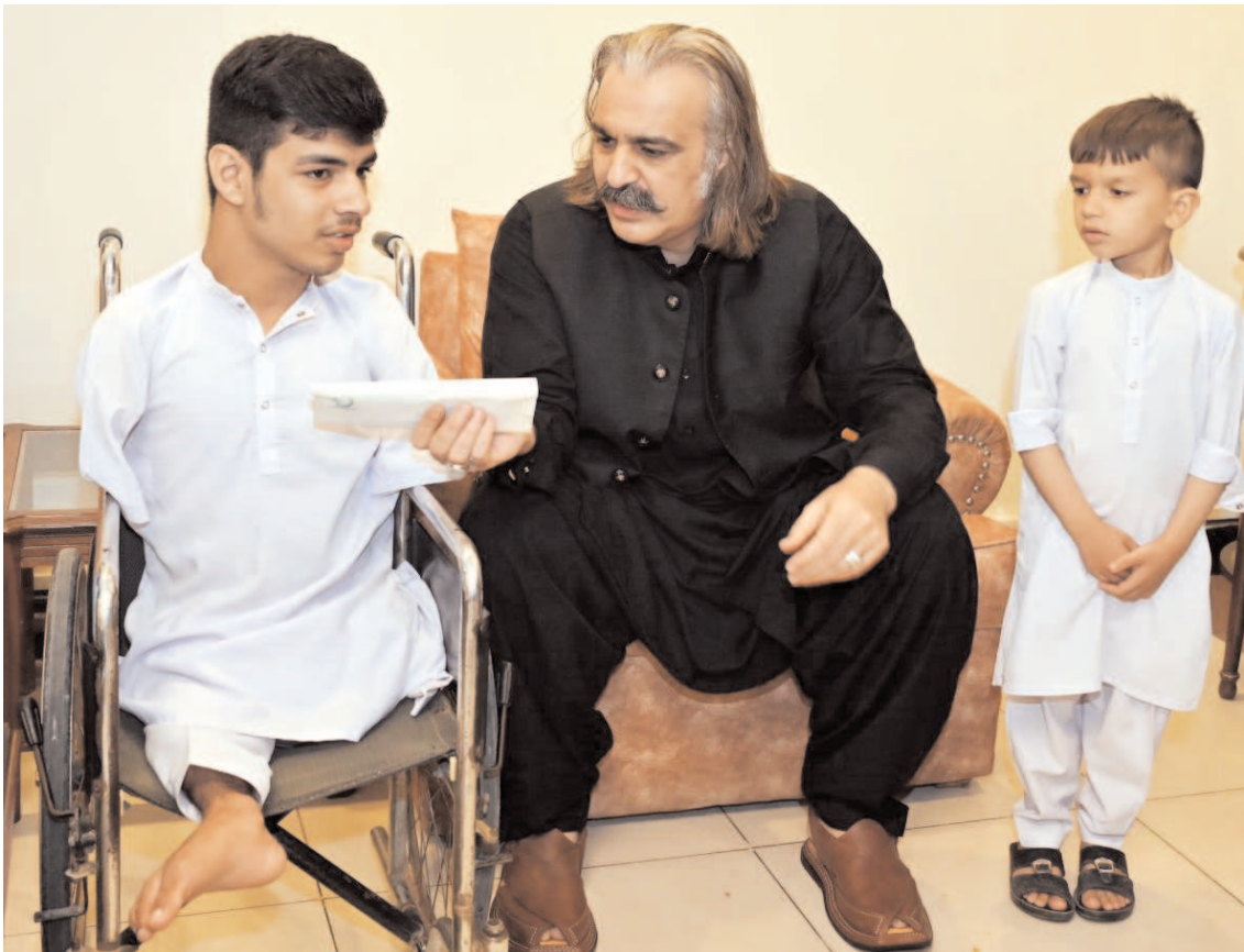
PESHAWAR: Khyber Pakhtunkhwa Chief Minister Ali Ameen Khan Gandapur presenting cash award to a special student for taking brilliant marks in Matric examinations.