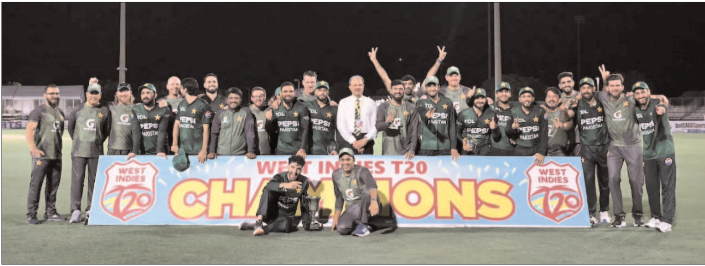
LAUDERHILL: The Pakistan team poses with the trophy after winning the Twenty20 cricket series against the West Indies.

ISLAMABAD (APP): The Men's and Women's Euro Hockey Championship 2025 will be hosted by Monchengladbach, Germany starting August 8. Meanwhile, Europe's premier hockey tournament running August 8 to 17, with the champions punching their tickets to the FIH Hockey World Cup Belgium & Netherlands 2026, said a press release. Both men's and women's tournaments will feature 8 teams, split into Pool A & B, with the top two from each pool advancing to semi-finals while the bottom two teams will play for classifications and world ranking points. Women's Pools- Pool A: France, Germany, Ireland, Netherlands; Pool B: Belgium, England, Scotland, Spain.