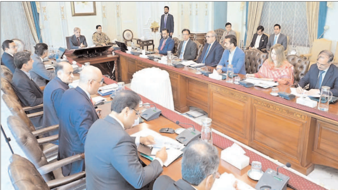
ISLAMABAD: Prime Minister Shehbaz Sharif chairing a meeting to review progress regarding Jinnah Medical Complex.