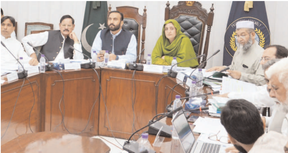
PESHAWAR: Deputy Speaker Khyber Pakhtunkhwa Assembly Suraya Bibi chairing a meeting regarding amendment of rules.