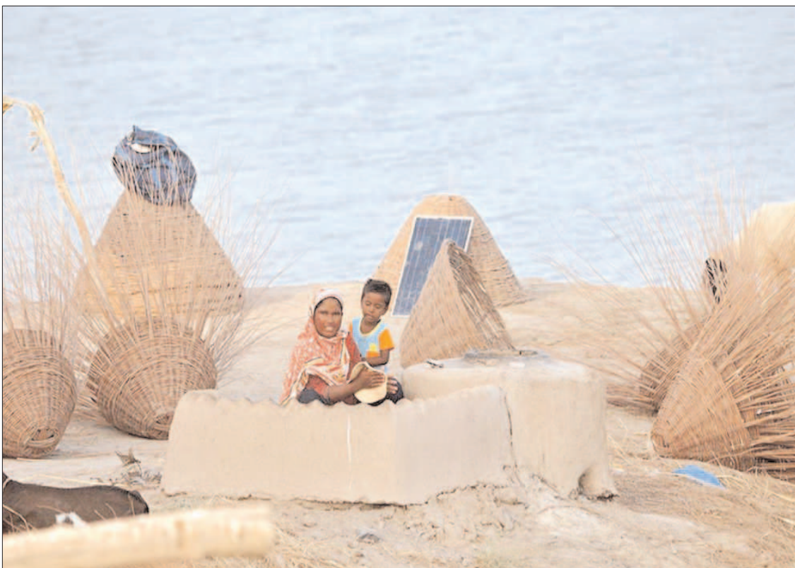
MULTAN: A flood-affected woman, along with her child, prepares traditional bread near the banks of the Chenab River, as rising floodwaters in the background keep surrounding rural areas on high alert during monsoon season.