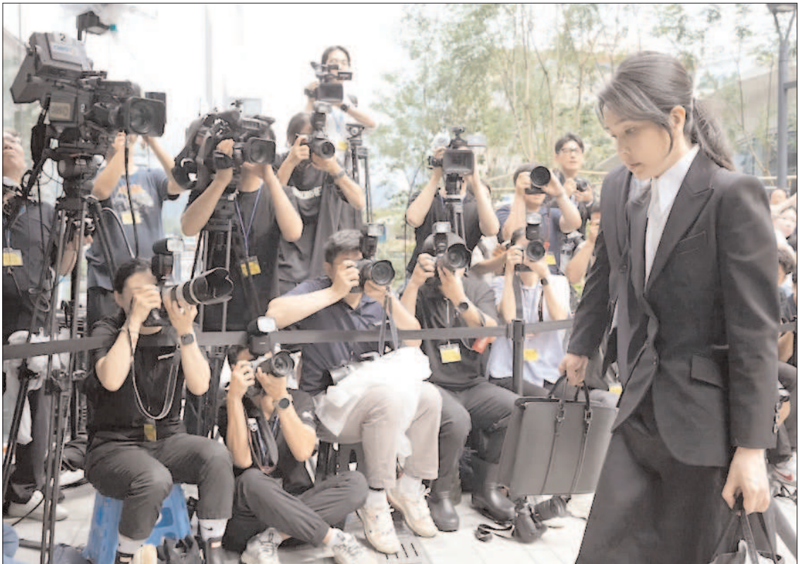
SEOUL: Kim Keon Hee, the wife of South Korea's ousted former President Yoon Suk Yeol, arriving at the special prosecutor's office.