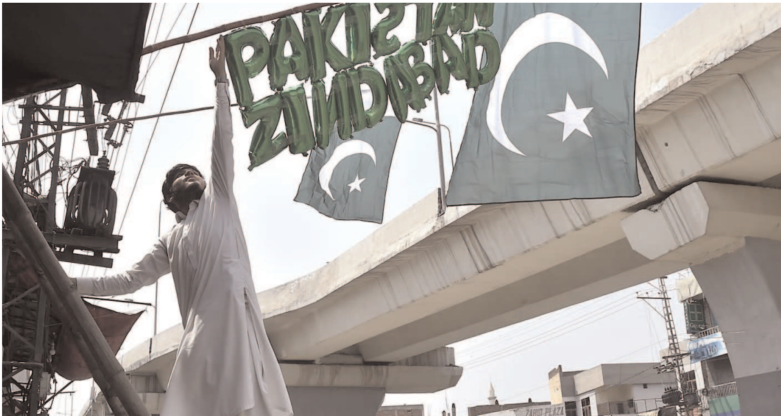
PESHAWAR: A shopkeeper displaying national flag and other Independence Day related stuff at Khyber Road as part of Independence Day preparations.