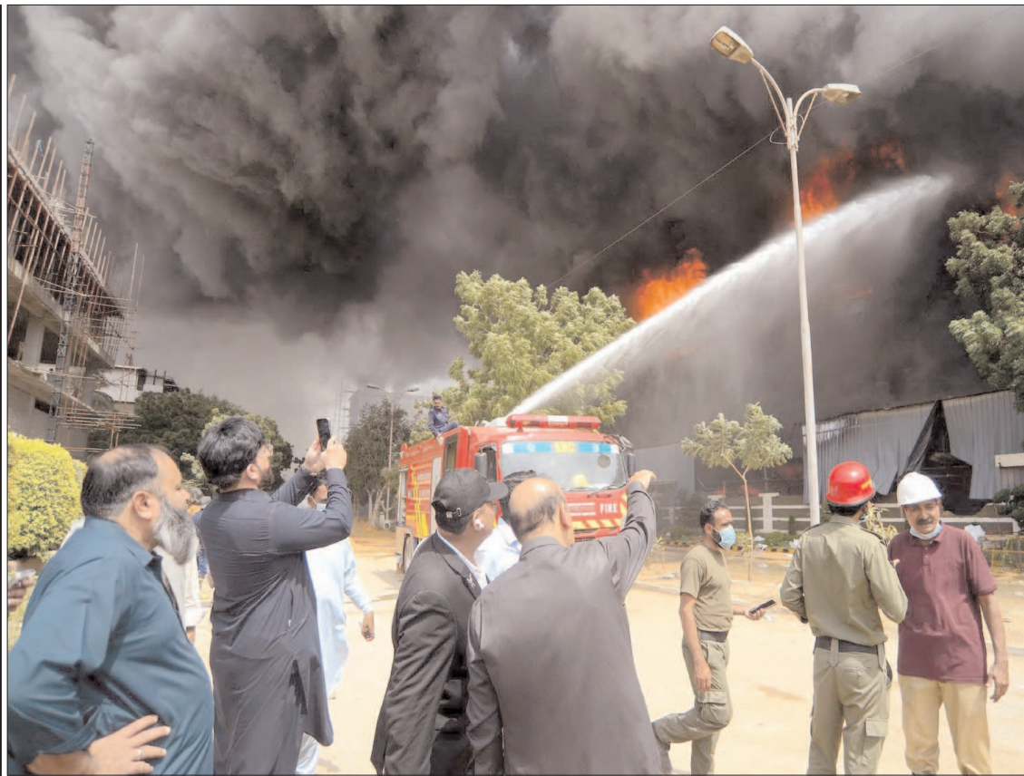
KARACHI: A view of site after fire broke out at a factory in Landhi Export Processing Zone area.

A fire broke out in a factory located in the Landhi Export Processing Zone, but no adequate exit routes or arrangements were visible for the immediate evacuation of employees. Fire brigade vehicles were busy extinguishing the fire, while during the incident, male and female employees were seen hanging from a construction lift to get out of the factory.