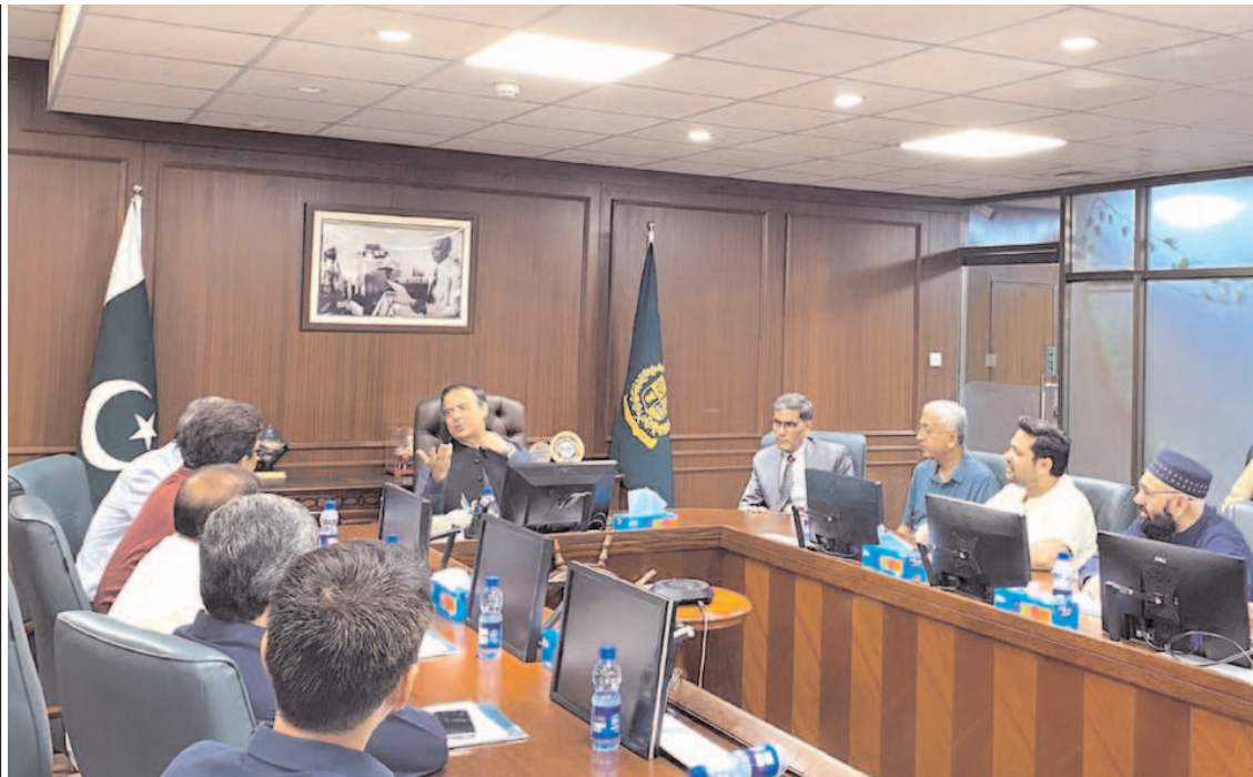
ISLAMABAD: Federal Minister for Maritime Affairs Muhammad Junaid Anwar Chaudhry talking to a delegation of Sindh Parliamentary Reporters Association.

“(a) Inquiry shall not be initiated unless approval from the Commissioner has been obtained. (b) After conclusion of inquiry, the Commissioner shall not give approval to initiate investigation unless he has obtained approval from Member (Inland Revenue Operations) of Board. Before seeking approval of the Member (Inland Revenue Operations), it is binding upon the Commissioner to make consultation with two representatives of the business community from amongst such representatives as notified by the Board. (c) Board shall notify a list of representatives of business community on FBR's web portal.”