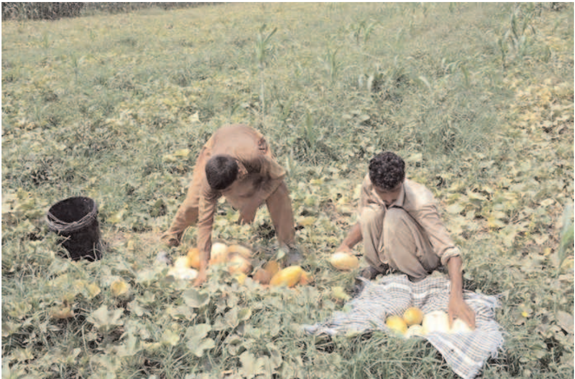
FAISALABAD: Farmers picking and collecting seasonal fruits at farm field.