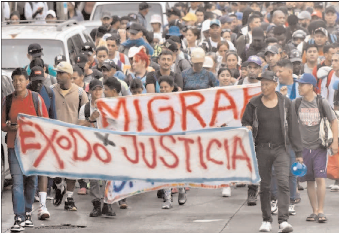
MEXICO CITY: Migrants and asylum seekers carry a banner that reads 'Exodus for justice' as they march out of Tapachula, Mexico.