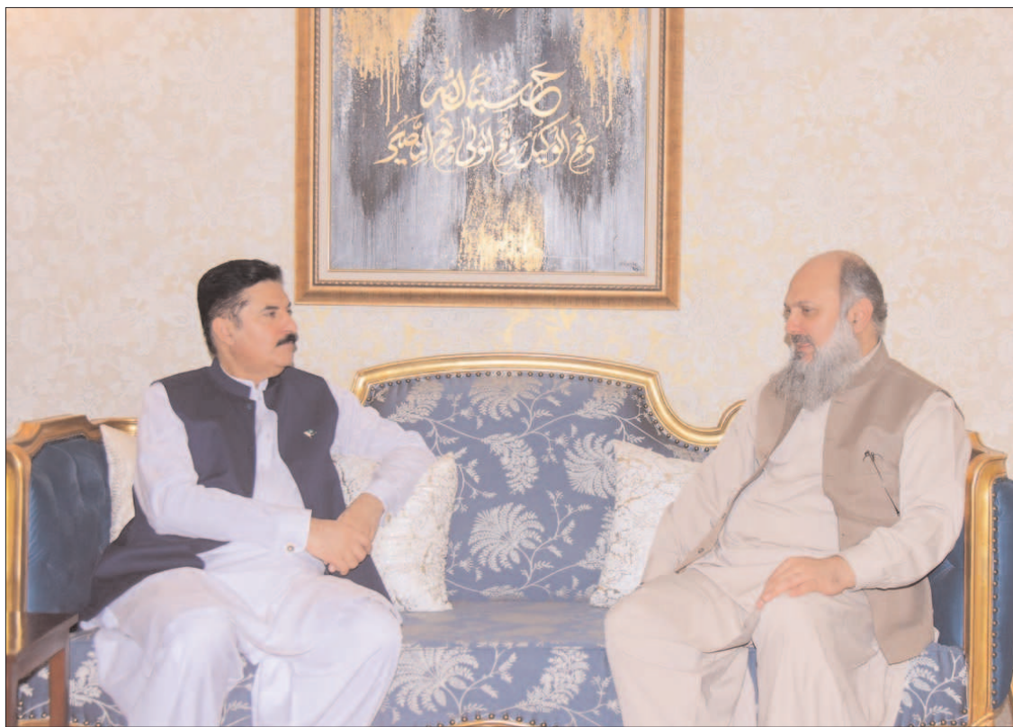
ISLAMABAD: Federal Minister for Commerce, Jam Kamal Khan exchanging views with Faisal Karim Kundi, Governor Khyber Pakhtunkhwa (KPK) during meeting held in Islamabad on Friday.