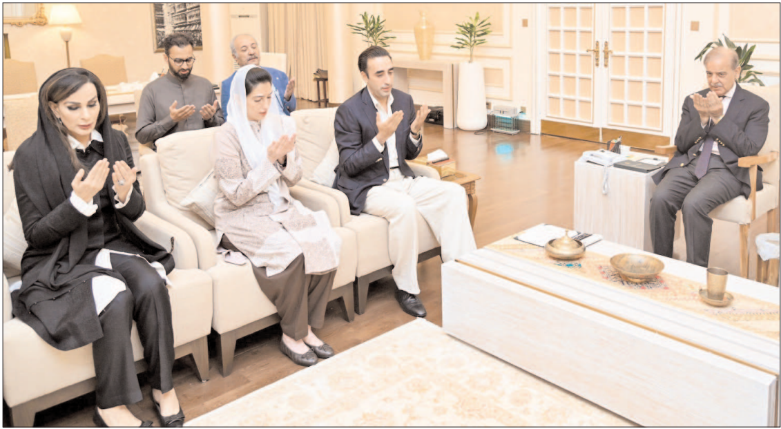
ISLAMABAD: Chairman PPP Bilawal Bhutto Zardari called on Prime Minister Shehbaz Sharif.