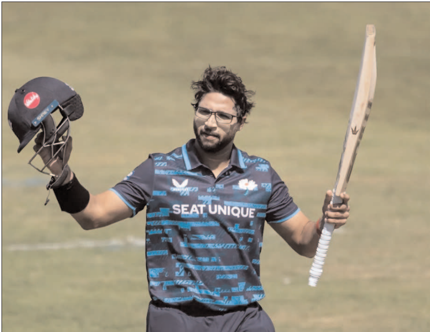
NORTHAMPTON: Imam-ul-Haq celebrates his first Yorkshire hundred.

Muzarabani took one for 101 in 24 overs, while Chivanga went wicketless in conceding 94 runs off 17 overs. Zimbabwe captain Craig Ervine used seven bowlers in a futile attempt to stop the flow of runs on a day in which New Zealand scored 427 runs for the loss of two wickets.