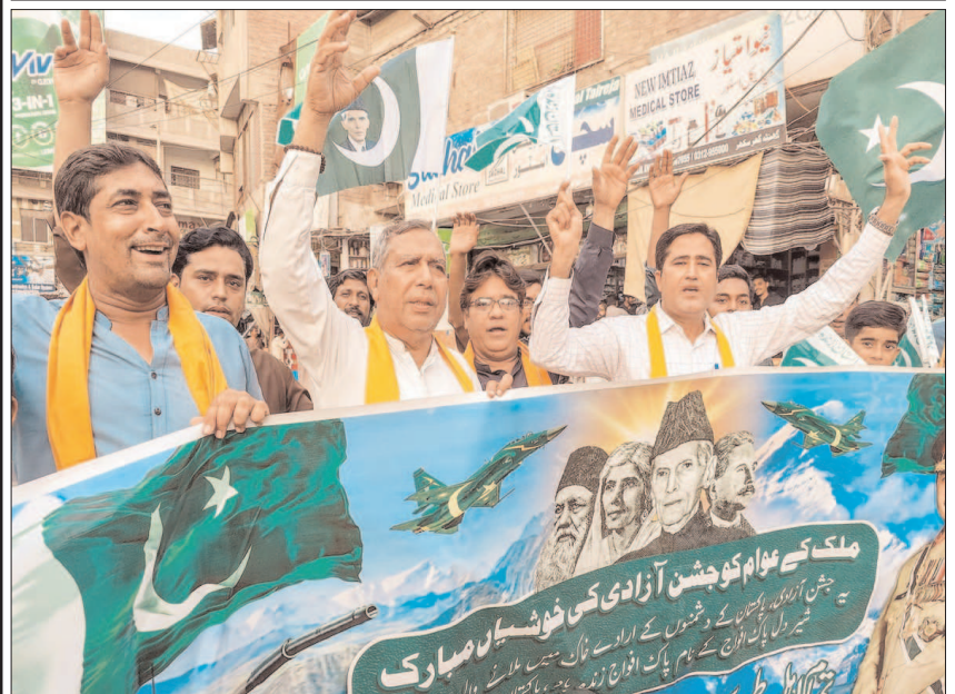
SUKKUR: Members of Hindu Community holding Jashan-e-Azadi rally on the eve of 78th Independence Day of Pakistan.

The residents' complaint of short of electricity that affected efficiency of the health center and demanded of the district hiphup to install solar system to ensure uninterrupted power supply to the hospital. He directed the Additional DC (Relief) on the spot to coordinate with the concerned department to establish a solar system in the hospital to remove the sense of deprivation of the residents. The district administrator urged the health officials to leave no stone unturned to provide better health facilities to the tribesmen on their door steps.