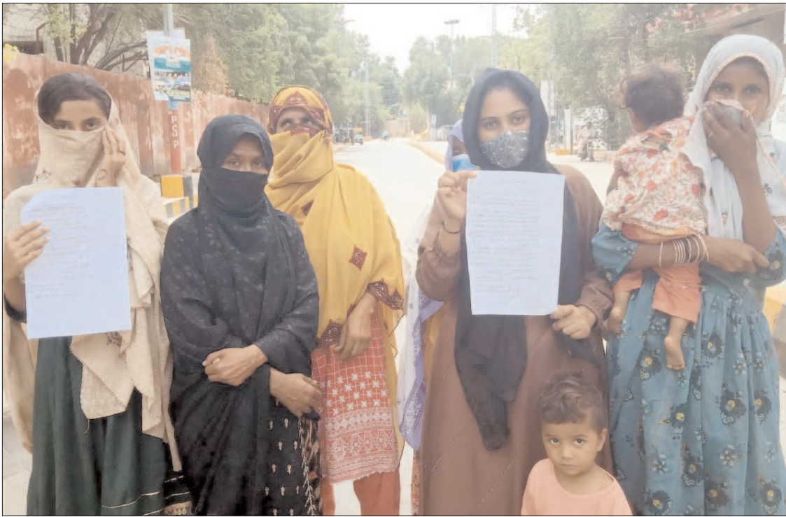
HYDERABAD: Residents of New Sabzi Mandi holding protest demonstration against high handedness of police.

ARIFWALA: Three dacoits were shot dead, and two of their companions fled during two police encounters in Arifwala and Pattoki. The first encounter occurred within the jurisdiction of Ahmad Yar Police Station in Arifwala in which one dacoit was shot dead during heavy exchange of fire. The CTD team said that the dead dacoit was involved in dozens of criminal incidents, including murder and snatching. After the police encounter, local residents chanted slogans in favour of Counter Terrorism Department personnel. In the second police encounter which occurred Karniwalla located in the jurisdiction of Saddar Police Station of Pattoki two dacoits were shot dead and one policeman received injuries.