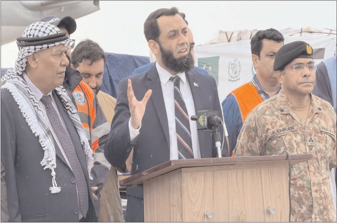
ISLAMABAD: Federal Minister for Information and Broadcasting, Attaullah Tarar attending the send-off ceremony as chief guest joined by Senior officials from Government of Pakistan, NDMA and Embassy of Palestine, at airport.