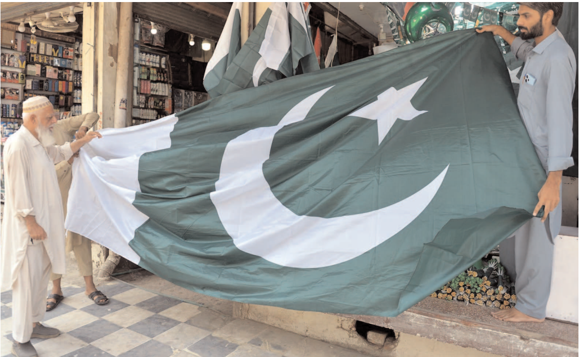
PESHAWAR: An old man selecting a huge National Flag from a vendor as preparation of the upcoming 78th Independence Day of Pakistan.