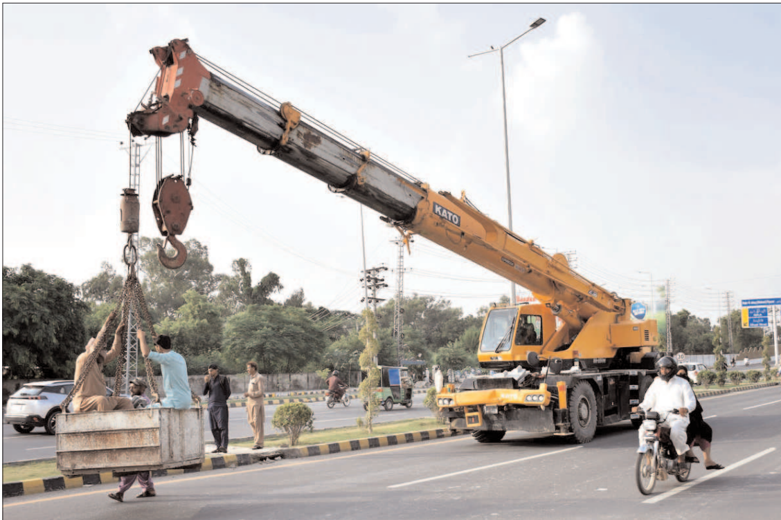
LAHORE: Labourers sitting in the pocket of a loader crane while heading to a worksite on Walton Road.