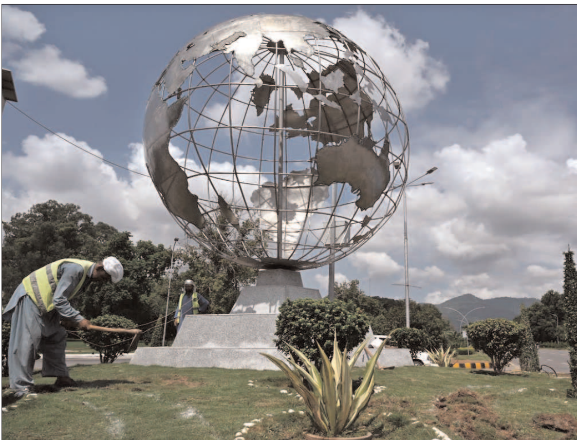
ISLAMABAD: An attractive view of clouds hovering over the sky of Federal Capital.