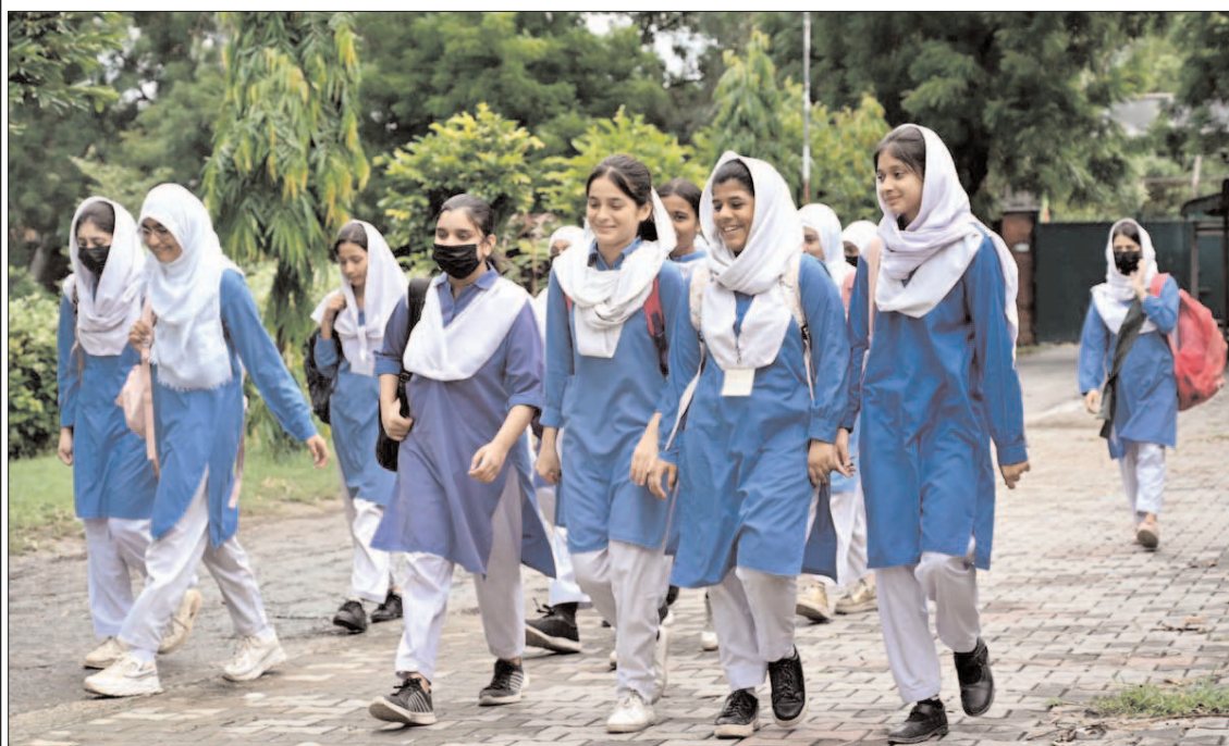
LAHORE: Students arriving at school on the first day after summer vacation in the provincial capital.

Communications and Works (C&W) Minister Sohaib Ahmed said that the Punjab government stands firmly with the people and will not leave them alone in this difficult time. He added that only collective efforts and teamwork could ensure success in overcoming the crisis and bringing relief to the flood-affected communities.