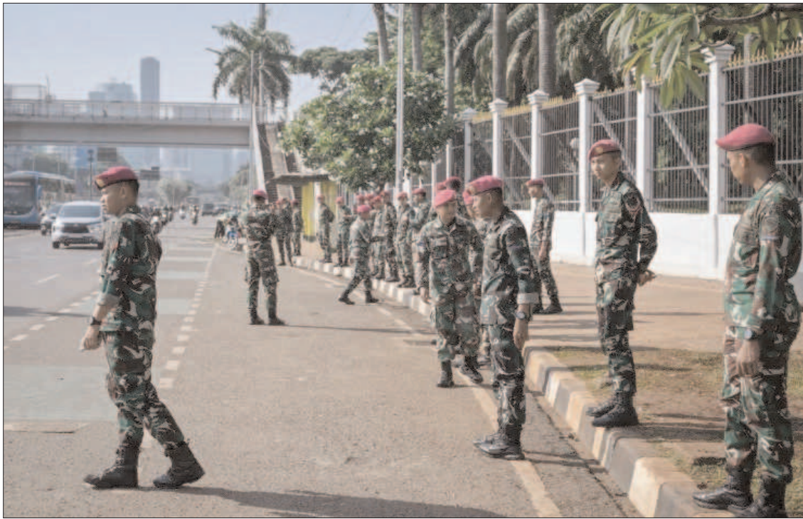
JAKARTA: Marines secure positions along a street outside the parliament in capital of Indonesia.

"And then the day after tomorrow it will be us," Merz added. "That is not an option." He refused to be drawn in the interview on the issue of a possible deployment of German troops to Ukraine as part of security guarantees in the event of a peace deal. Britain and France are spearheading a proposal for a "reassurance force" to deter potential future Russian aggression within that context, but the prospect of Germany joining them has sparked unease in a country scarred by its Nazi past. The Kremlin said that European powers were hindering Trump's peace efforts, and that Russia would continue its operation in Ukraine until Moscow saw real signs that Kyiv was ready for peace.