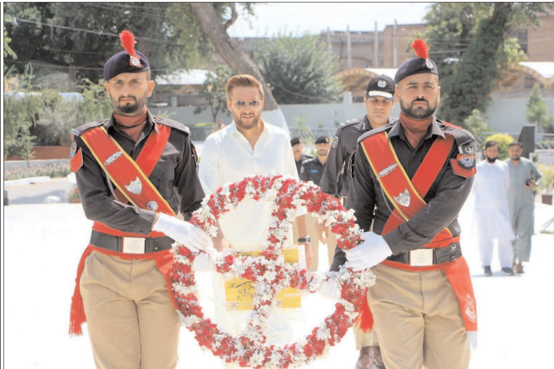
PESHAWAR: Shahid Afridi visits Malik Saad Shaheed Police Lines— laid floral wreaths at the Martyrs' Memorial and offered prayers.

With this achievement, the Ombudsman Punjab's office is expected to benefit from enhanced credibility, improved processes, greater efficiency, and a stronger competitive advantage in comparison with other institutions. The spokesman noted that the certification is not only a recognition of the office's sustained hard work and diligence but also a testament to its efficiency and commitment to ensuring timely, transparent, and effective service delivery to the public.