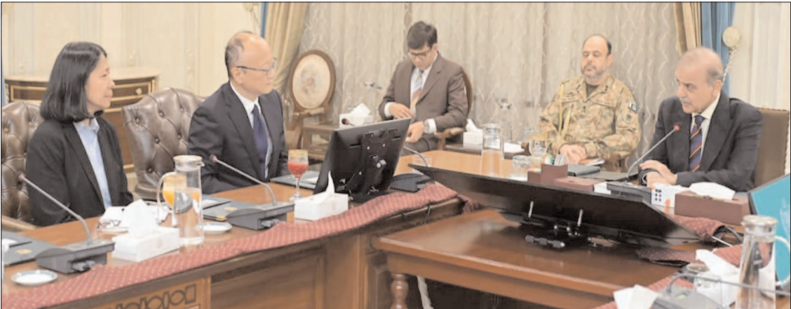
ISLAMABAD: President of Asian Development Bank, Mr. Masato Kanda called on Prime Minister Shehbaz Sharif.

The announcement was made by Director General ISPR, Lieutenant General Ahmed Sharif Chaudhry, during a press conference in Islamabad, where he was joined by Minister for Information Attaullah Tarar and the Chairman of the National Disaster Management Authority (NDMA). He stated that so far, the army has rescued more than 28,000 people from severely impacted areas. The army, he said, stands firmly with the people in their time of crisis. Lieutenant General Chaudhry confirmed that during these rescue operations, two Pakistan Army soldiers embraced martyrdom and two others sustained injuries. He noted that the soldiers were actively engaged in difficult terrain and harsh weather conditions when the incident occurred. In addition to rescue work, the army has played a critical role in restoring infrastructure. Three major bridges damaged by the floods in Khyber Pakhtunkhwa and Gilgit have already been repaired and reopened. In Azad Kashmir, army battalions remain engaged in rehabilitation activities, ensuring vital road connections and supply routes are maintained. Army engineers, working alongside district administrations, have also cleared several roads to reconnect isolated communities.