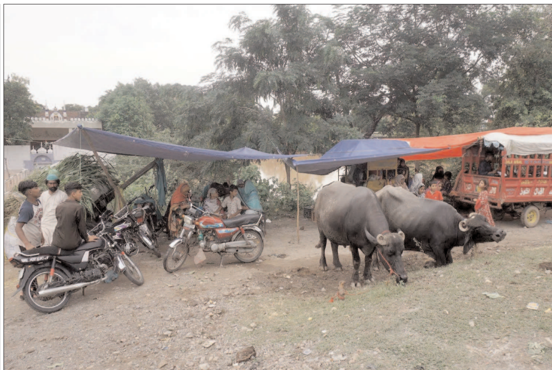
GUJRANWALA: Flood victims with their belongings at a relief camp after destruction due to medium level flash flood in Chenab River.

In the second incident, a domestic dispute broke out between the women, during which a 30-year-old woman, Seema Zai Abdul Haq Depar, was stabbed to death on the spot.