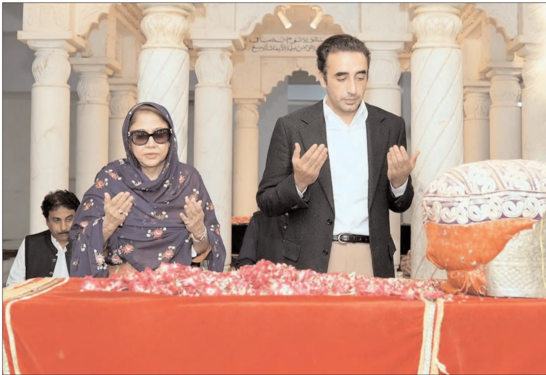
GARHI KHUDA BUX: PPP Chairman, Bilawal Bhutto Zardari along with Faryal Talpur offering feteiha at the grave of Zulfikar Ali Bhutto.

Syria condemned "the recent Israeli attacks on its territory, which resulted in the martyrdom of a young man," the foreign ministry said. It also condemned the Israeli forces' incursion into a town in the Quneitra countryside, their "arrest campaigns against civilians," and their "announcement of the continuation of their illegal presence on the summit of Mount Hermon and the buffer zone." "These aggressive practices constitute a flagrant violation of the UN Charter, international law, and relevant Security Council resolutions, and constitute a direct threat to peace and security in the region."